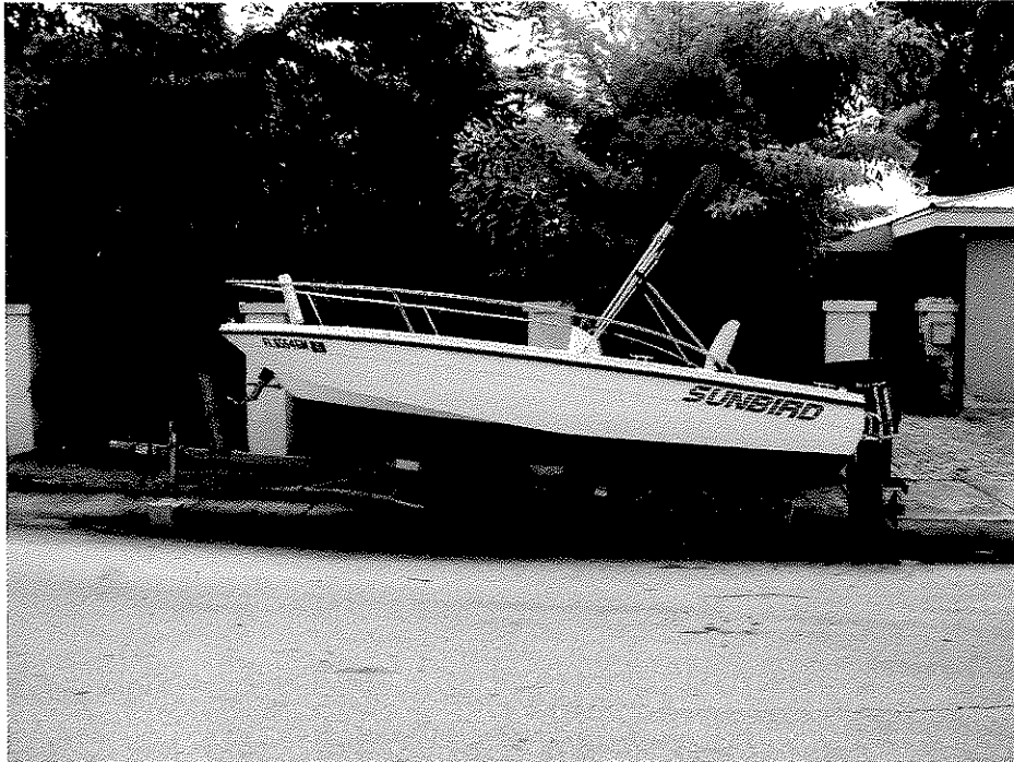
20 foot length X 8 feet wide