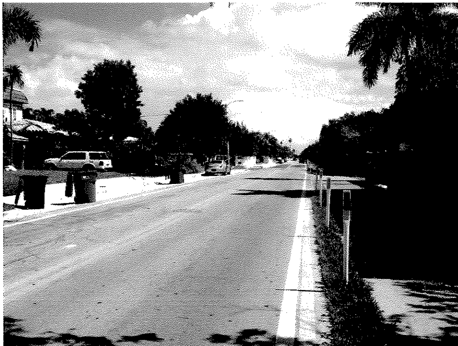
50 foot right-of-way with one side parking