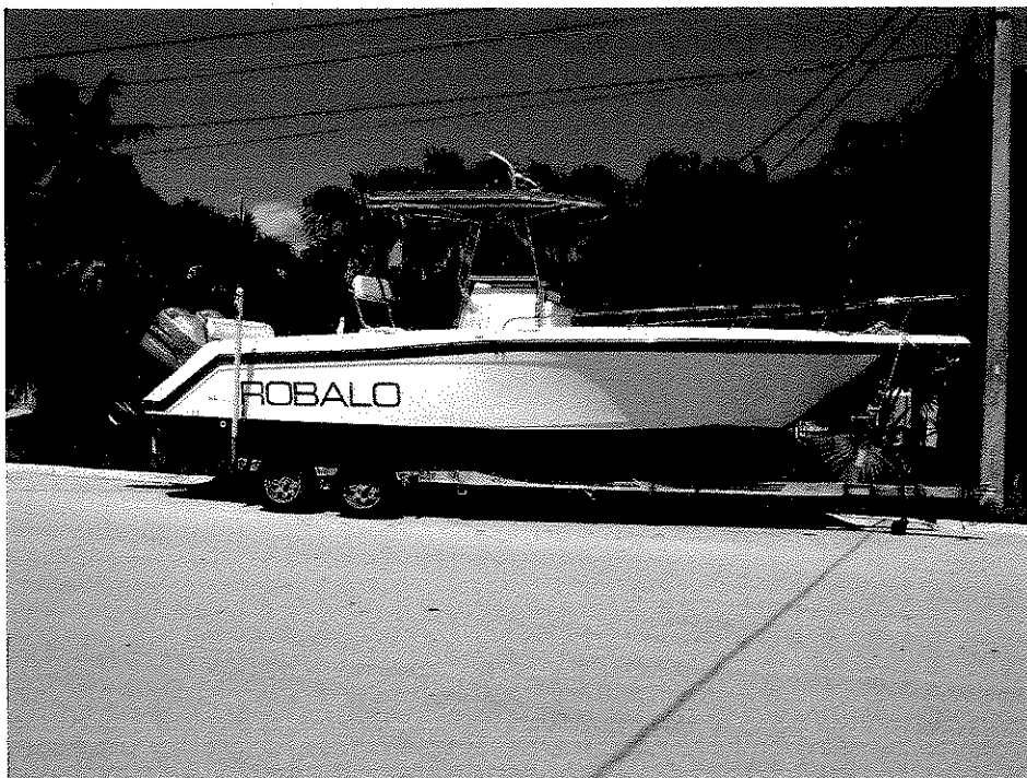
32 foot length X 10 feet wide