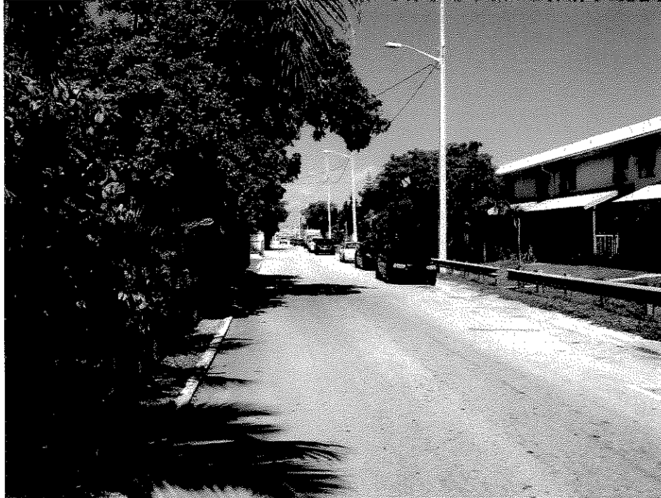
30 foot right-of-way with one side parking