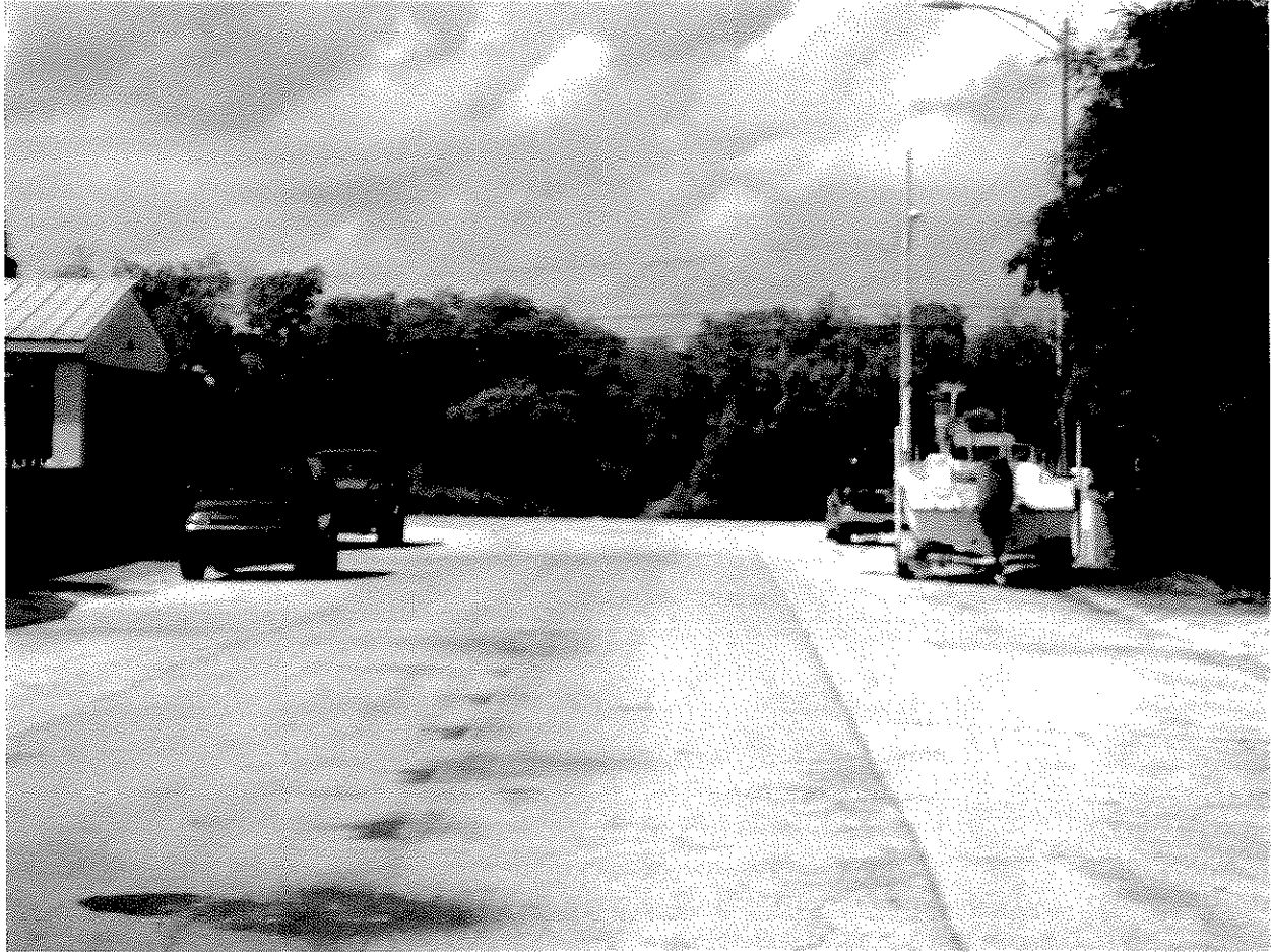
50 foot City Right of Way with two-way traffic and parking on both sides