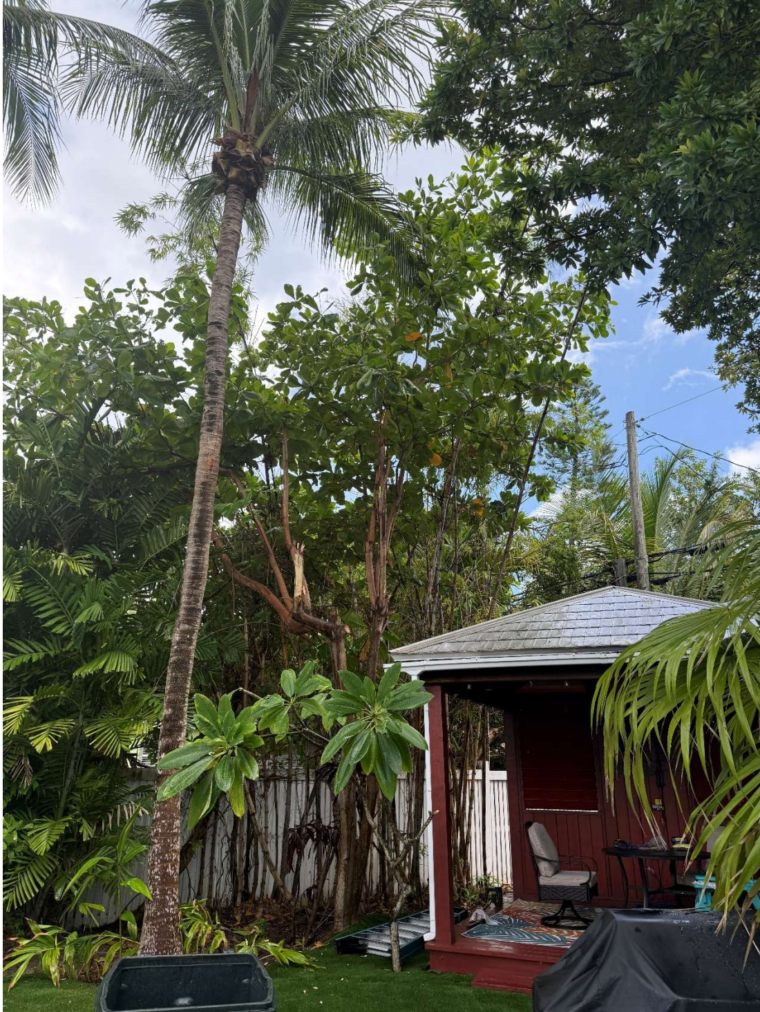
A small canopy that can be replaced and improved for long term health.