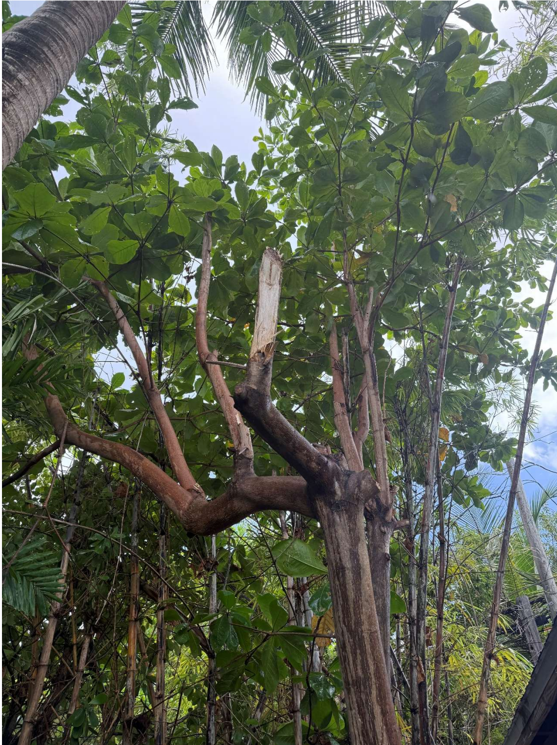
This Tropical Almond Tree is a volunteer that is several years old. It is growing in a unsuitable position and its growth habit does not look healthy.