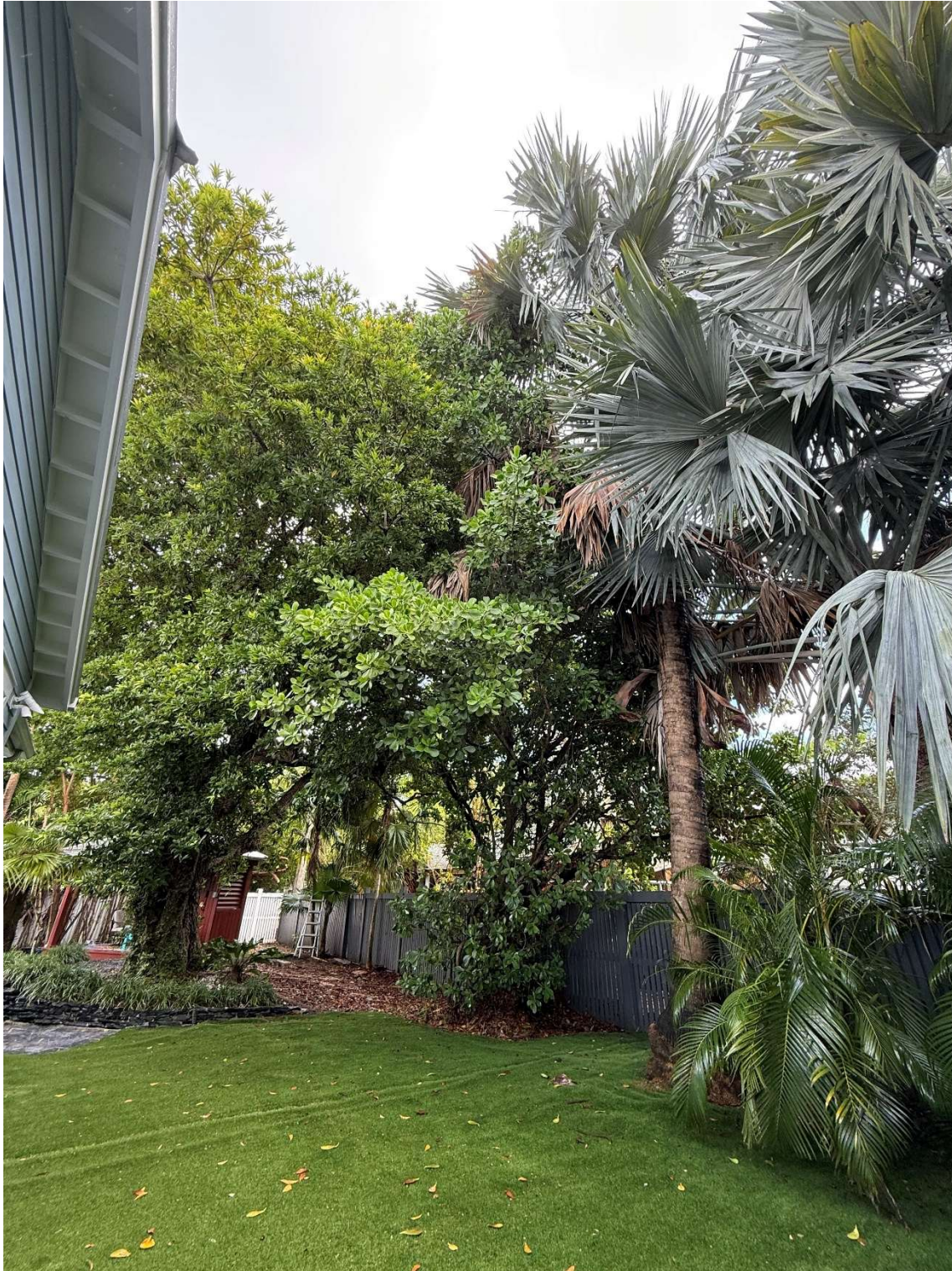
The tree's canopy is beneath a much larger dominant tree and several large Silver Bismarkia Palms.