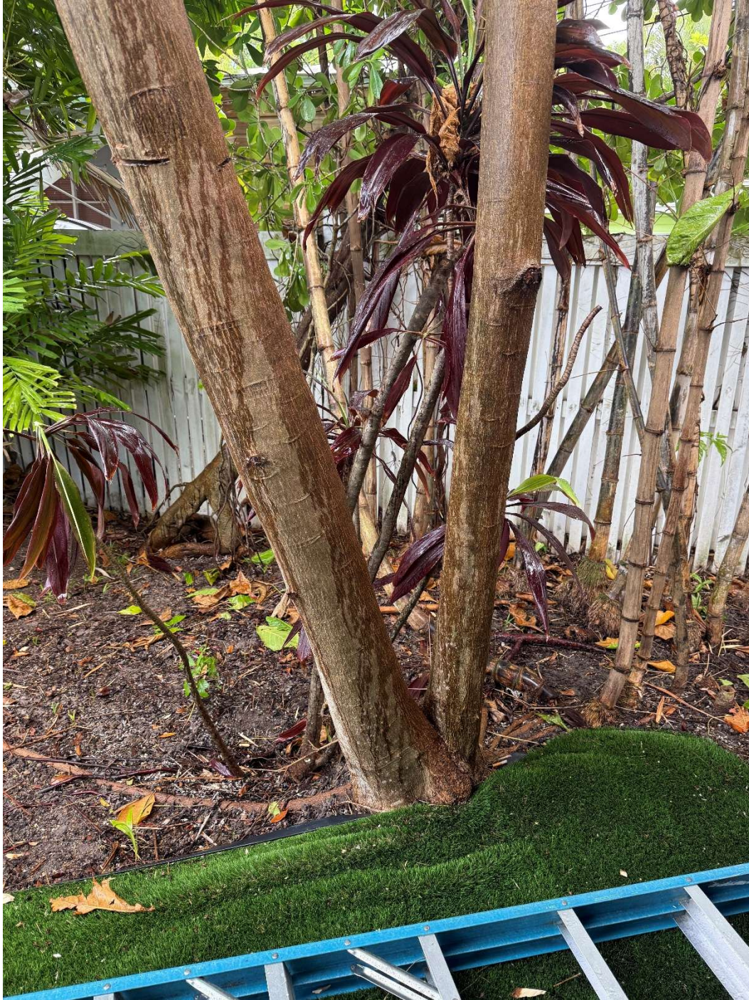
Two stems sharing one root-ball. Mitigation is recommended.