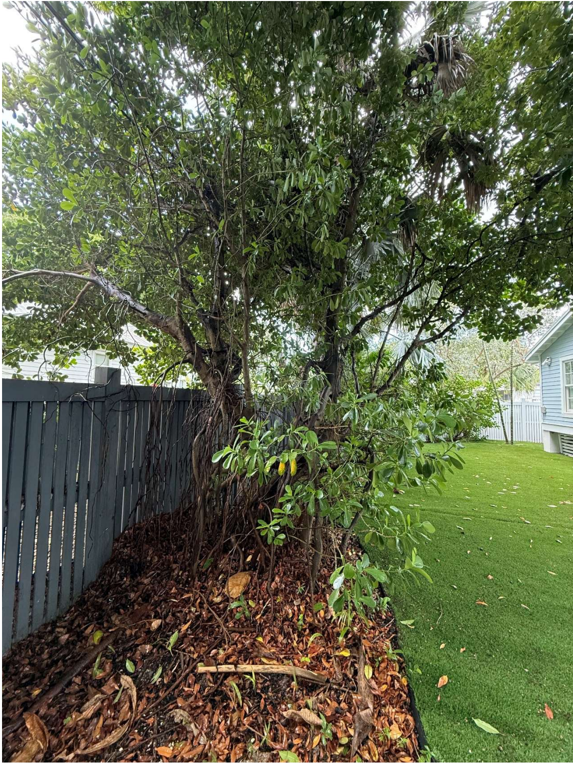
The tree has few appreciable views due to its crowding in this landscape.