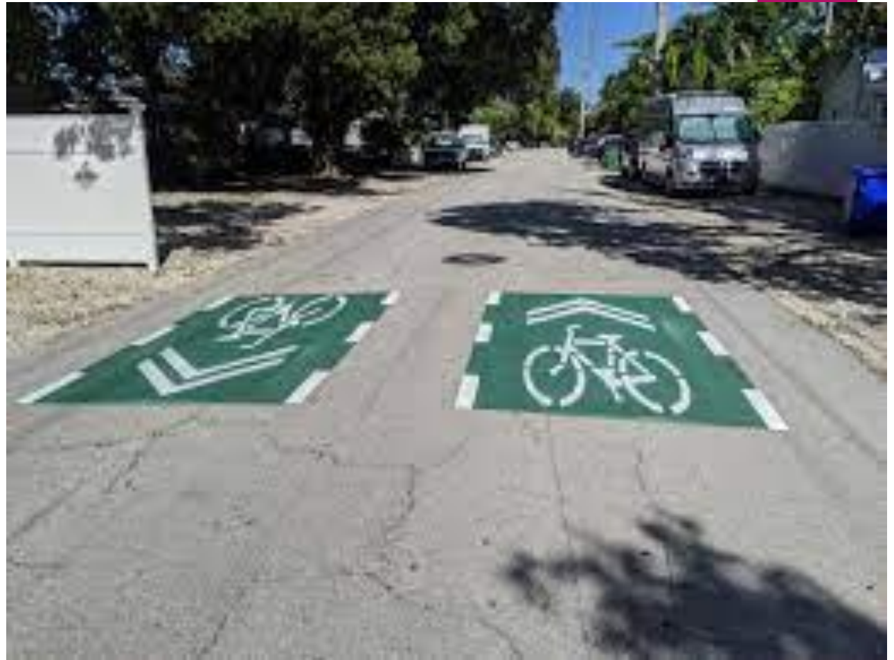
Key West Crosstown Greenway