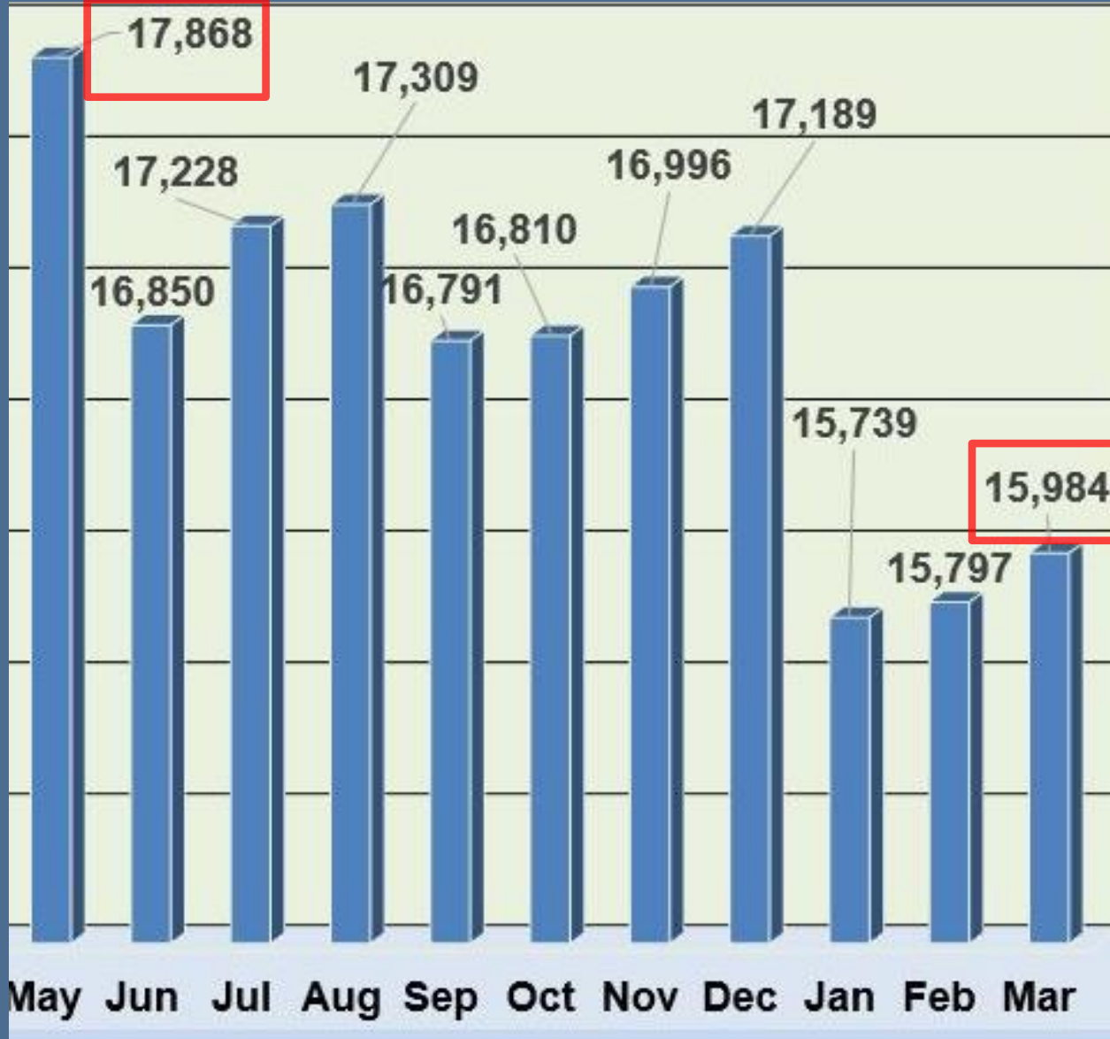
Key West Workforce 2020 - 2021