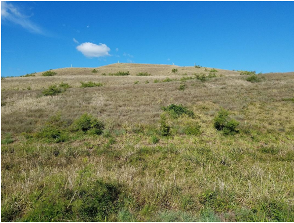
North slope (1)