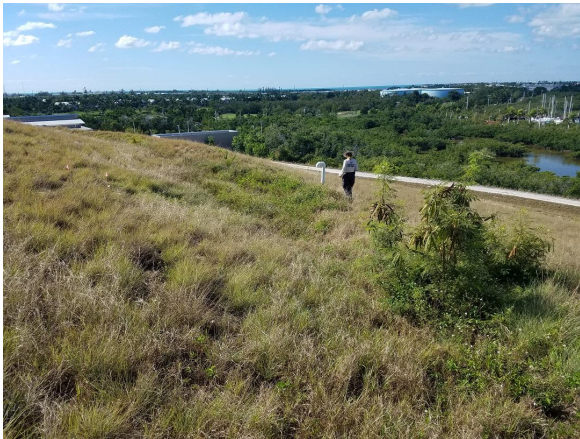
Low area on northwest corner step