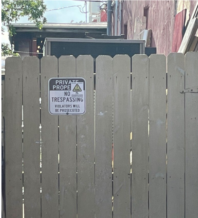
View of Wolfson Street on the south side of the subject property, obstructed by encroaching unpermitted fence.