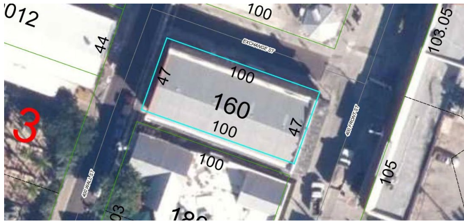
423 Front Street

The first floor of the structure consists of commercial retail use. The property is associated with two active retail licenses and one custom apparel license. The second floor had previously been used for storage, but has been converted for residential use after the property was awarded two permanent Building Permit Allocation System (“BPAS”) units in 2019.