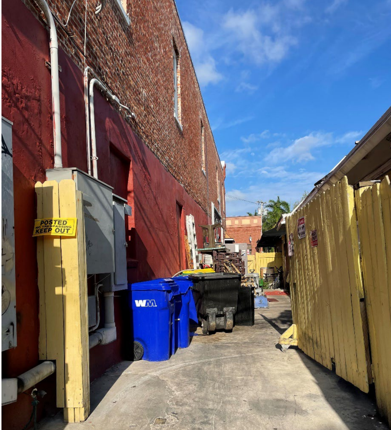
View from Wall Street into Wolfson Street the South side of the subject property, including trash, storage, and electrical equipment behind an encroaching fence.