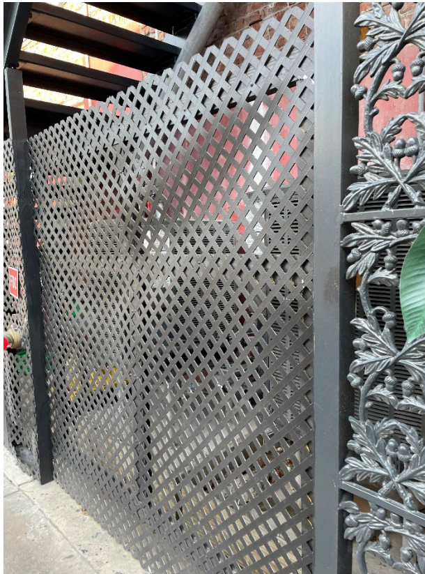
View from Wall Street of encroaching staircase and mechanical equipment behind screen.