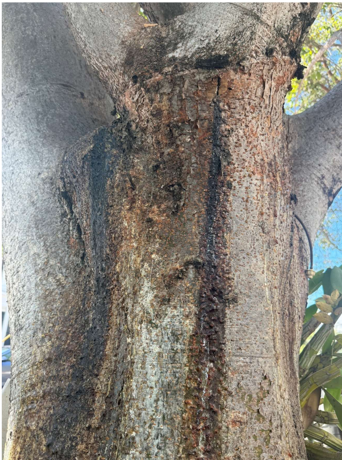
Tree is oozing sap as a defense response to the vascular issues.