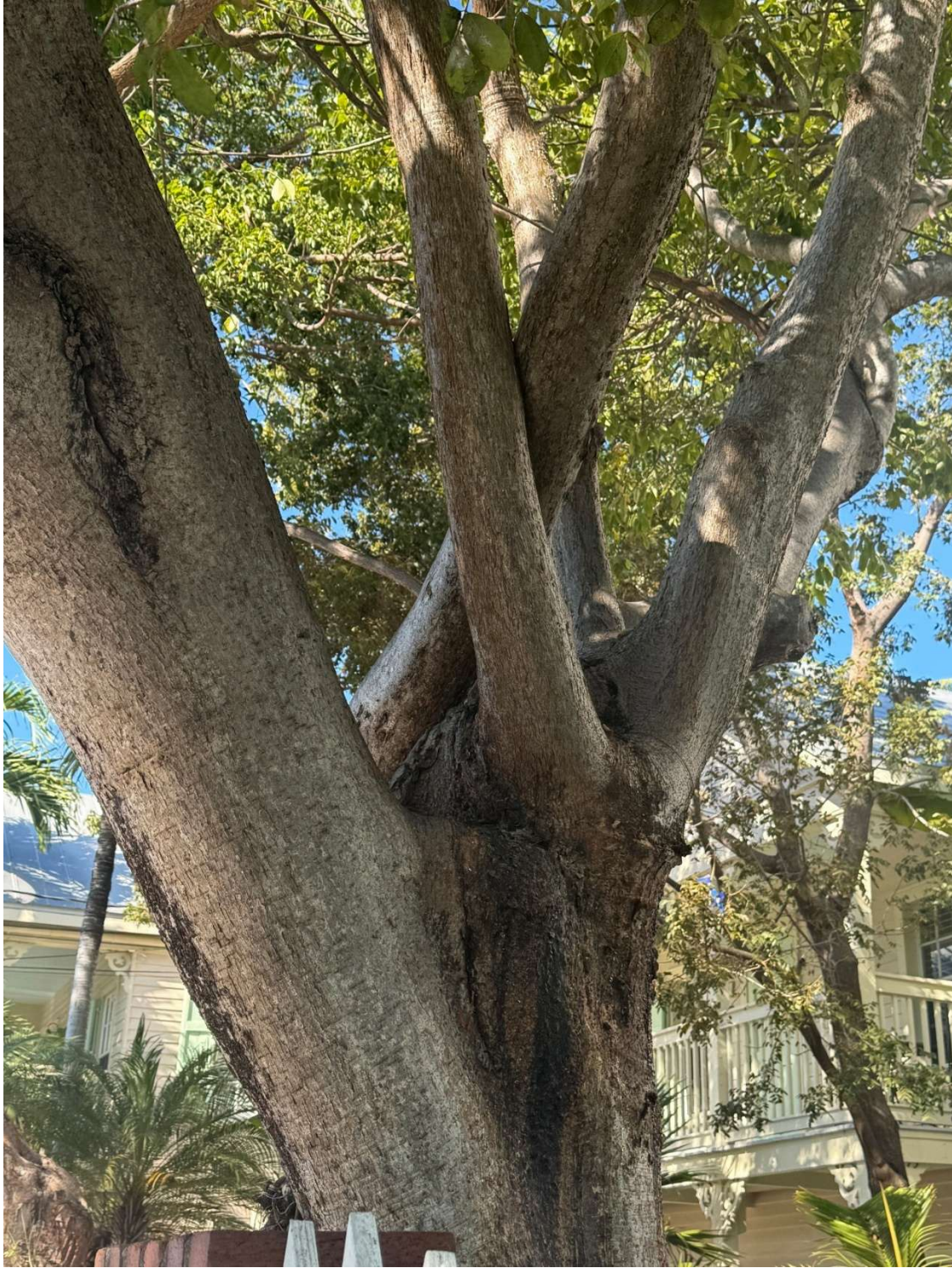
Included bark from lack of maintenance.