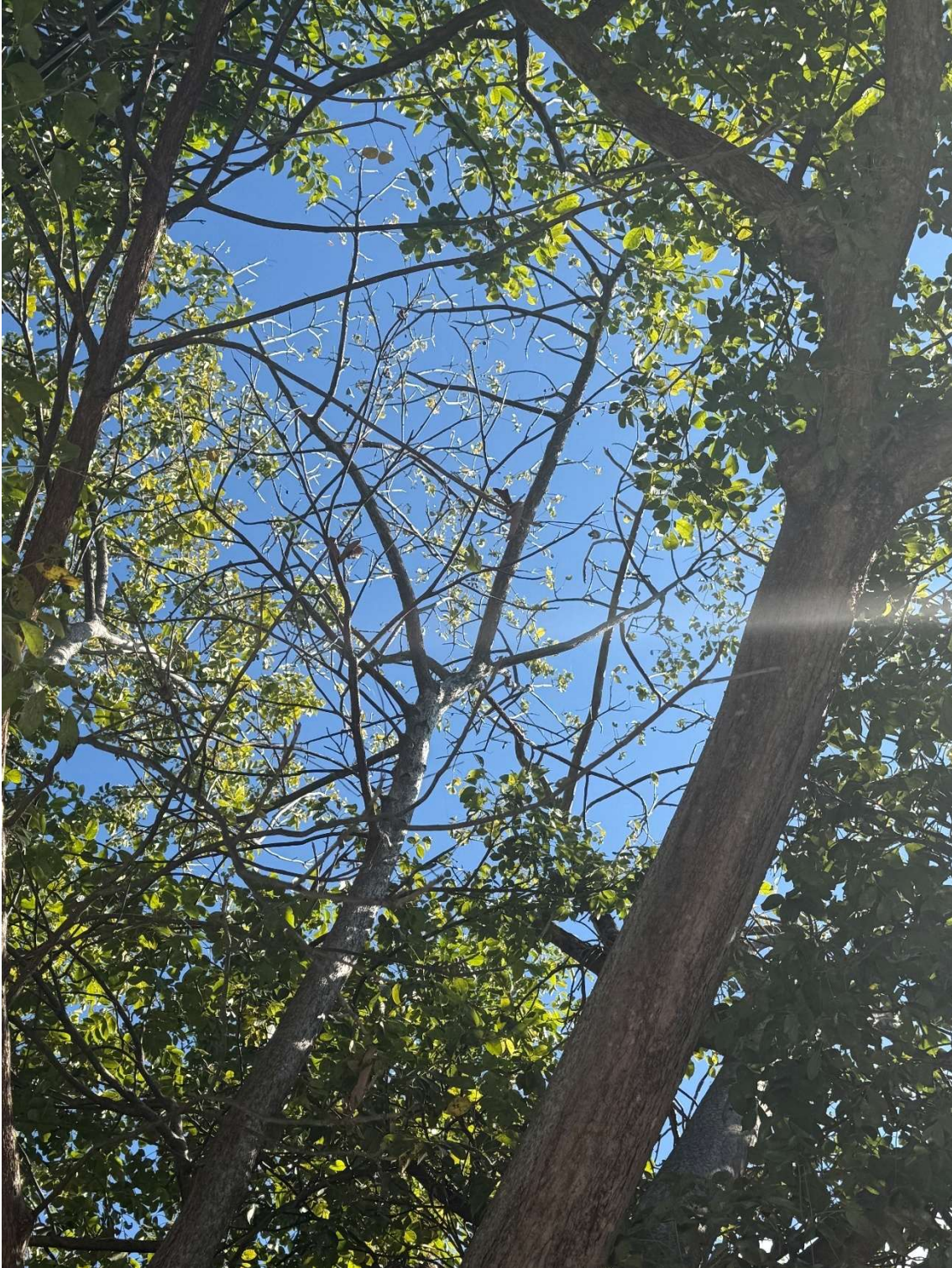
Vascular issues from lack of maintenance have caused die back.