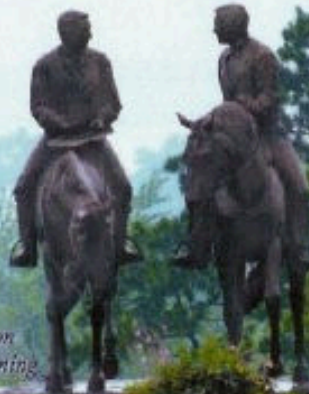
Right: Joseph & Hyrum: Calm as a Summer's Morning