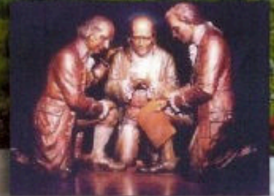
Founding Fathers Appeal to Divine Providence