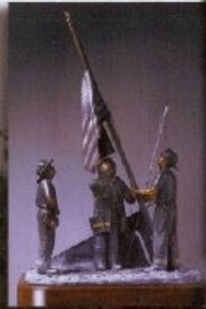
Ground Zero: To Lift a Nation