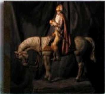
Above: George Washington: On a Firm Foundation