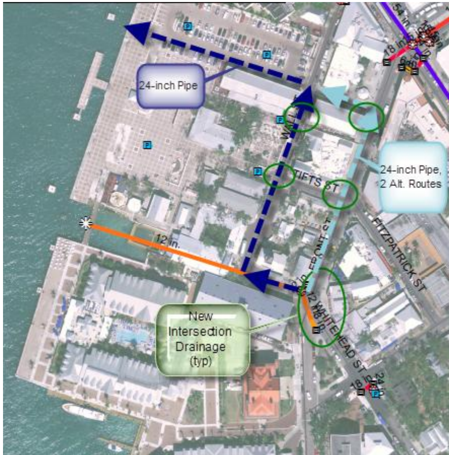
FIGURE 3 Conceptual Route of the Proposed Replacement Outfall