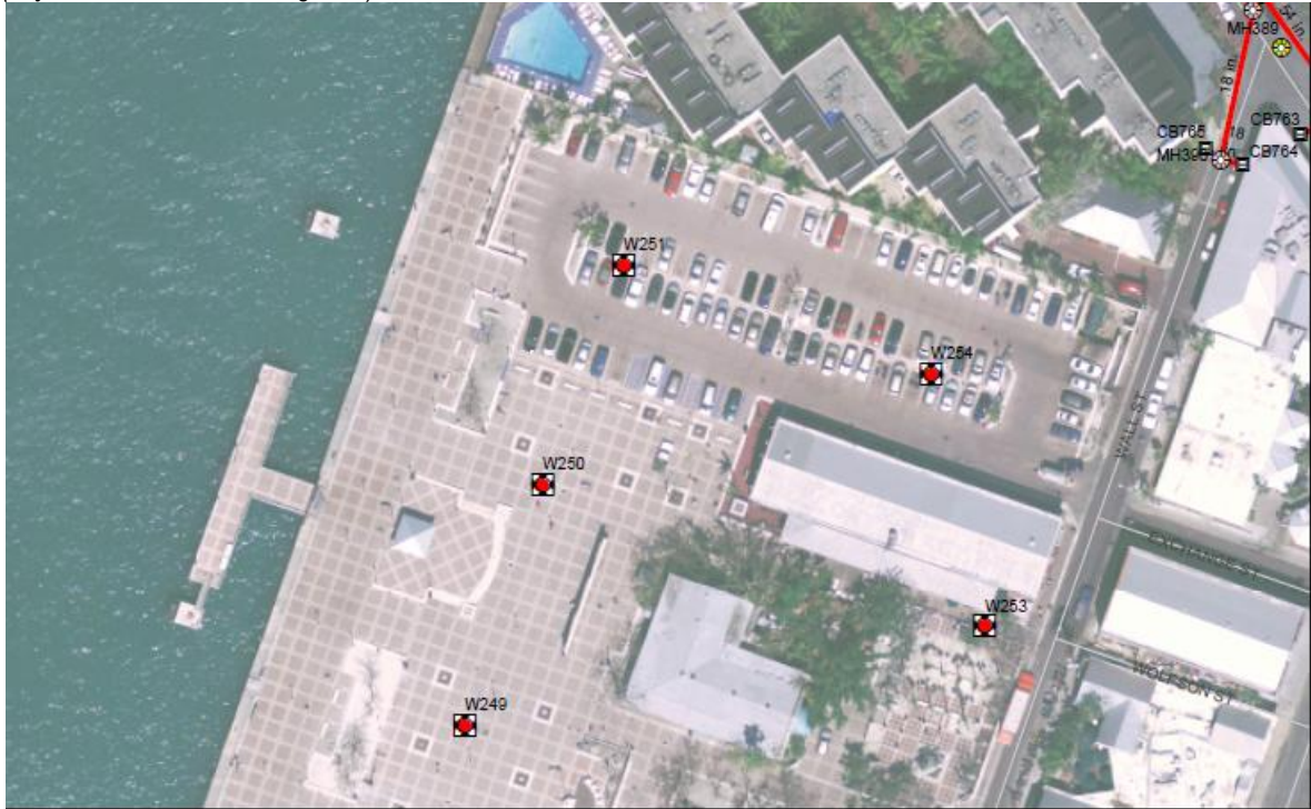
FIGURE 2 Mallory Square Parking Lot Area Existing Infrastructure (Adjacent to and North of Figure 1)

The proposed new system is schematically shown in Figure 3. Considering the age and difficulty in dealing with the traffic, utilities, and pedestrian issues (like Americans with Disability Act requirements), it is expected that most of the existing stormwater infrastructure at the Front and Whitehead Streets intersection would be replaced. Since a new pipeline would be routed down Wall Street a couple of inlets should be installed to serve this street, pending detailed survey data. If Front Street was selected as the primary northeast route, then the cost would be similar, on a conceptual level; but without the brick pavers, it may be an easier build.