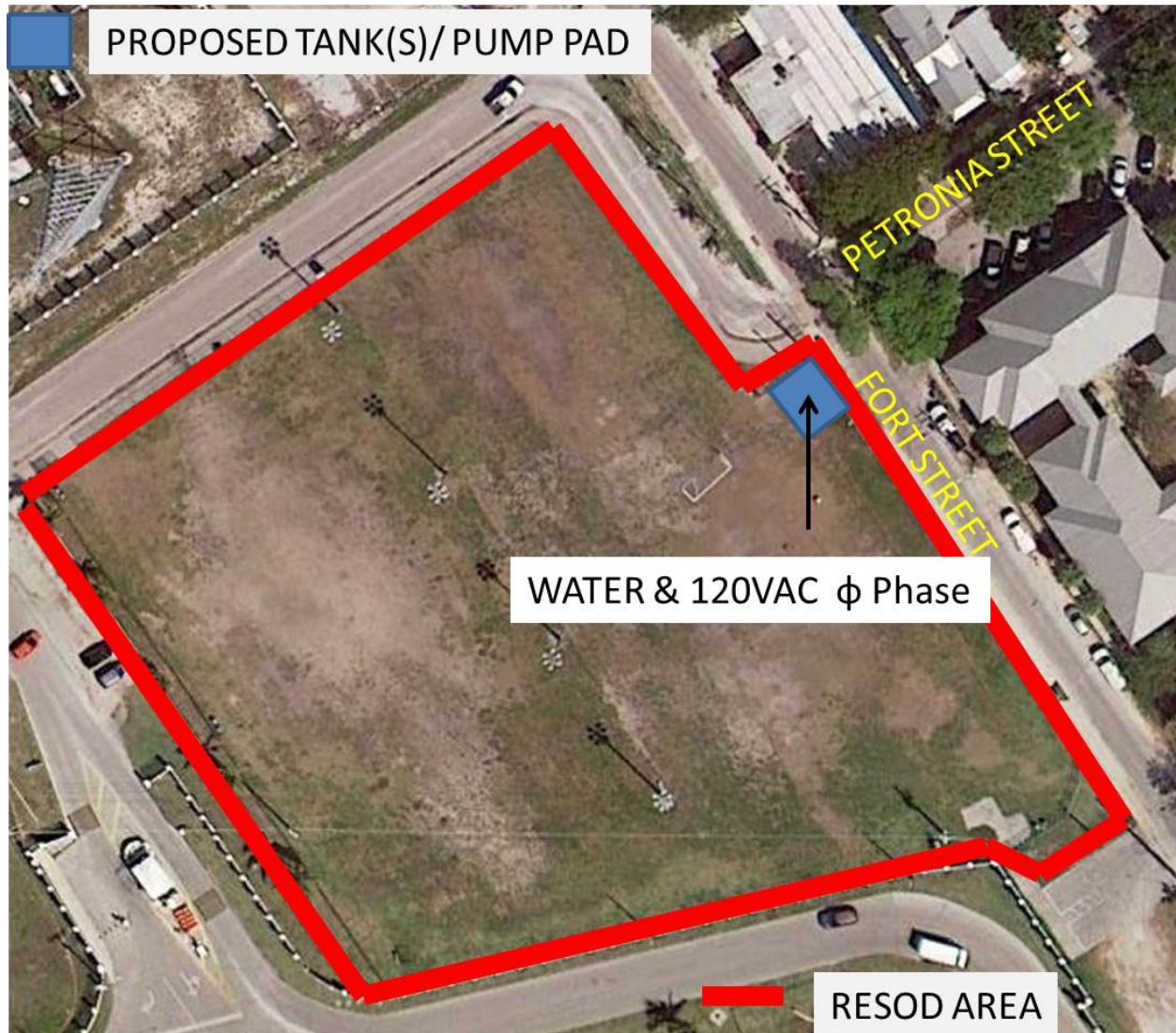
FIGURE 1: WORKSITE (TRUMAN ANNEX SPORTS FIELD)