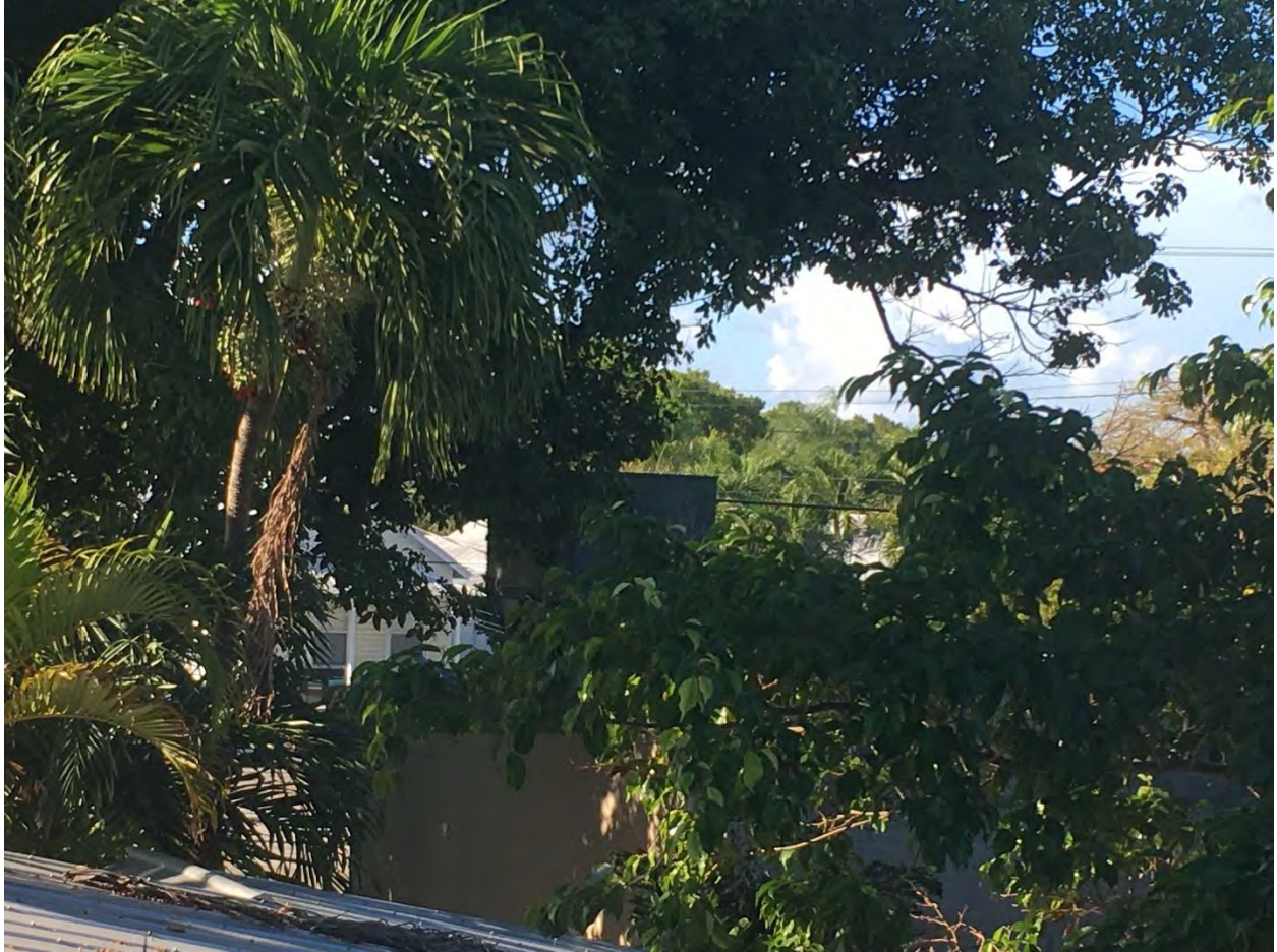
View to the north

I have outlined the proposed design inconsistencies and incompatibilities which will compromise our historic neighborhood's desirability and integrity below.