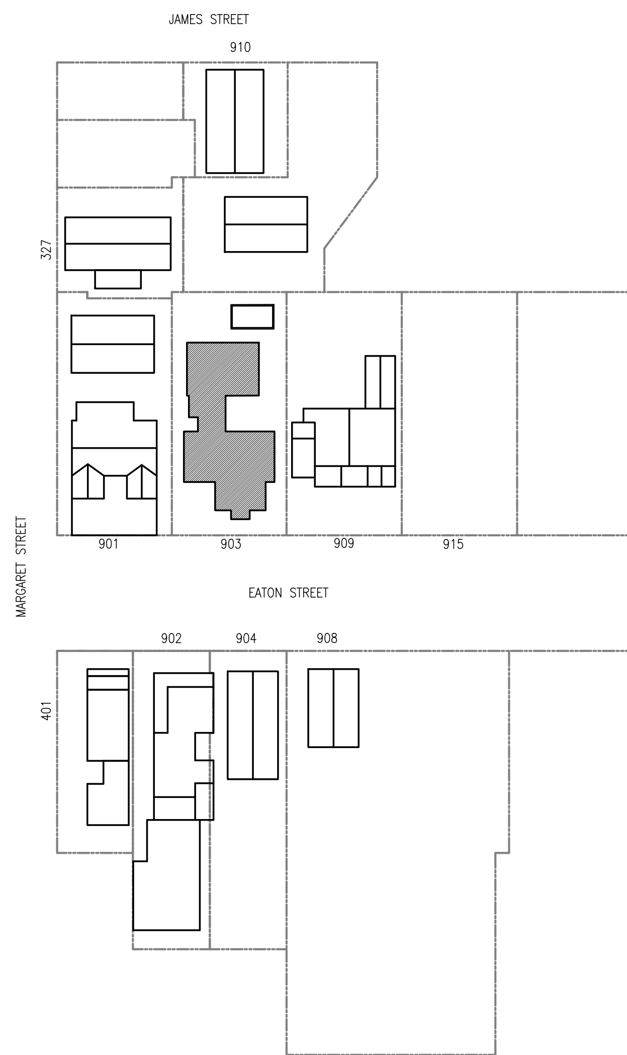
2 SITE PLAN A1.2 SCALE: N.T.S.