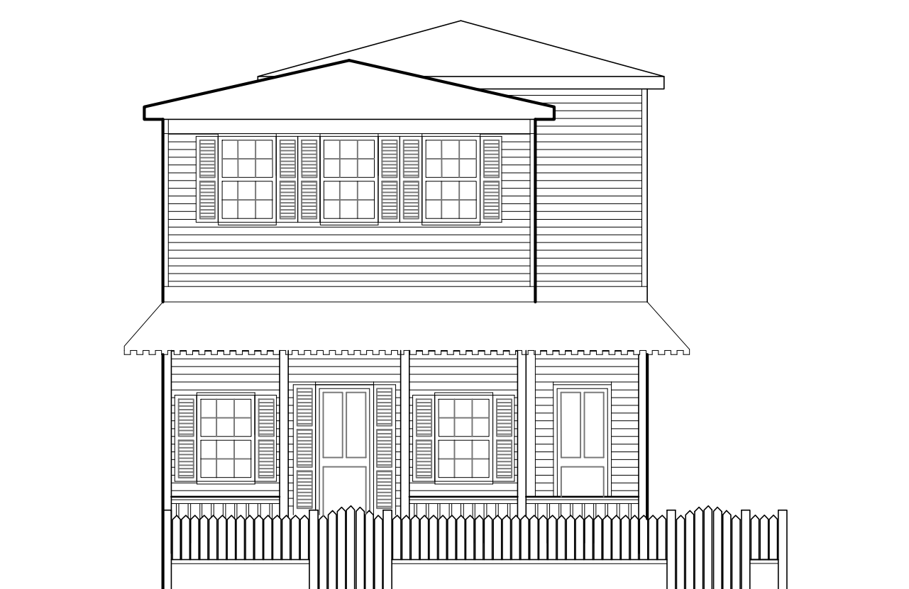
3 902 EATON ST (ACROSS STREET) A1.2 SCALE: N.T.S.