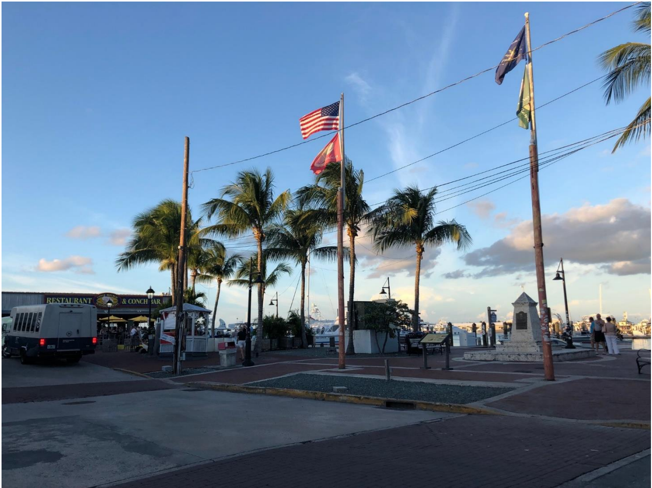
SITE A: Main entrance into the Key West Historic Seaport – corner of Greene and Elizabeth Streets

The Key West Bight Board (advisory board for the Seaport) requests the following possible elements: