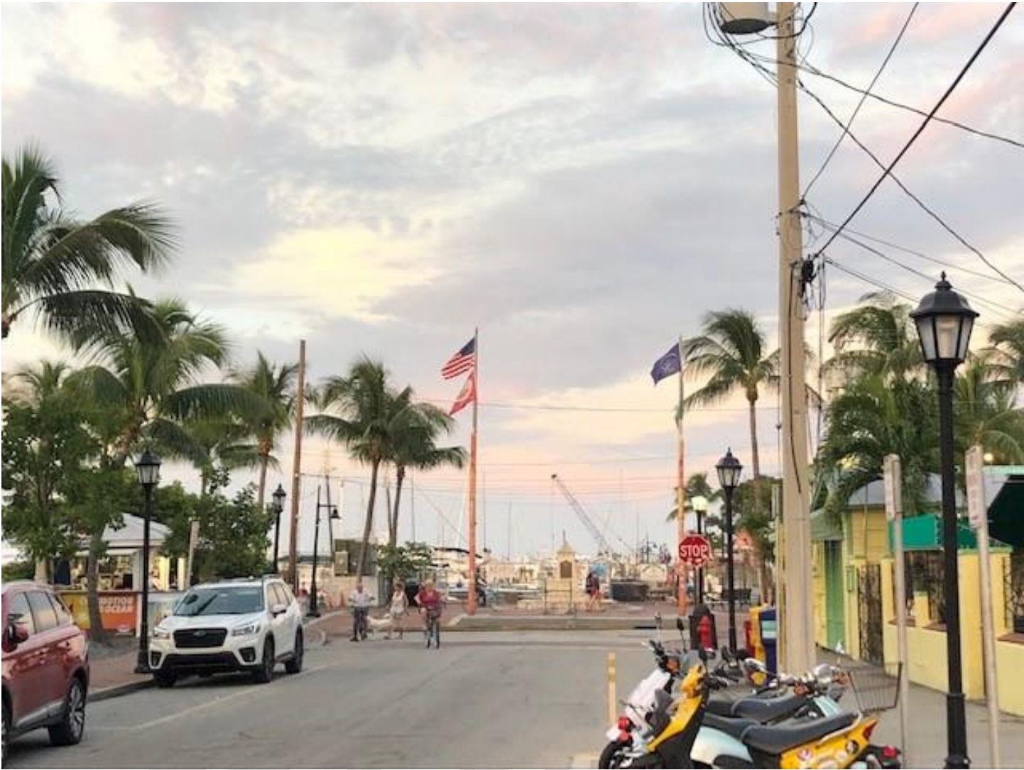
Half block view of main entrance at Greene Street, Key West