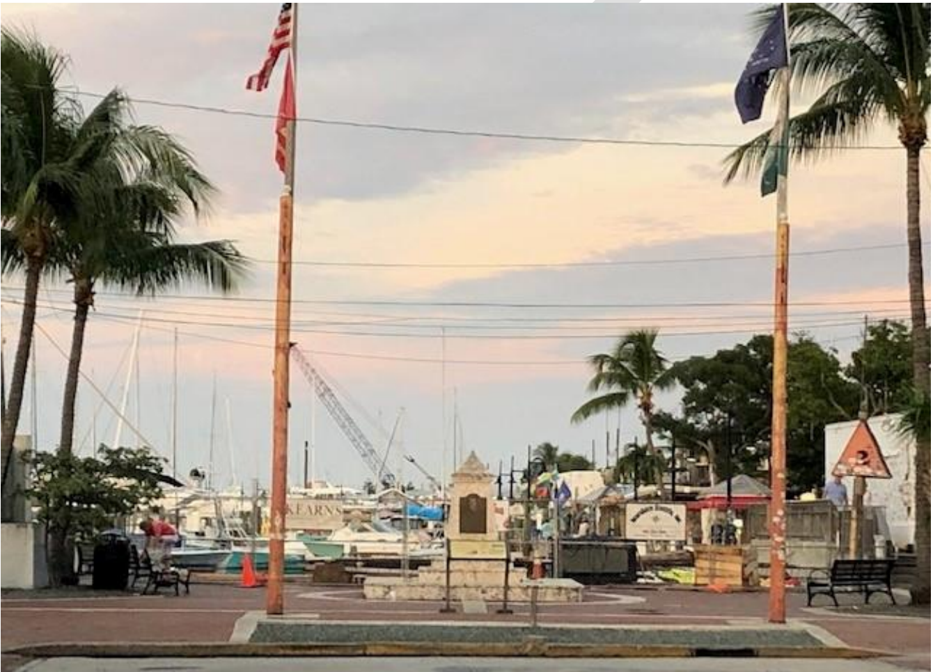
Close Up of main entrance at Greene Street, Key West

Please note: All proposed exterior artwork may not impact existing trees, palms, shrubs, or groundcover. The City of Key West Urban Forester will coordinate the placement and installation of this project.