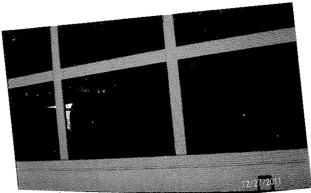
1101 Simonton Case # 11-1548