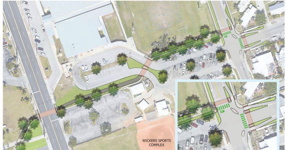
14th St and Duck Ave intersection detail