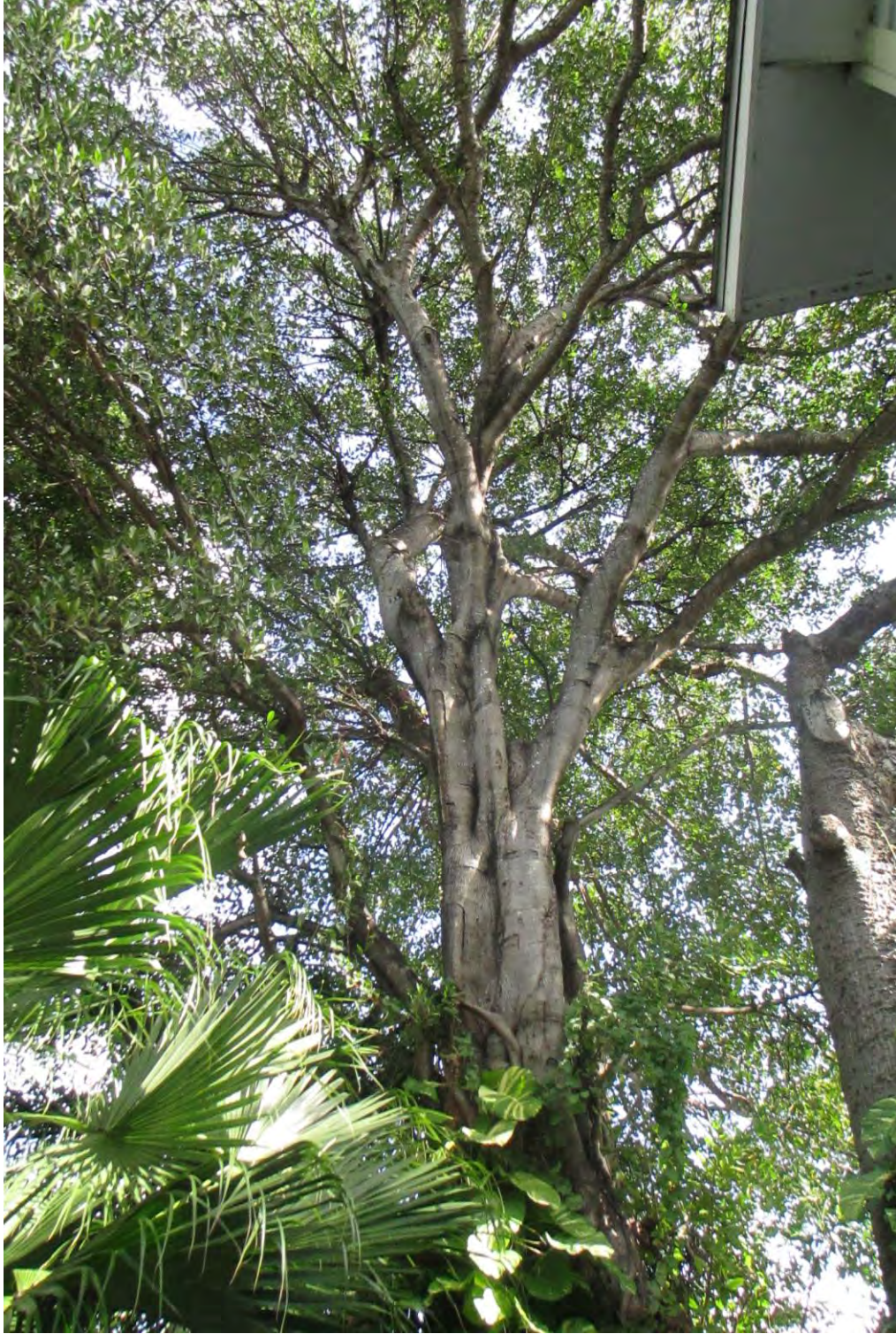
Strangler Fig - top