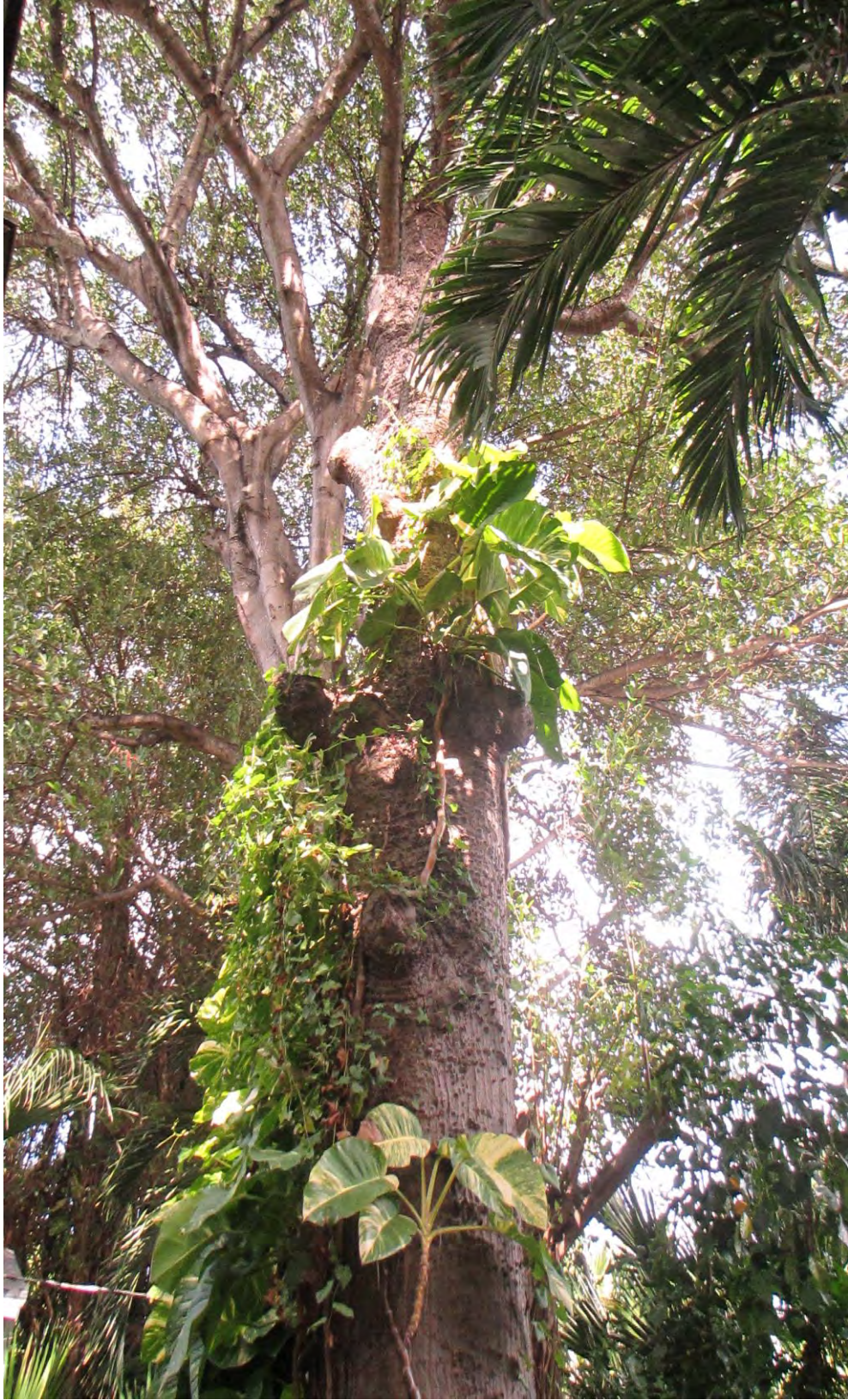
Sandbox tree - top