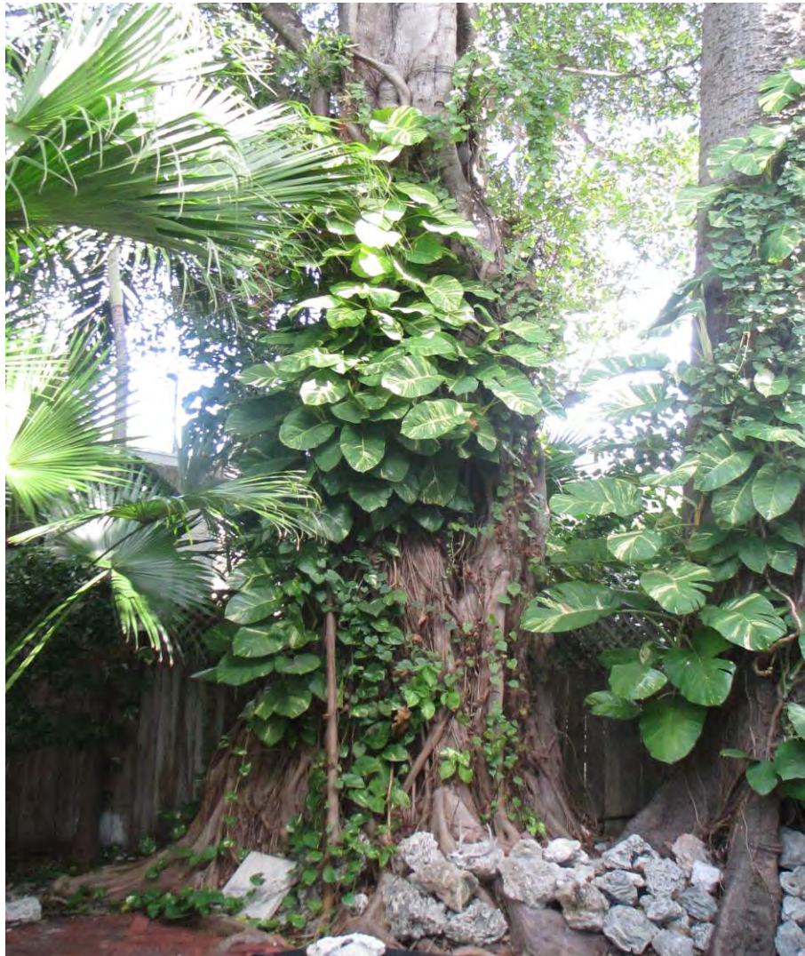
Strangler Fig - base

Tree Species: Strangler Fig ( Ficus aurea ) Sandbox tree ( Hura crepitans )