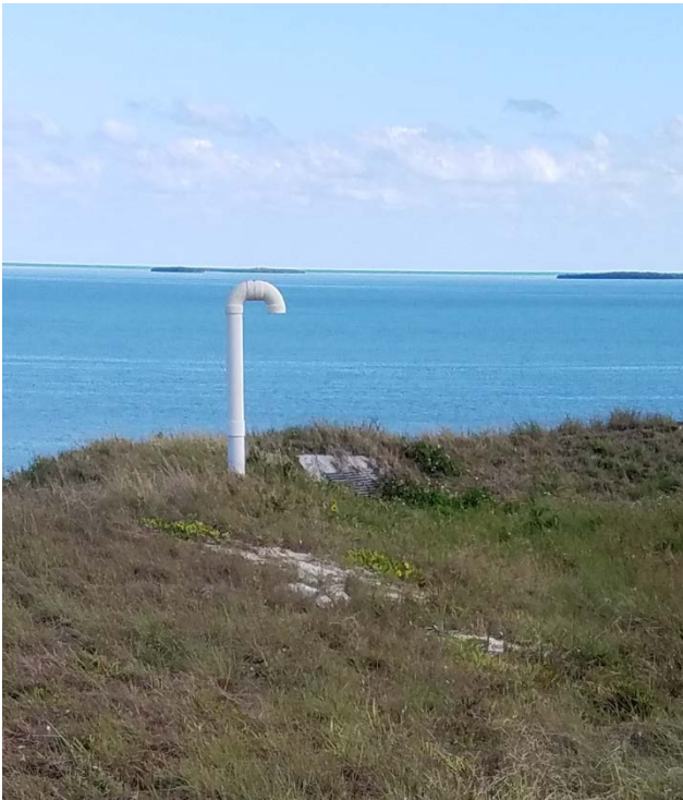
Typical gas vent (GV).