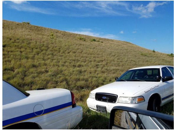
North slope (1)