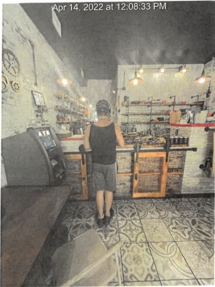
Apr 14, 2022 at 12:08:33 PM