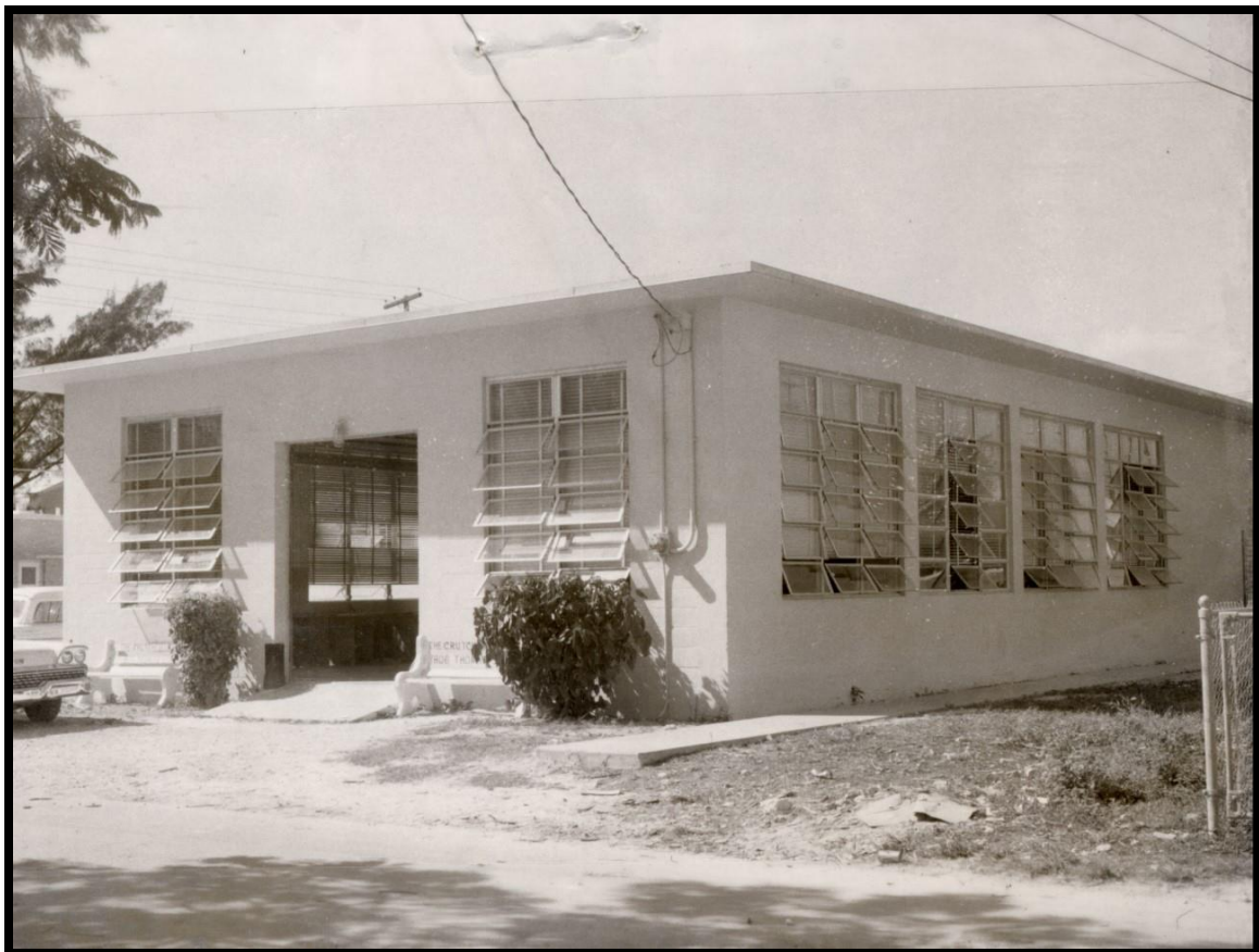
727 Fort Street, view from Petronia St, circa_1965

Historically the parcel was built as a part of the Fredrick Douglass School System Complex and originally used for a band room and workshop. The building is one of the last remaining structures of the historic Fredrick Douglass School System Complex and is culturally significant in the community and the City. The Fredrick Douglass School System was built as a school complex for black students and students of color and continued until the desegregation of the public-school system. Since the structure was erected the building has had a variety of uses from education, public facilities, community center, health clinic, etc. Most recently the structure was used as an arts center and a skills center. The applicant is proposing to convert the structure into a community health clinic, a permitted use under the proposed HNC-4 zoning district.