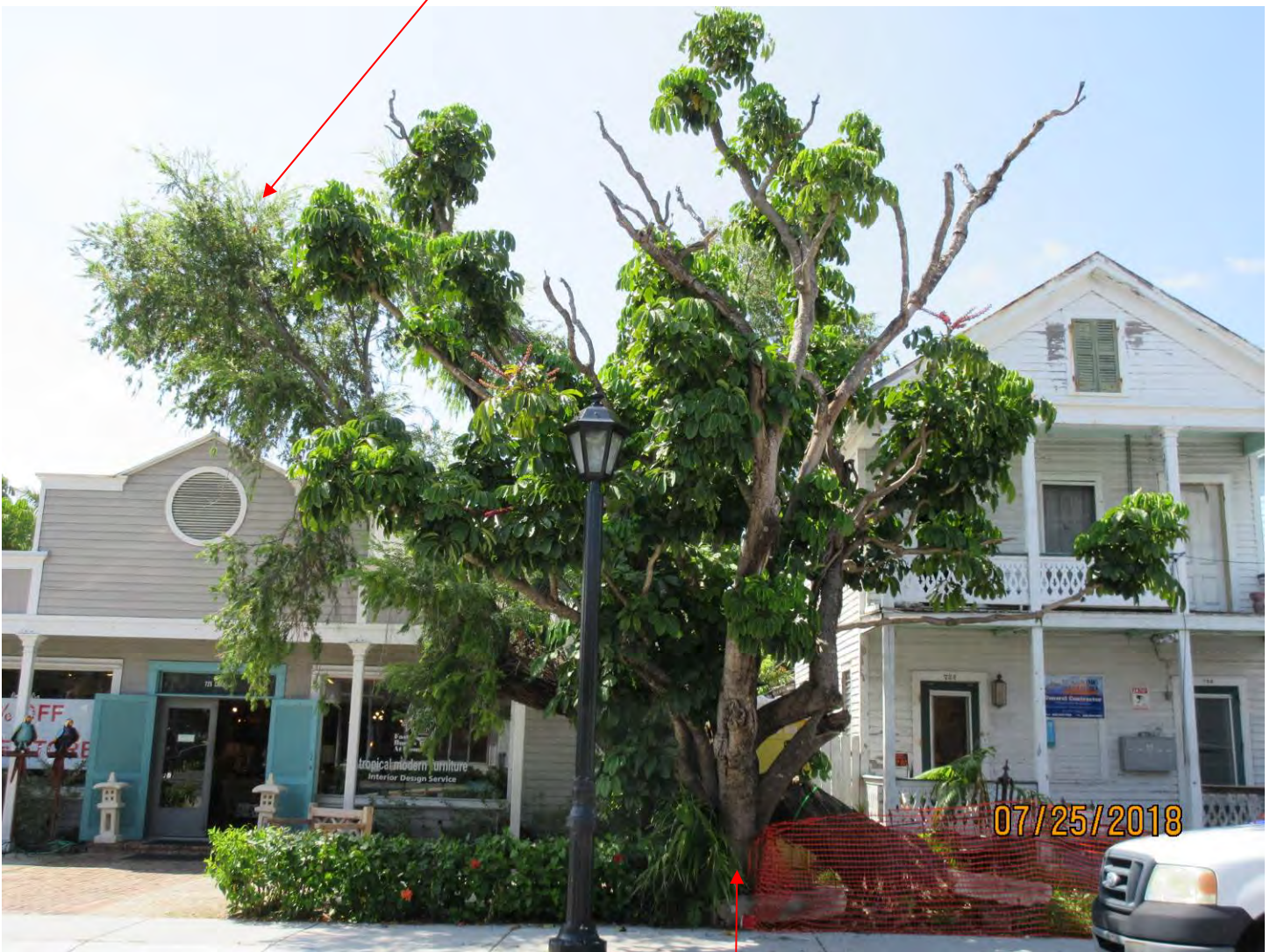
Umbrella tree (no permit required for removal)

Tree Species: Bottlebrush (Callistemon sp.)