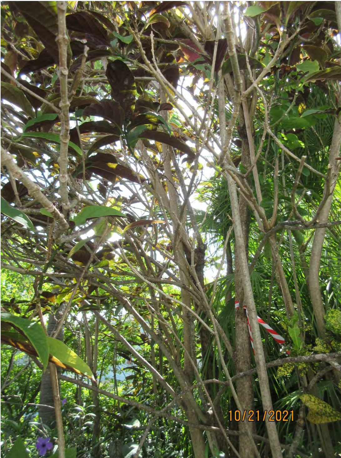
Photo showing trunks of tree, view 2.

Diameter: 6" (multiple trunks) Location: 70% (growing in a parking lot planter with other plants) Species: 50% (not on protected or not protected tree list) Condition: 60% (overall condition is fair, multi trunked, shrubby tree) Total Average Value = 60% Value x Diameter = 3.6 replacement caliper inches