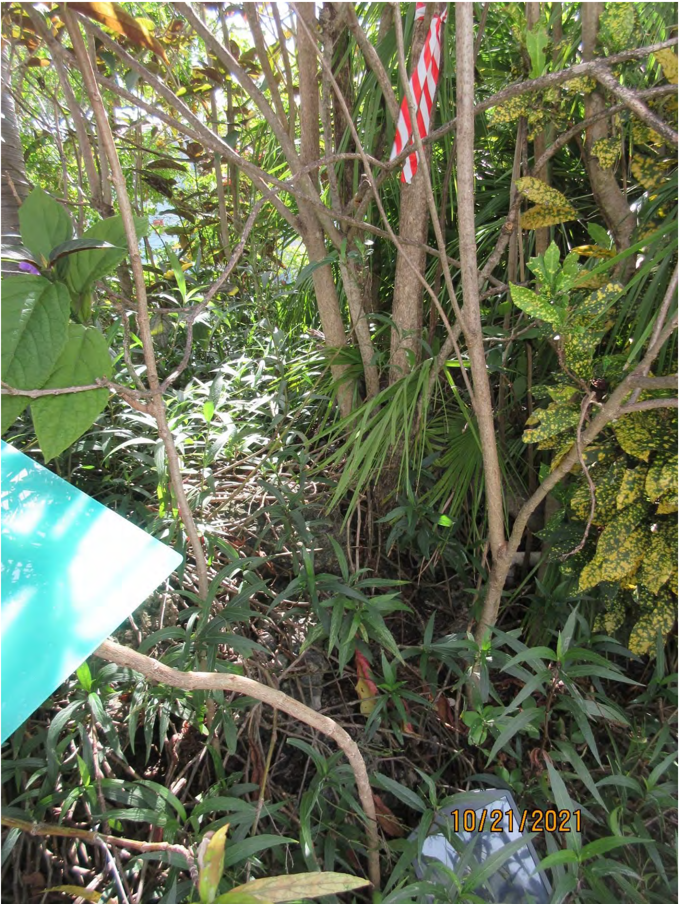
Photo showing trunk of subject tree, view 1.