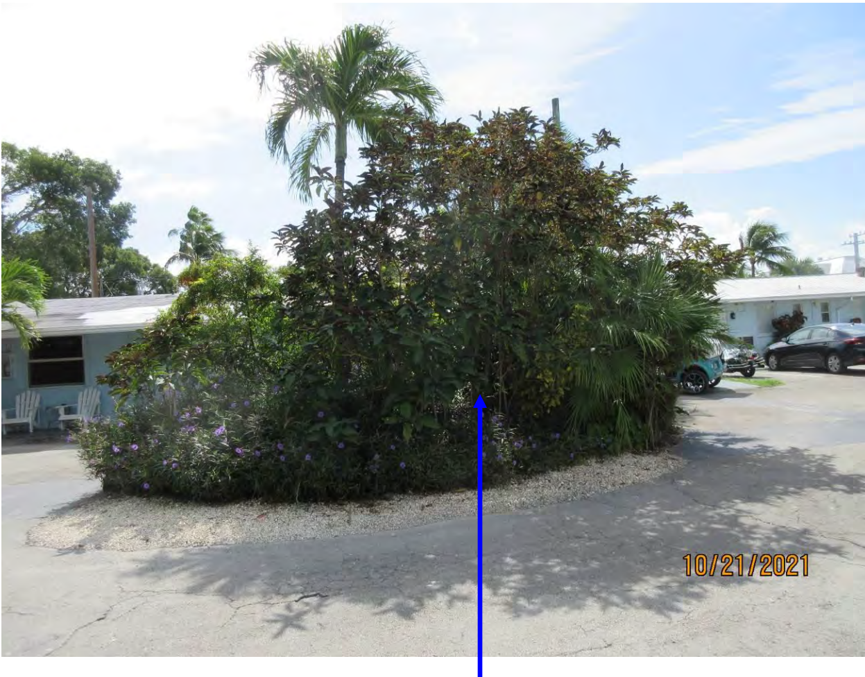
Two photos showing location of tree, different views.