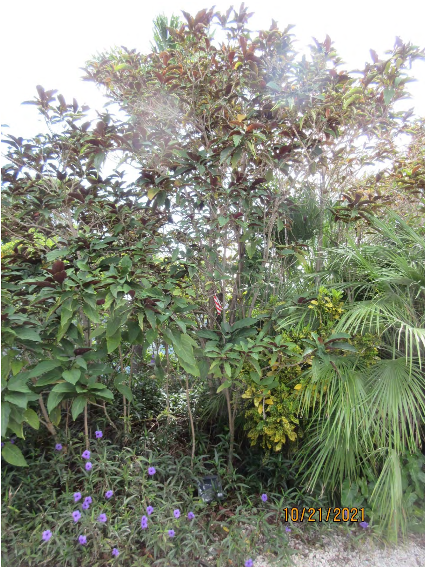
Photo of entire tree. There are several smaller starburst sapling trees around subject tree.