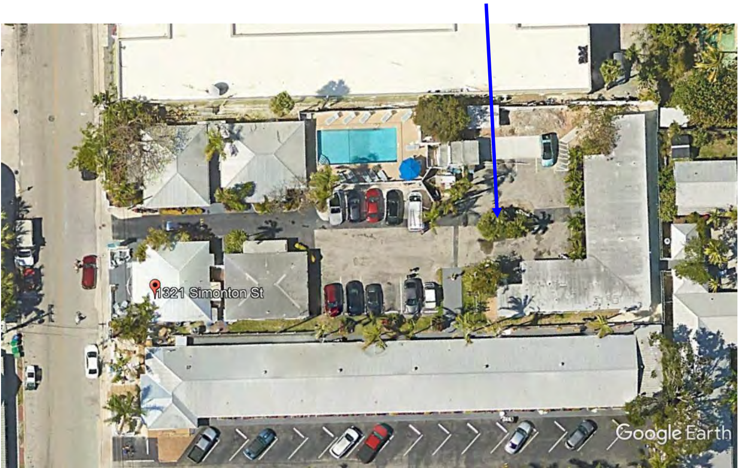
Photo showing location of tree, in parking lot planter area.

Tree Species: Starburst ( Clerodendrum quadriloculare )