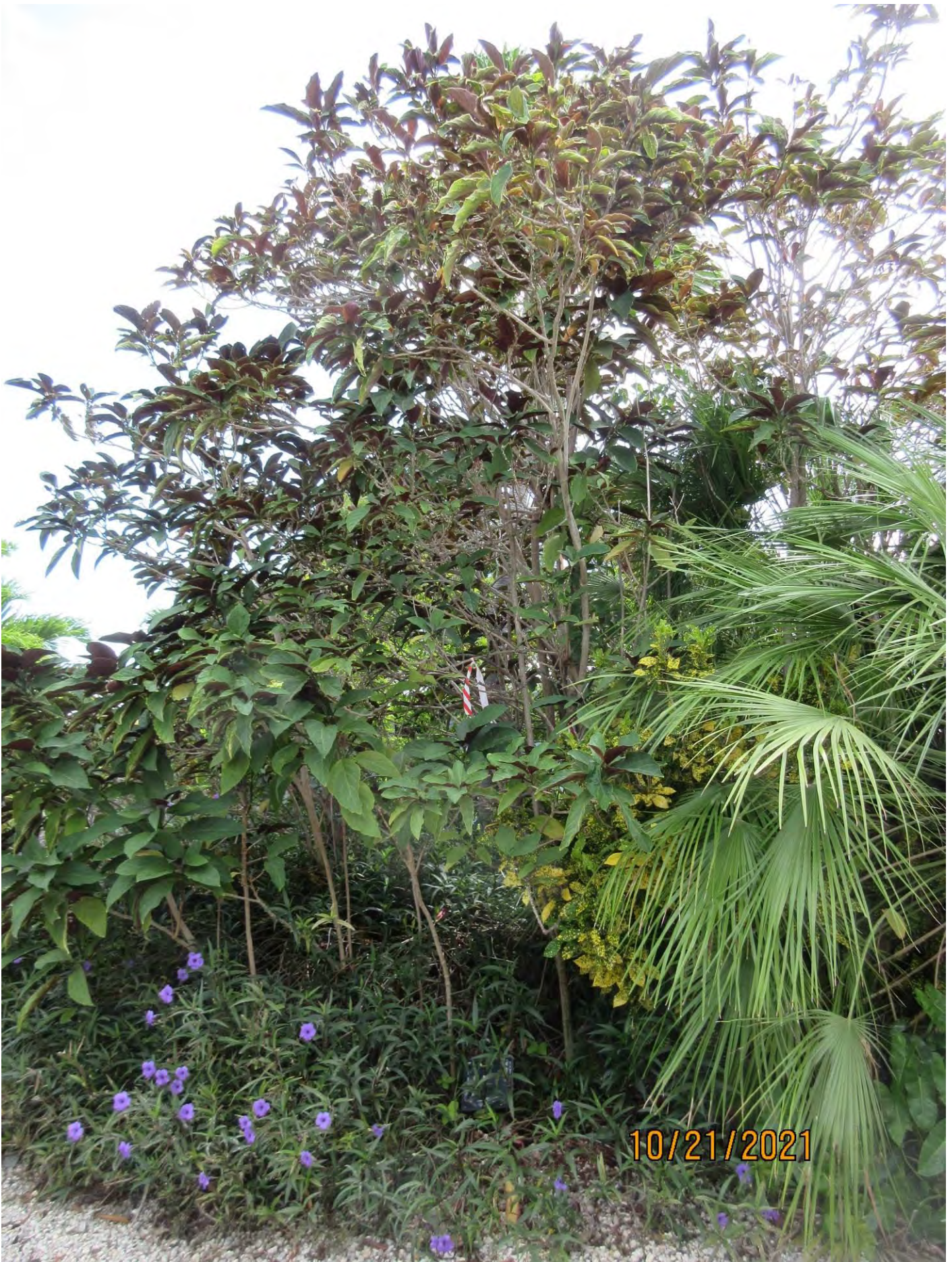
Another view of entire tree and adjacent saplings.