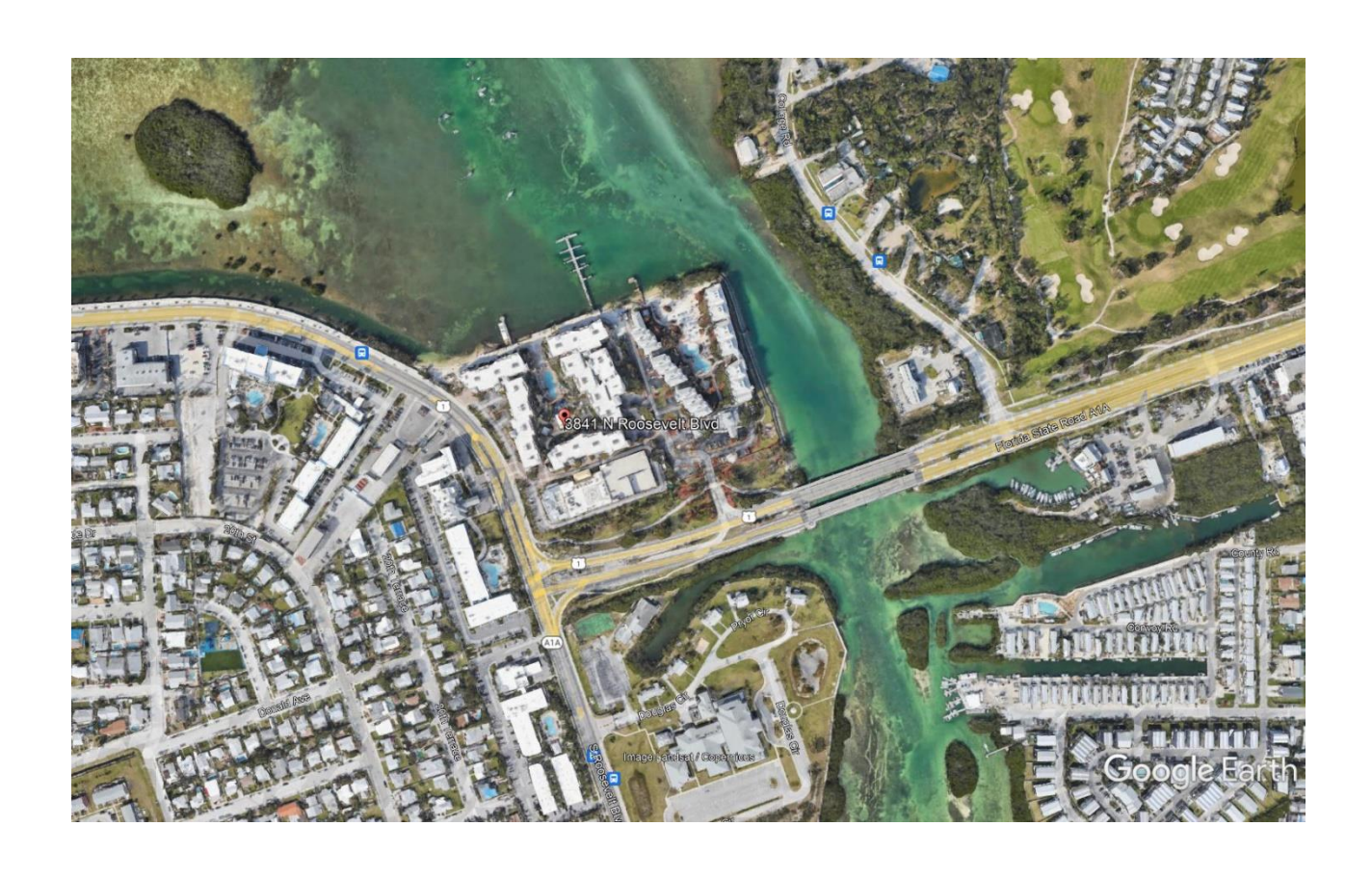
Subject Property – 3841 Roosevelt Boulevard