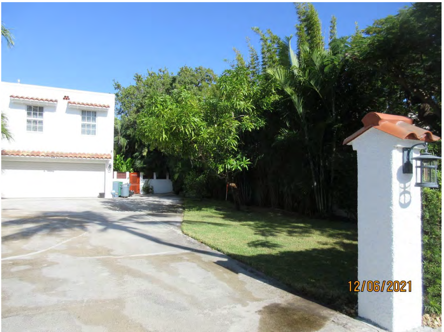
Photo showing location of tree.

Tree Species: Mango ( Mangifera indica )