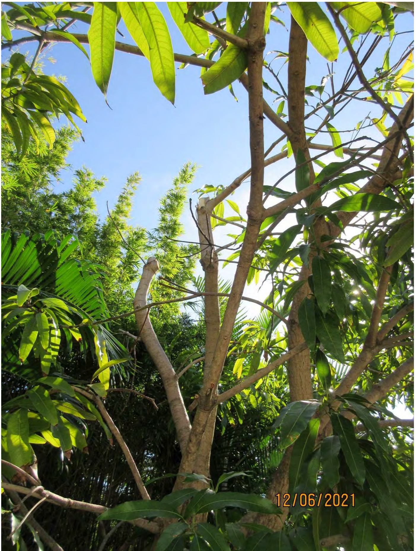
Photo of tree canopy