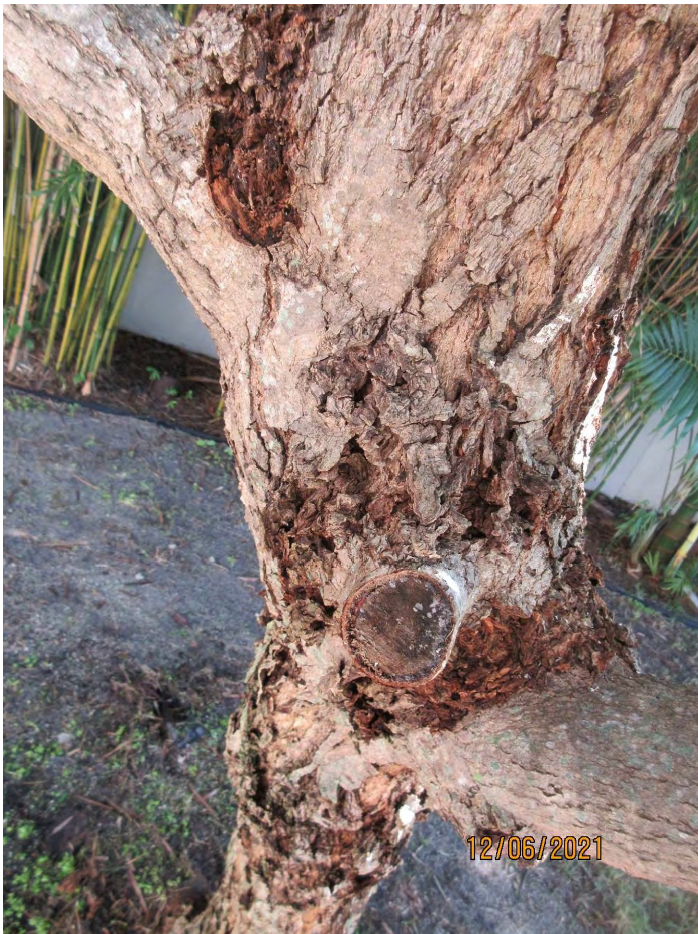
Closeup of tree trunk-bark, view 3.