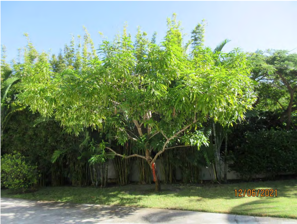
Photo of whole tree.