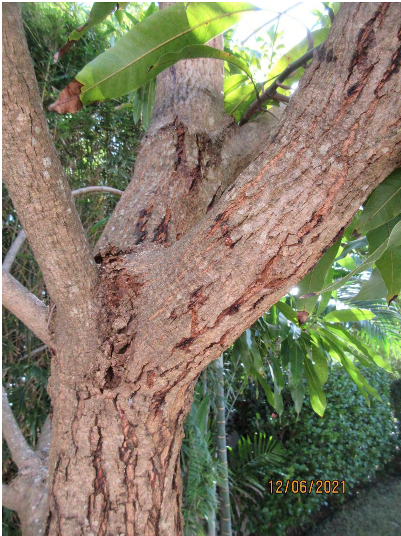
Closeup of tree trunk-bark, view 2.