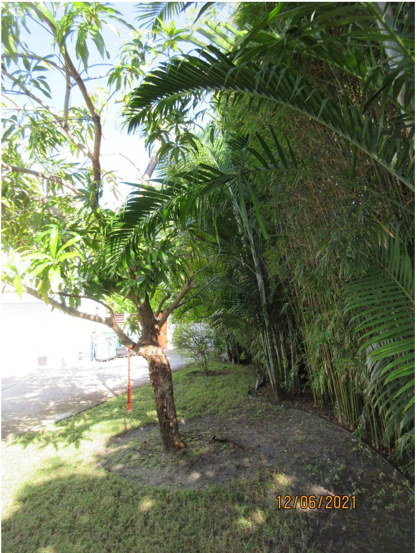
Photo of tree trunk and canopy.