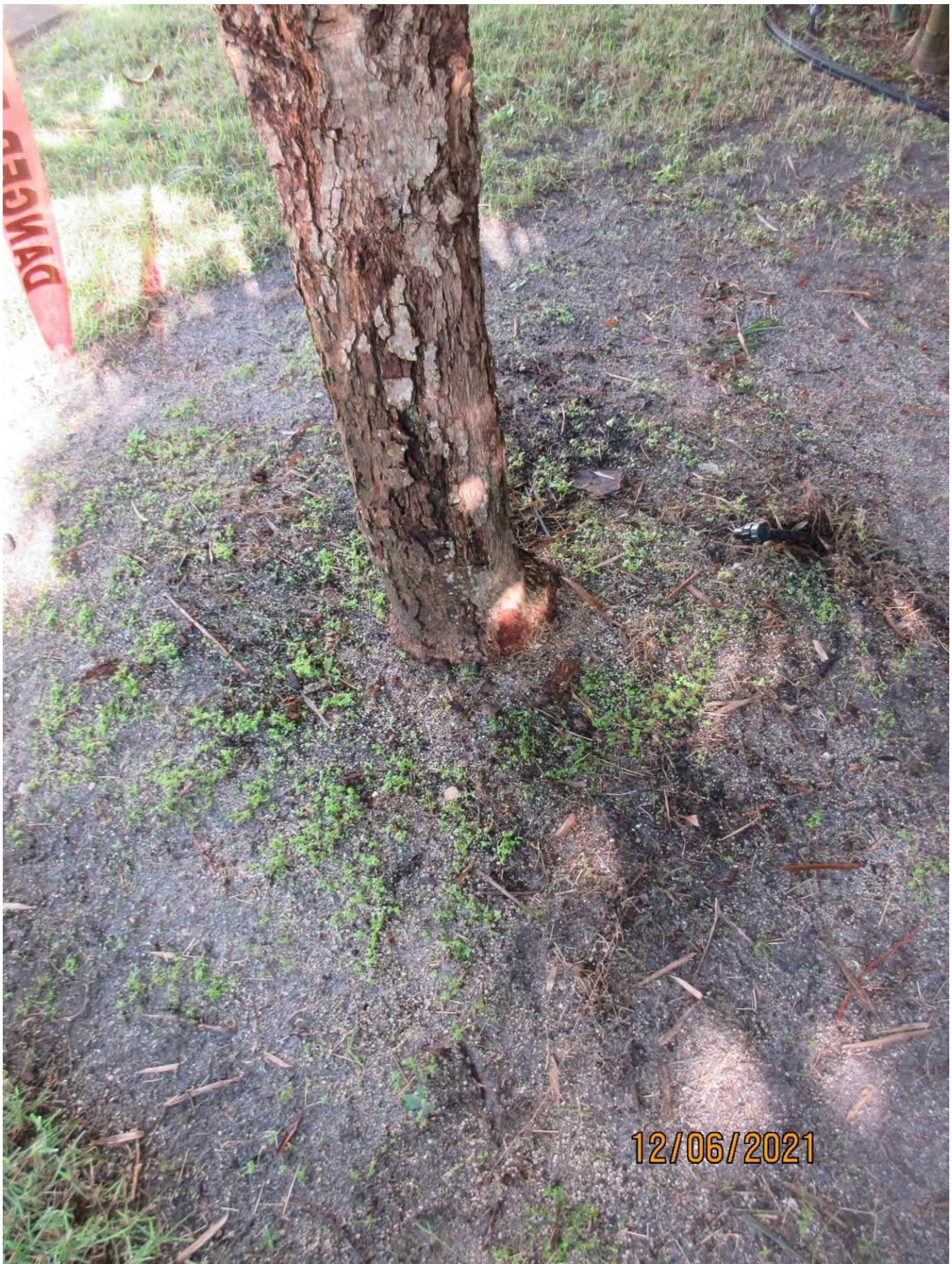
Photo of trunk and base of tree, view 2.