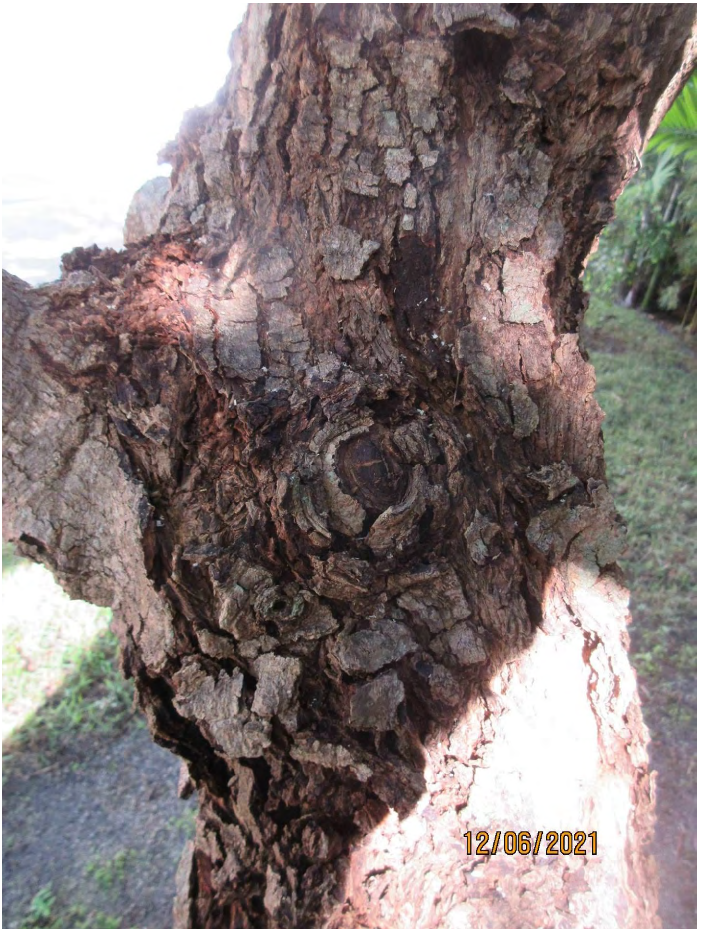
Closeup of tree trunk-bark, view 1.