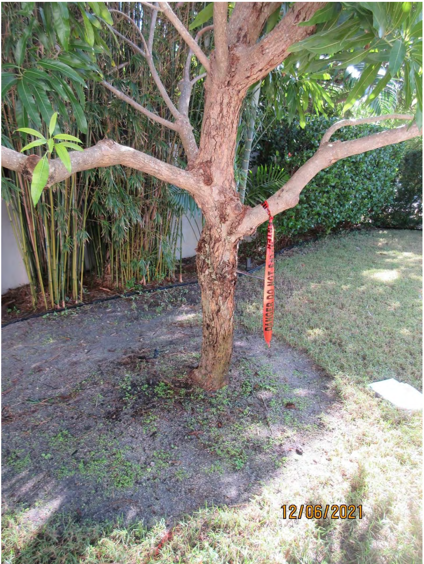
Photo of trunk, base of tree, and canopy branches.