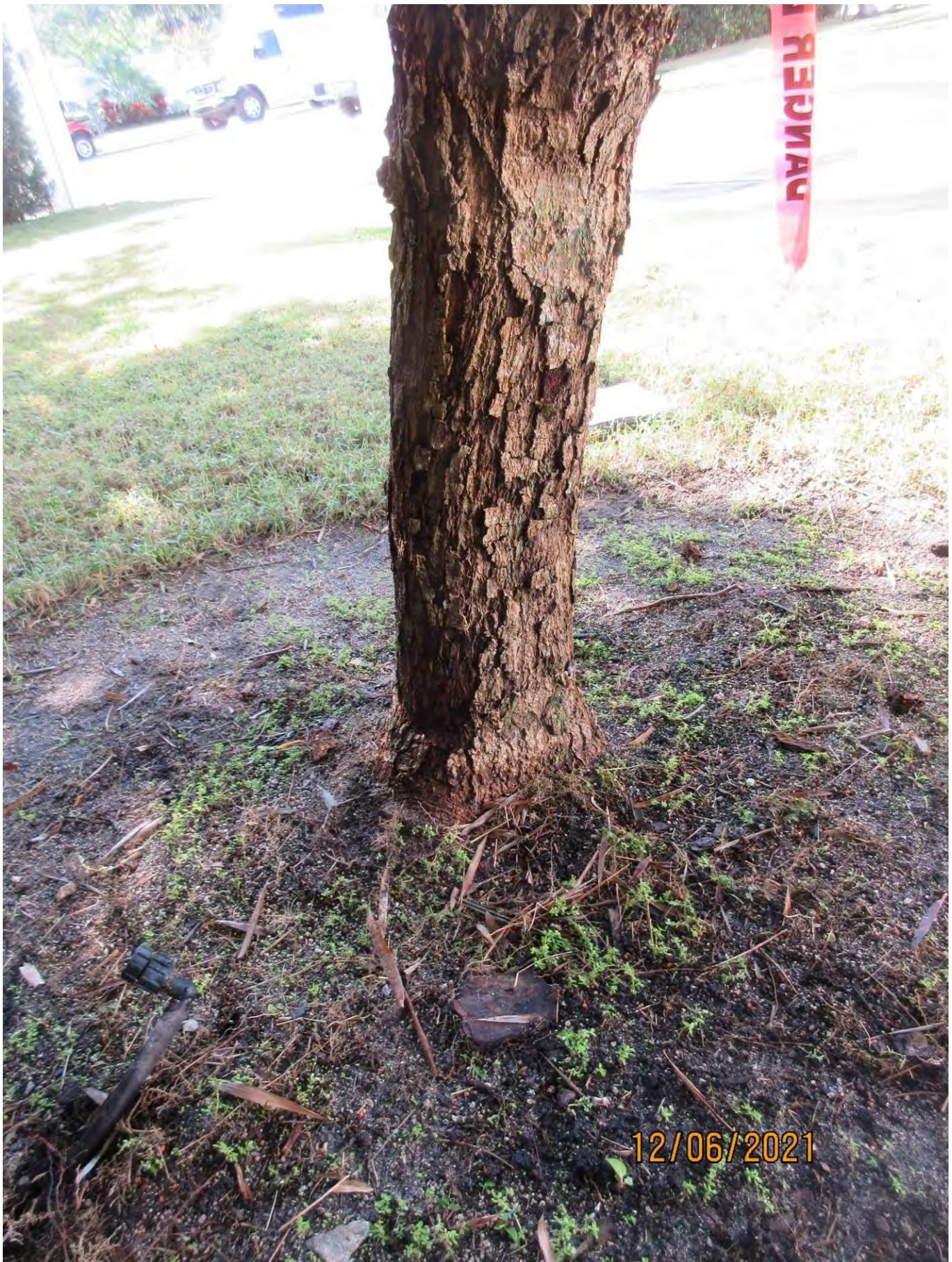
Photo of trunk and base of tree, view 1.