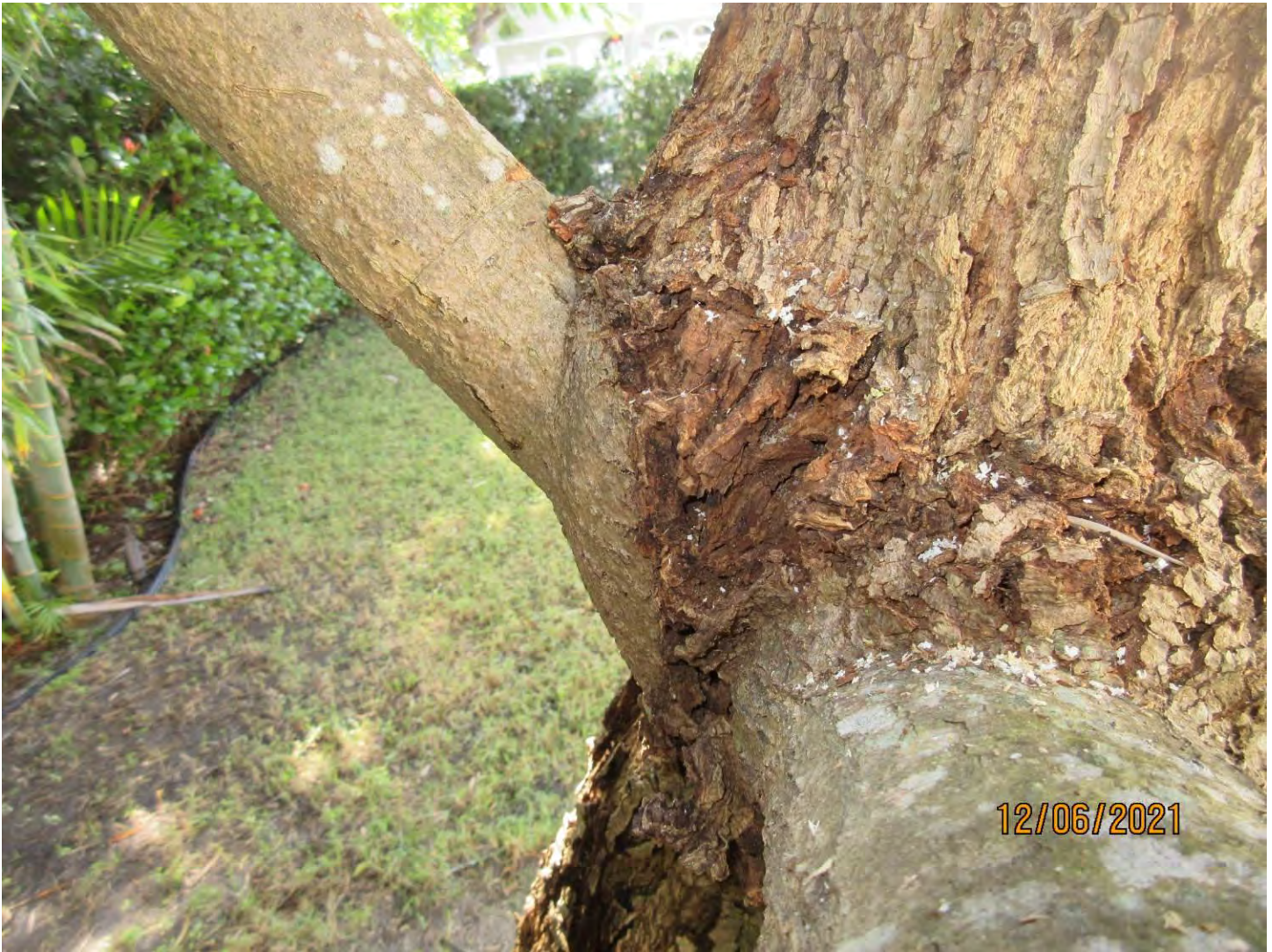
Close up photo of tree trunk and branch connection.