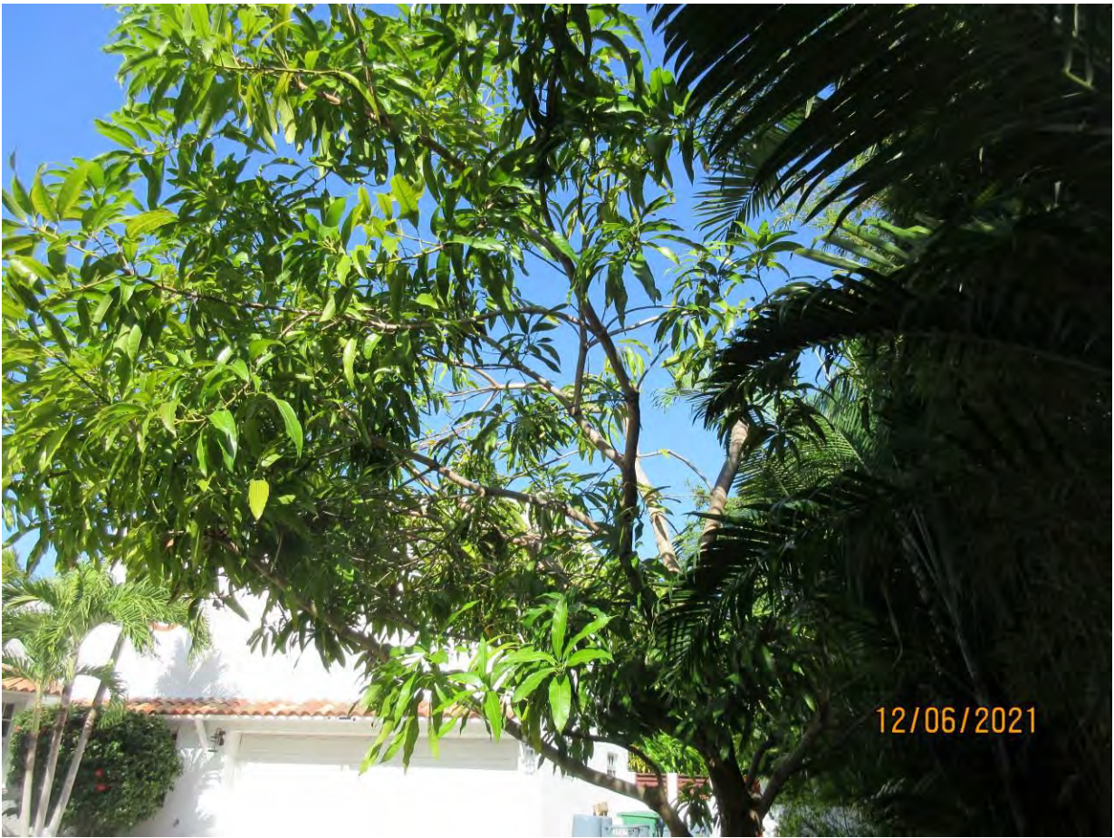
Photo of tree canopy.