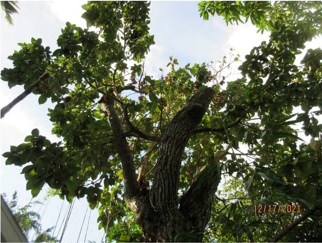
Photo of tree canopy, view 1.