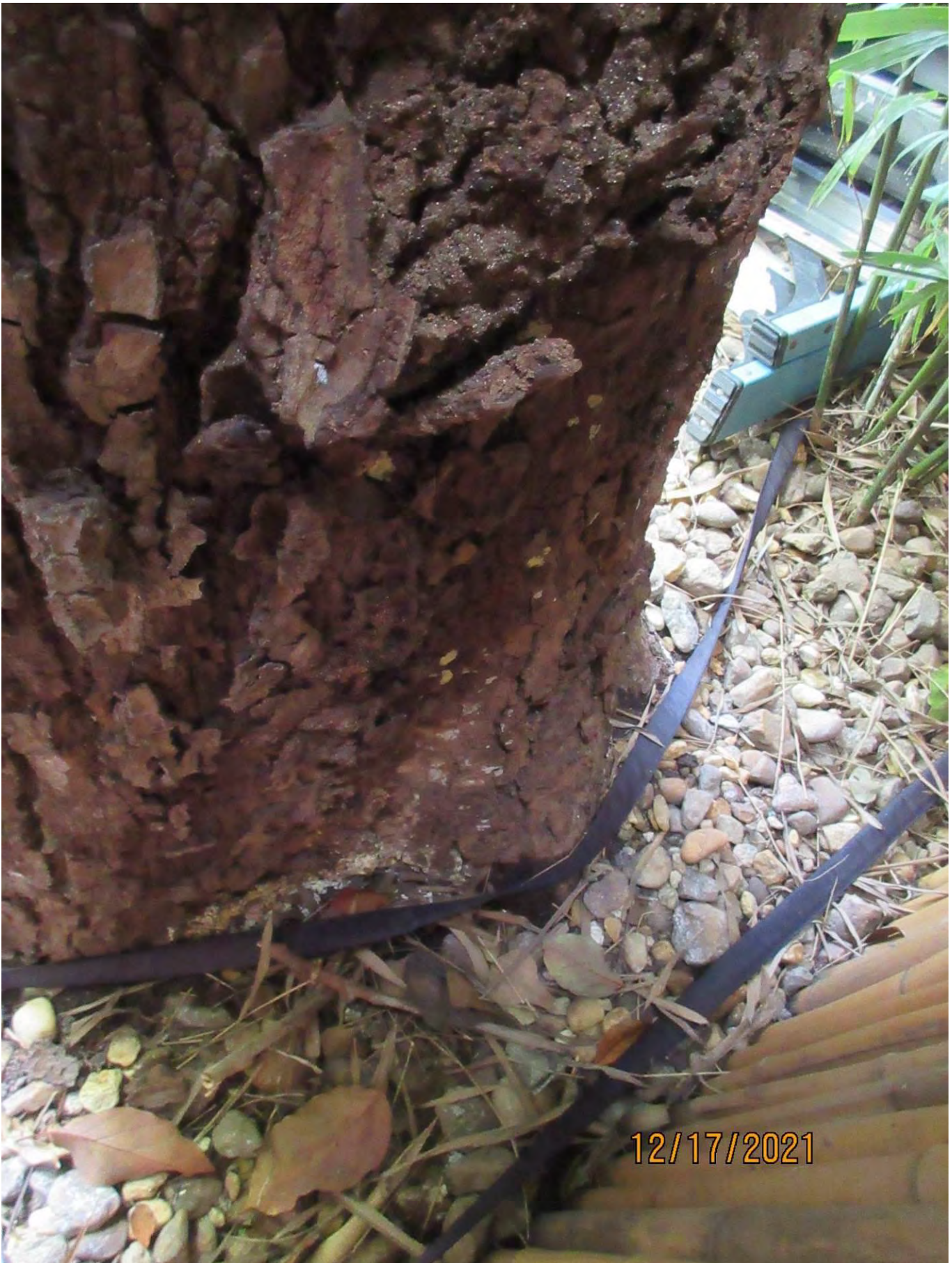
Photo of damaged bark/diseased area with termite dirt, view 1.