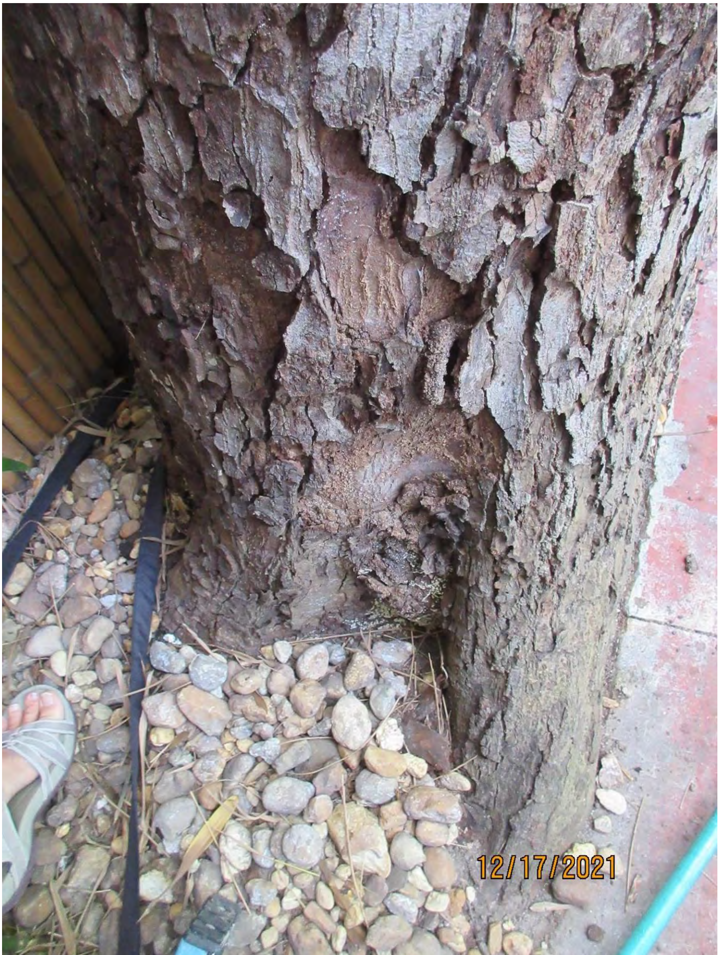
Close up photo of damaged/diseased bark area, view 2.