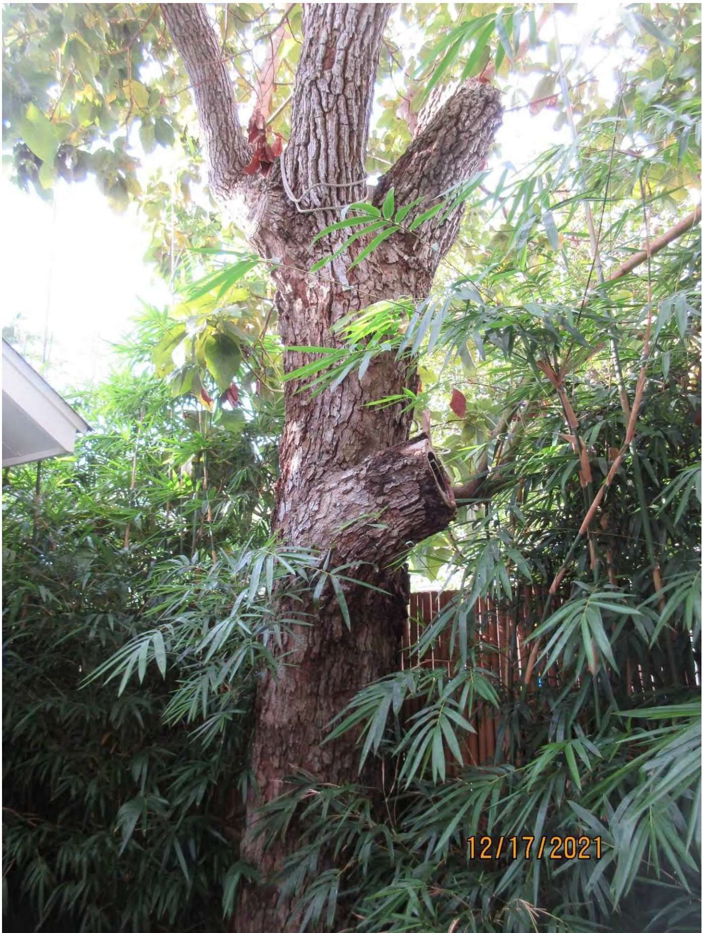
Photo of tree trunk and canopy branches.