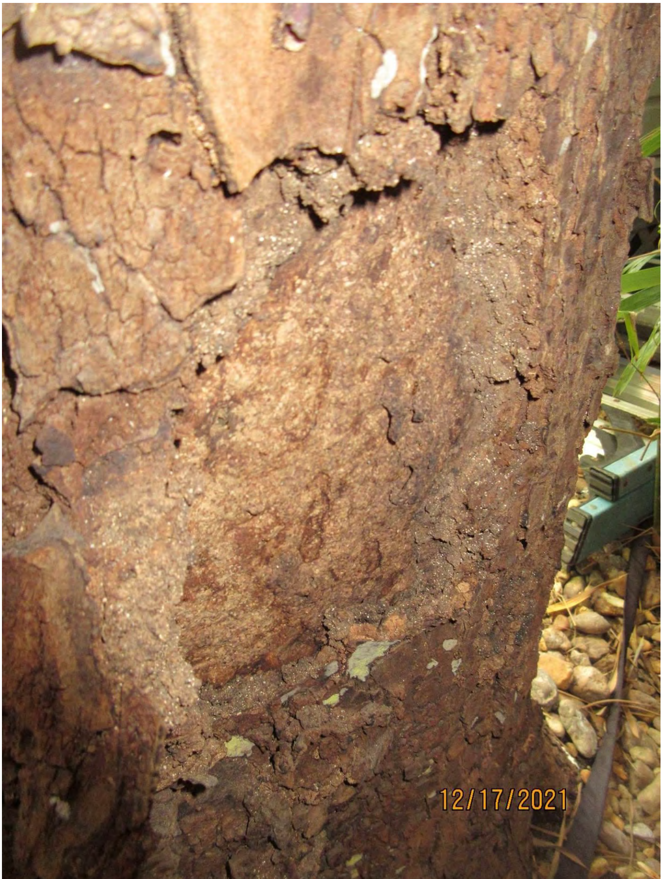
Photo of damaged bark/diseased area with termite dirt, view 2.