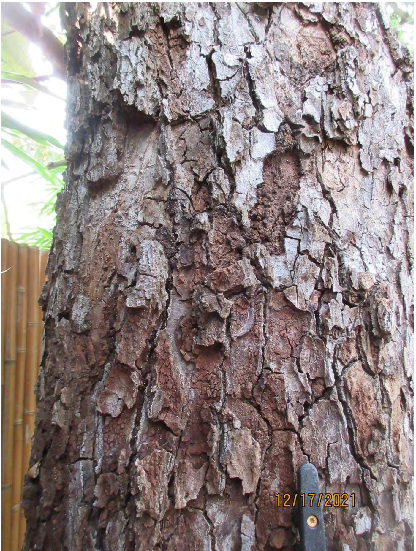
Close up of termite trail areas in bark.