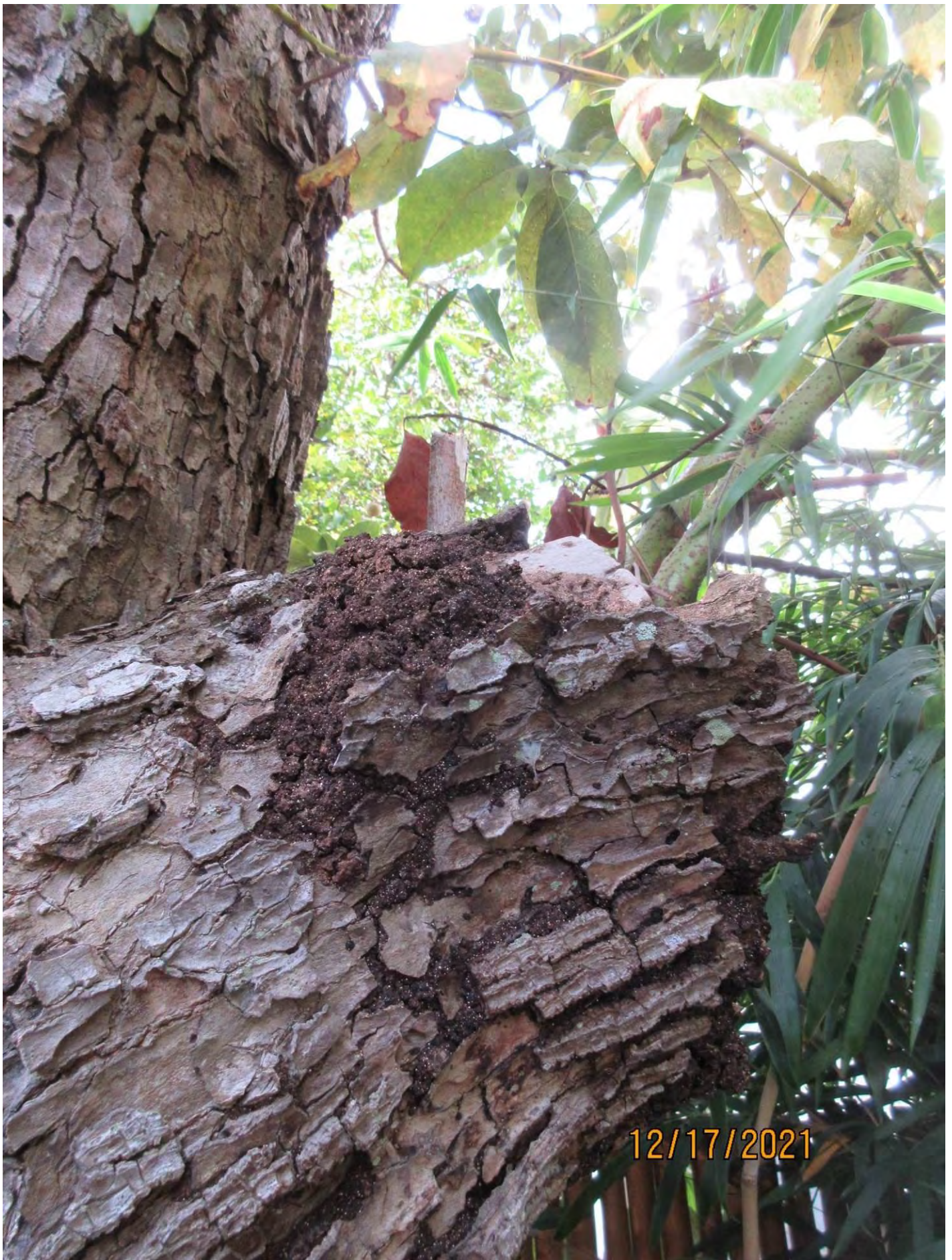
Photo of termites dirt on old canopy cut area.