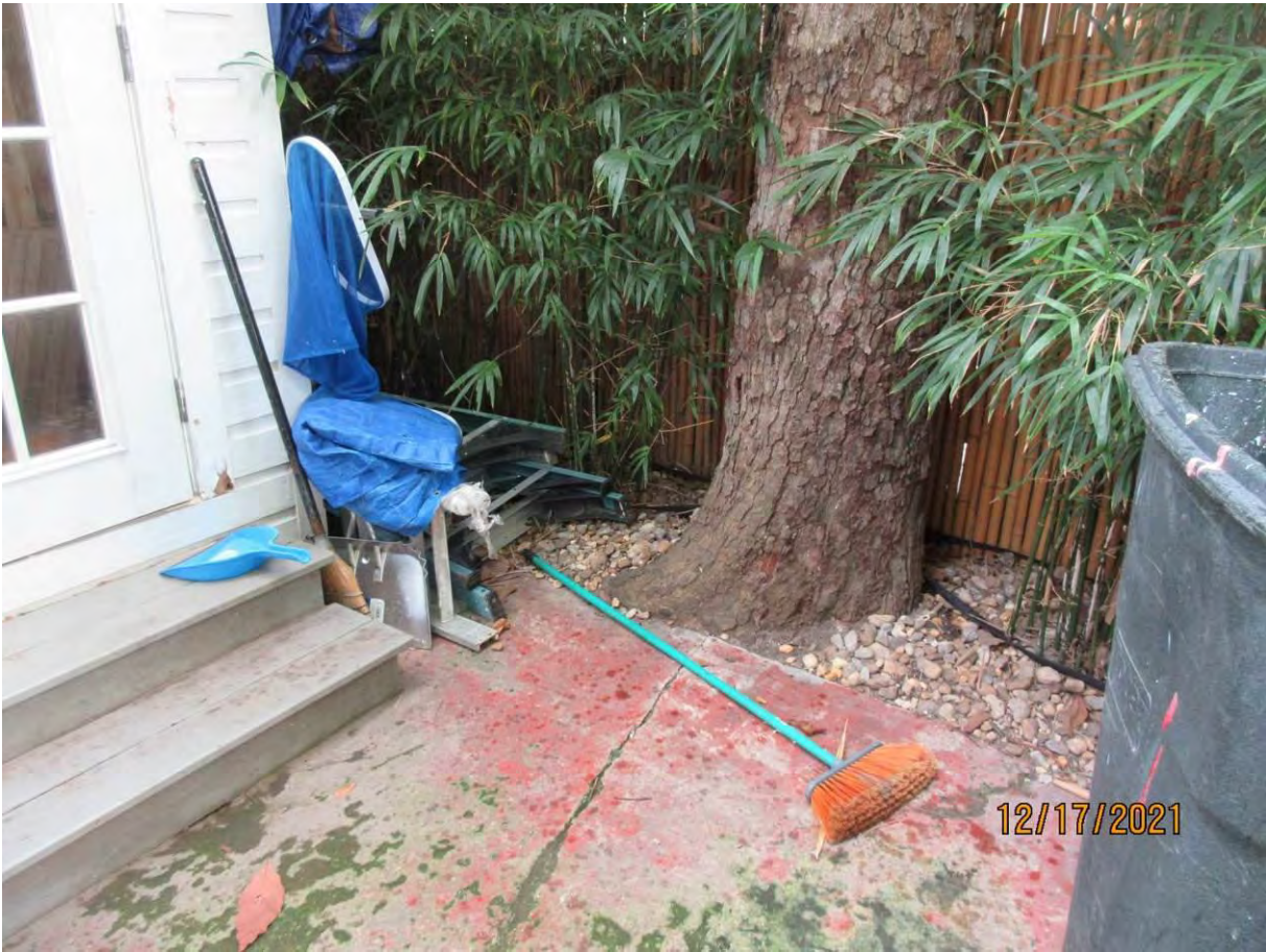
Photo of base of tree.