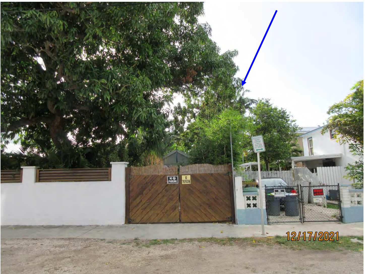
Photo showing location of tree.

Tree Species: Avocado ( Persea americana )