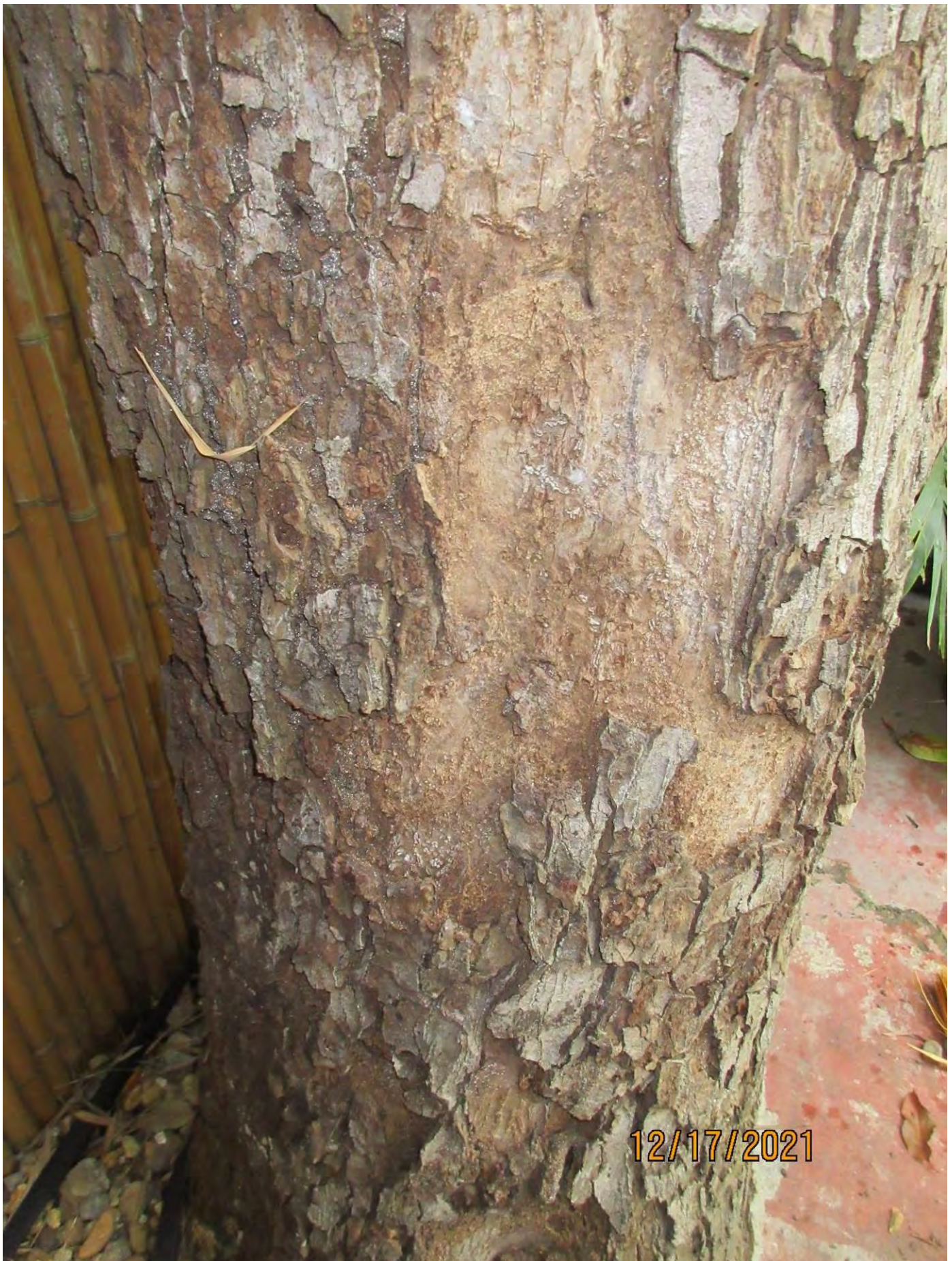
Close up photo of damaged/diseased bark area, view 1.