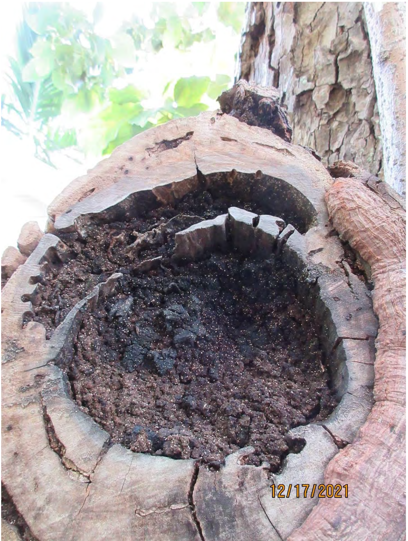
Photo of termites dirt in old canopy cut area, view 1.