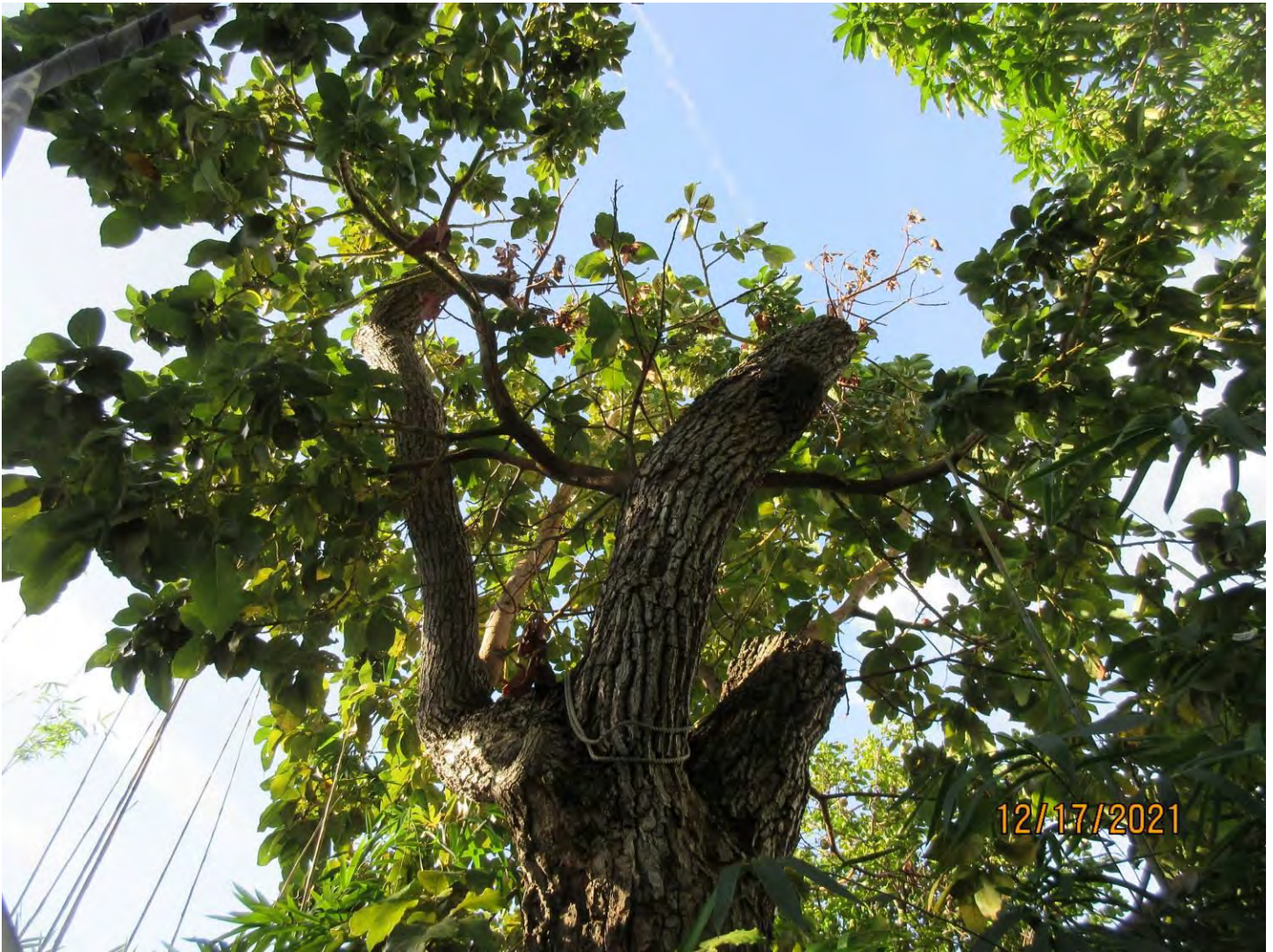
Photo of tree canopy, view 2.