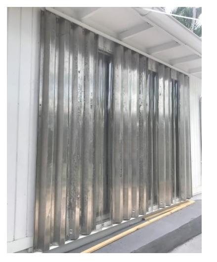
Metal/polycarbonate storm panels