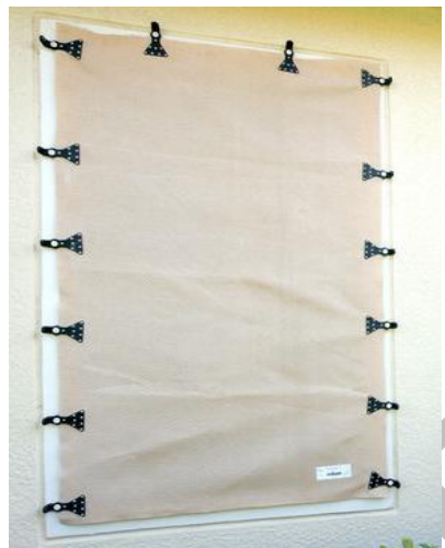
Hurricane fabric/abatement screen