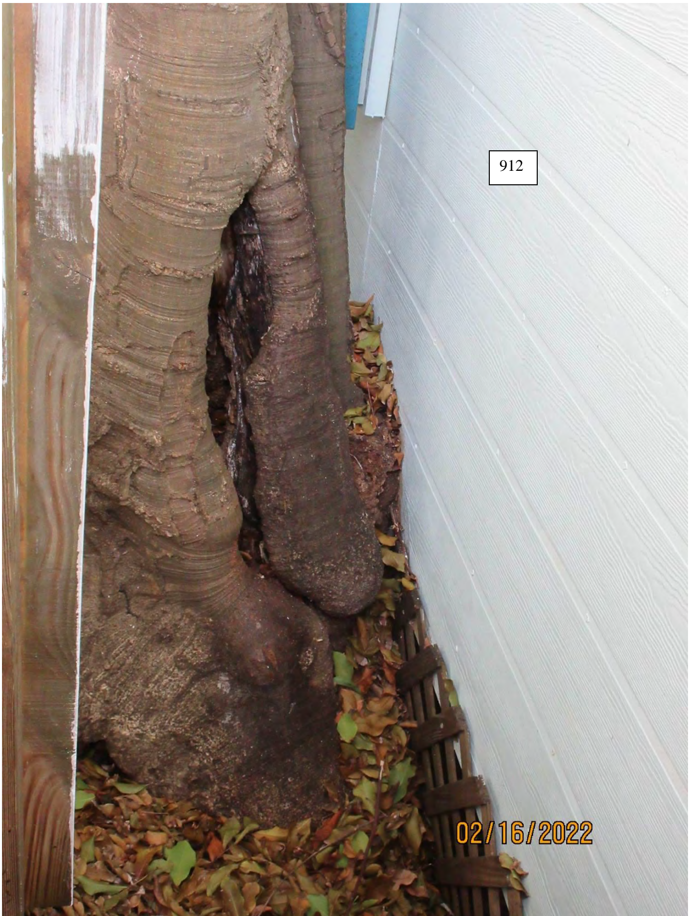
Closeup photo of trunk and base of tree, view 3. Note second decay area.