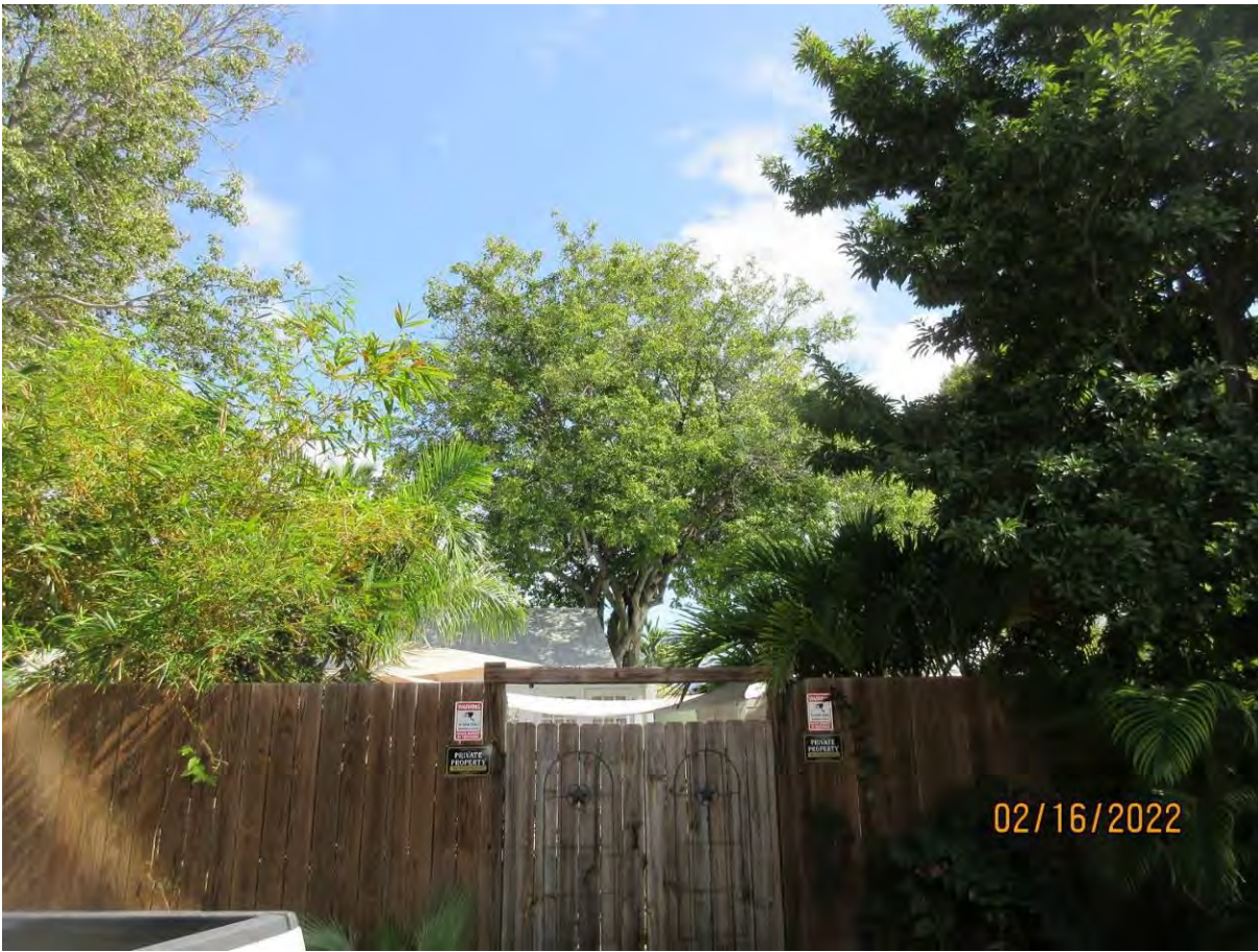
Two photos of tree location and canopy while standing in rear parking area behind properties.