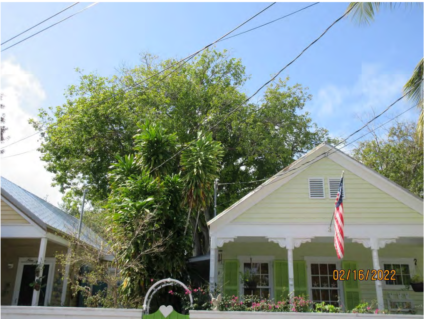
Photo showing location of tree as seen from Windsor Lane (between 908 and 912).

Tree Species: Spanish Lime ( Melicoccus bijugatus )