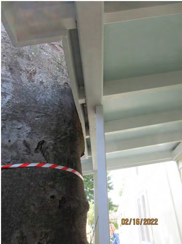
Two photos showing tree trunk growing against side porch area of 908.