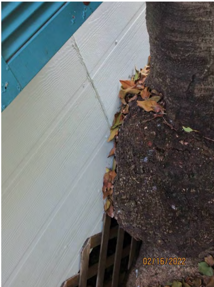
Close up photo of bae of tree and gall area growing against side wall of 912.