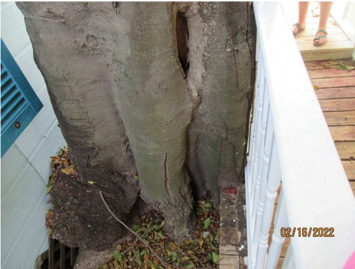
Two photos of base area of tree showing decay hole and gall. Tree is pushing outward against house wall of 912 and side porch area of 908.