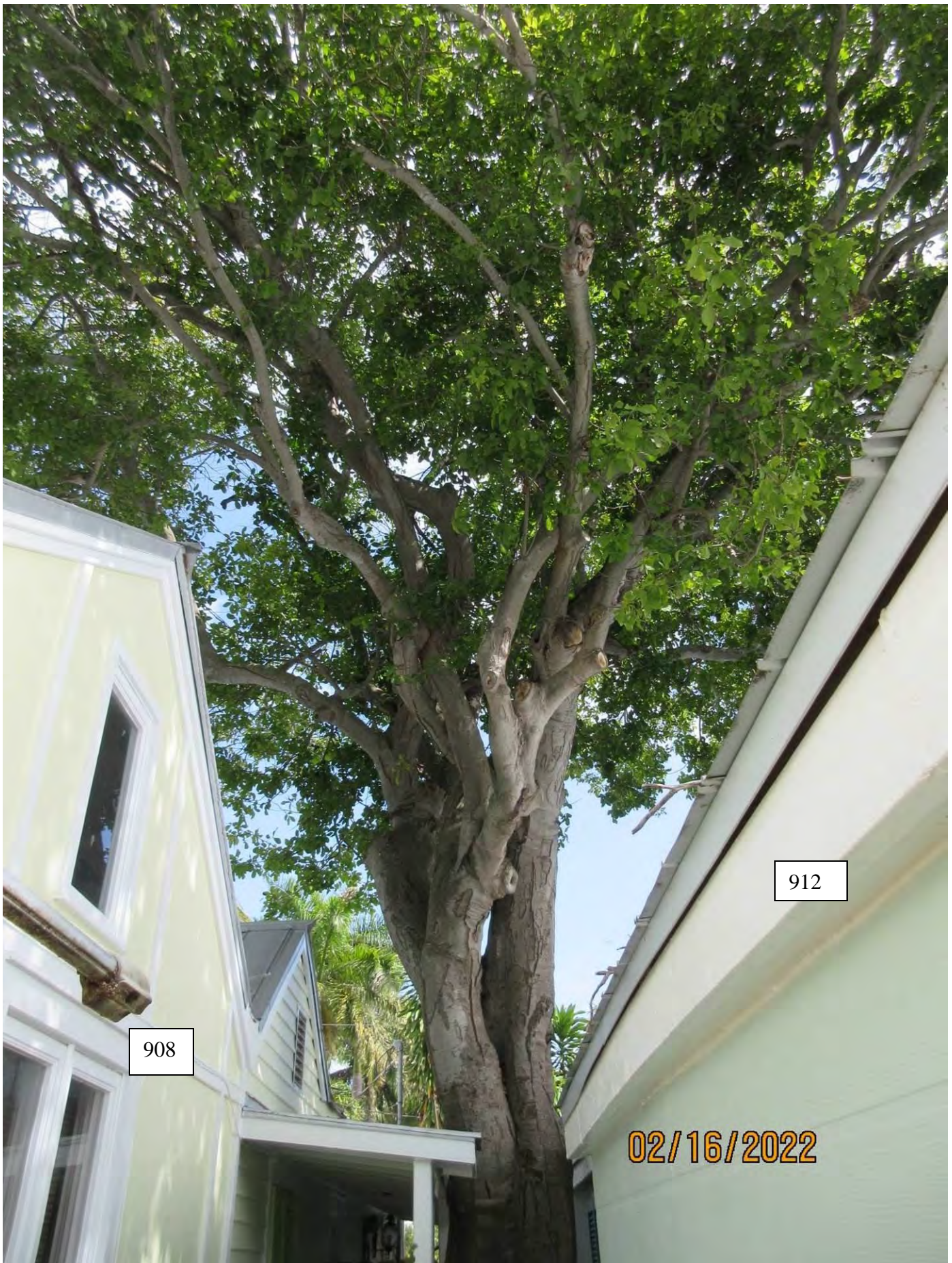
Photo of tree trunk and canopy, view 1.