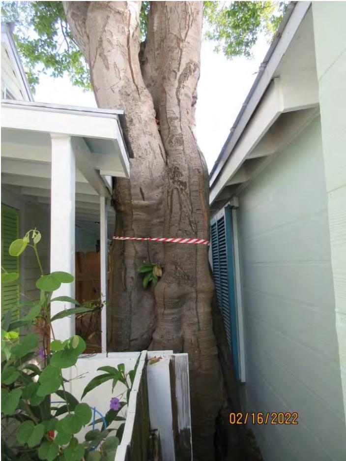
Photo of trunk and base of tree, view 2.