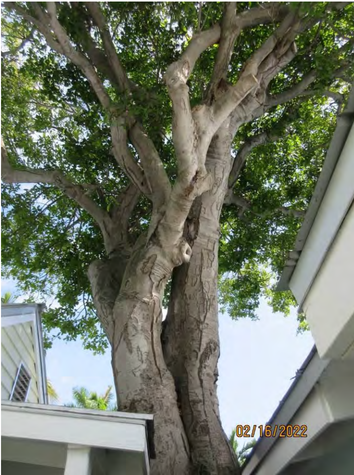
Photo of tree canopy and trunk, view 2.