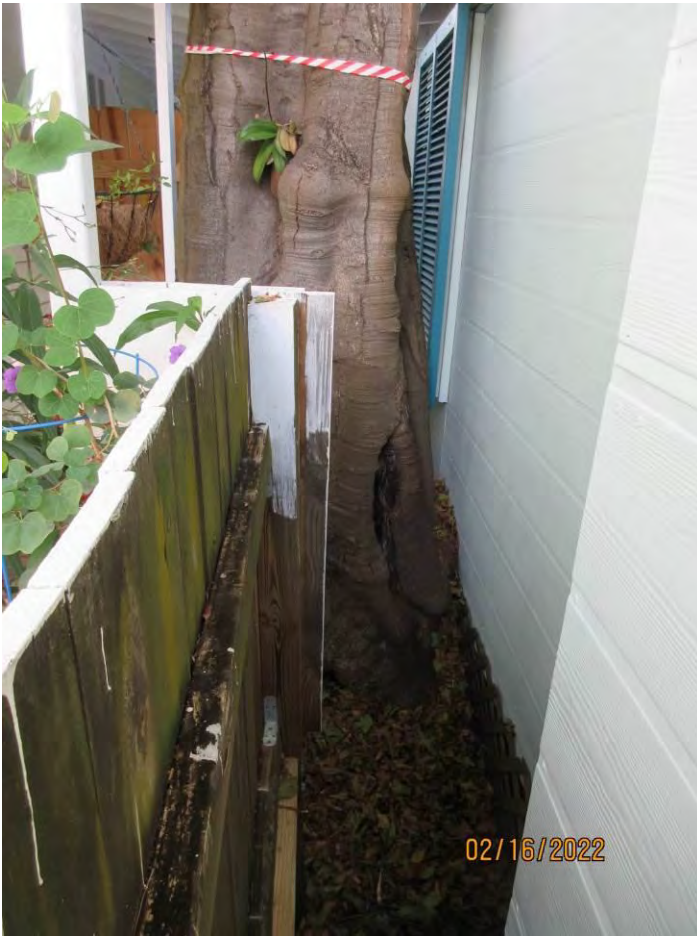
Photo of trunk and base of tree, view 3.