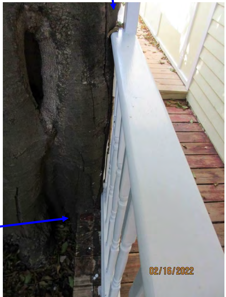
Photo showing trunk of tree growing on side porch area of 908.