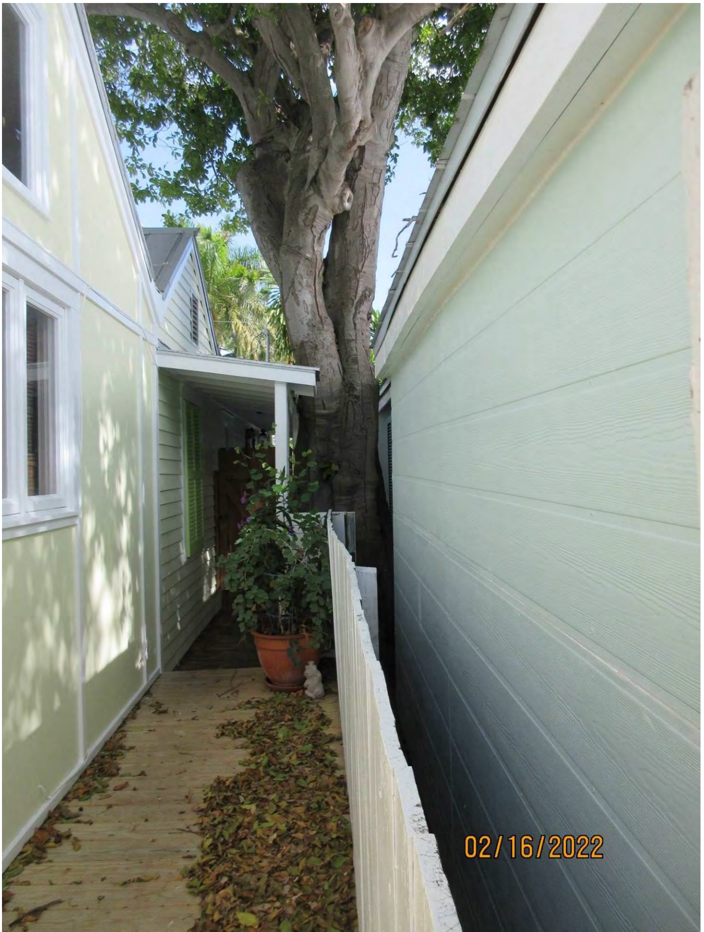
Photo of trunk and base of tree, view 1.