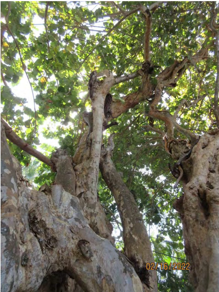
Photo of tree canopy showing central main trunk branch structure, view 1.