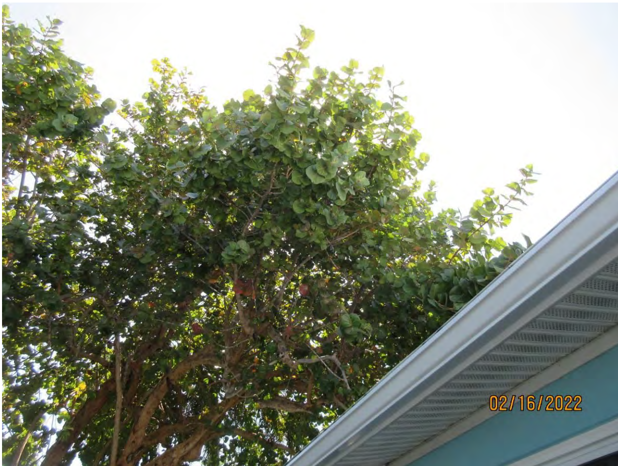
Photo of tree canopy, view 2.