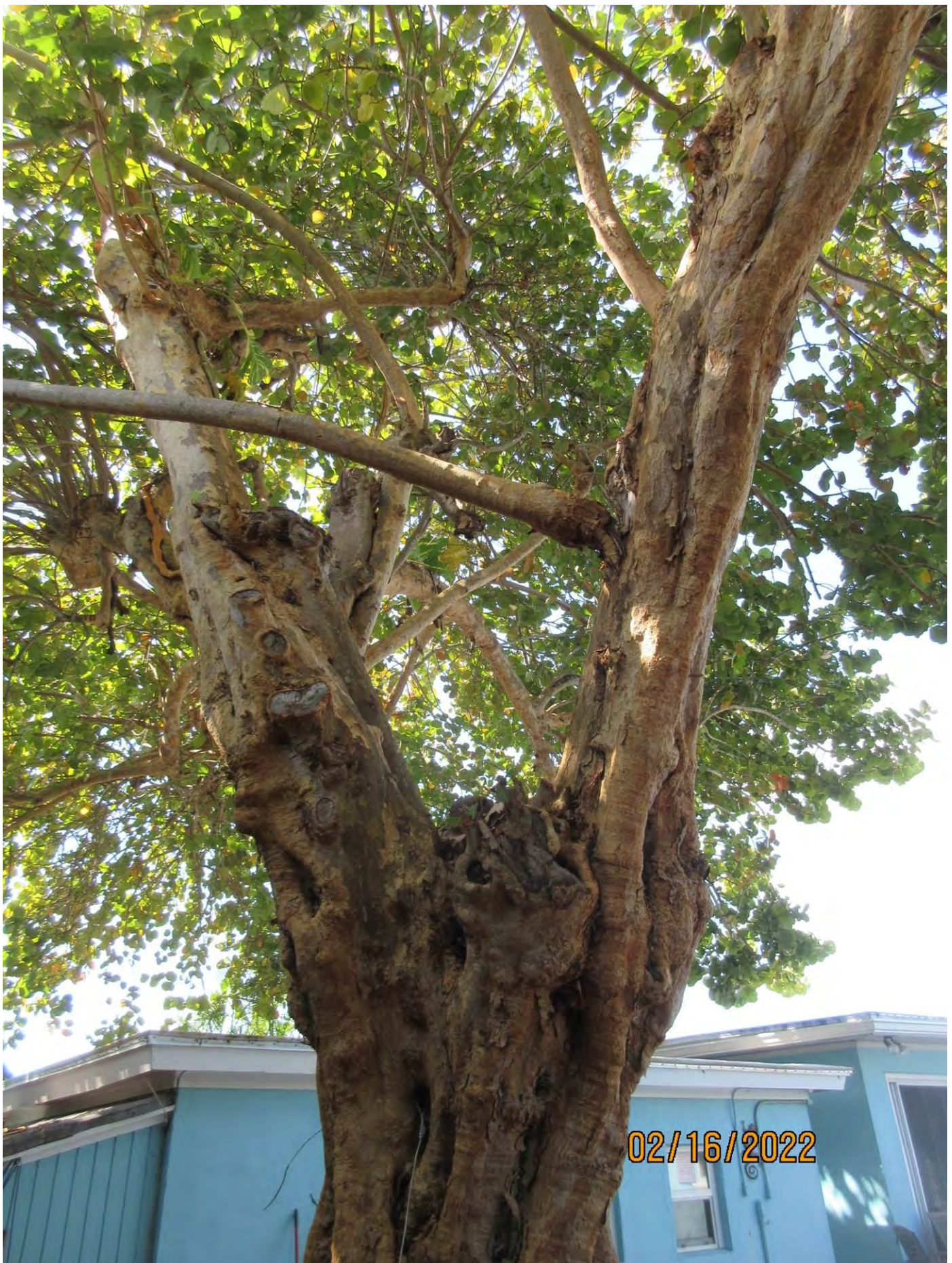
Photo of main trunk structure, view 2.