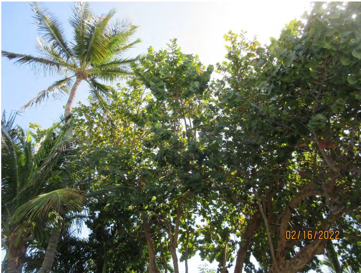
Photo of tree canopy, view 1.