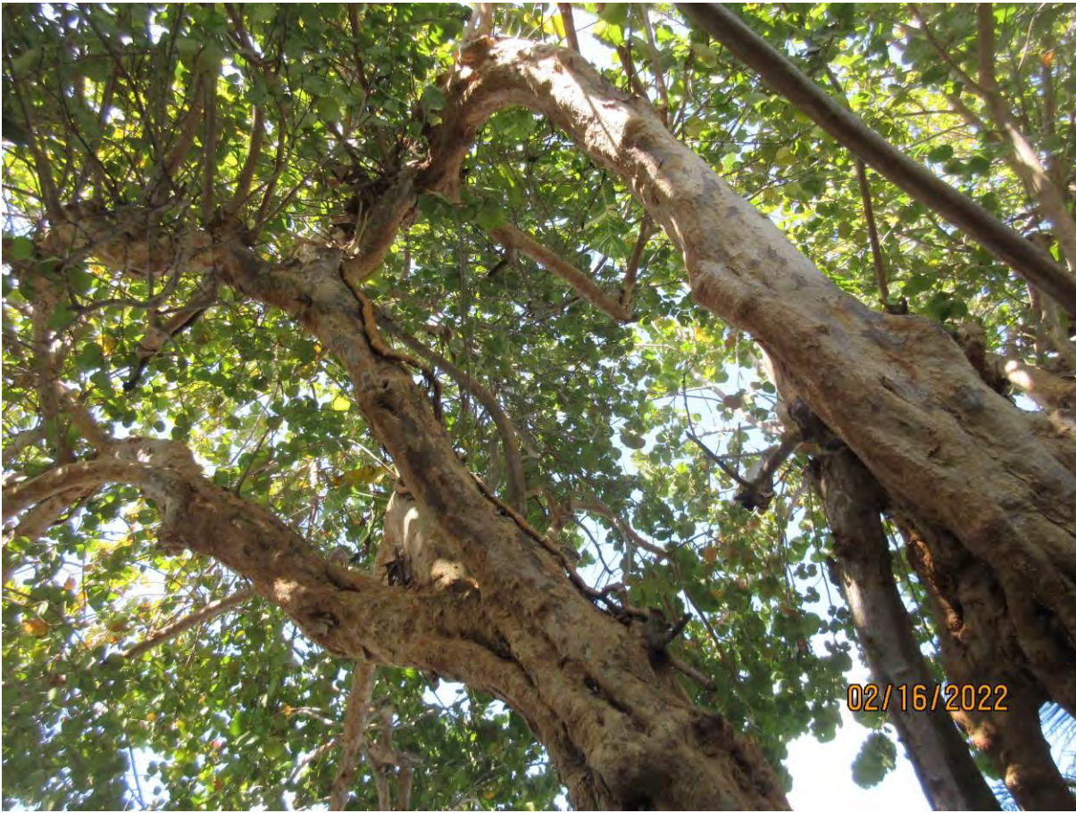
Two photos of tree canopy showing main trunk branches, view 3.