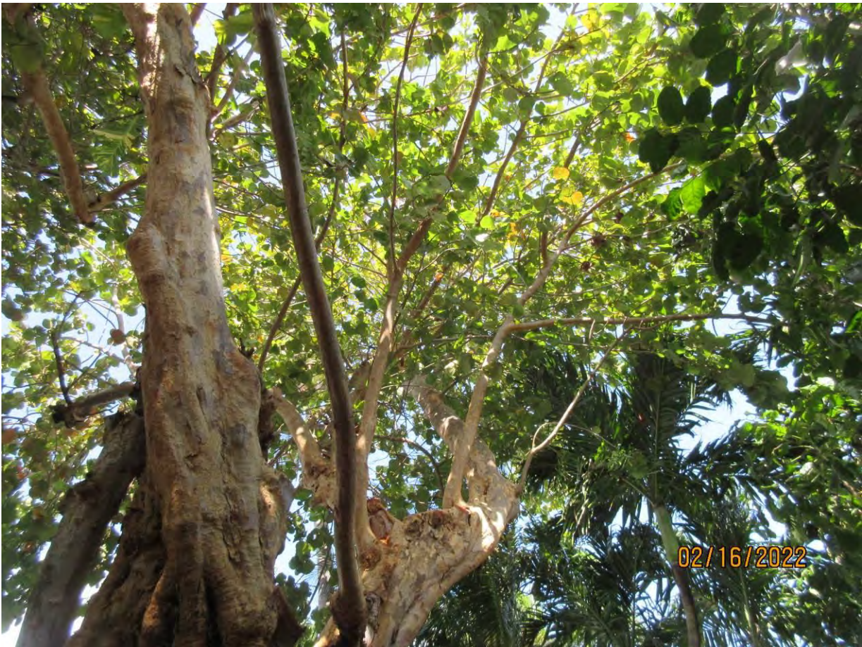
Photo of tree canopy showing main trunk branches, view 2.