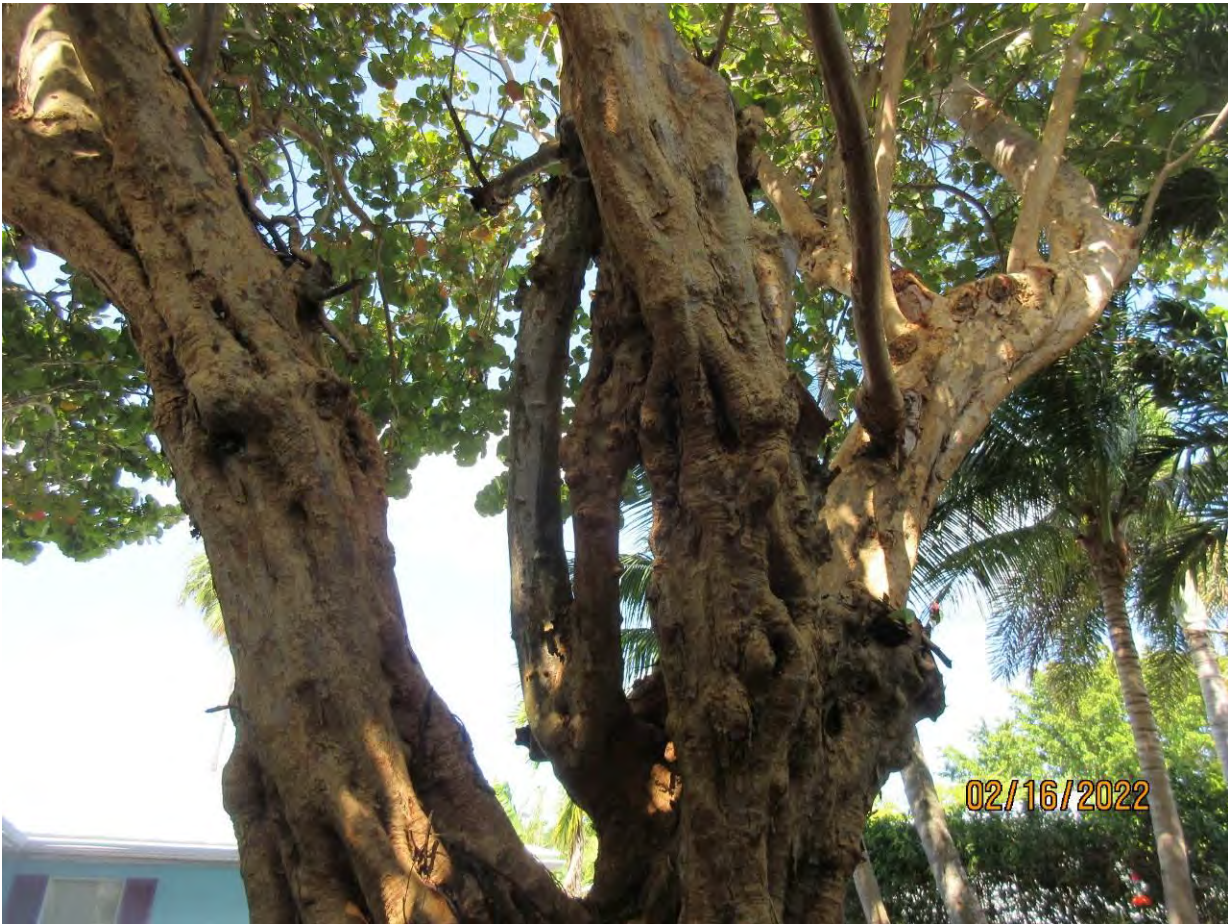
Photo of main trunk structure, view 1.