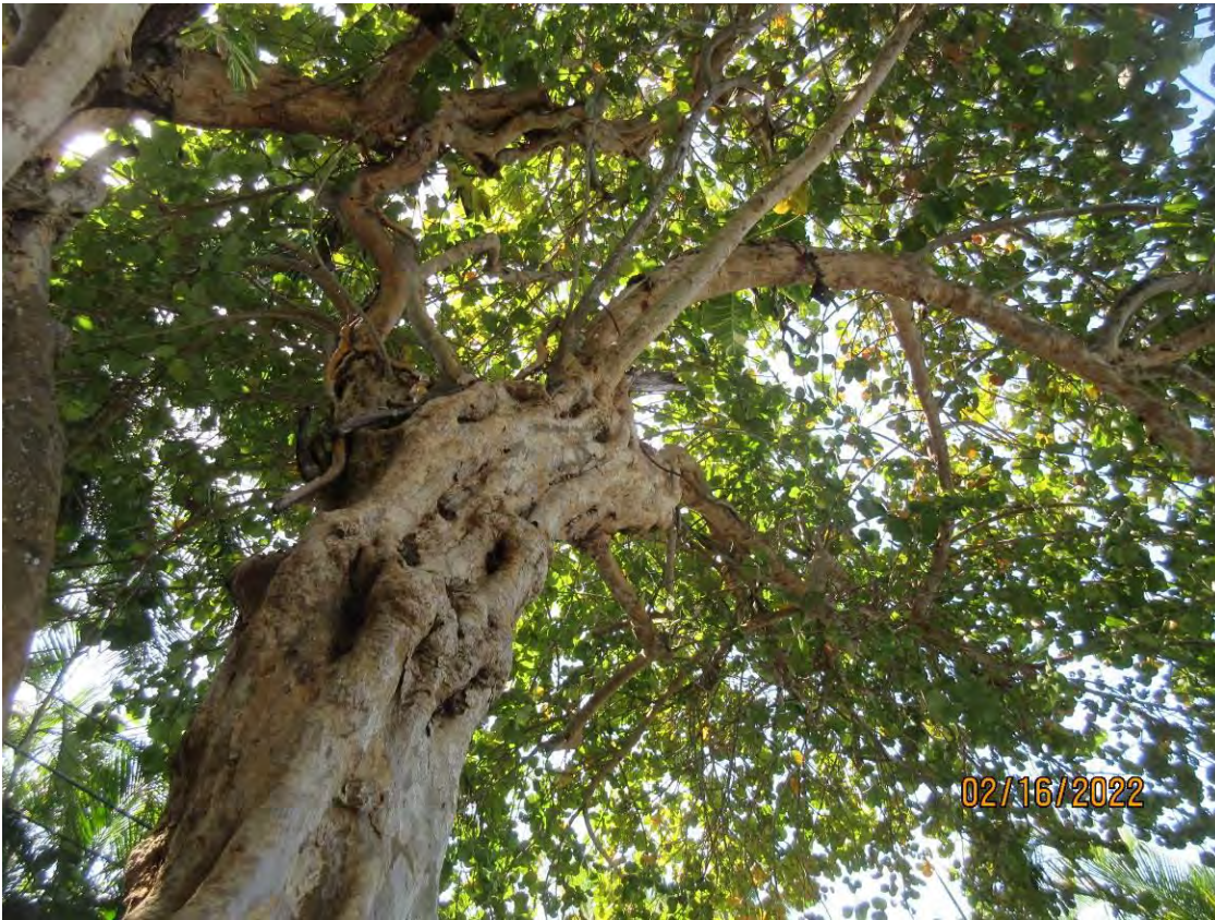
Photo of tree canopy showing main trunk branch that grows over structure, view 1.