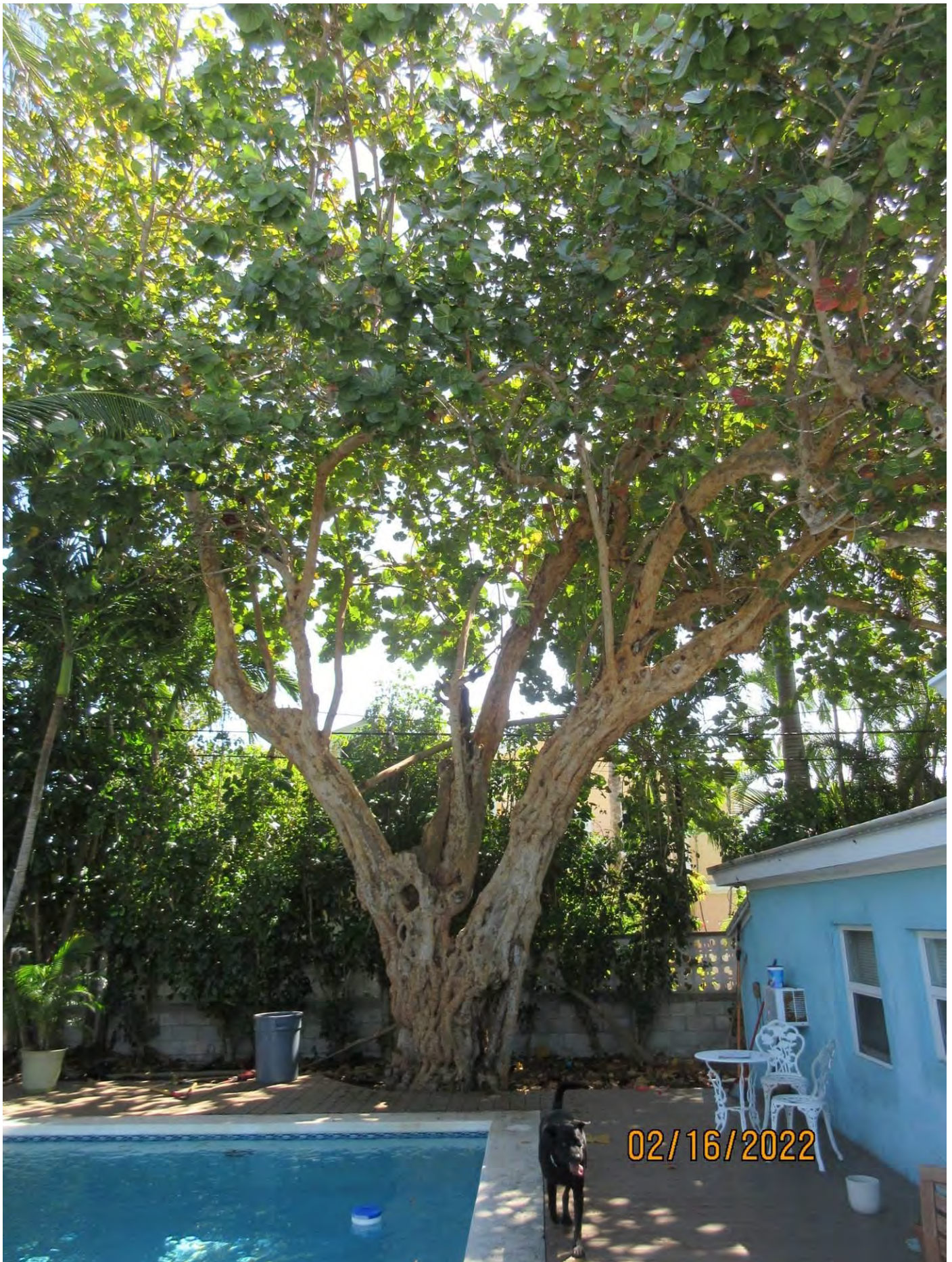
Photo showing whole tree.