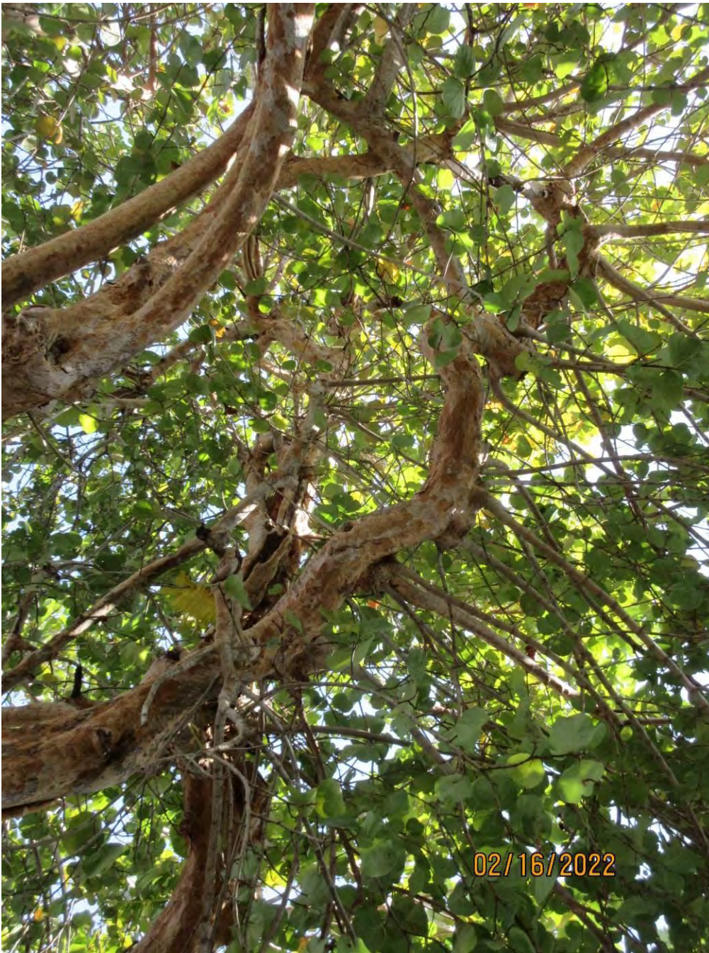
Photo of tree canopy, view 4.