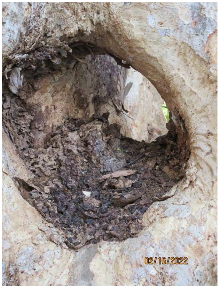
Close up photo of “void” area with evidence of insect issues (decayed wood and frass).