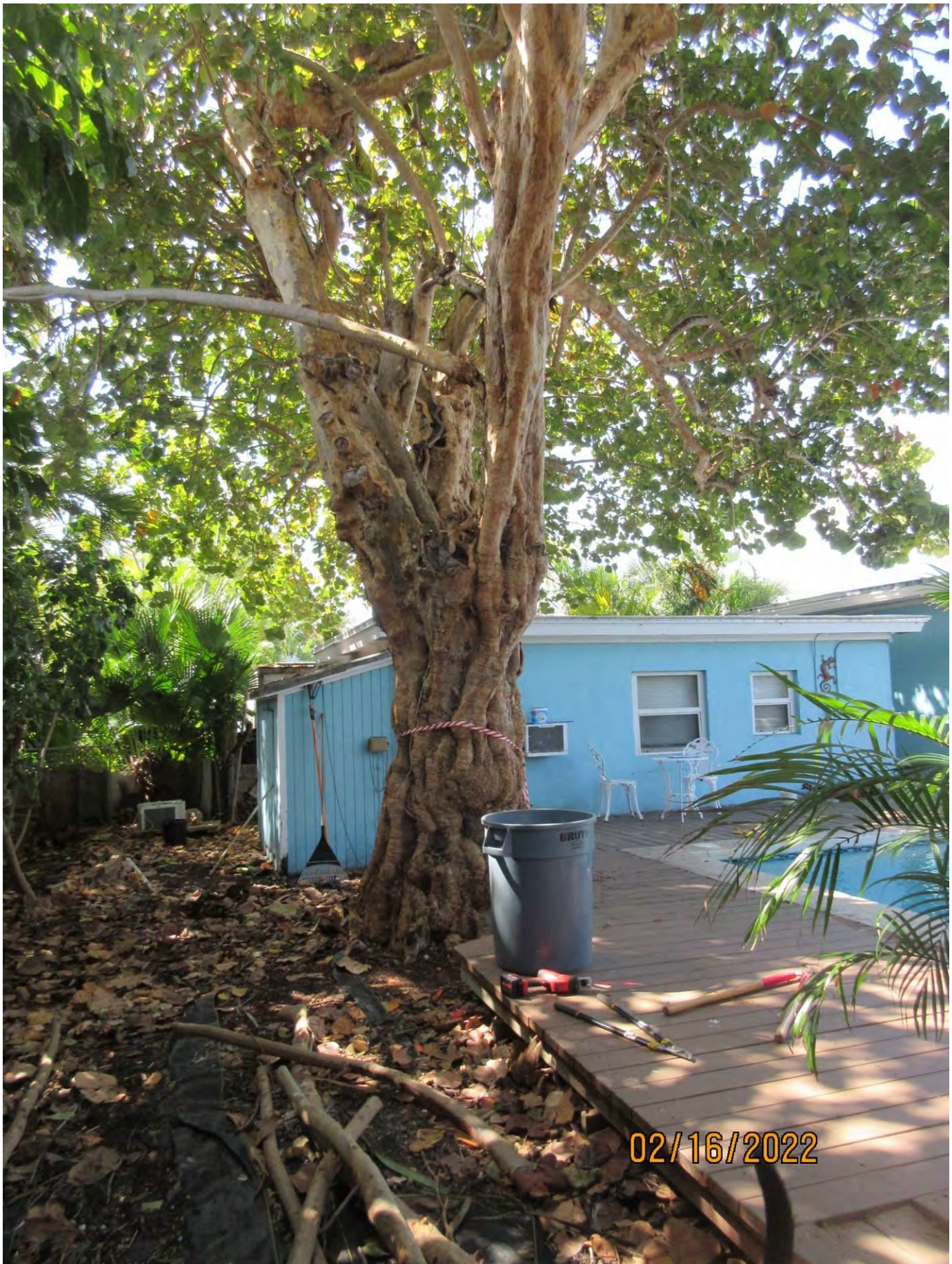
Photo of trunk and base of tree, view 2.