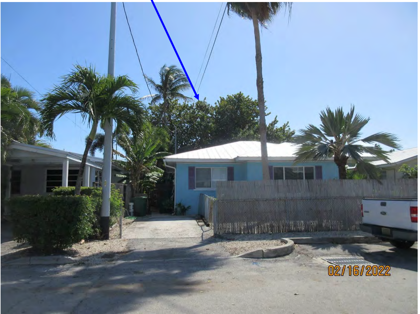
Photo showing location of tree.

Tree Species: Sea Grape ( Coccoloba uvifera )