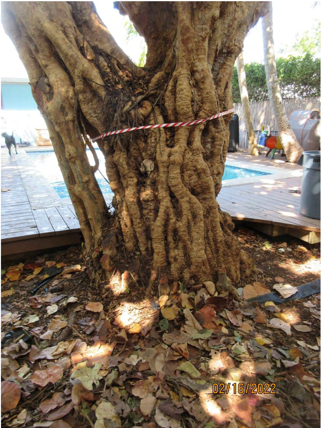
Photo of trunk and base of tree, view 1.