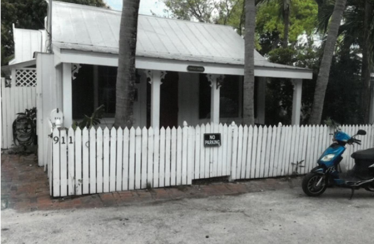
911 Center Street