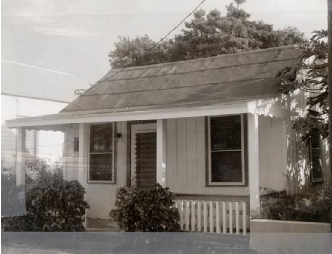
1965 Photo – 911 Center Street

This is a request for an easement pursuant to Section 2-938 (b) (3) of the Code of Ordinances of the City of Key West. The easement request is for a total of 132.3 square feet, more or less, onto the Center Street right-of-way as shown on the attached specific purpose survey. The one-story single-family residential structure is a historic building located within the Key West Historic District and was built circa 1918.