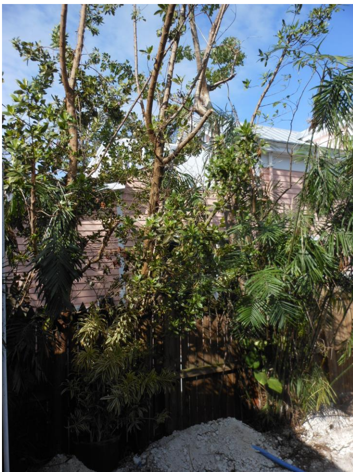
Photo showing tree trunk in relation to buttonwoods.