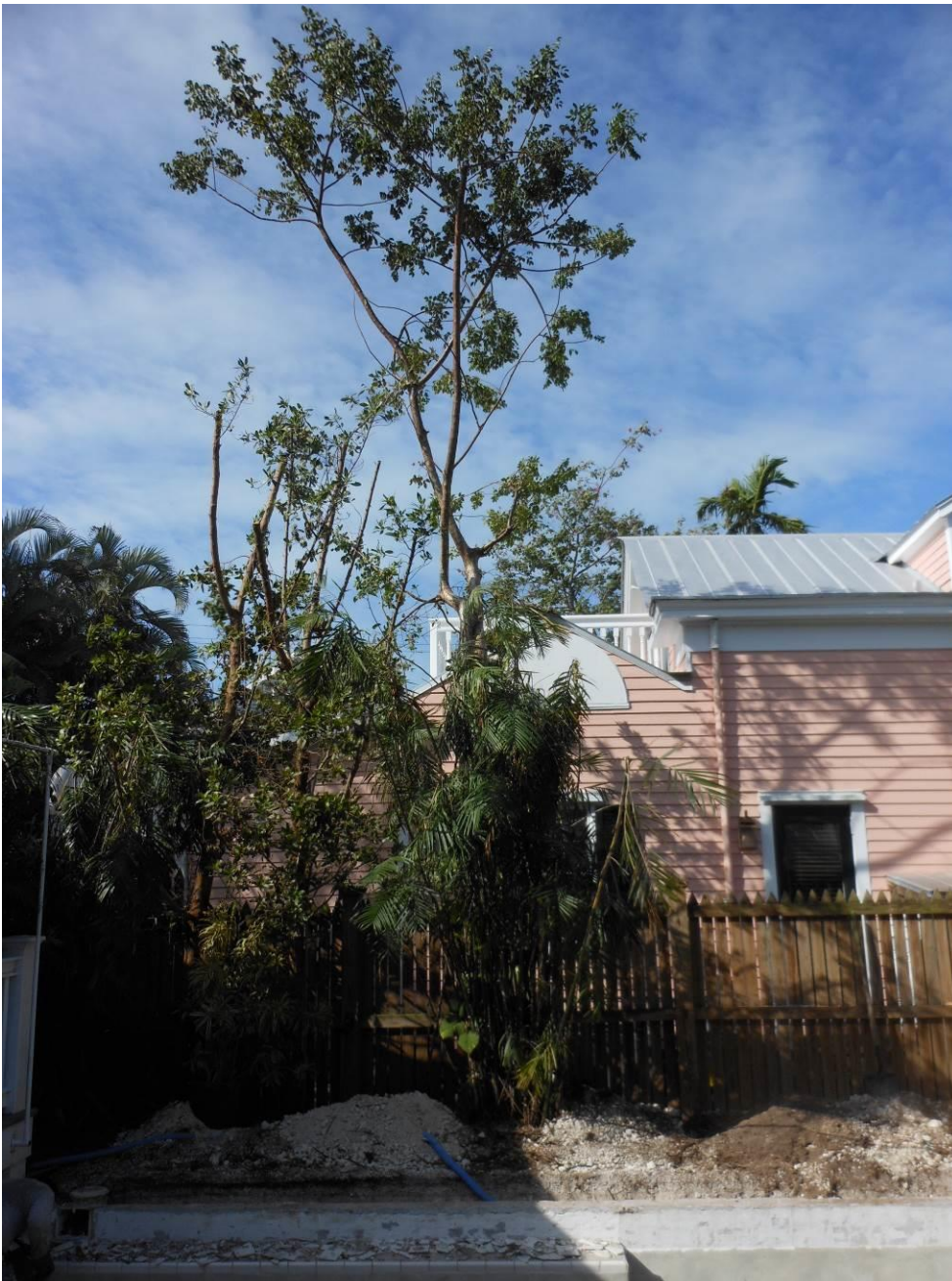
Photo of whole tree.

Tree Species: Gumbo Limbo ( Bursera simaruba )