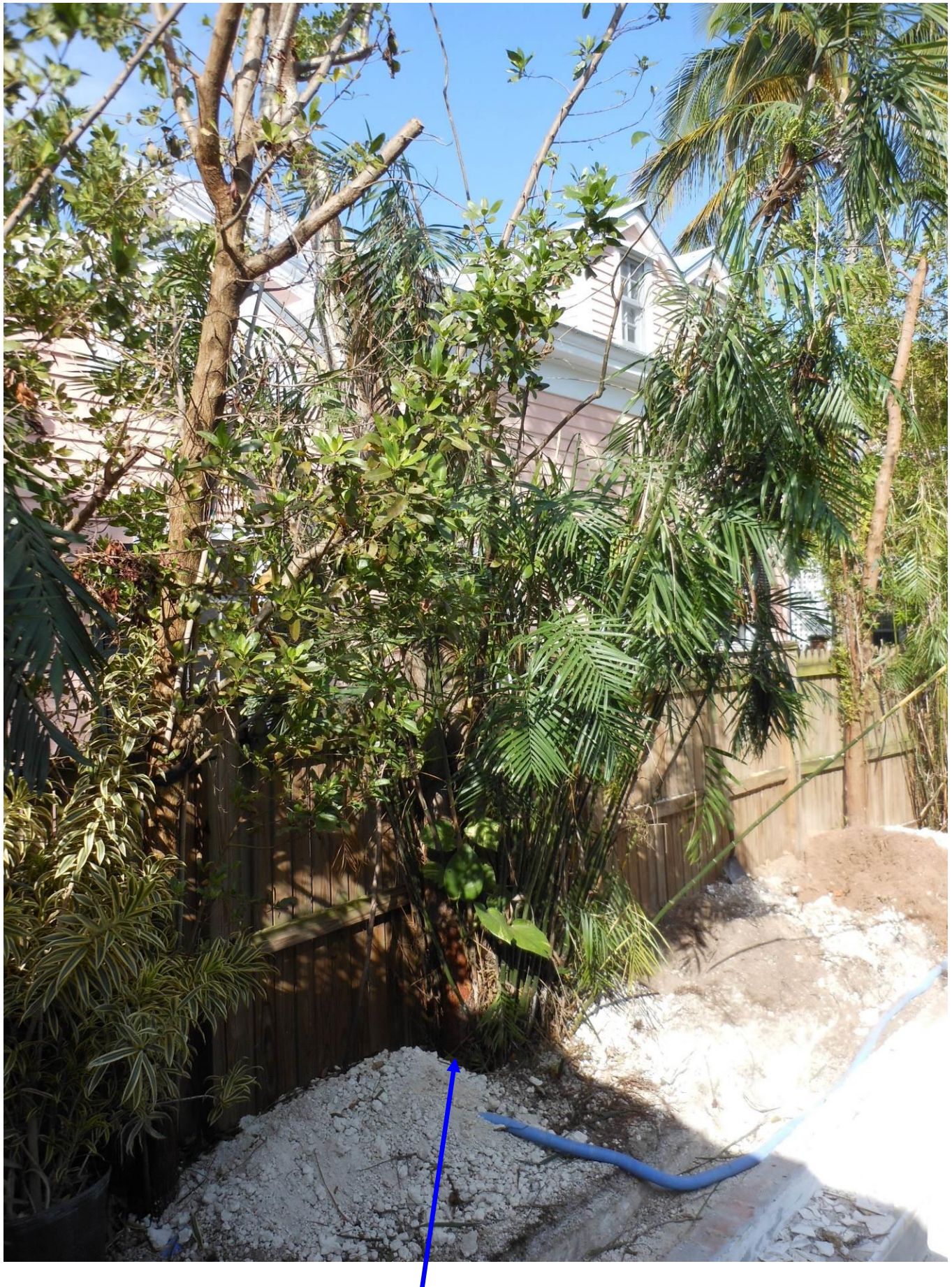
Photo of tree showing location close to property line fence.