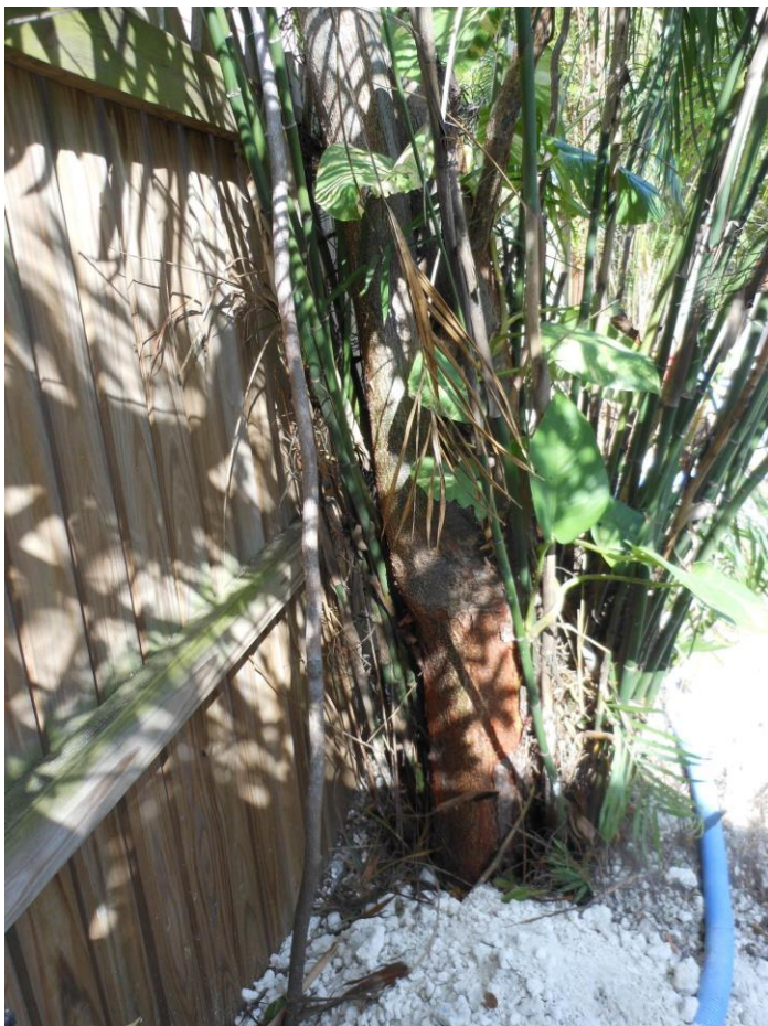
Close up photos of base of tree next to property line fence.