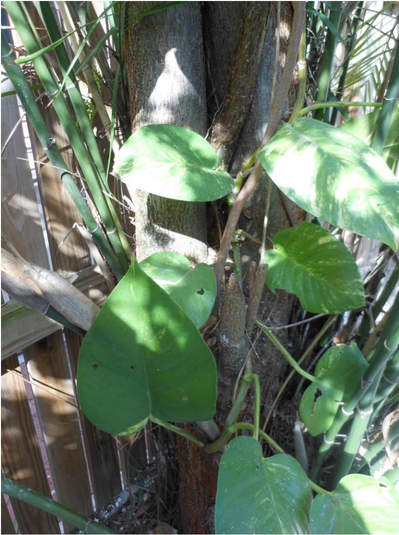
Close up photo of base of tree showing multiple trunks.