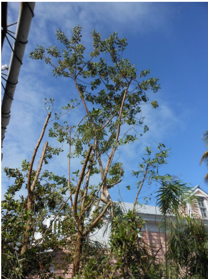
Photo of tree canopy with recently trimmed buttonwood tree canopies.