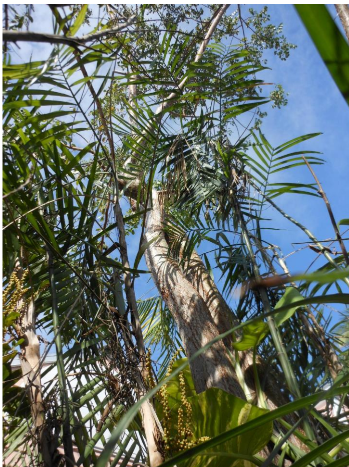
Photo of tree trunks.