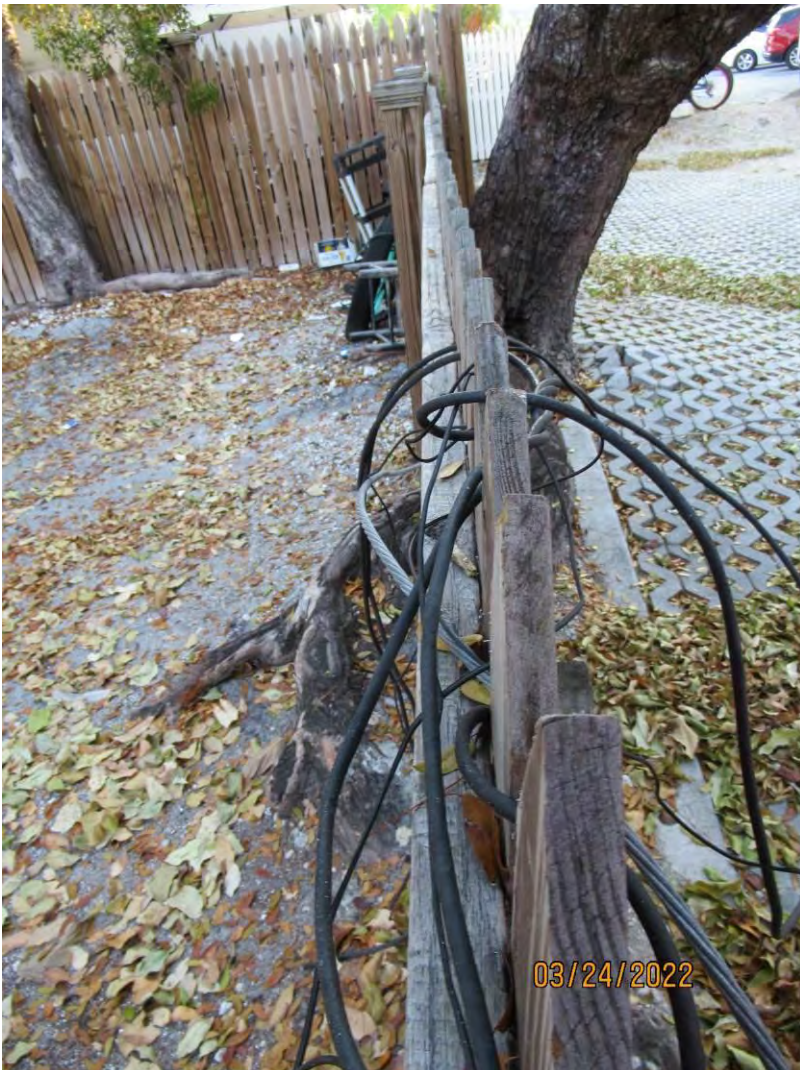
Two photos showing base of tree and root system.