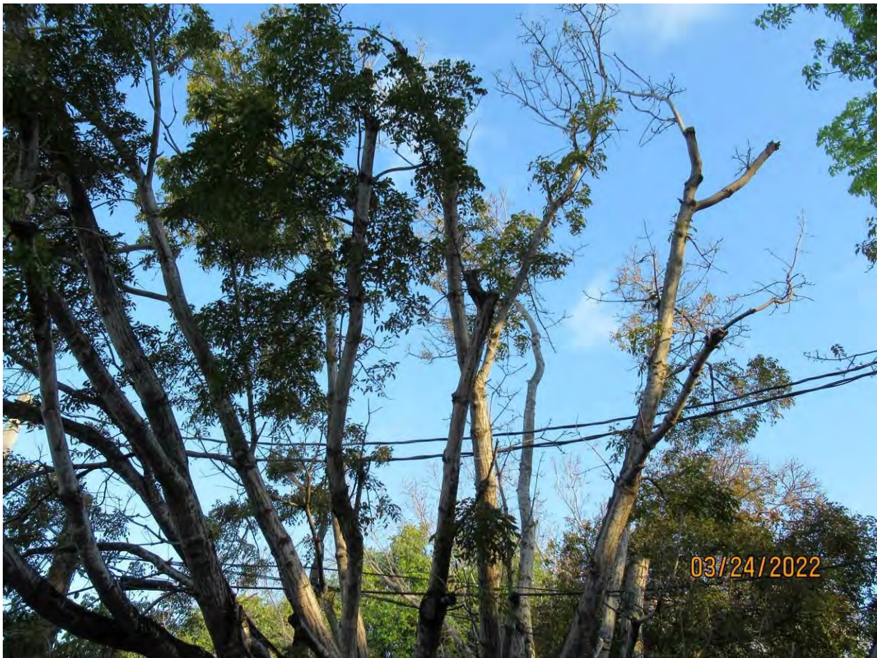
Photo of canopy branches, view 2.