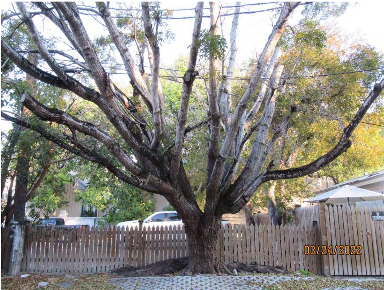
Photo of whole tree, view 3.