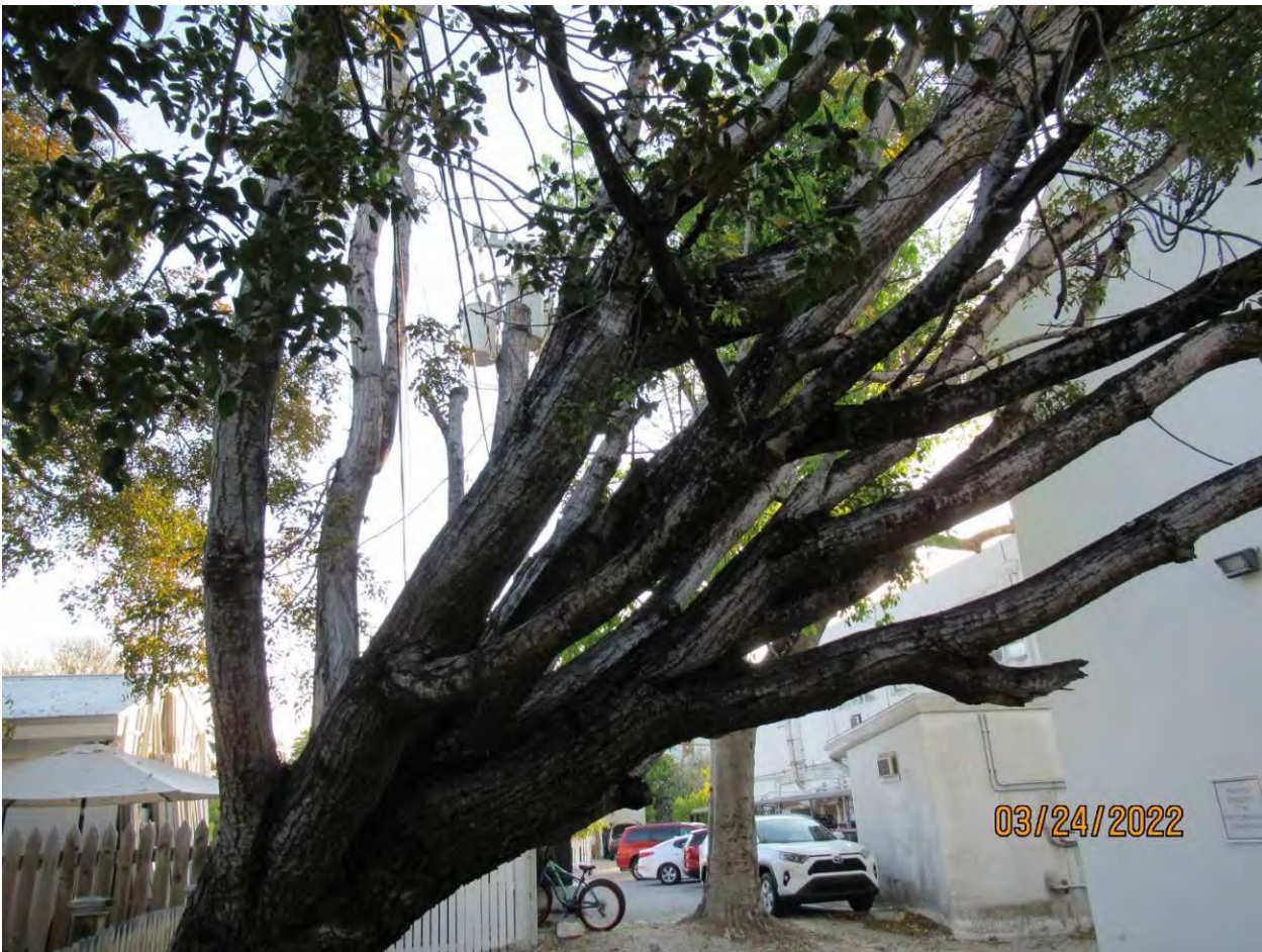
Two photos showing canopy trunks.