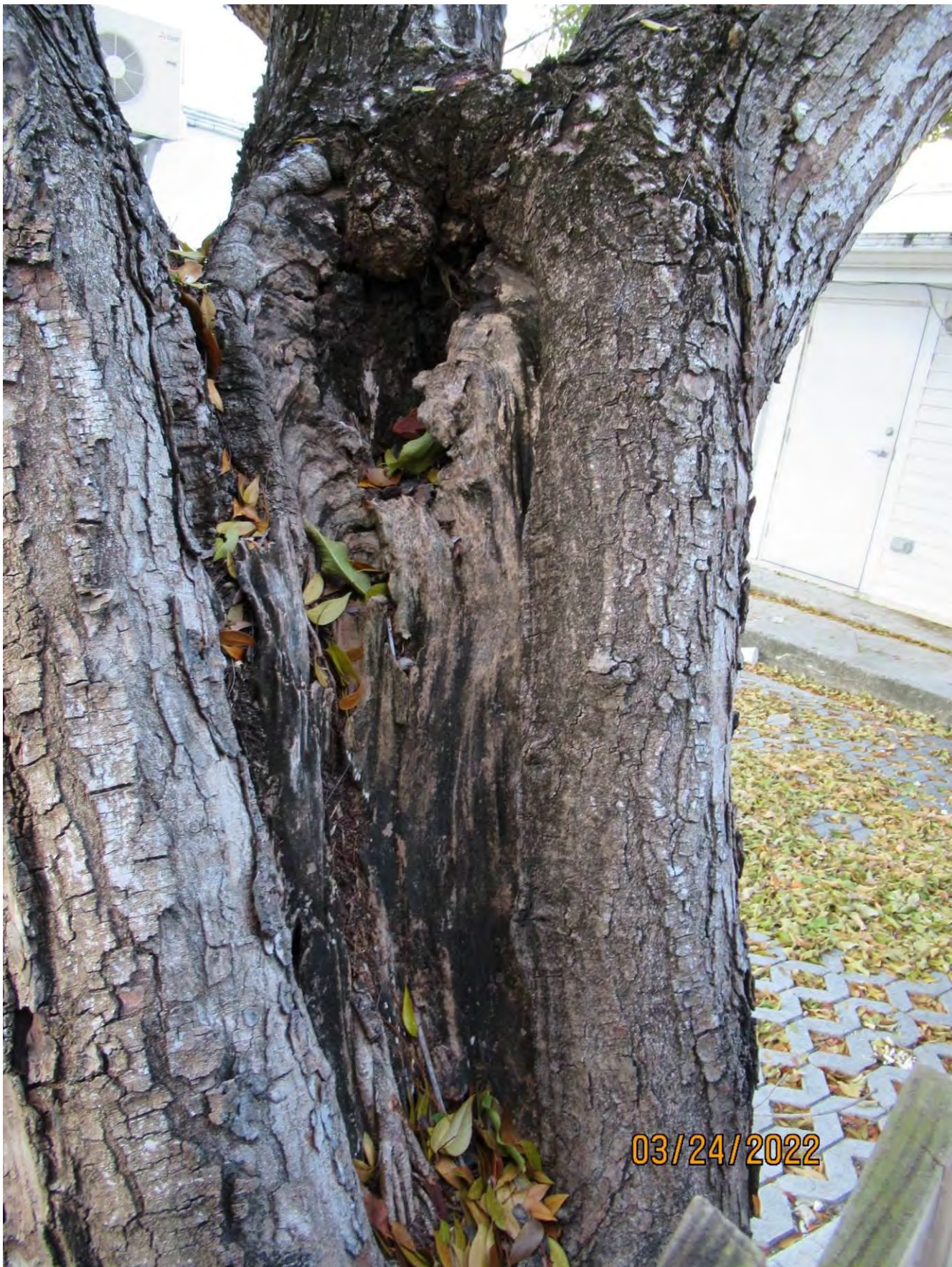
Old tear/decay area in main trunk.