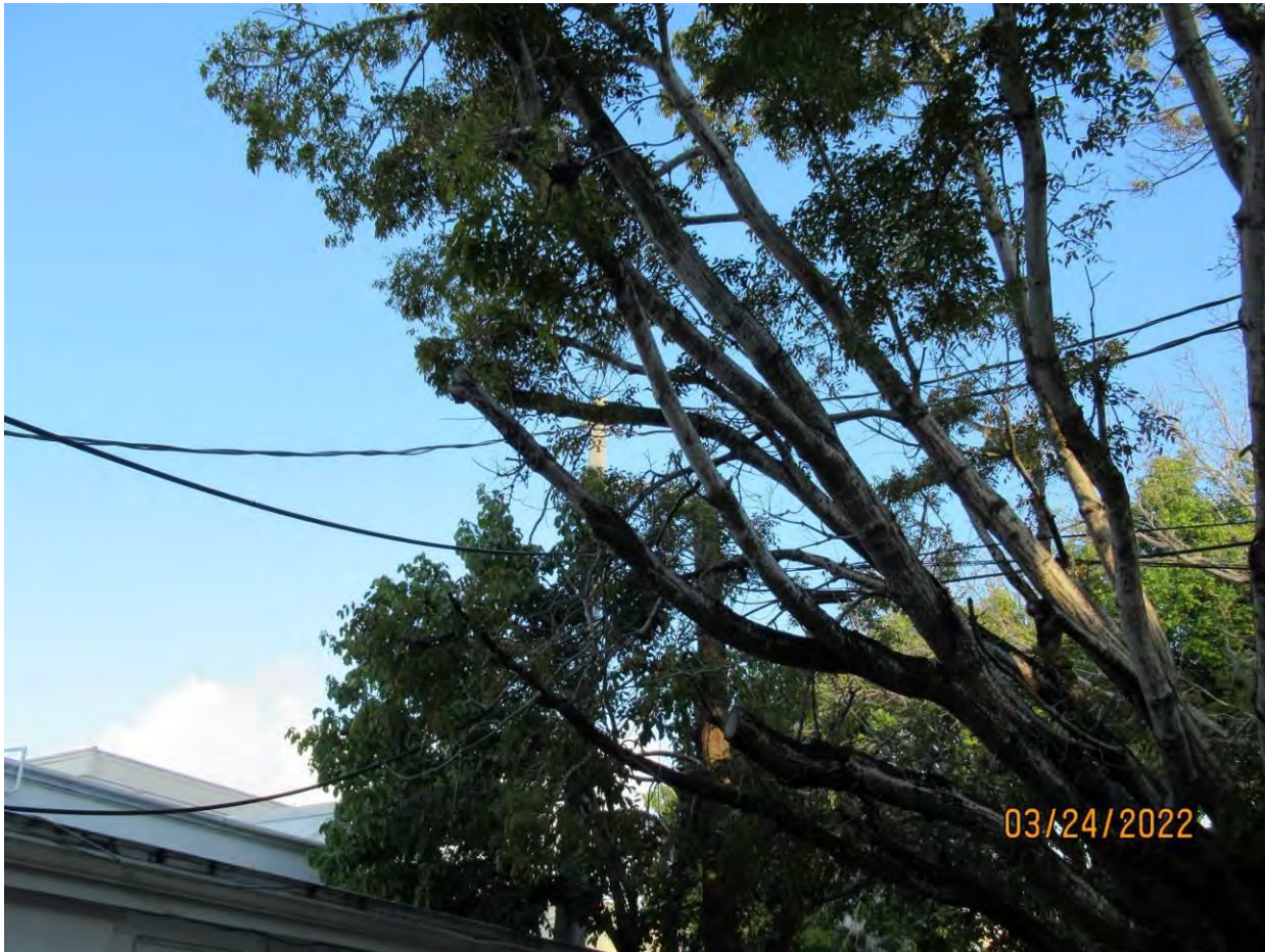
Photo of canopy branches, view 1.