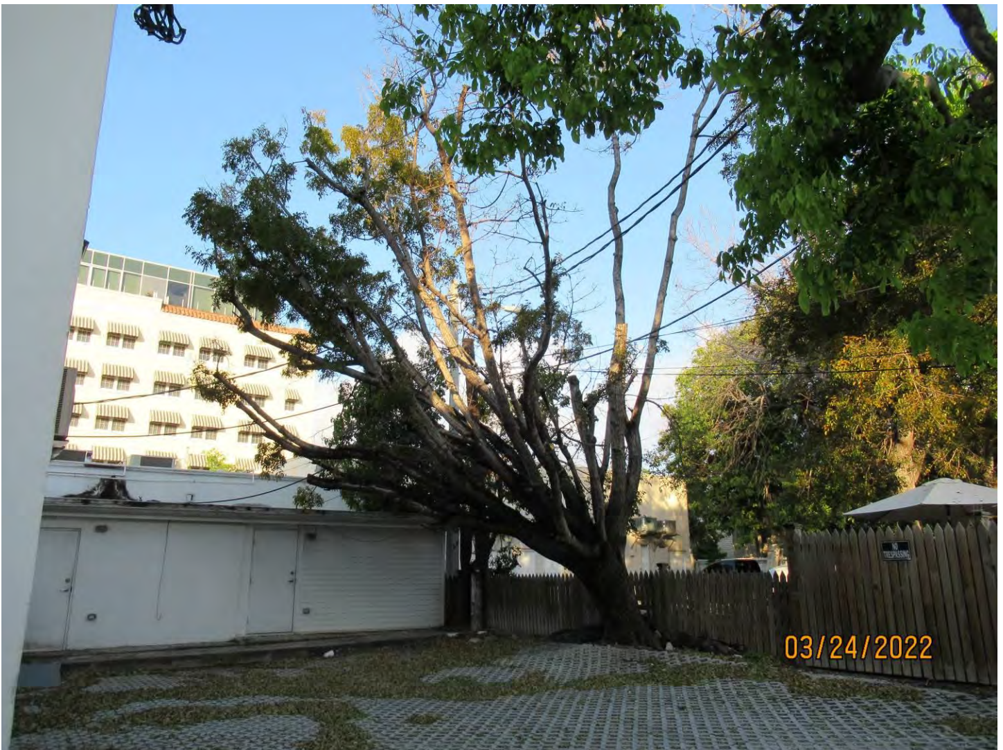
Photo of whole tree, view 1.

Tree Species: Mahogany (Swietenia mahagoni)