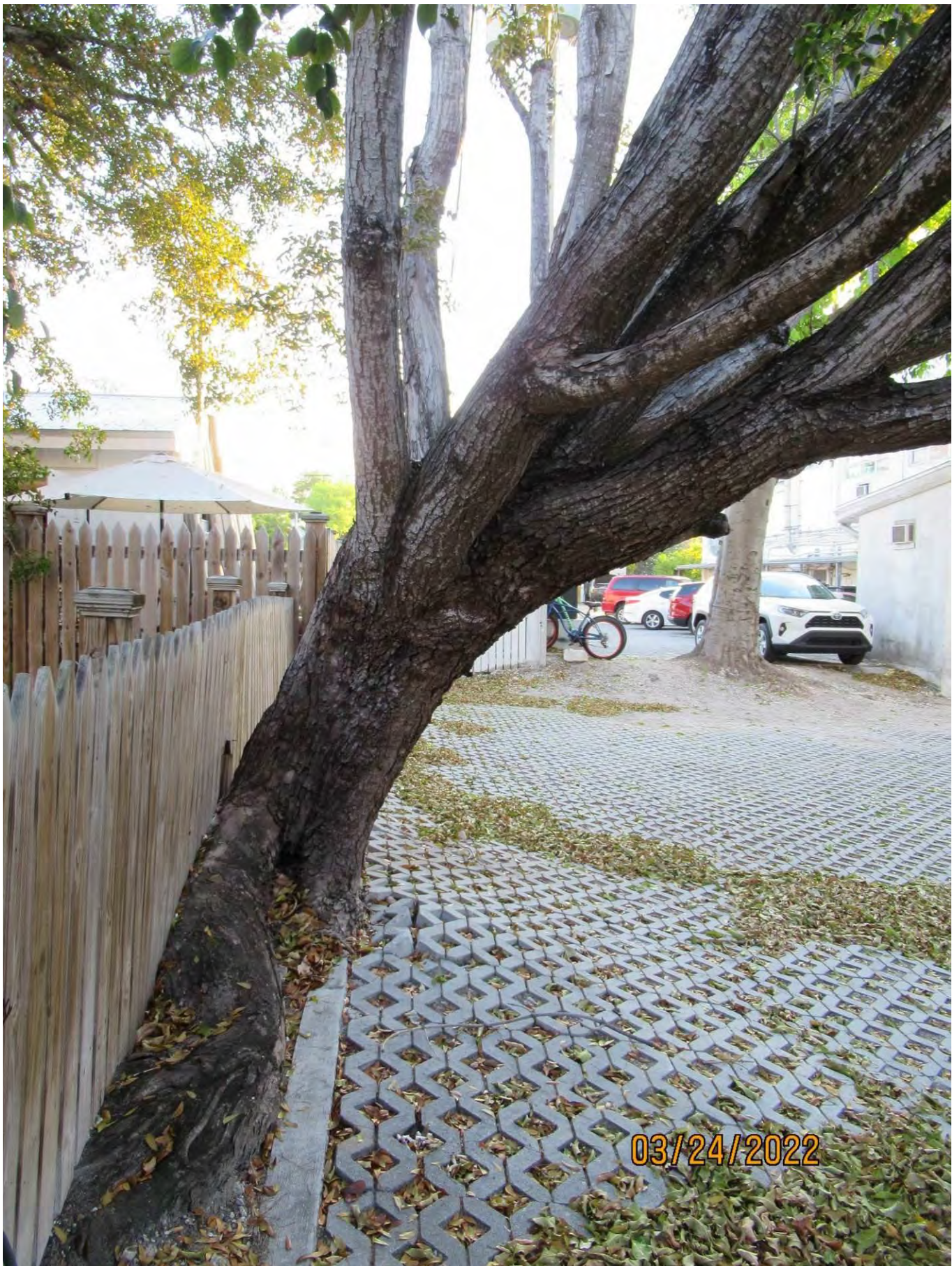
Photo showing location of tree against property line fence and strong growth lean, view 2.