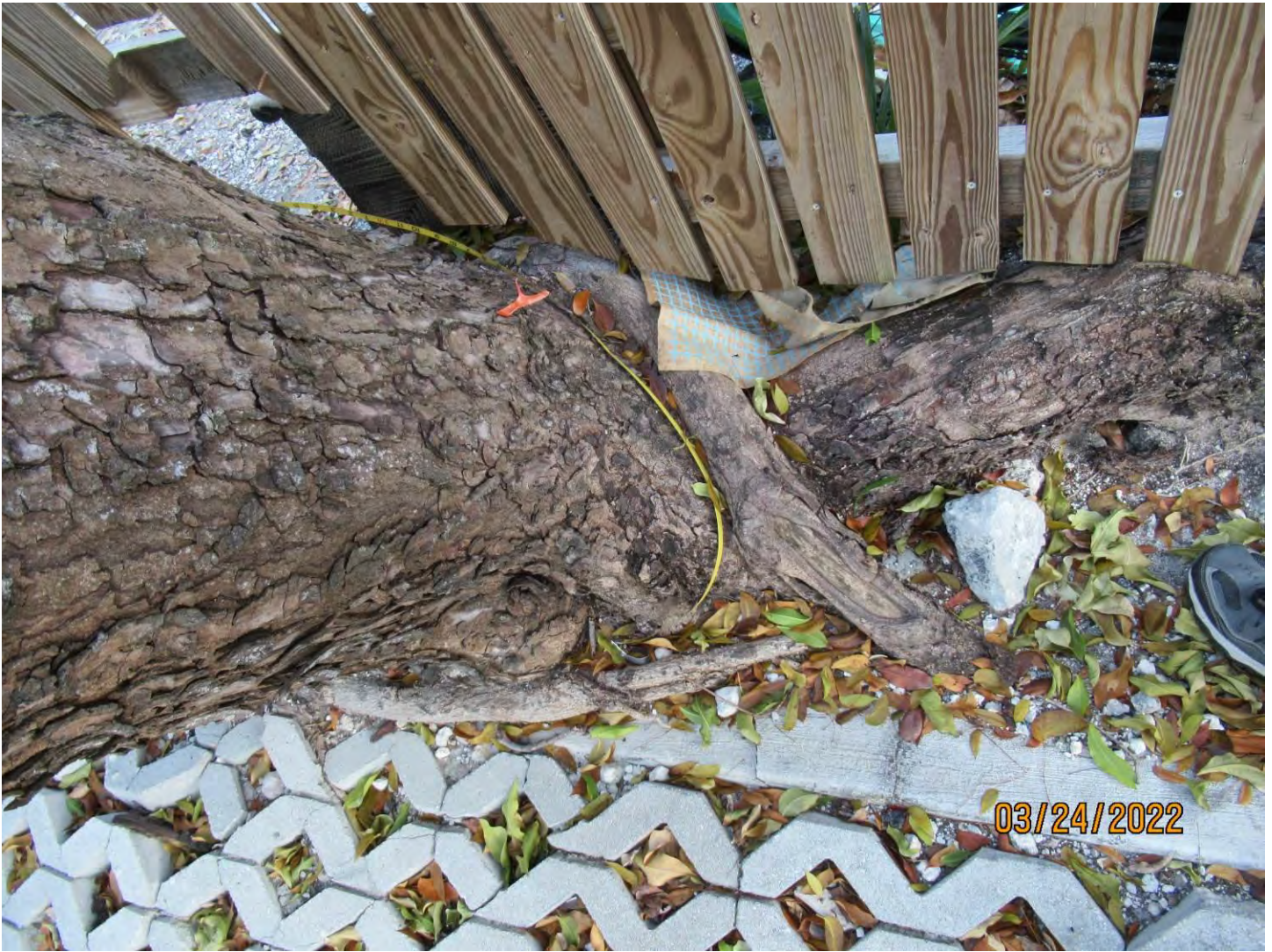
Photo showing girdling roots.