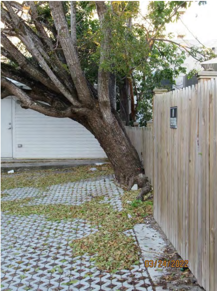
Two photos showing location of tree against property line fence and strong growth lean, view 1.