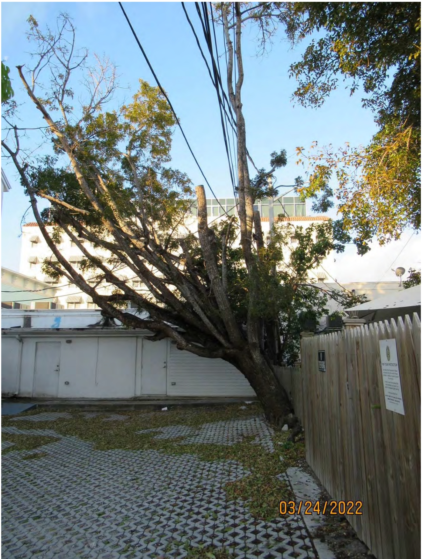
Photo of whole tree view 2. Note utility lines in canopy and stub cut branches.