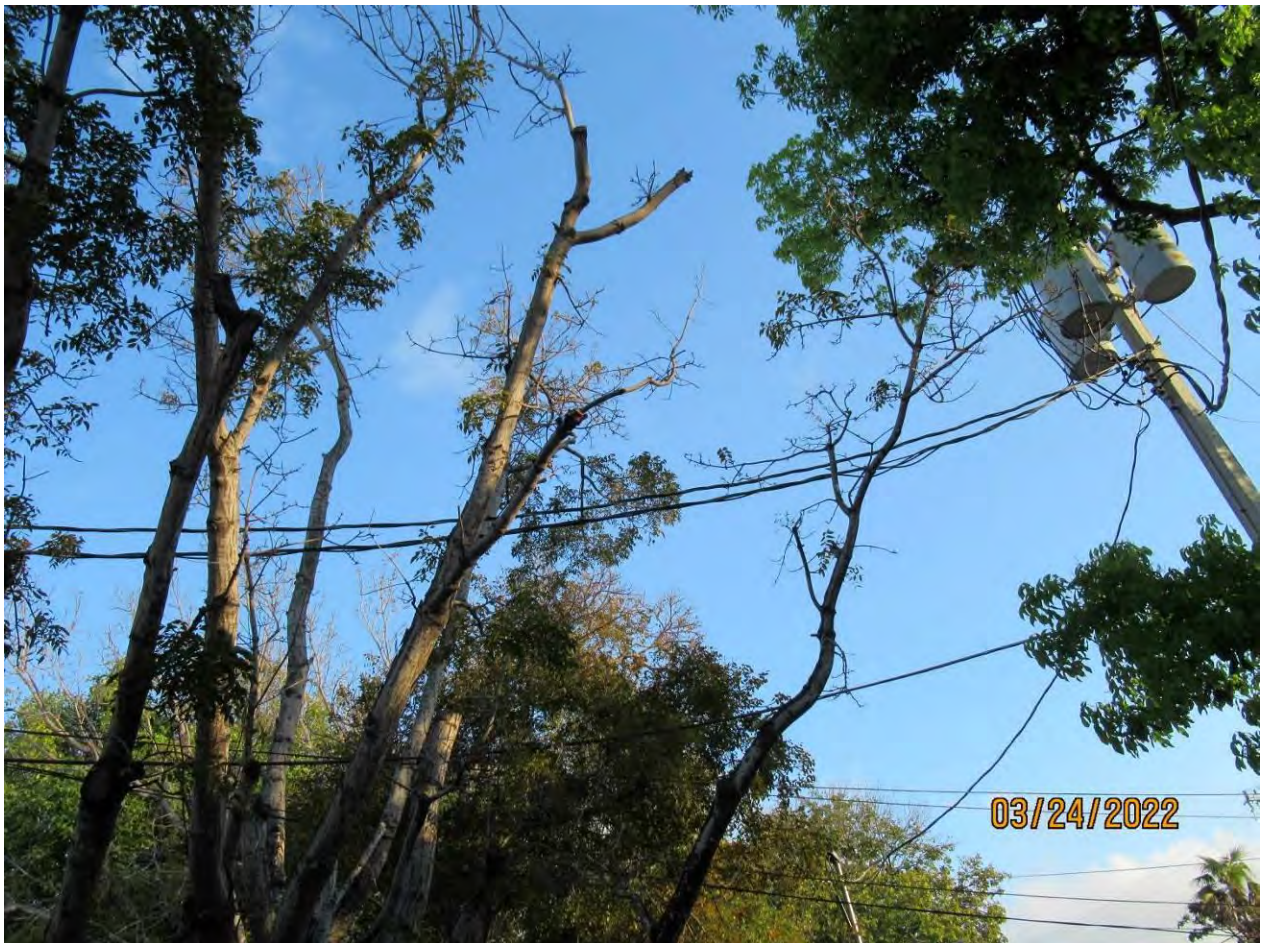
Photo of canopy branches, view 3.