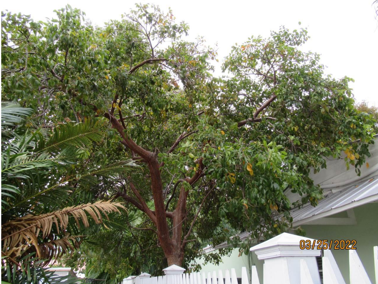
Photo of tree canopy, view 3.