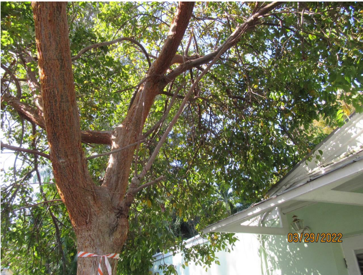
Photo of tree trunk and canopy branches.