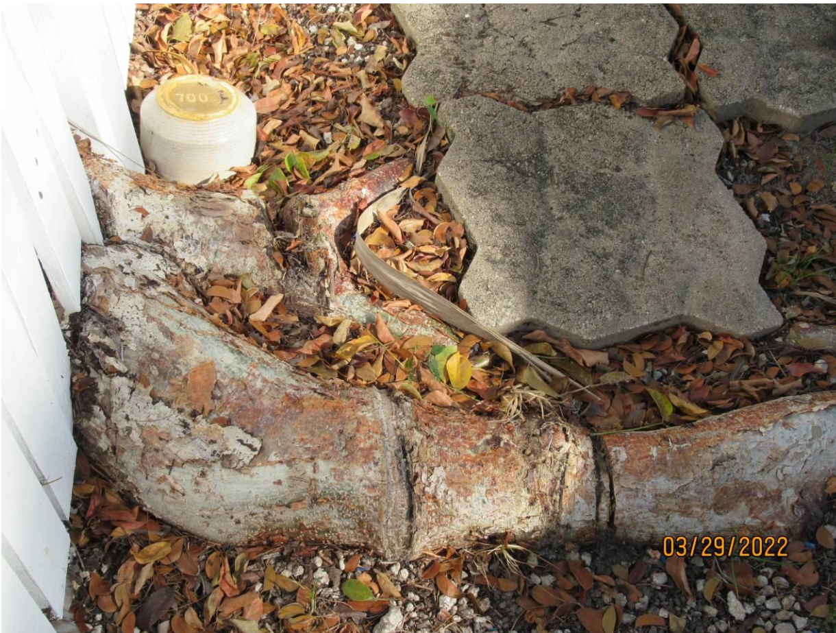
Close up of main root structure in neighbor's yard..