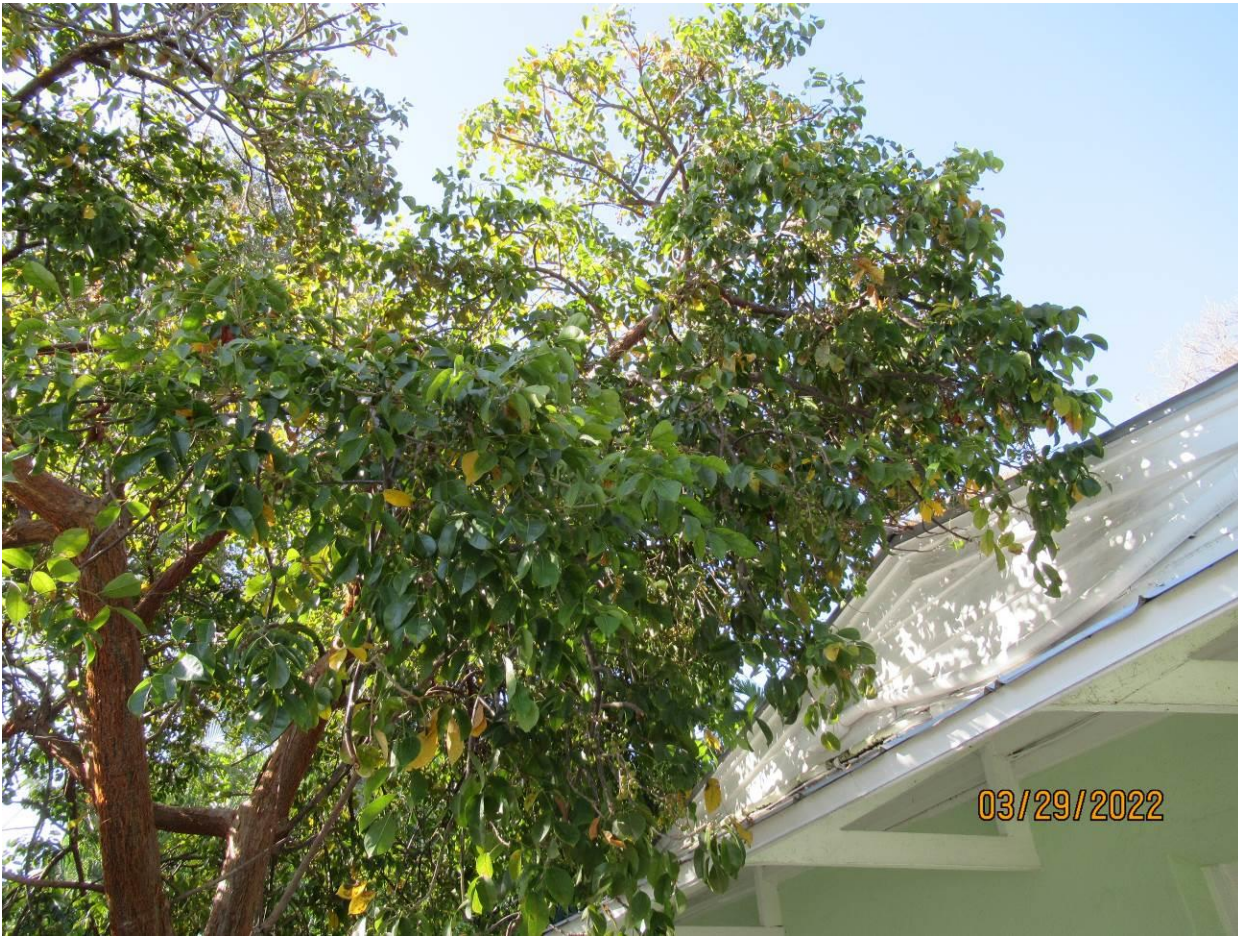
Photo of tree canopy, view 1.