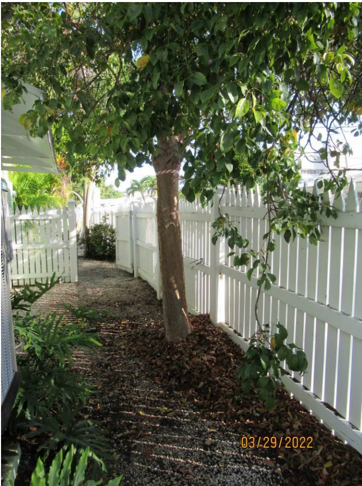
Photo of tree showing location near property line, view 3.