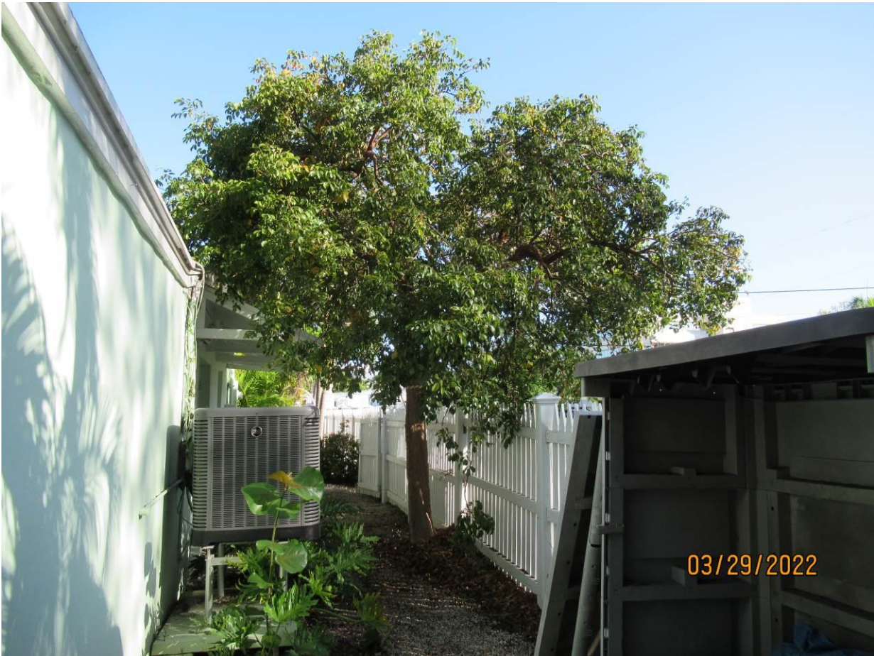
Photo of whole tree.