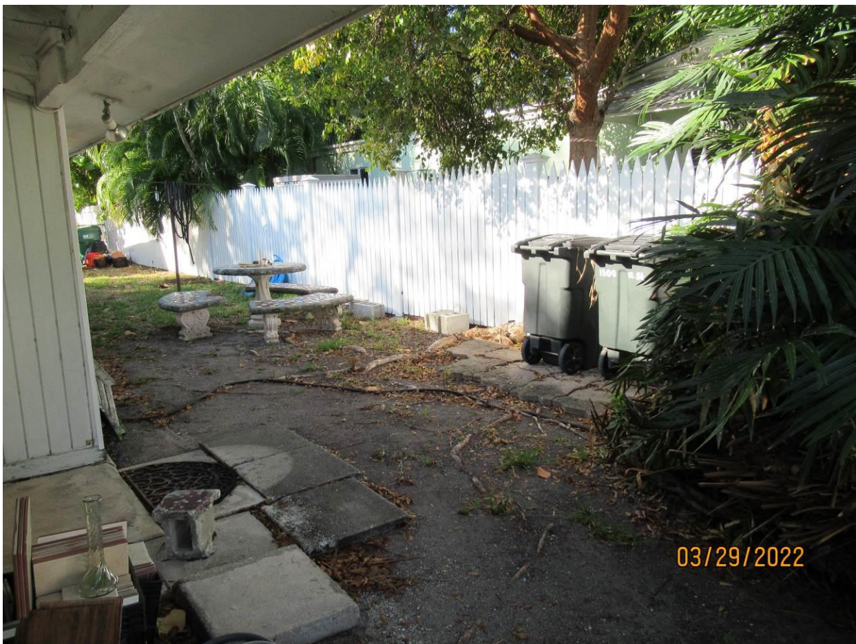
Photo showing tree roots in neighbor's yard, view 1.