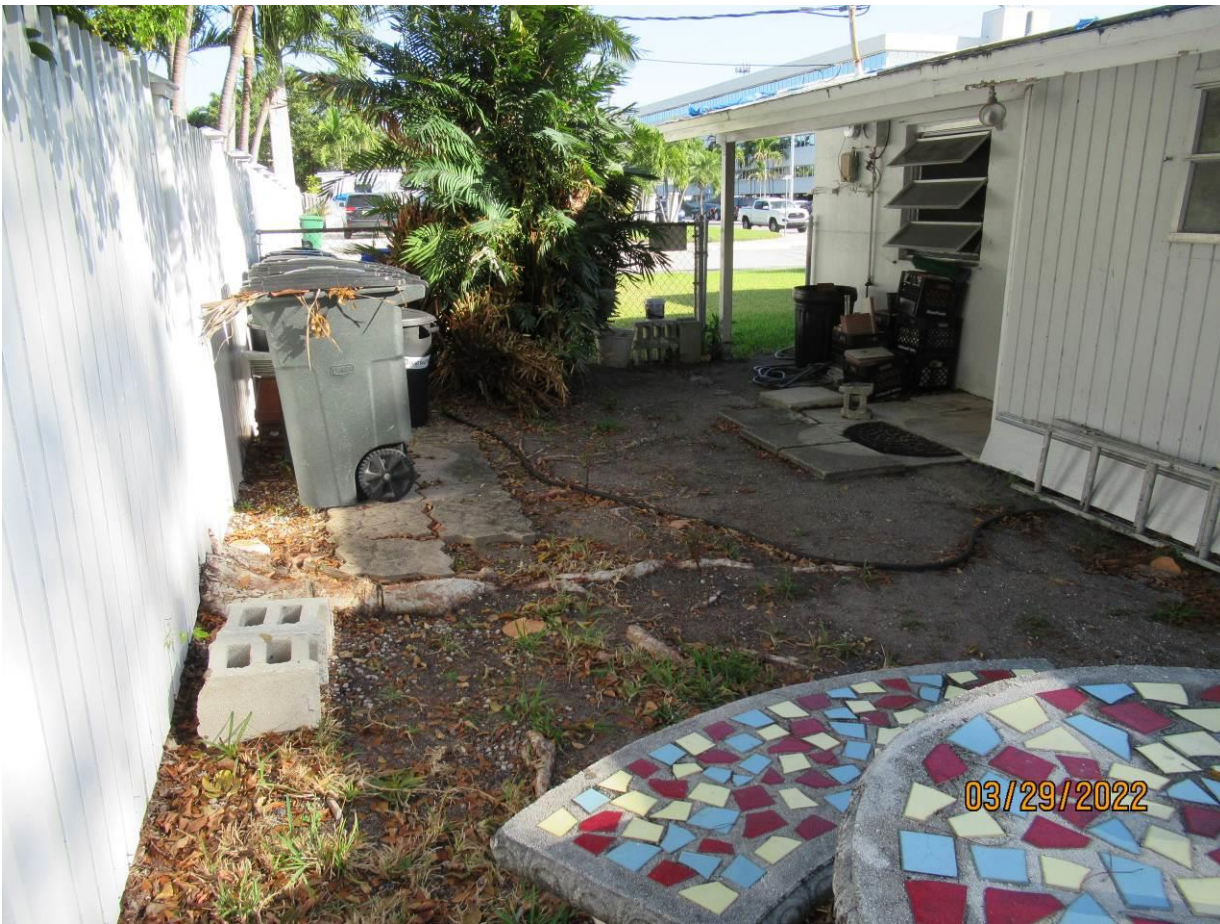
Photo showing tree roots in neighbor's yard, view 2.