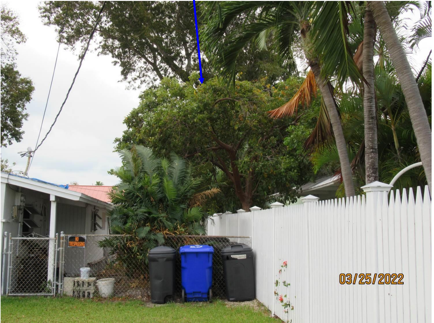
Photo showing location of tree in side yard, view 1.

Tree Species: Gumbo Limbo (Bursera simaruba)