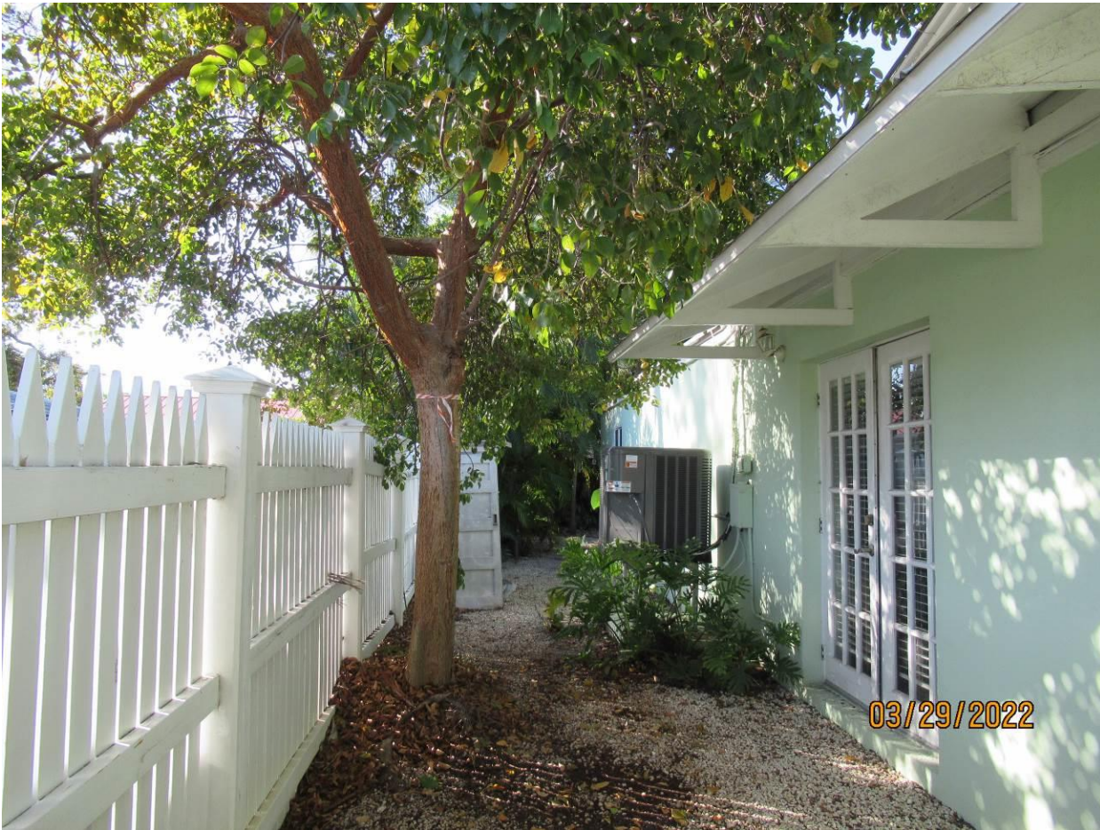
Photo showing location of tree in side yard, view 2.