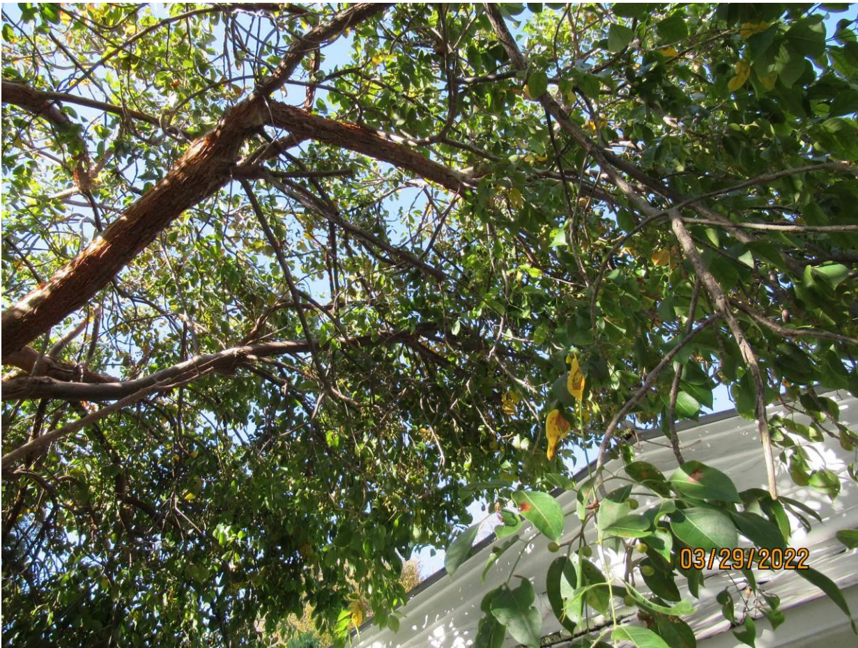
Photo of tree canopy, view 2.