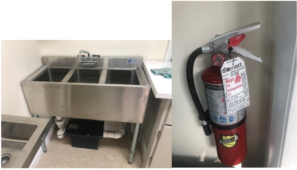
Sink and Fire Extinguisher. DRC member requests.