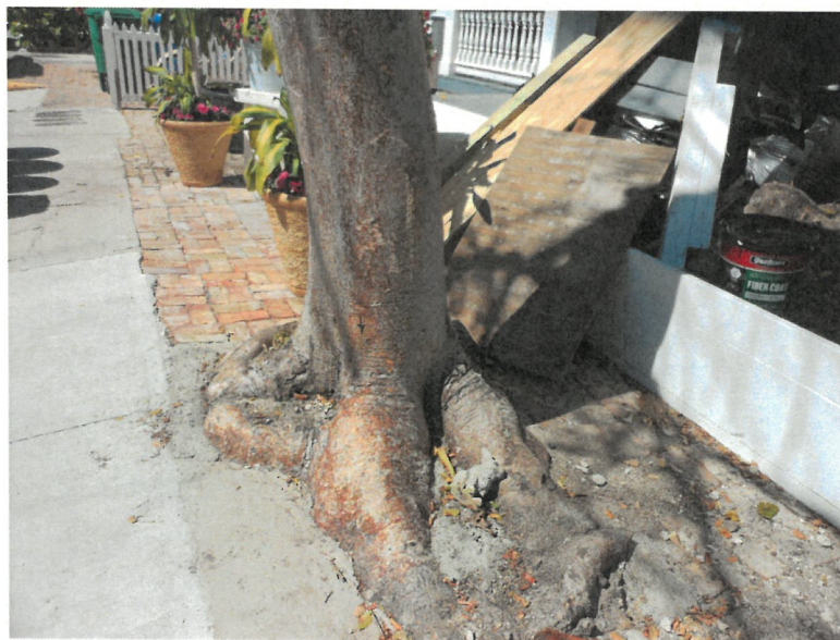
Above photo dated 03/04/2022