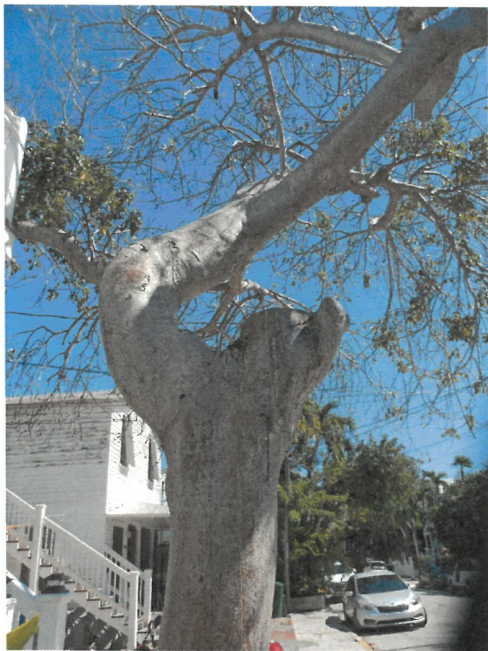
Above photo dated 03/04/2022