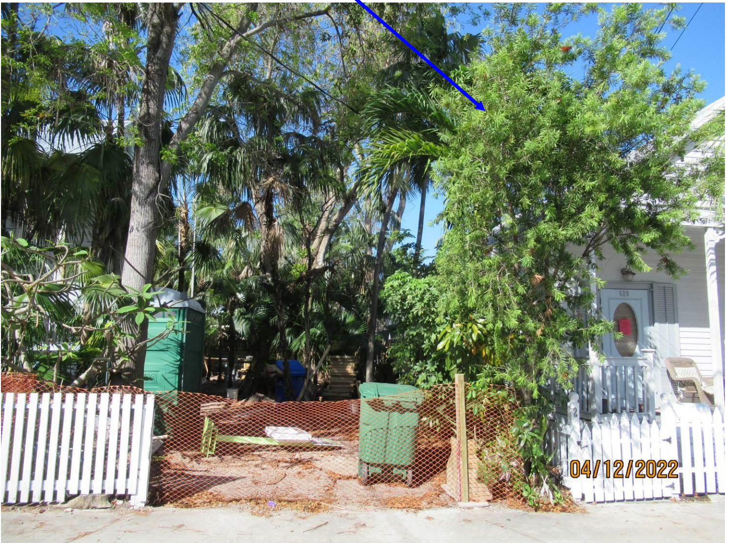
Photo showing tree location on property.

Tree Species: Bottlebrush (Callistemon sp.)