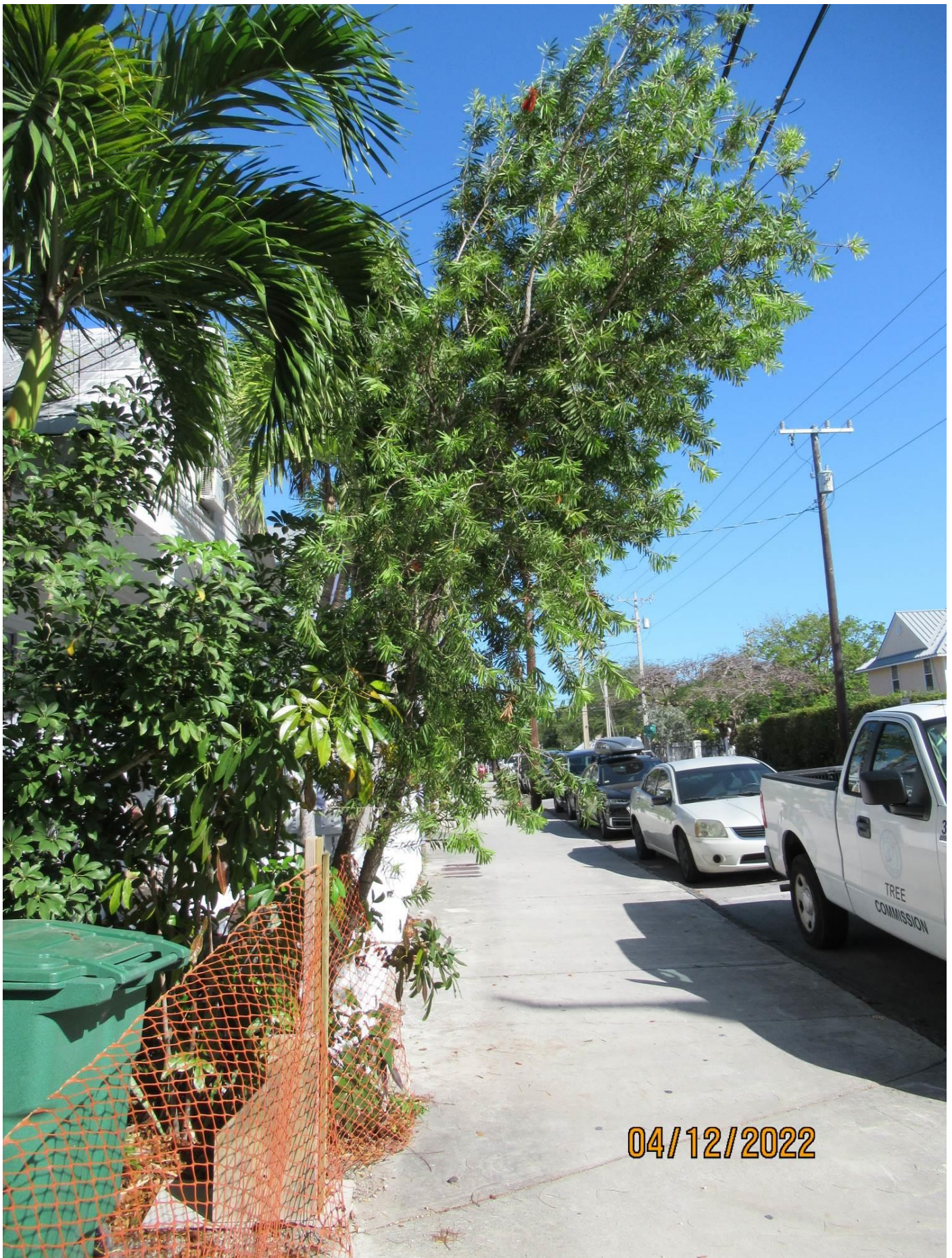
Photo showing tree growth in relation to sidewalk.