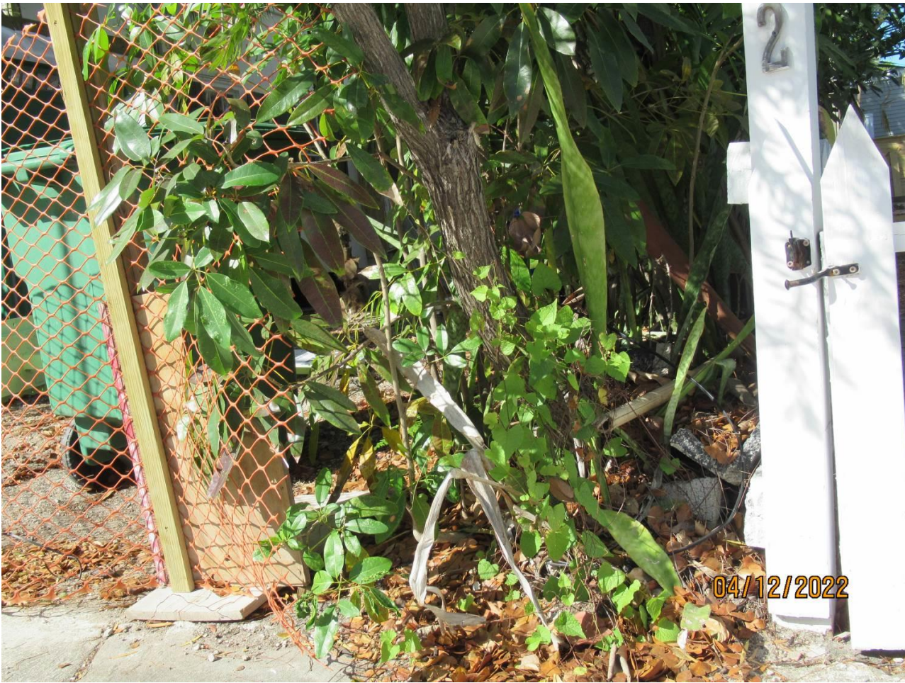
Photo of base area of tree.