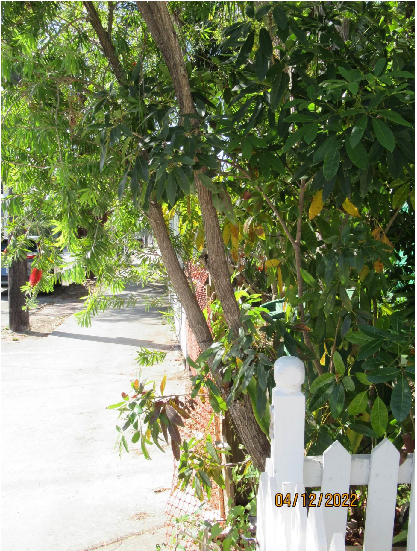
Photo showing trunk structure, view 2.