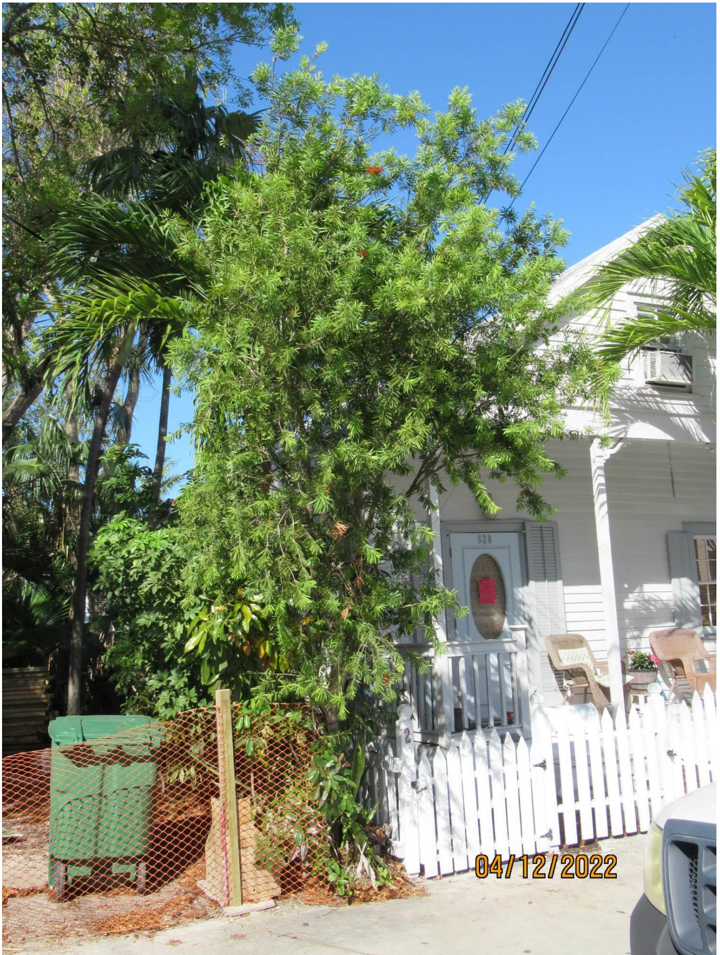
Photo showing whole tree.