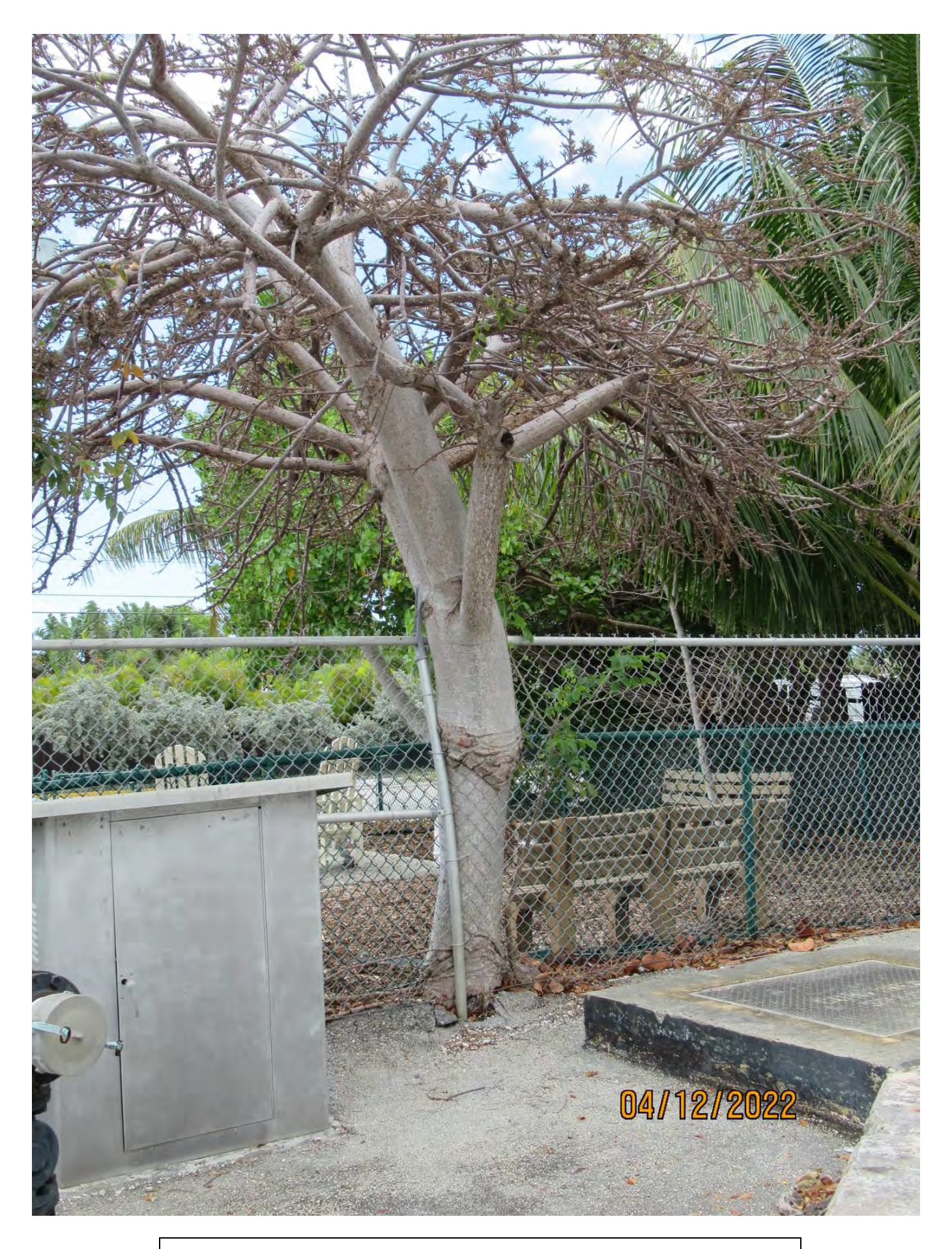
Photo of entire tree showing location realtionship with pump equipment.