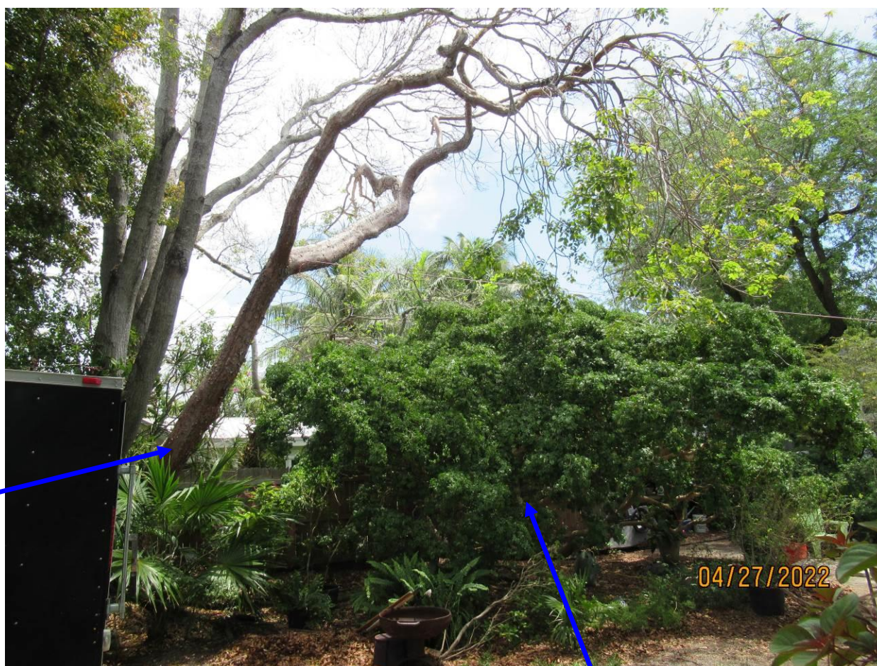
lignum vitae tree

Two photos showing the whole tree and its location.