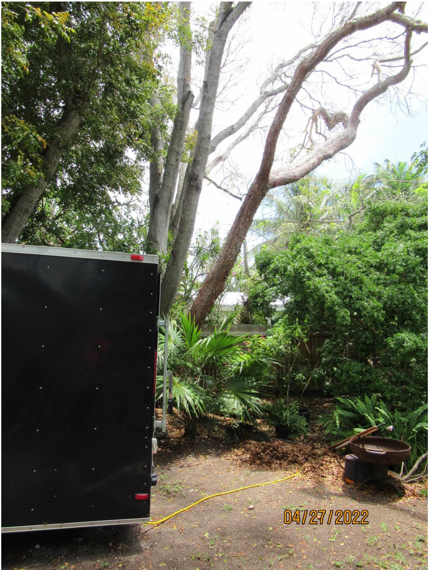
Photo of the tree trunk.