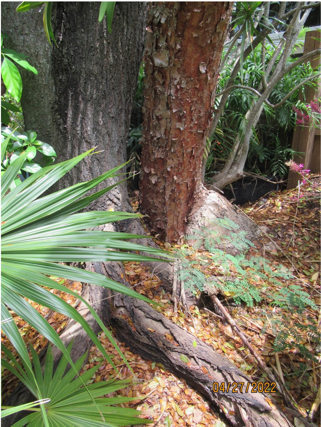
Photo showing base of gumbo limbo tree growing at base of mahogany tree.