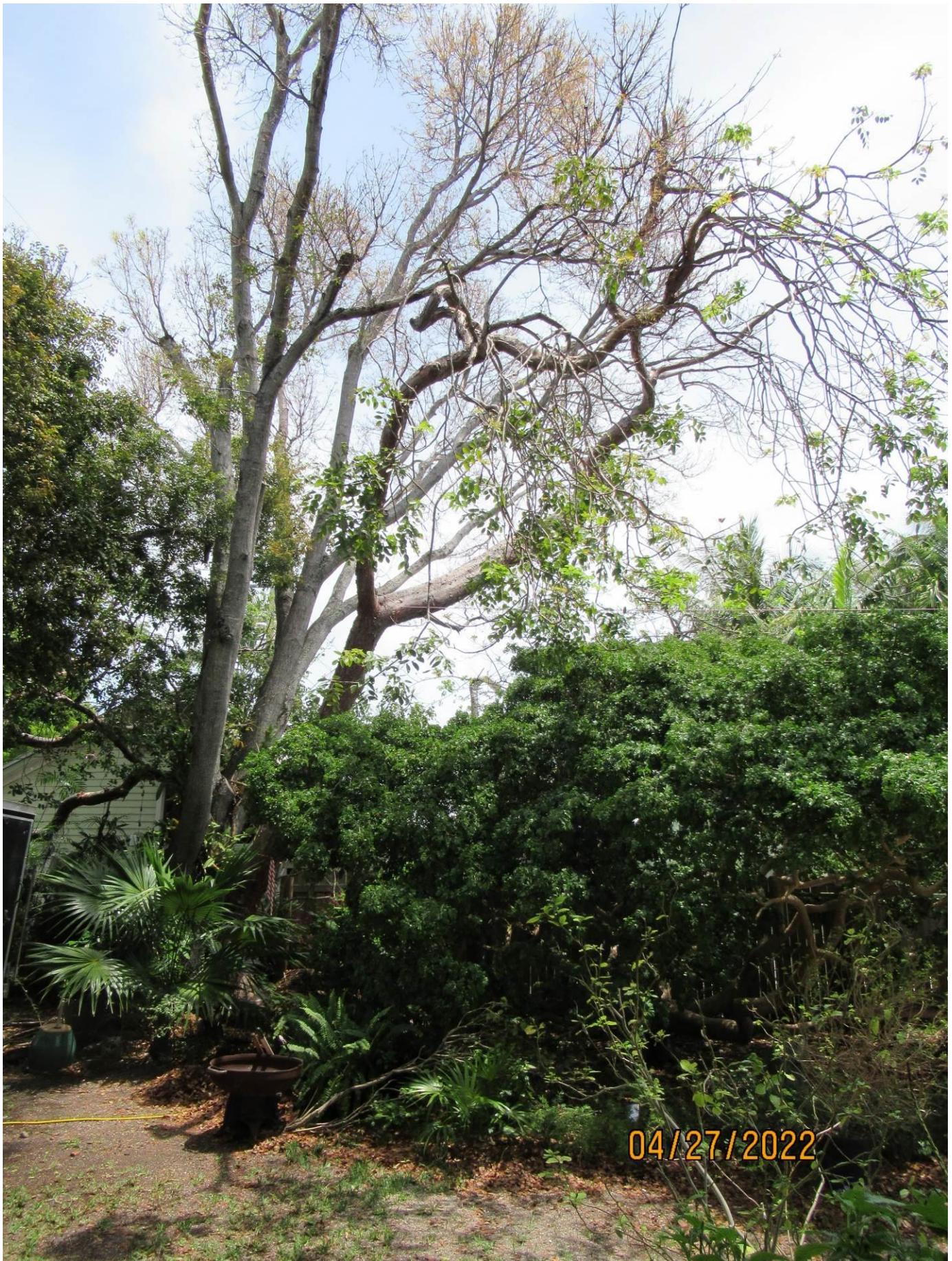
Photo showing canopy of mahogany and gumbo limbo tree.