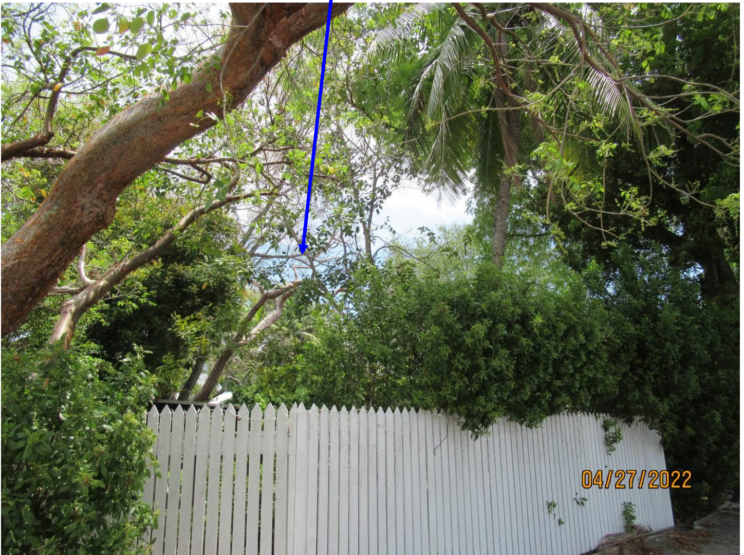
Photo showing location of tree on property.

Tree Species: Gumbo Limbo (Bursera simaruba)