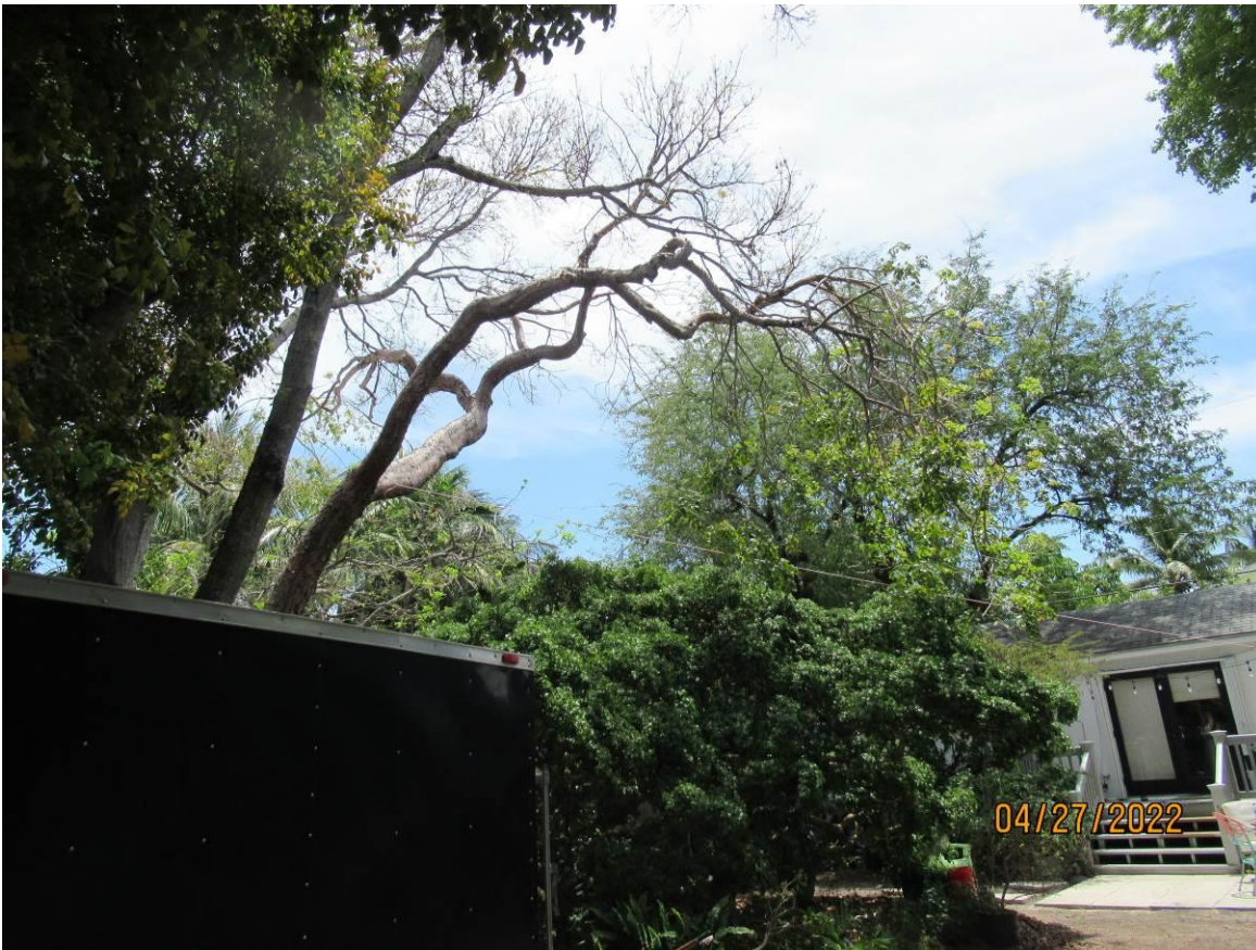
Photo showing main canopy of gumbo limbo tree growing over lignum vitae.