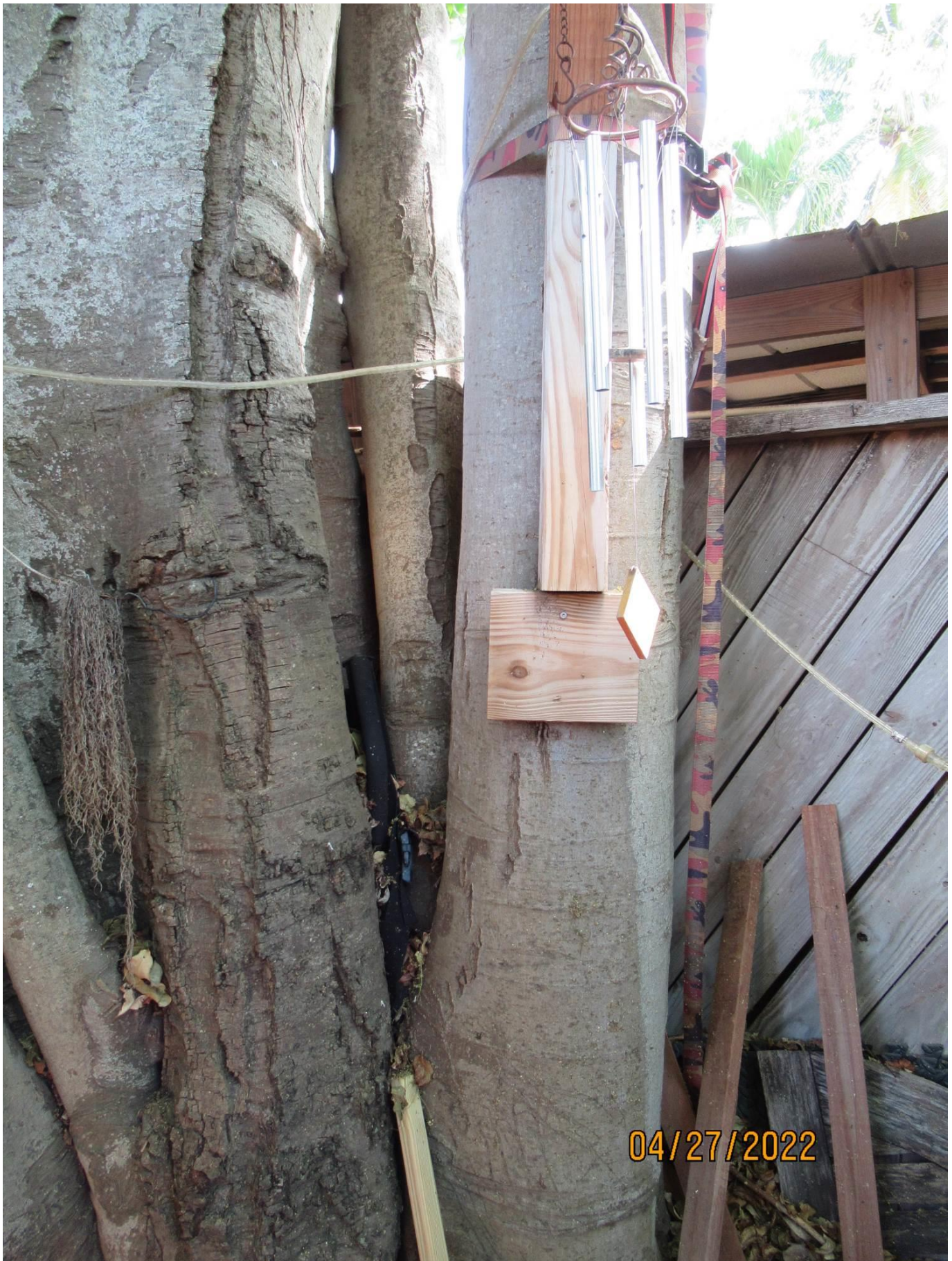
Photo of tree trunk, view 3.