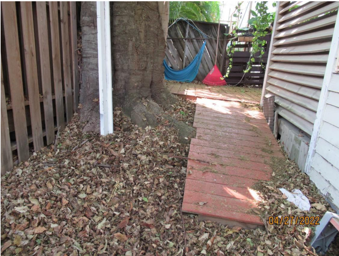
Photo showing ramp to rear deck being lifted by tree roots.