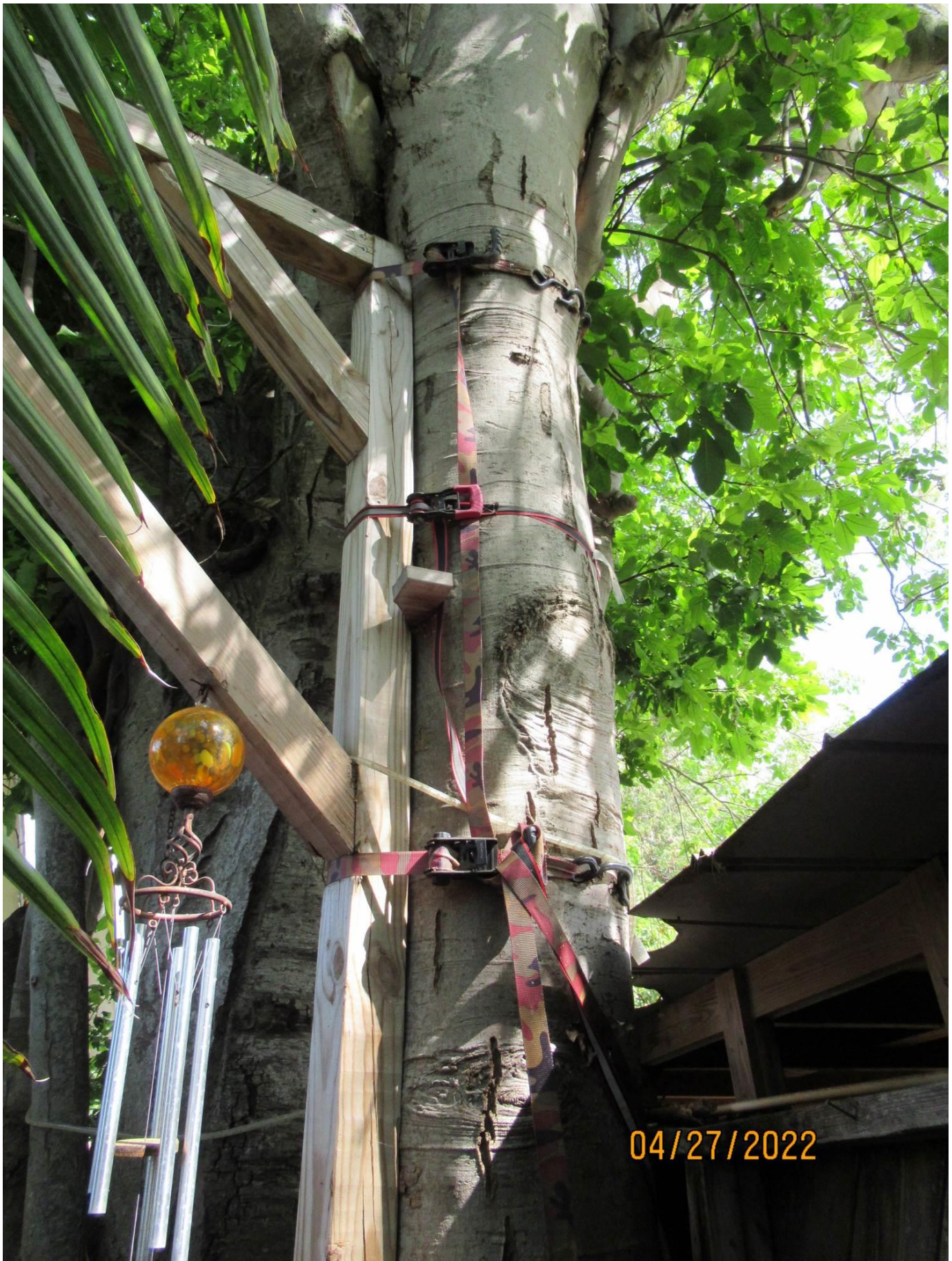
Photo of tree trunk, view 1.