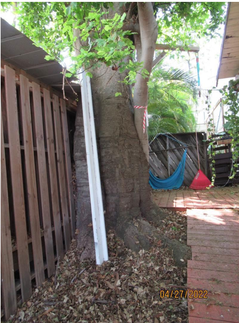
Photo of main trunk and base of tree, view 1.