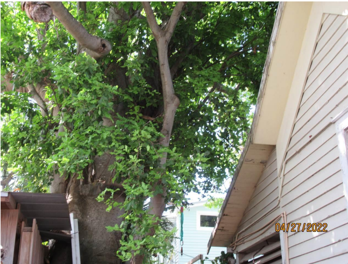
Two photos showing canopy structure, view 1 and 2.