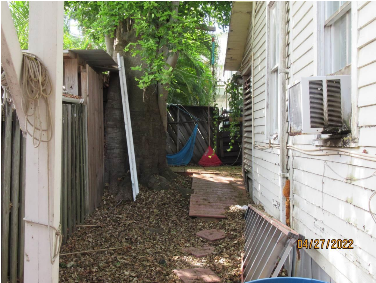
Two photos of base of tree in relation to structure.