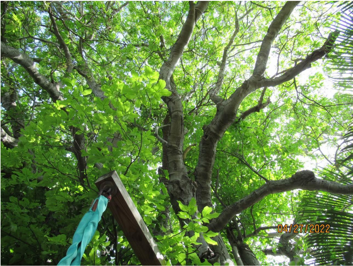
Photo of canopy branch structure, view 3.