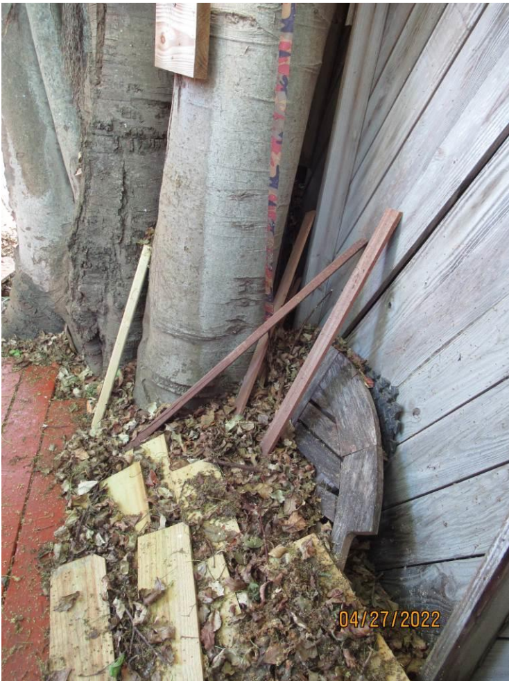
Two photos of base of tree, views 2 and 3