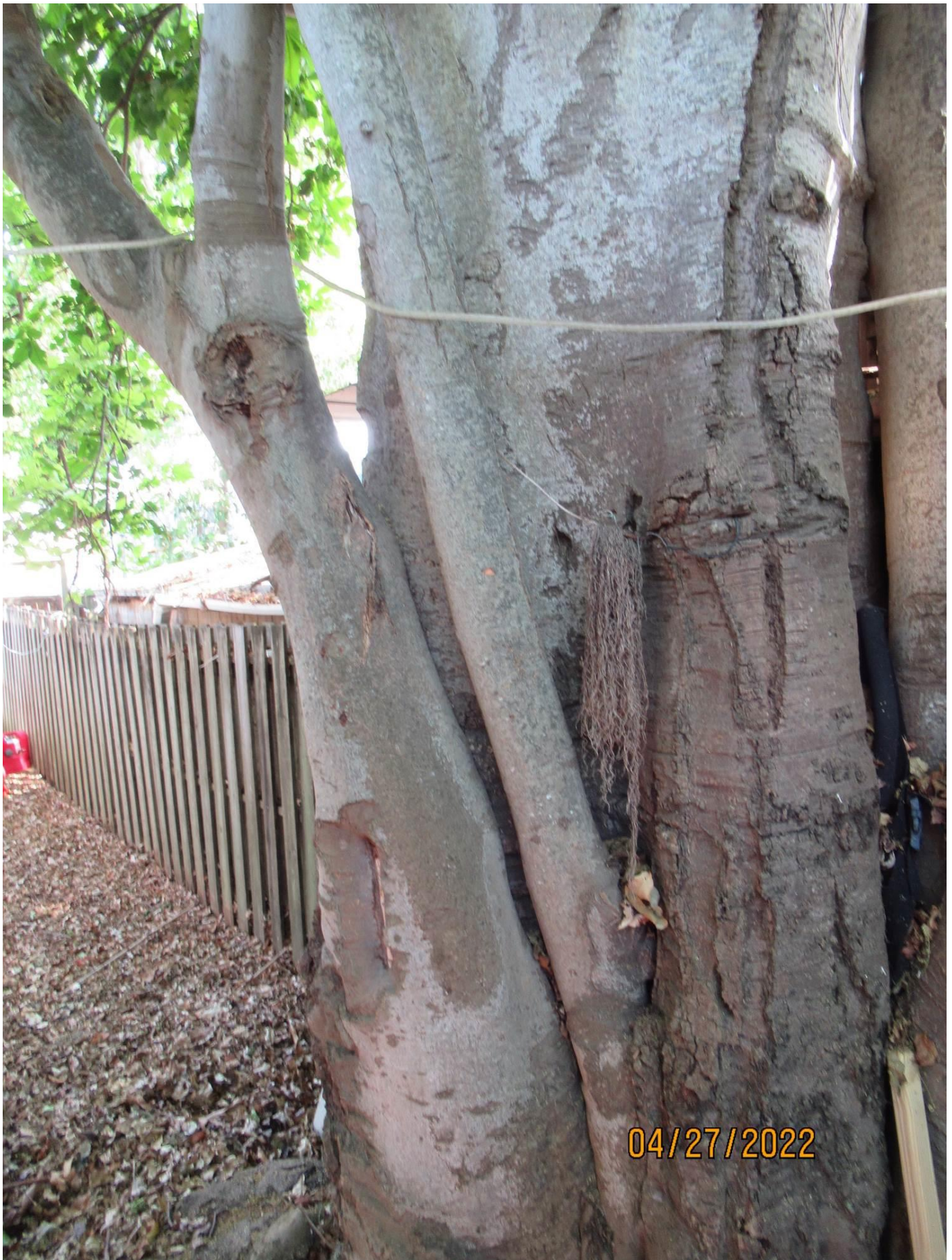
Photo of tree trunk, view 2.