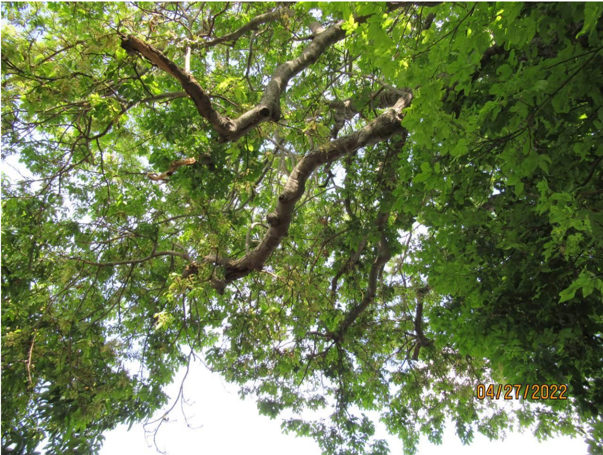
Photo of tree canopy, view 2.