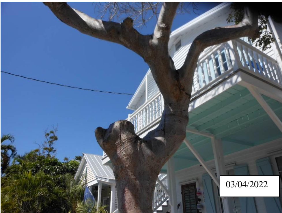
Photo of tree showing cut.

On March 14, 2022, while doing a site inspection to take additional photos, the property owner happened to be on site and we spoke about the tree trimming and the pending application. At that time it was also documented that new pavers had been installed around the base of the tree, primary roots had been cut without benefit of a trimming permit, and concrete had been placed in the surface root areas. Later that day the property owner submitted a representation form and requested processing of the tree removal application.