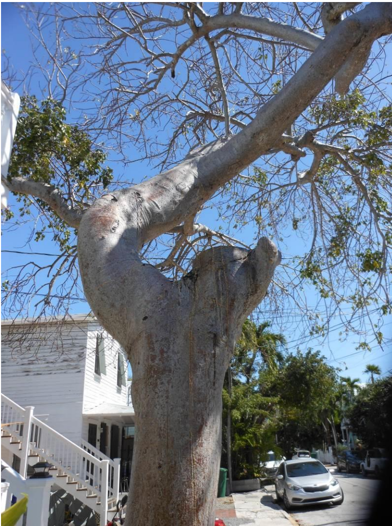
Photo showing flat cut on tree.