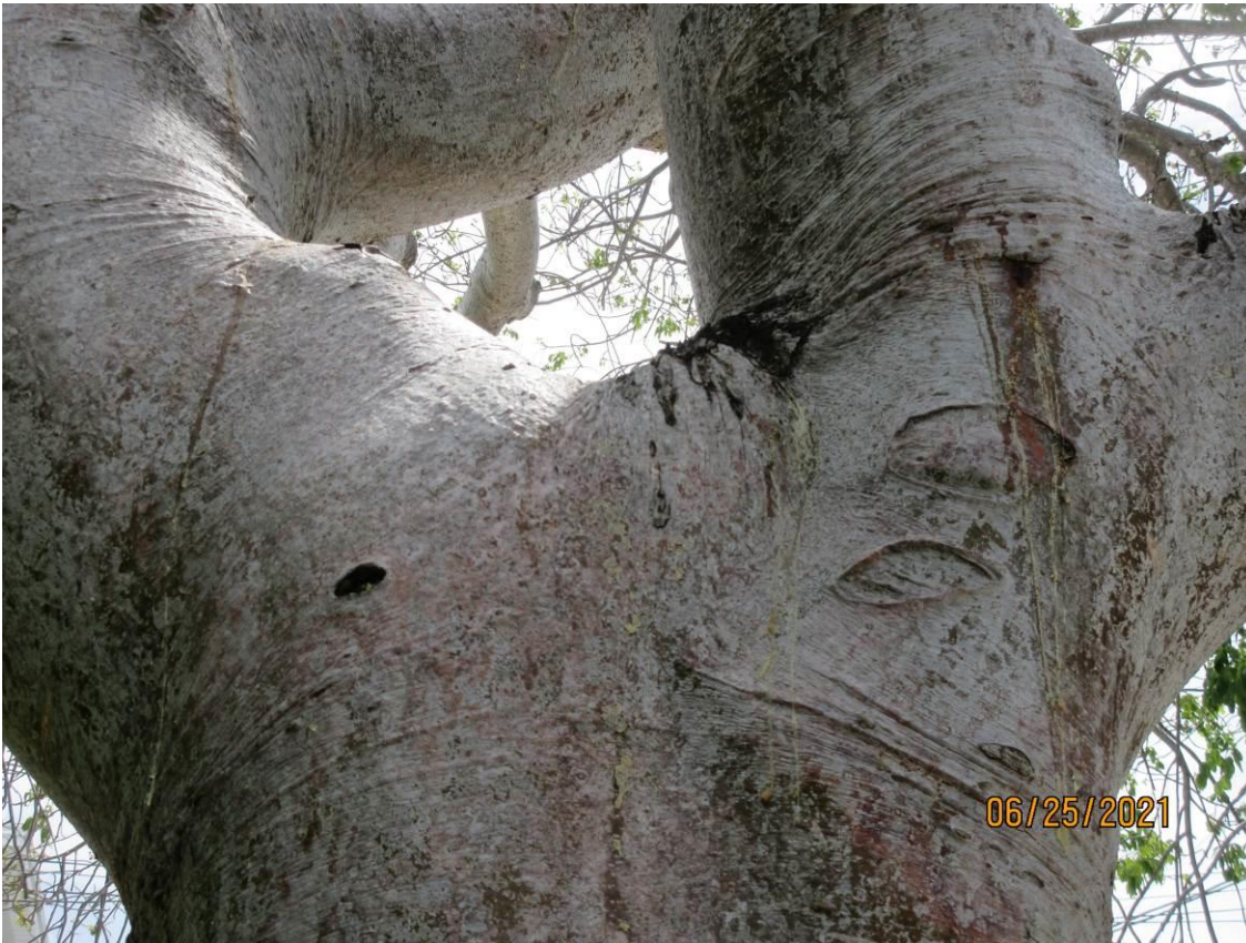
Closeup photo of cut area prior to trimming.