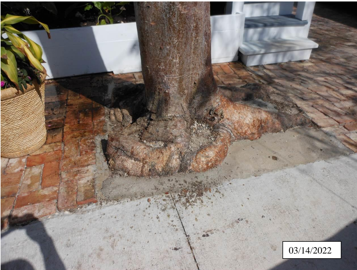
Photo showing entire base of tree after paver work.