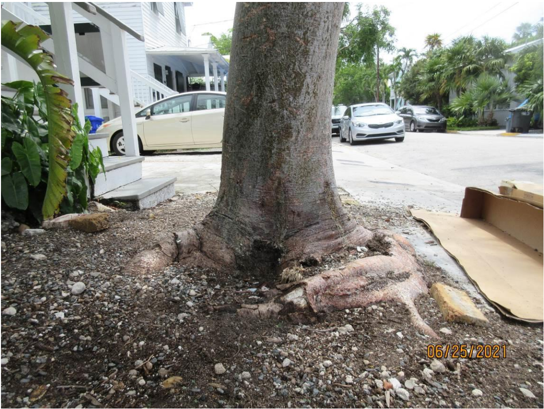
Photo showing tree roots on west side of tree prior to paver work.