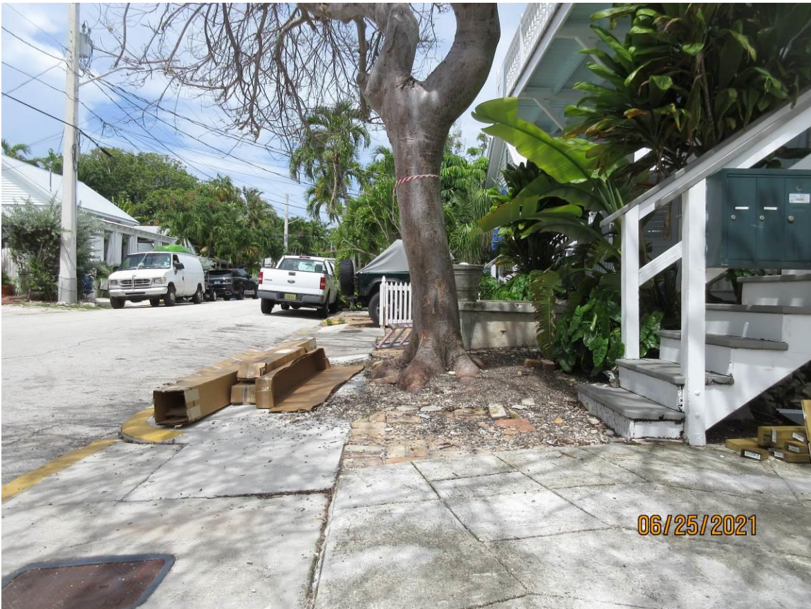
Photo showing base area of tree prior to paver work.