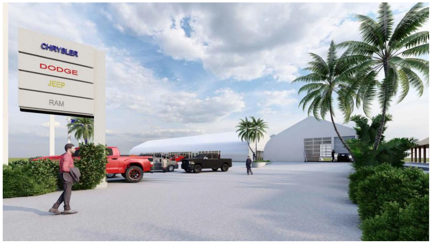
Proposed Buildings as seen from N. Roosevelt Boulevard