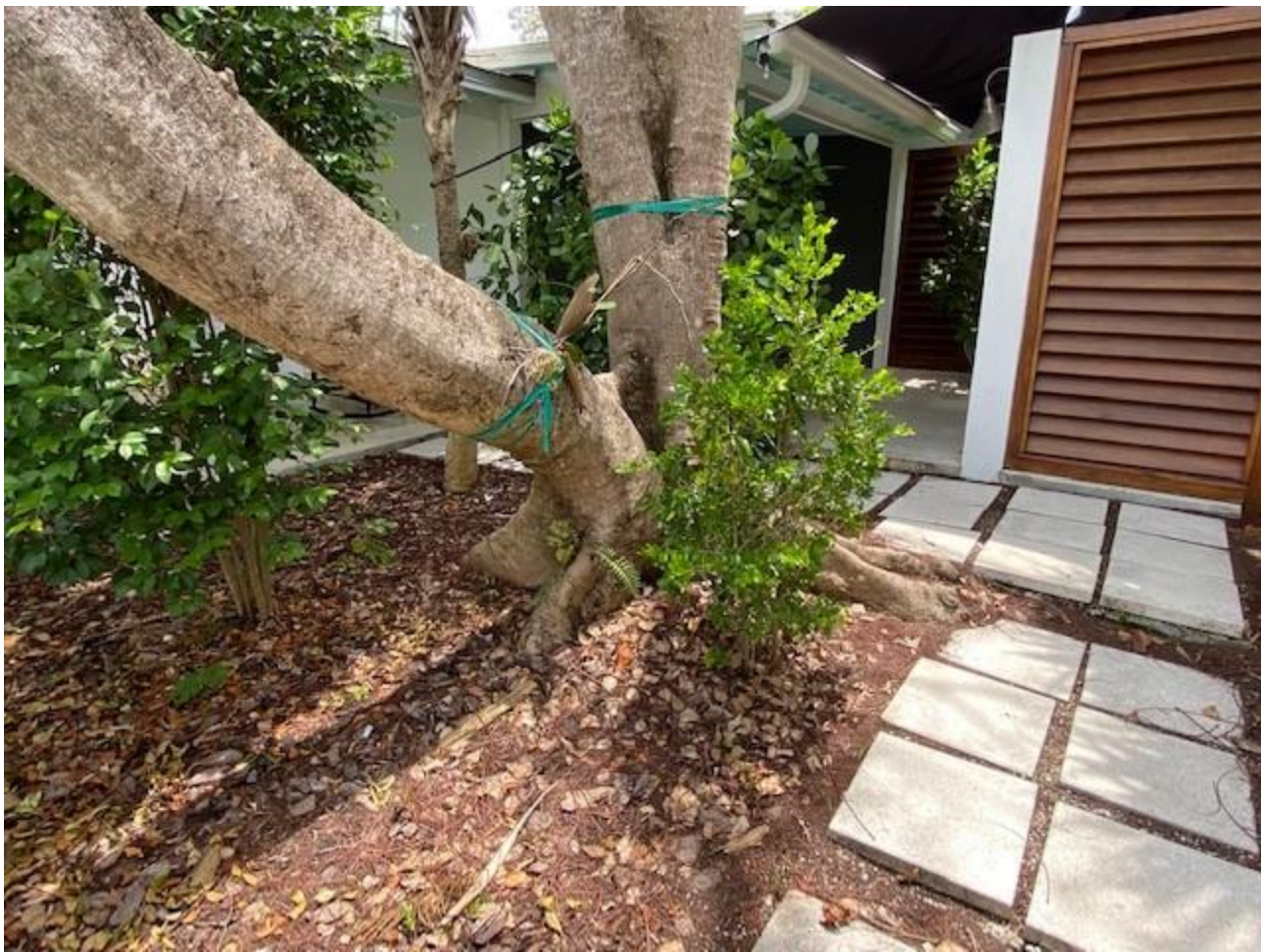
Photo dated April 27, 2022, showing location of tree.