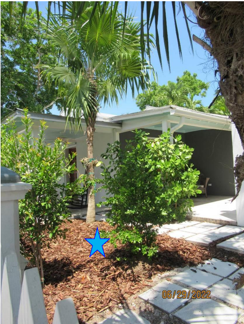
Photo of front yard area where tree was removed. Blue star marks the approximate location of tree.