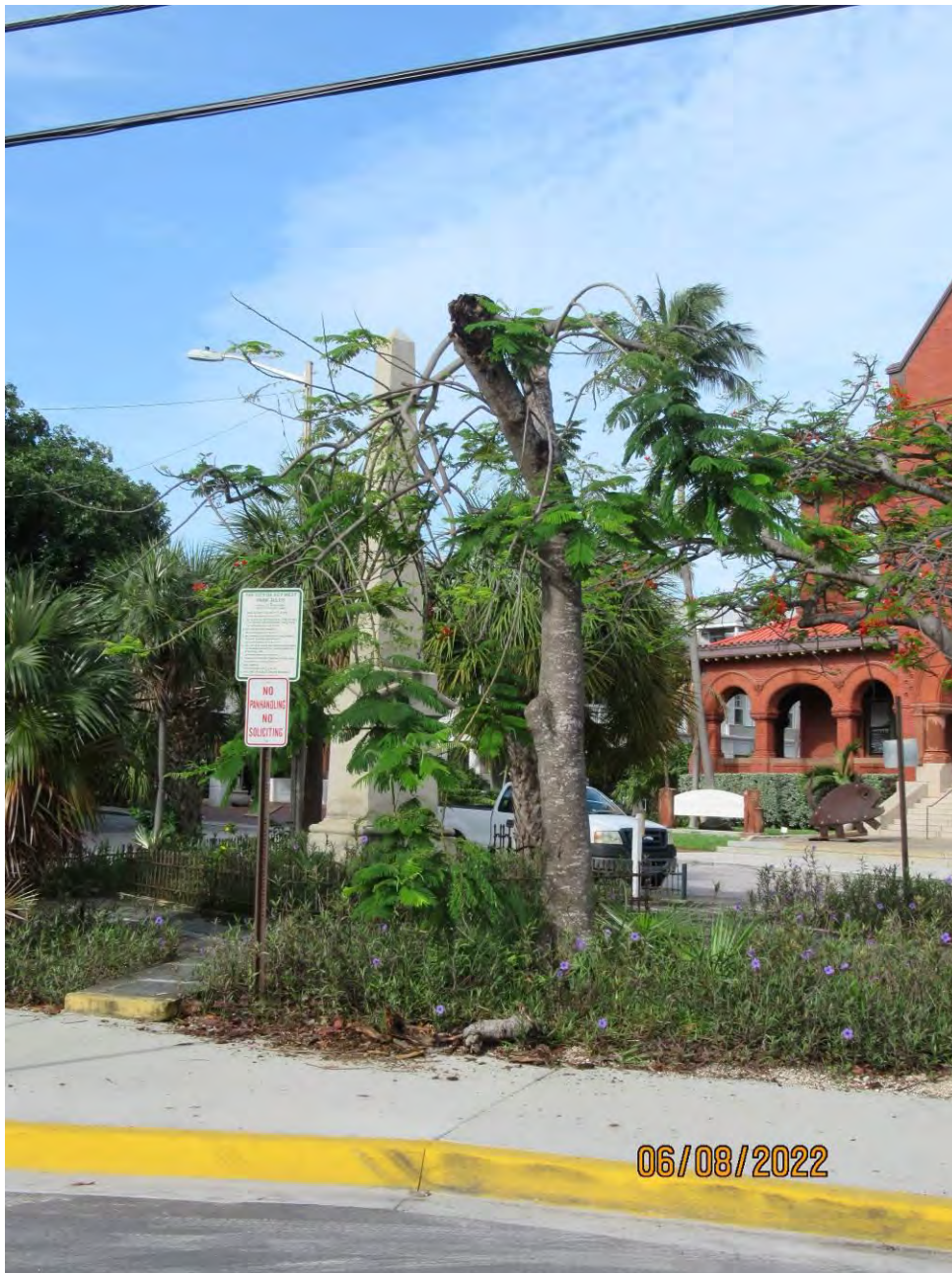
Photo of entire tree showing location.