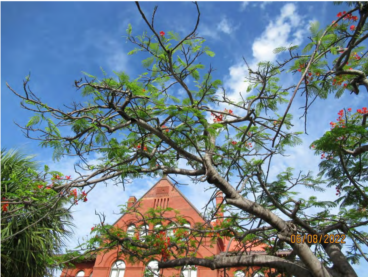
Photo of tree canopy, view 3 .