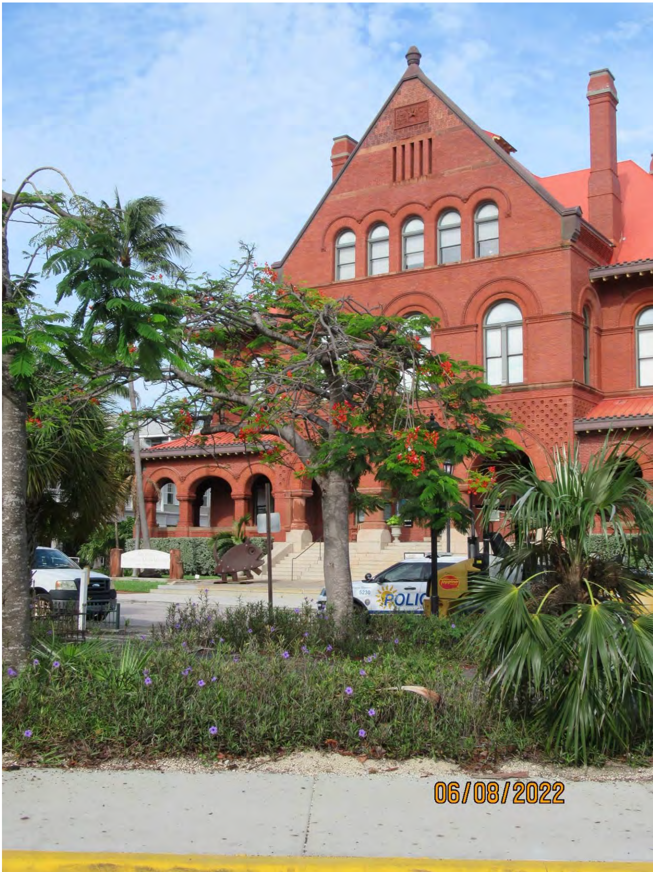
Photo showing entire tree and location.