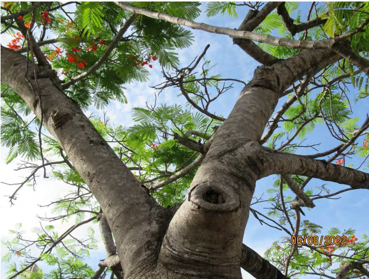
Photo of tree crotch.