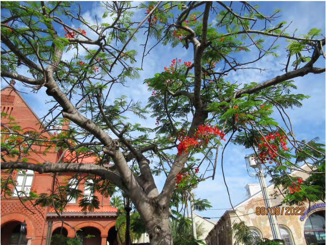
Photo of tree canopy, view 2.