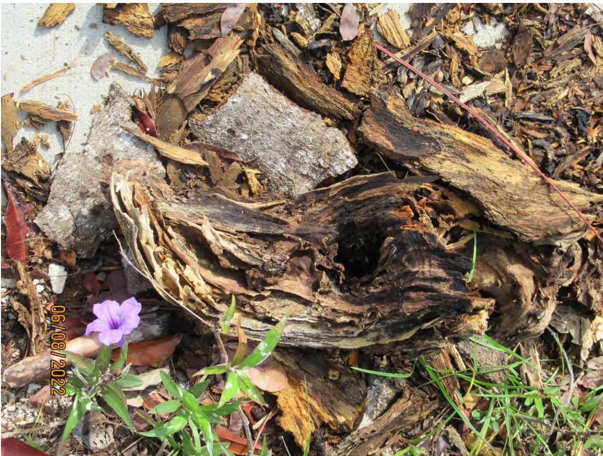
Close up photo of sidewalk tree canopy debris.