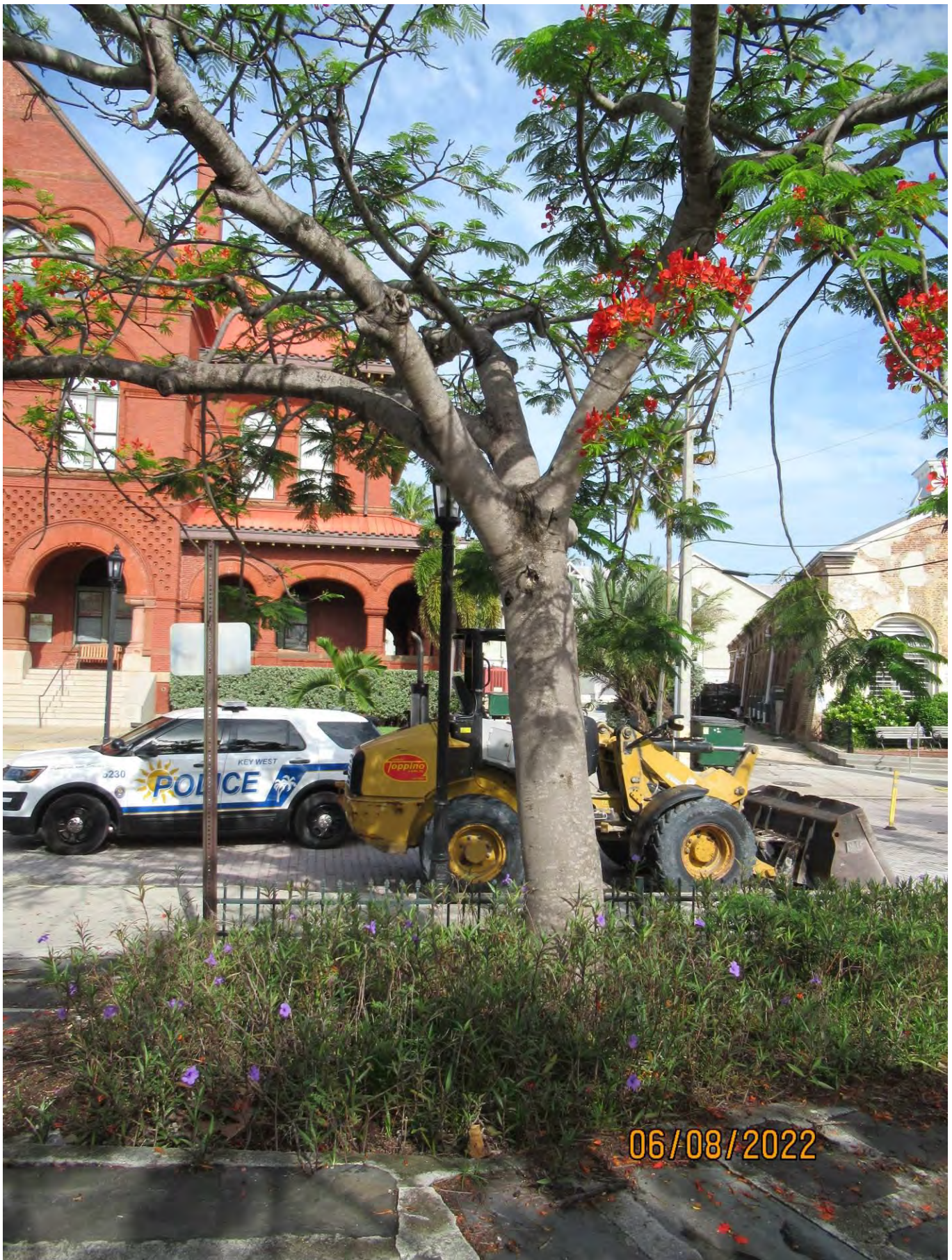
Photo of tree trunk and main canopy branches.