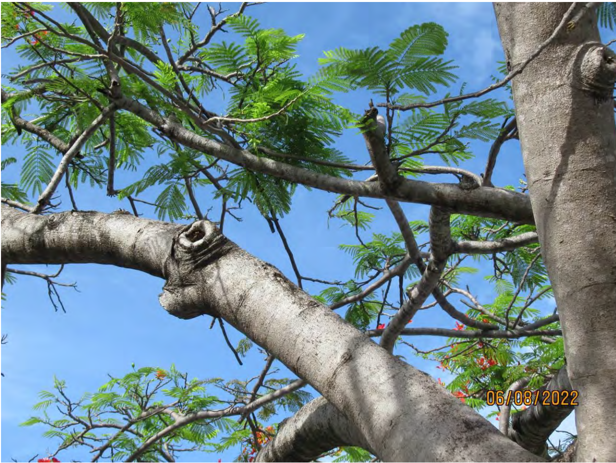
Photo of tree canopy, view 4.