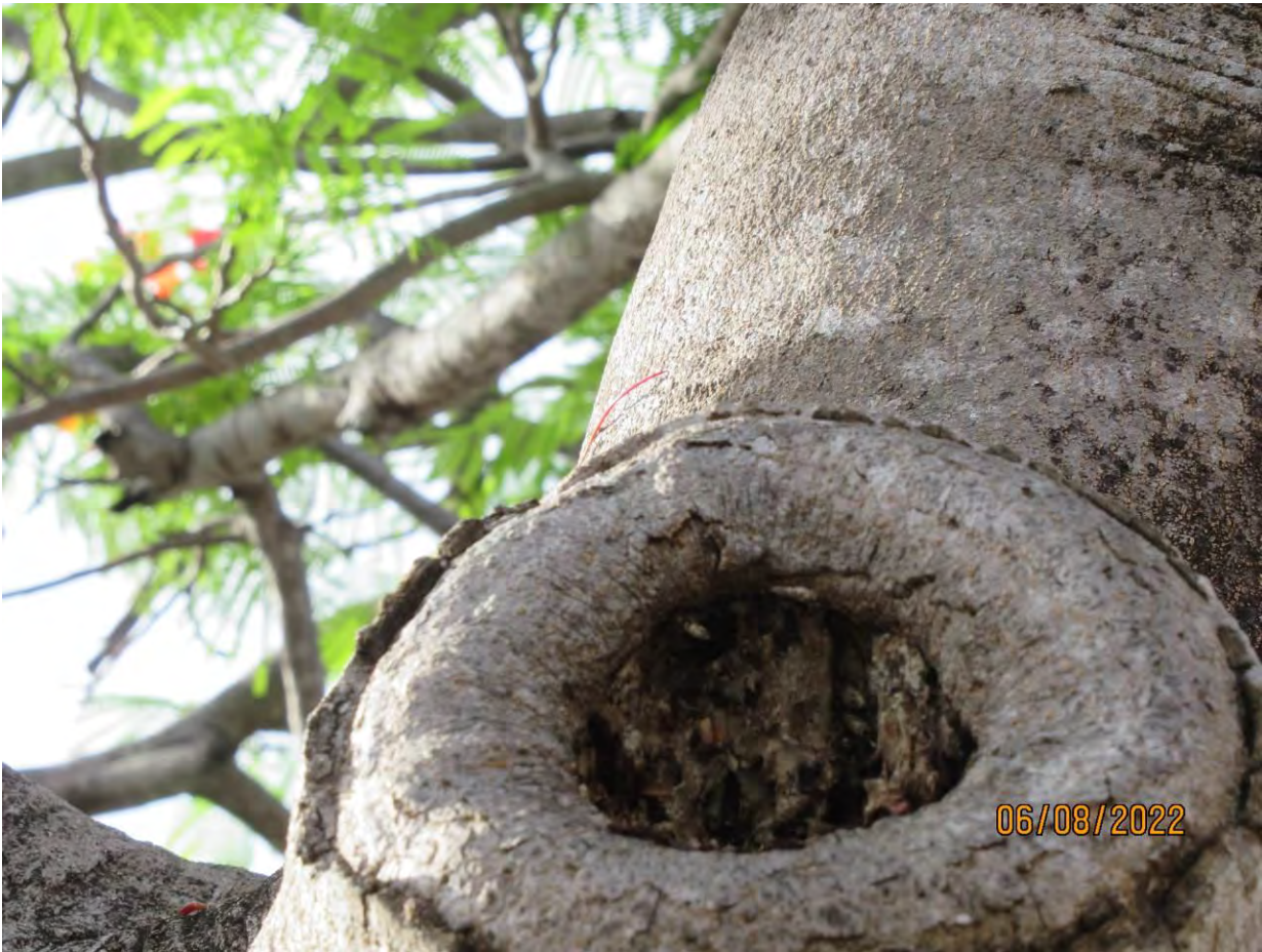
Close up photo of old canopy branch cut.