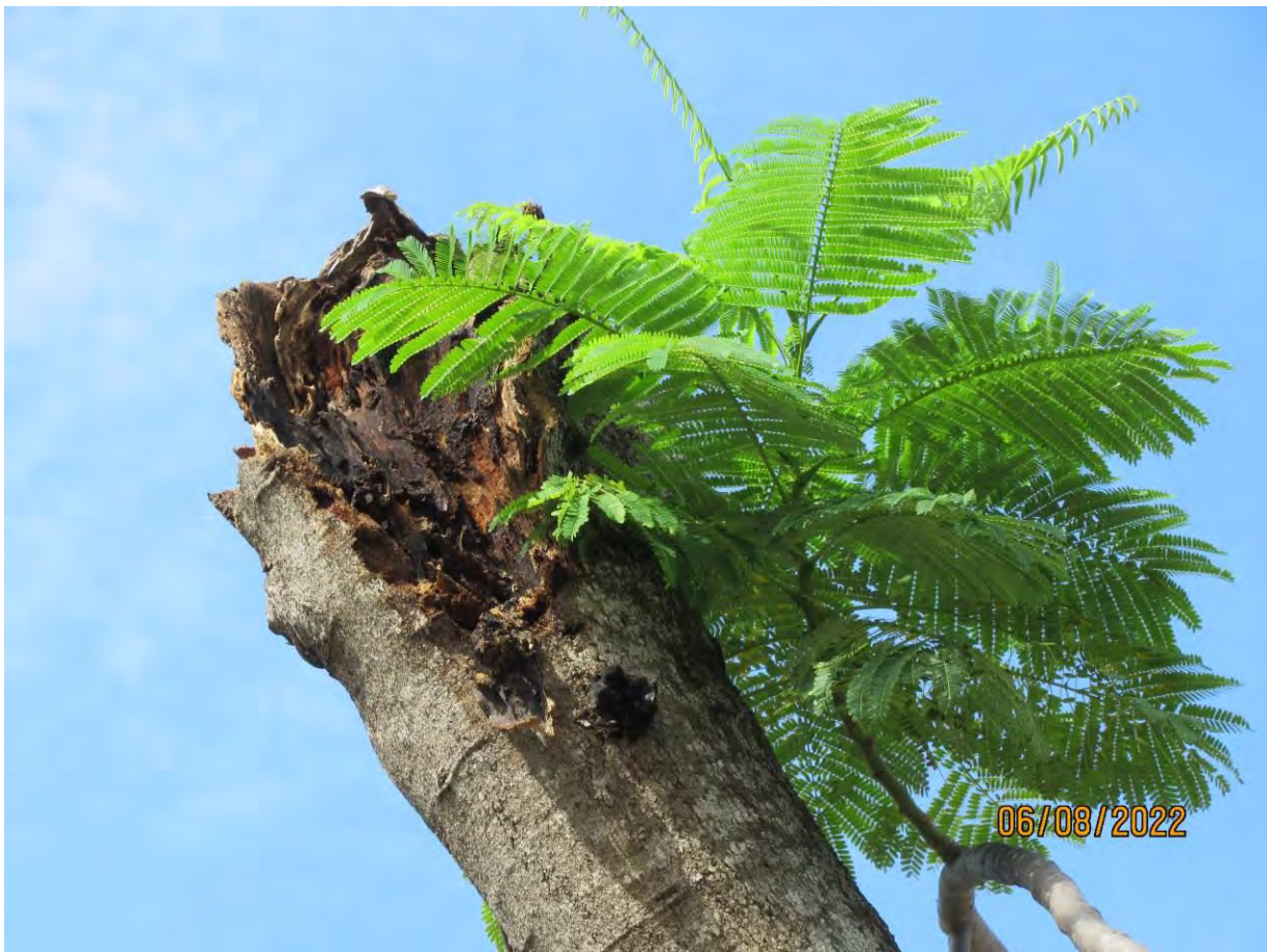
Close up photo of tree canopy, view 1.