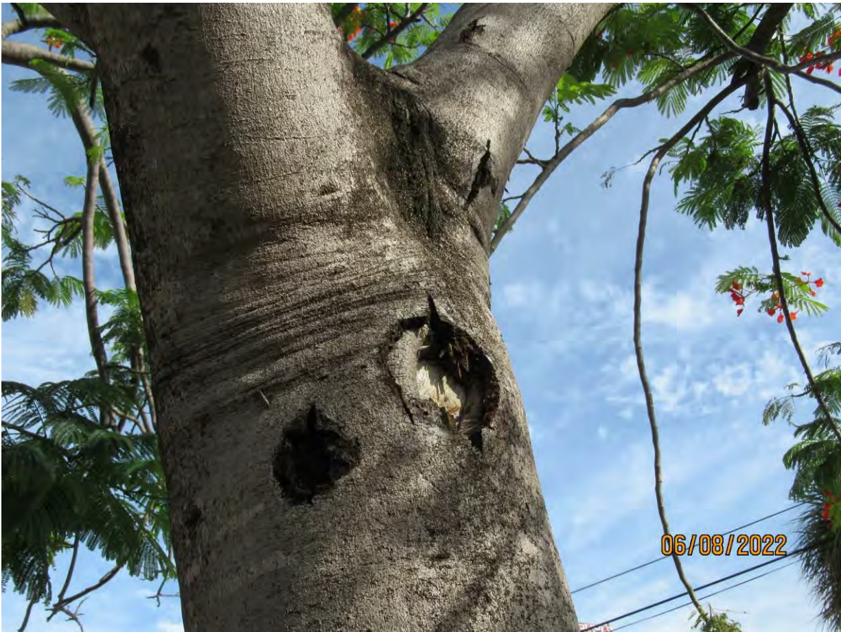
Photo of main trunk just below crotch area.