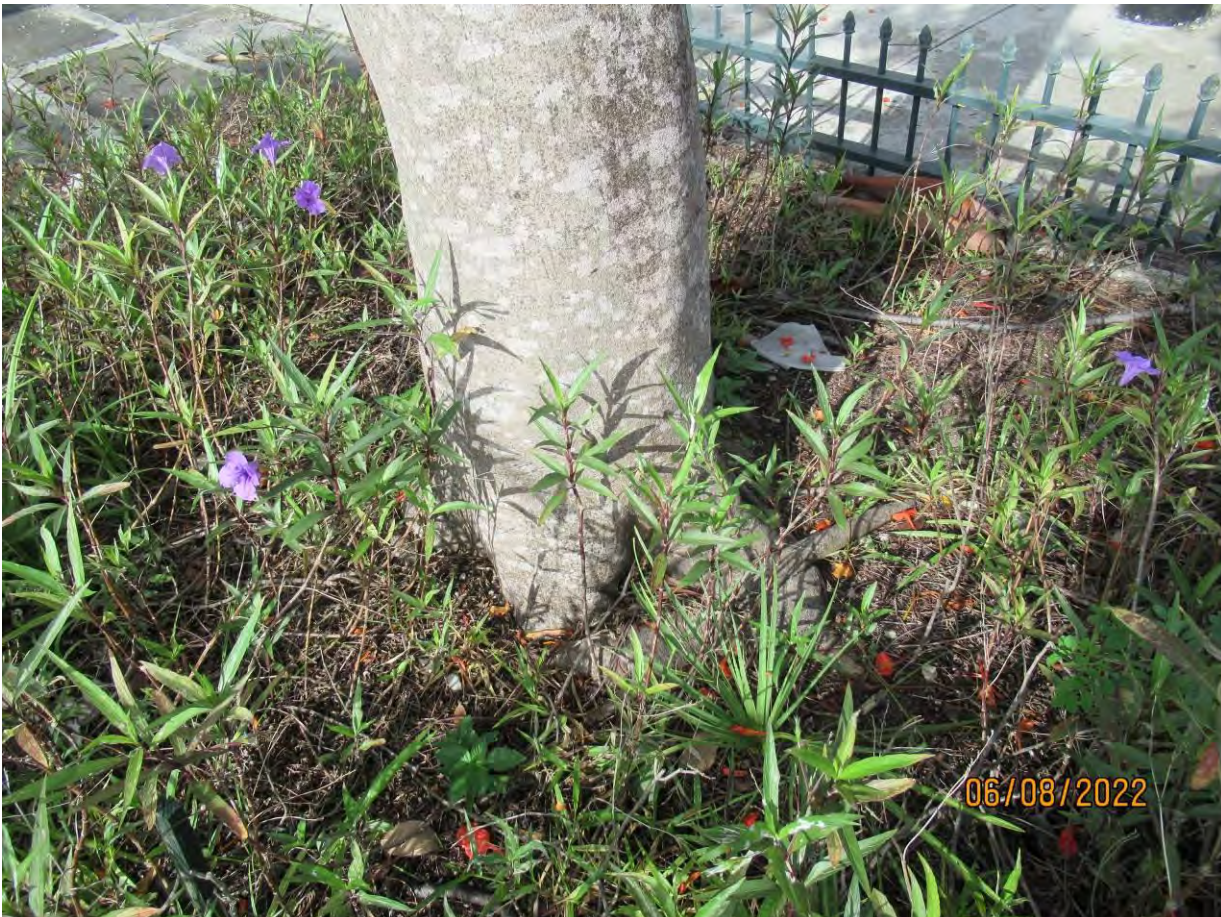
Photo of base of tree.