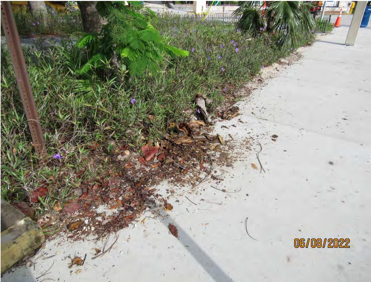
Photo of tree canopy debris on side walk.