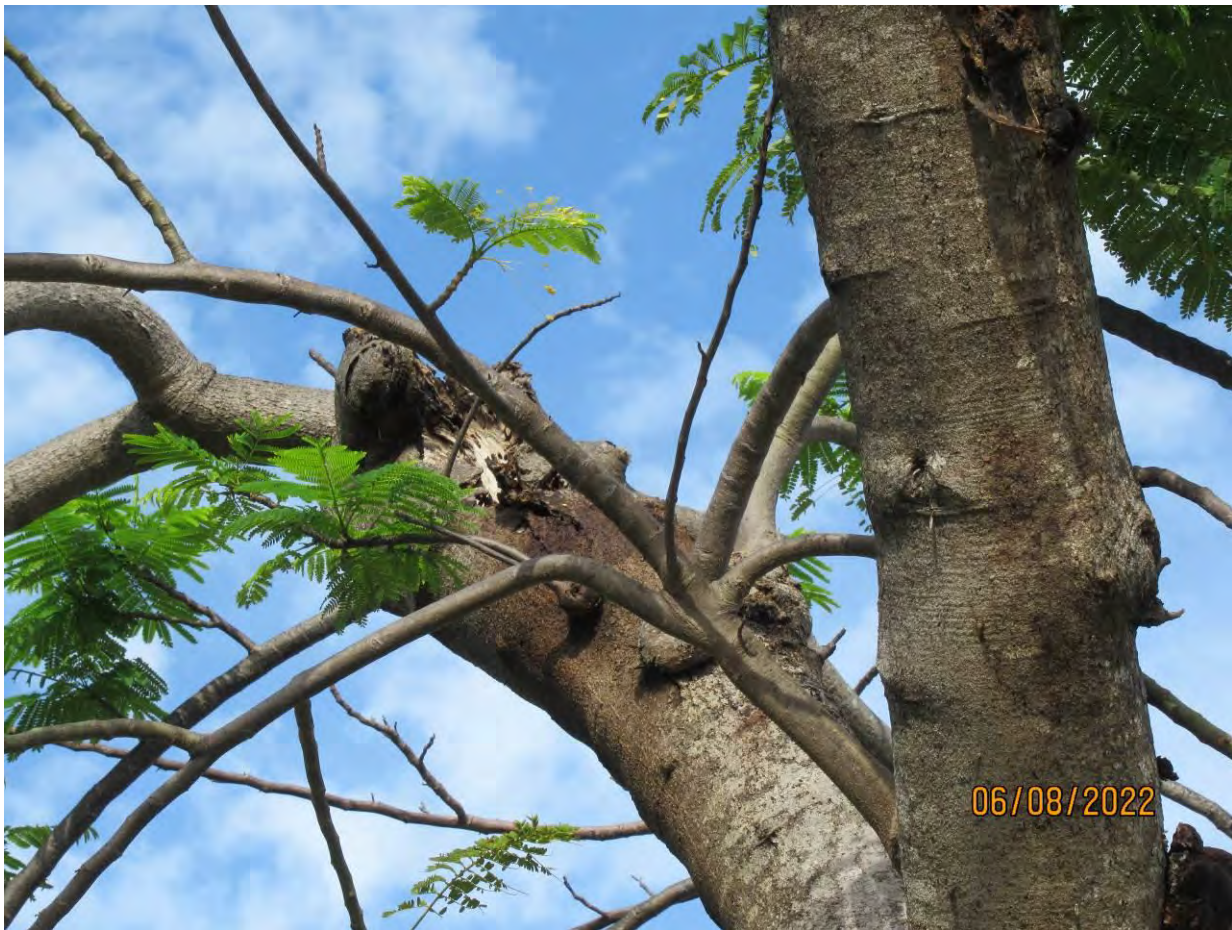
Close up photo of tree canopy, view 1.