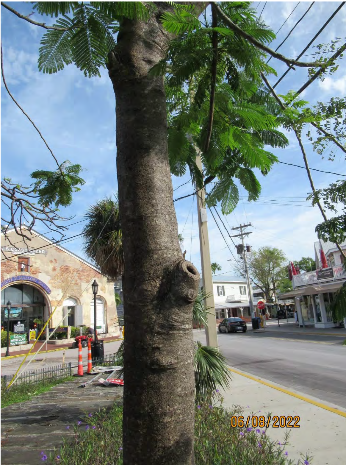
Photo of tree trunk.