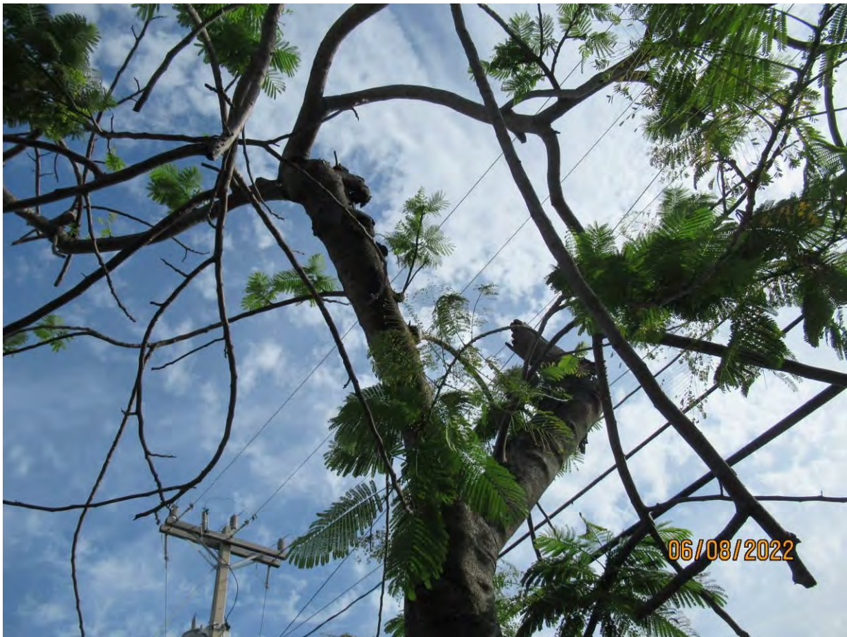
Photo of tree canopy, view 2.