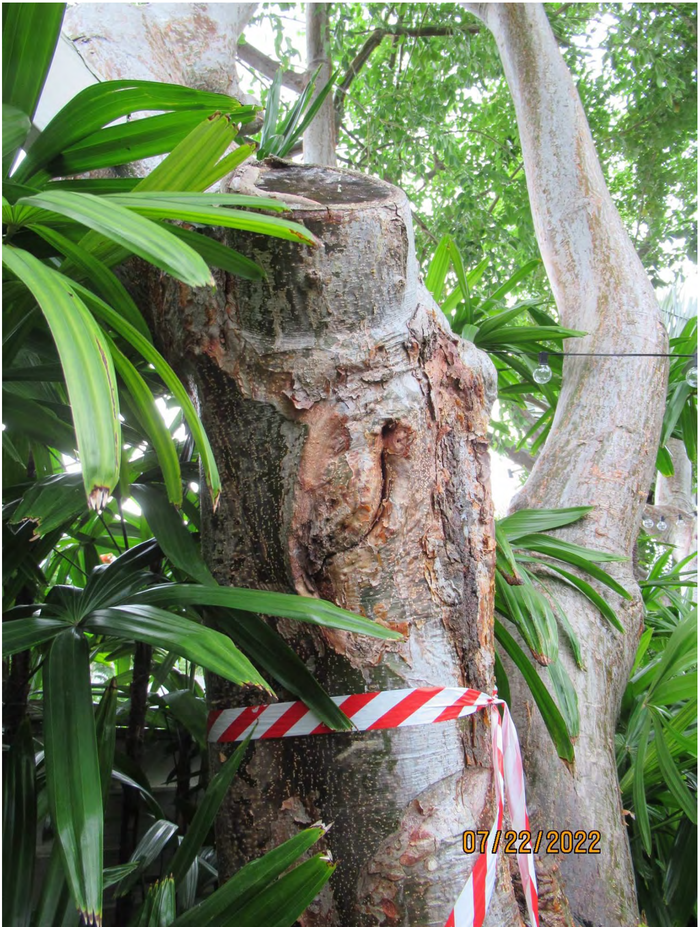
Photo of old injury/damaged area, view 1.