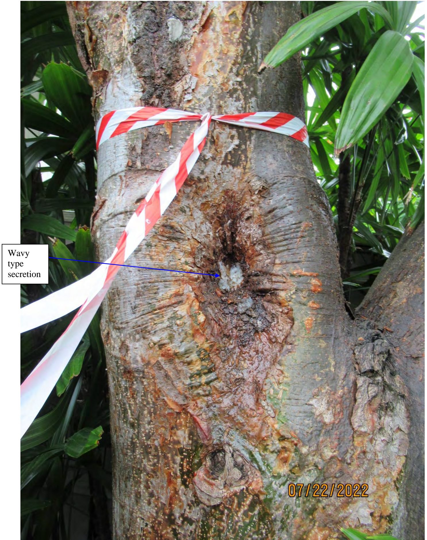
Photo of old injury/damaged area, view 4.