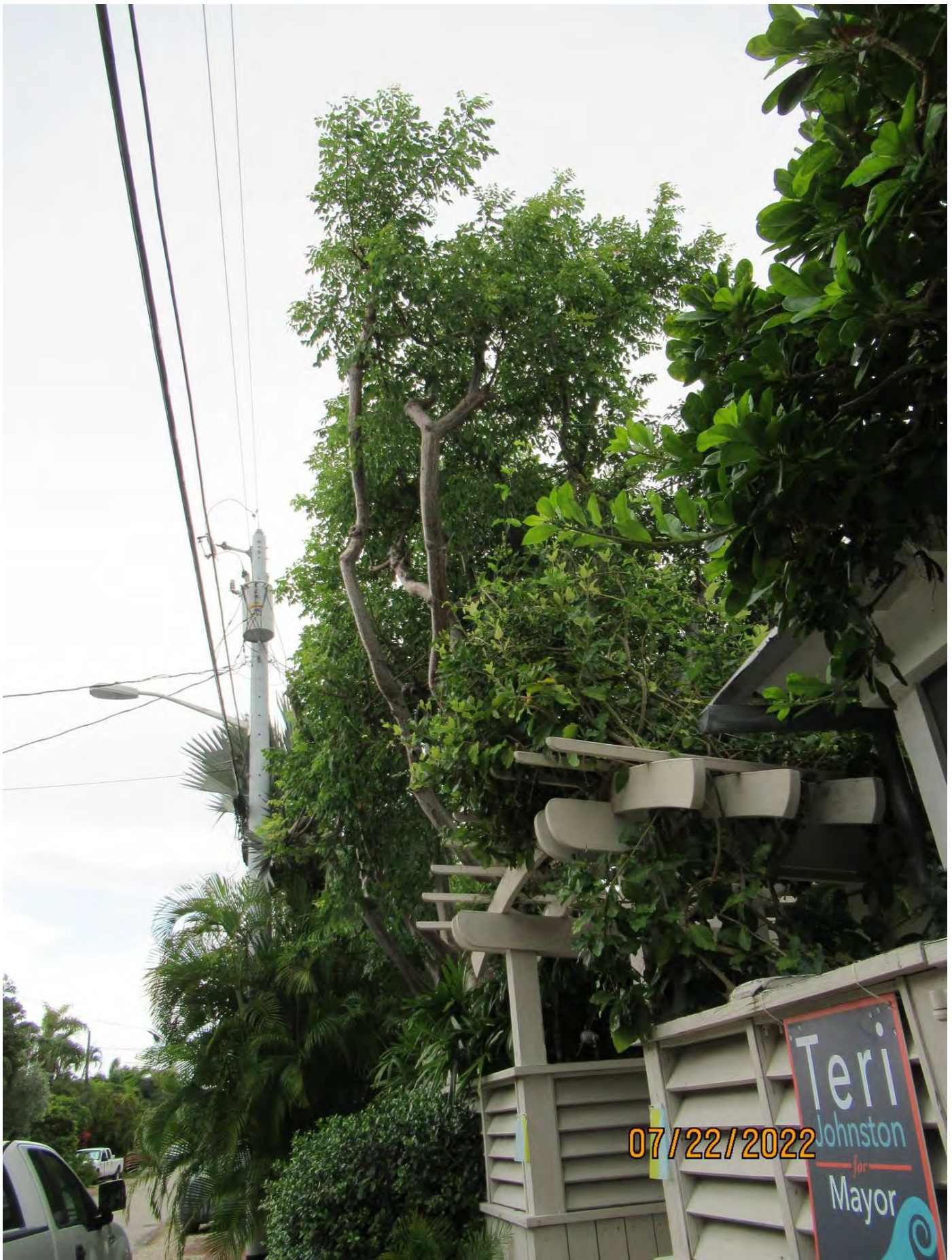
Photo of tree showing location of canopy in relation to utility lines.