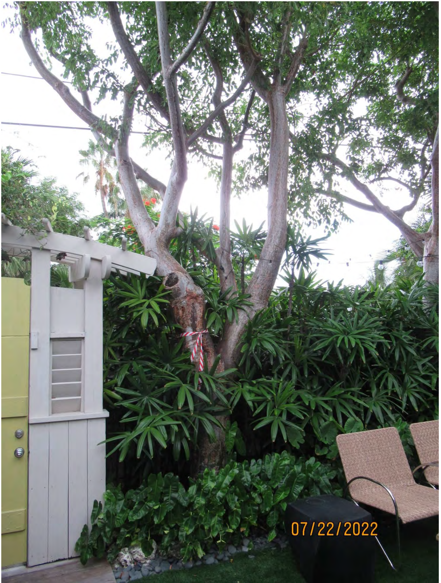
Photo of tree trunk and main canopy branches.