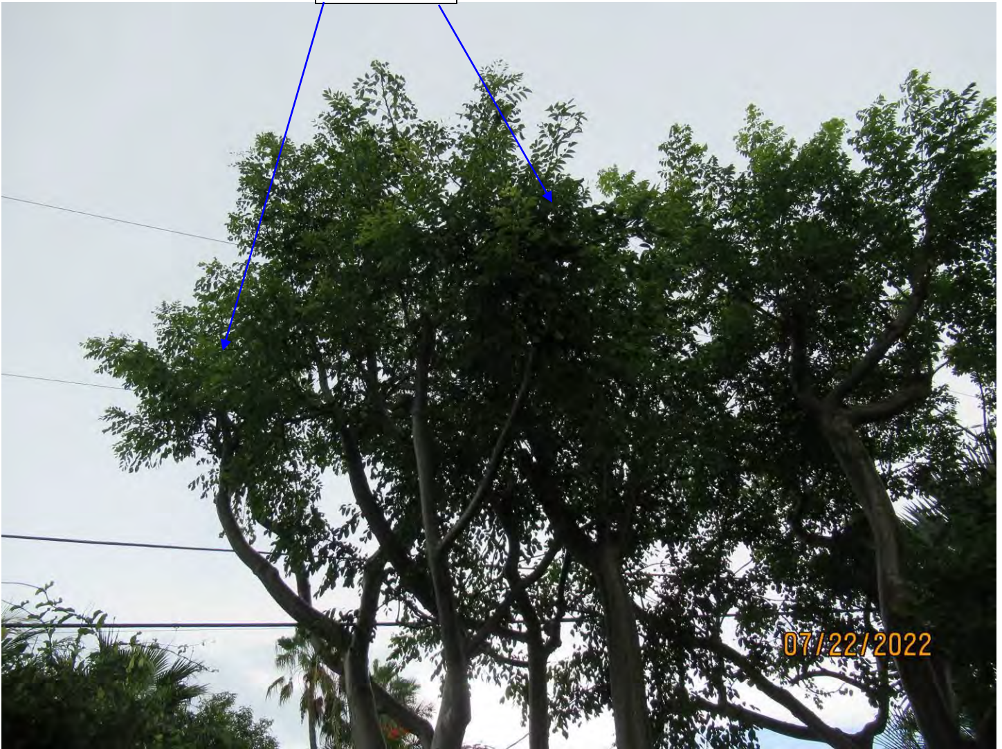
Photo of tree canopy.