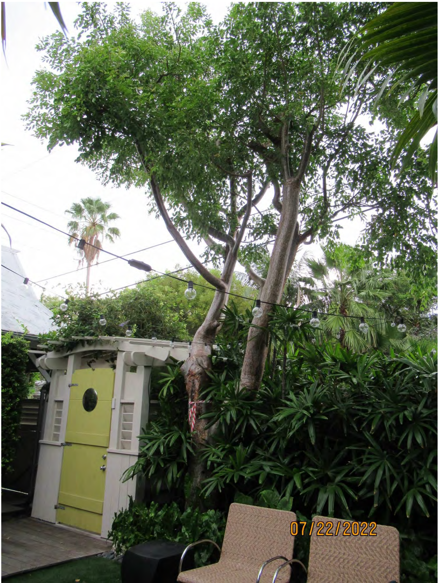
Photo of whole tree.