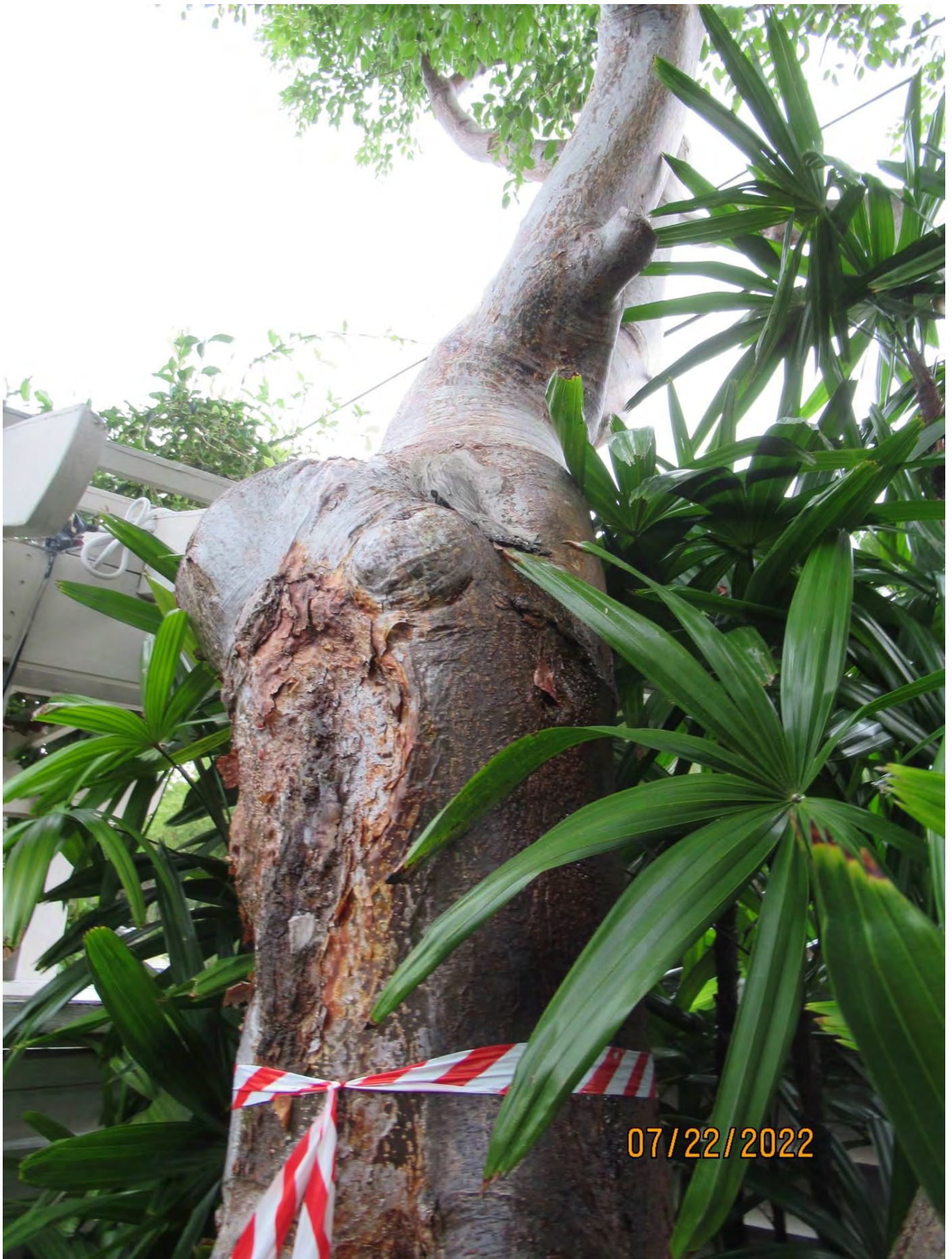
Photo of old injury/damaged area, view 2.