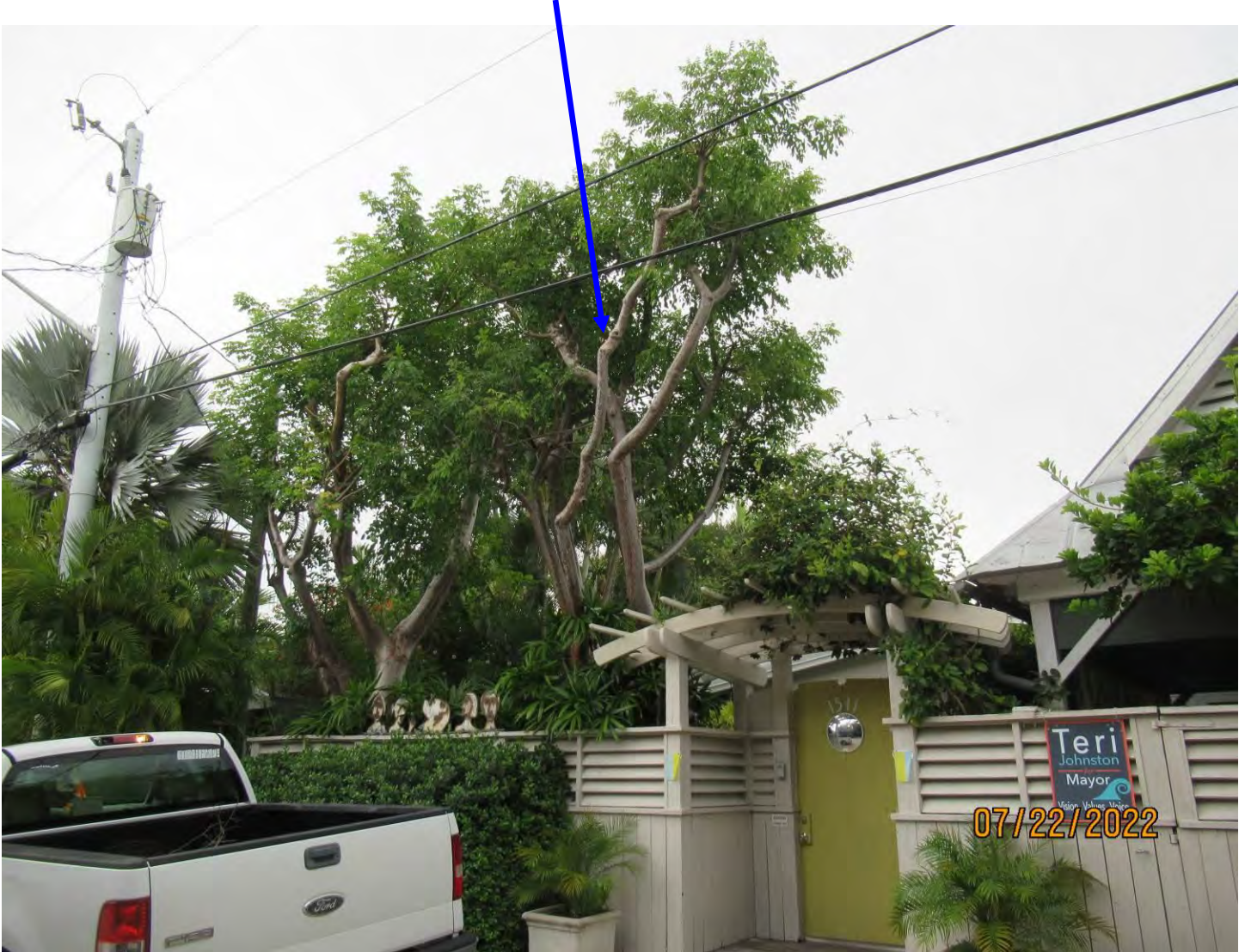
Photo showing location of tree.

Tree Species: Gumbo Limbo ( Bursera simaruba )