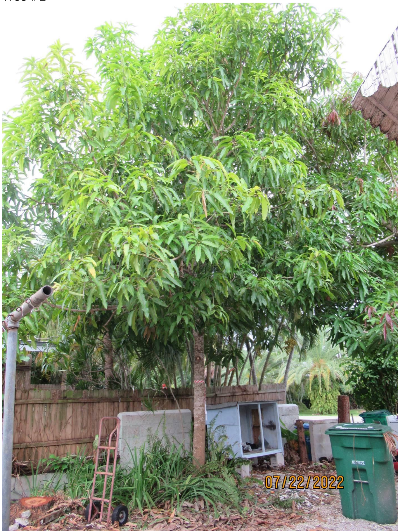
Photo of whole tree.