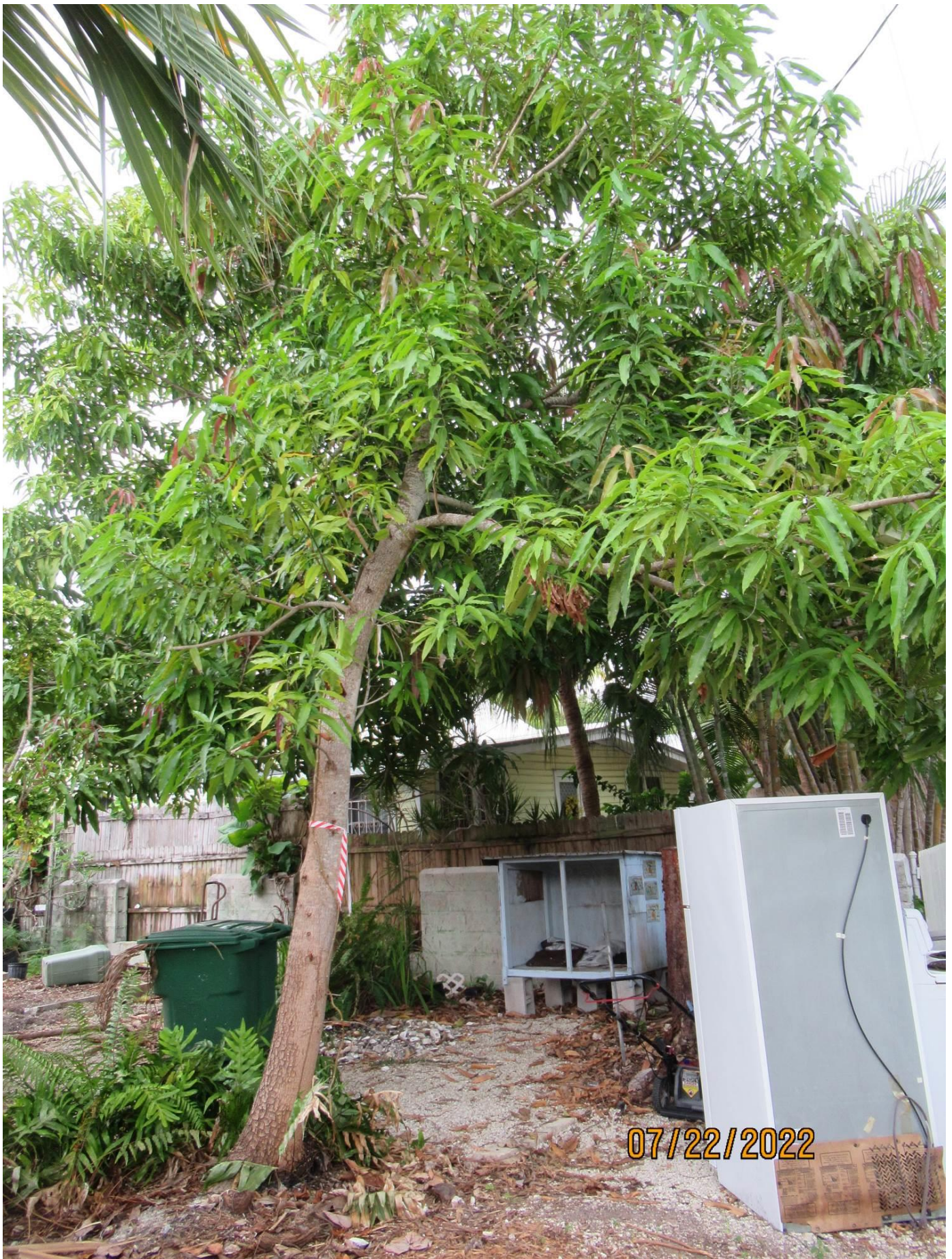
Photo of whole tree, view 2.