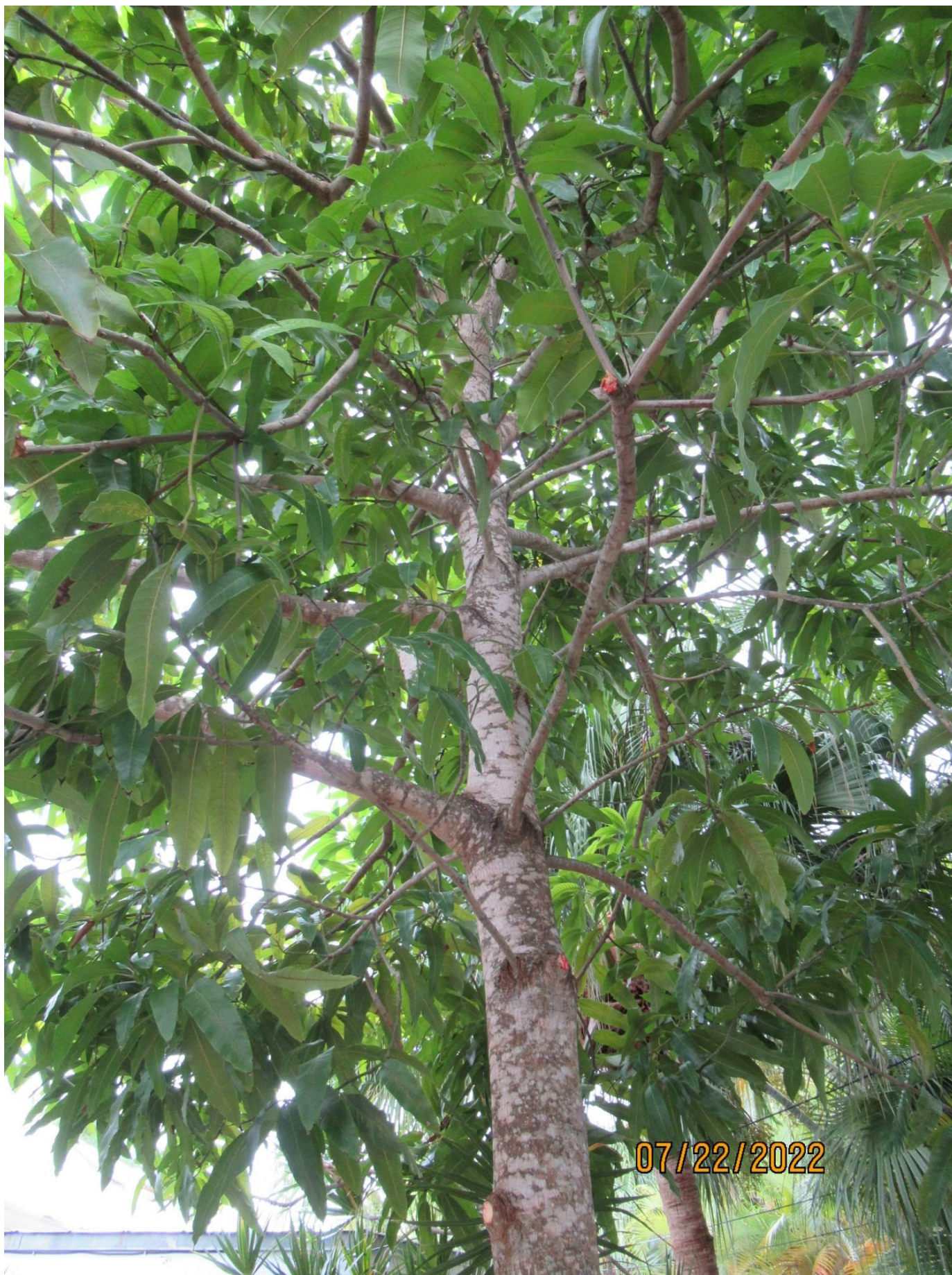
Photo of trunk and canopy branches.