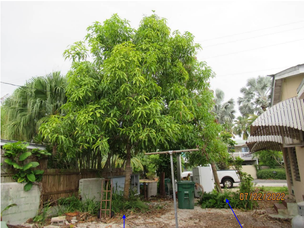
Photo showing locations of both trees, view 2.