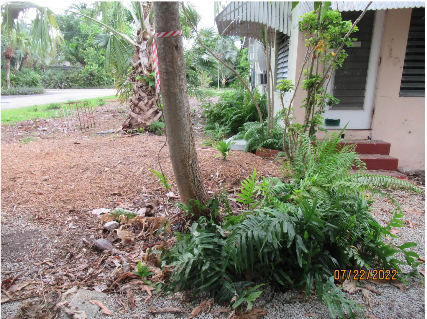
Photo of trunk and base area of tree.