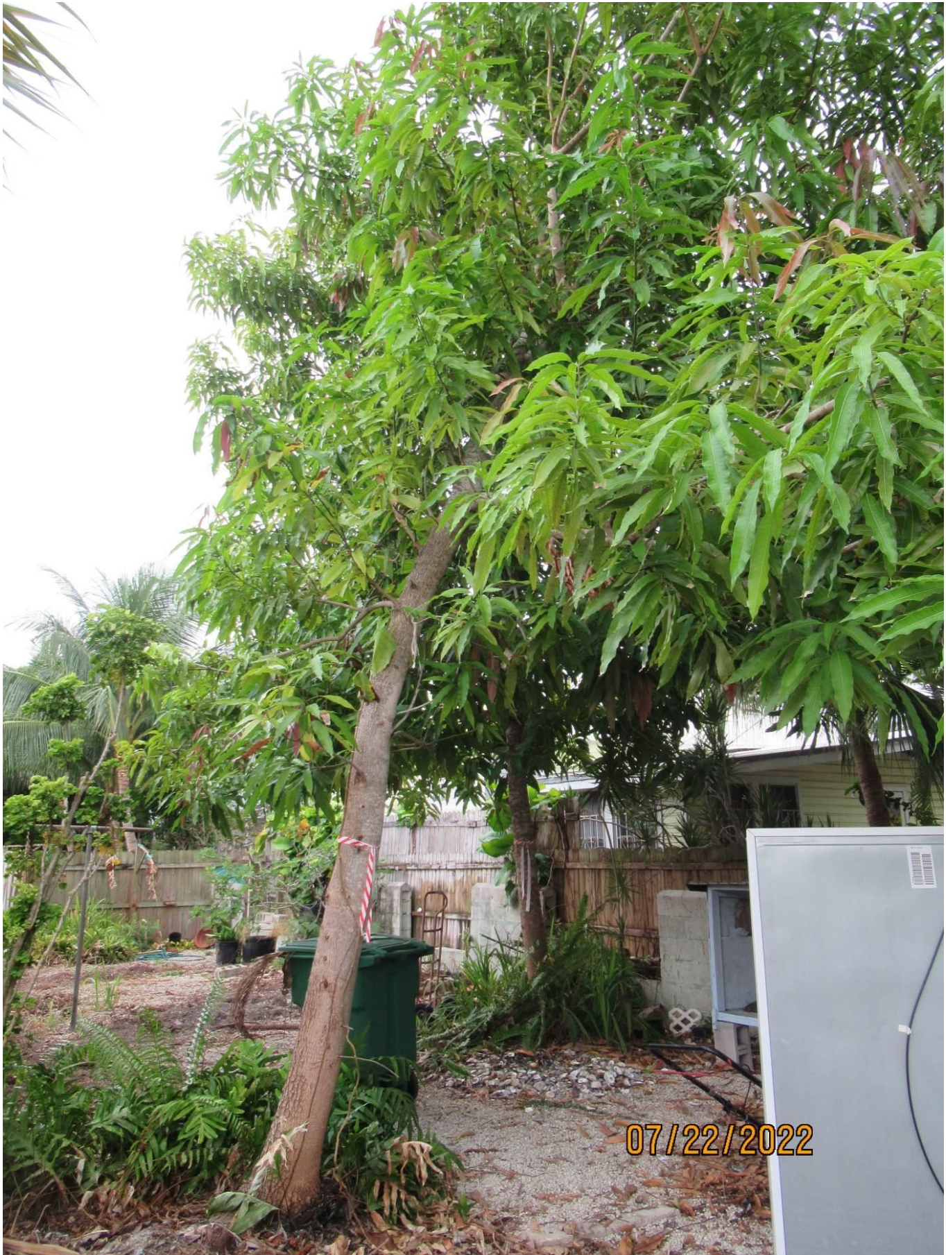
Photo of whole tree, view 1.