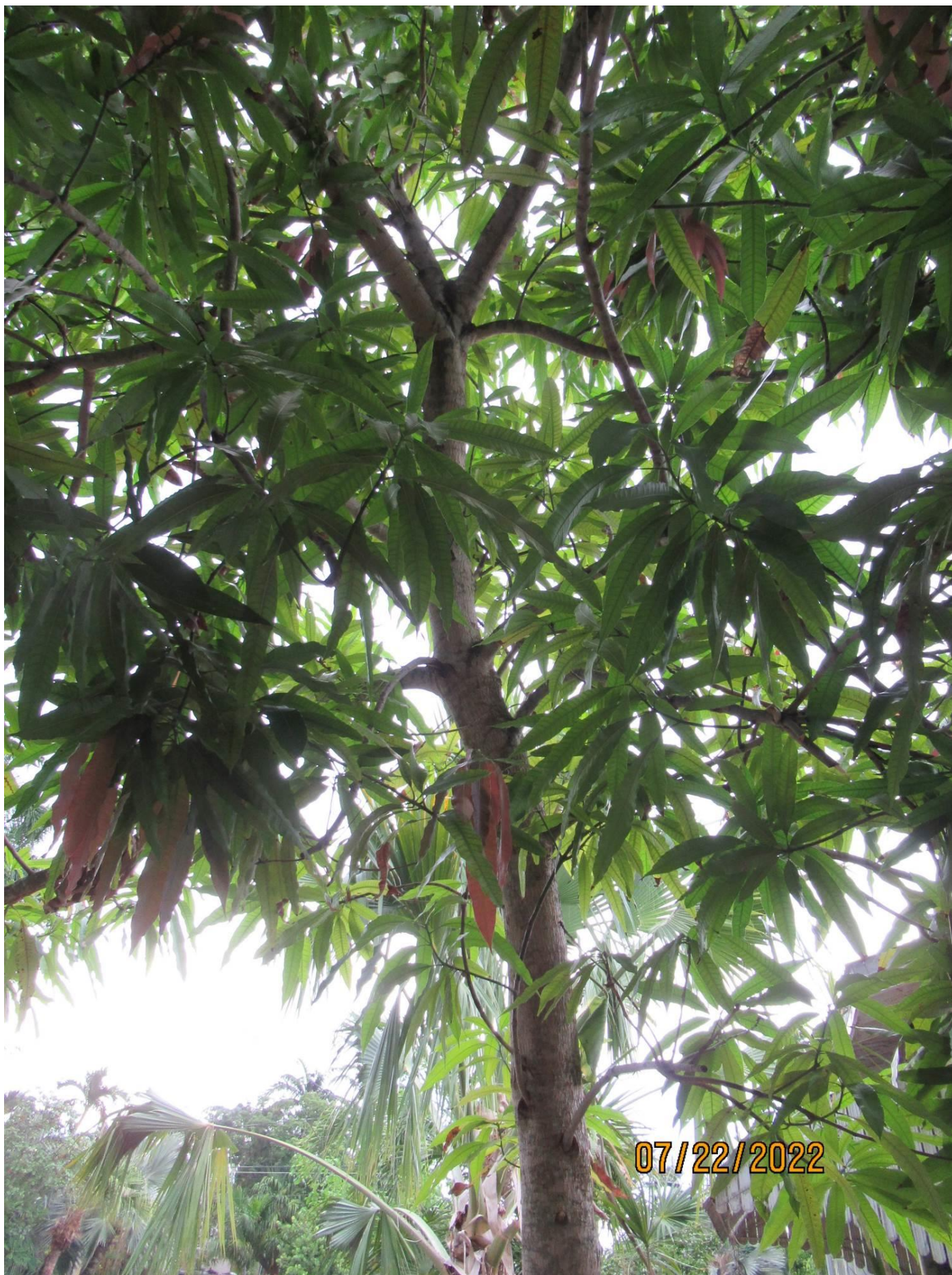
Photo of trunk and canopy branches.