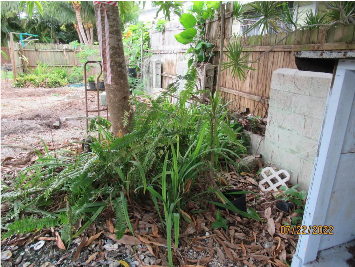
Photo of trunk and base of tree.