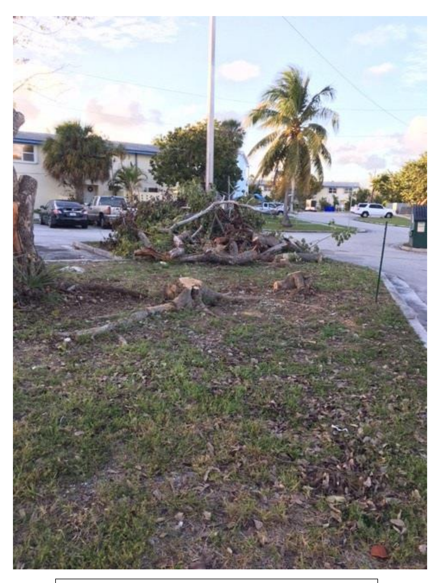
Photo showing tree, stumps, and vegetative debris pile, February 10, 2021.