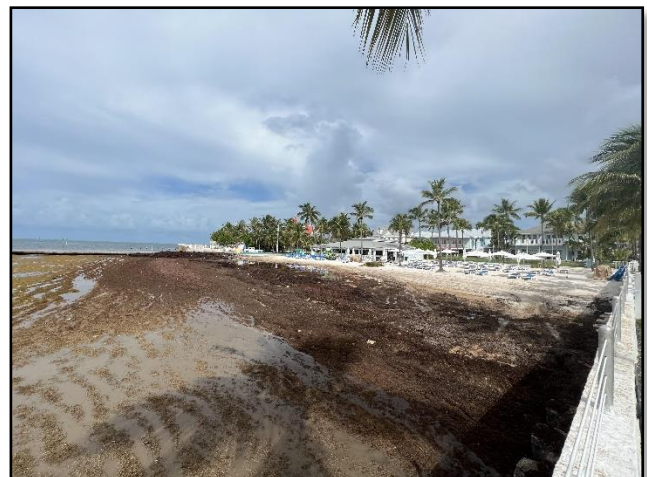
Photographs provided by the Applicant demonstrating seagrass accumulation on the beach of the Subject Property.