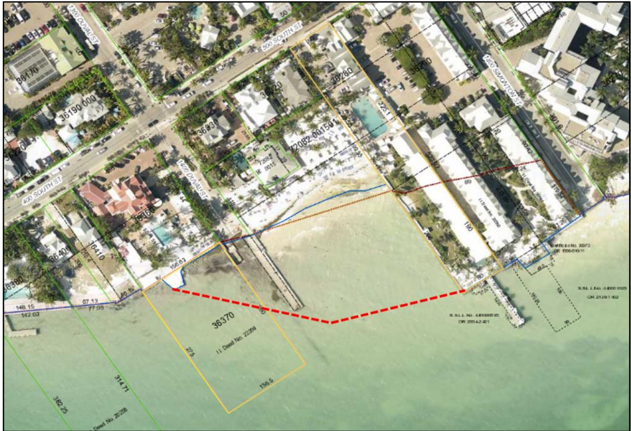
Aerial image showing the configuration of the proposed seaweed barrier with anchoring points at 1400 Duval Street and 508 South Street. The barrier system has an approximate length of 495 linear feet and will service an area approximately 61,791 square feet.

In addition to review of the proposal with respect to the City's land development regulations, the proposal was reviewed and approved by the Florida Department of Environmental Protection and the Army Corps of Engineers. Permit conditions provided by State and the Federal agencies shall be satisfied by the Applicant per the general condition of approval #5 in Resolution No. 2022-042, approved by the City's Planning Board on August 18 th , 2022.