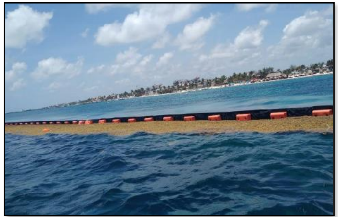
Typical section of seaweed barrier system and photograph of similar mechanism.