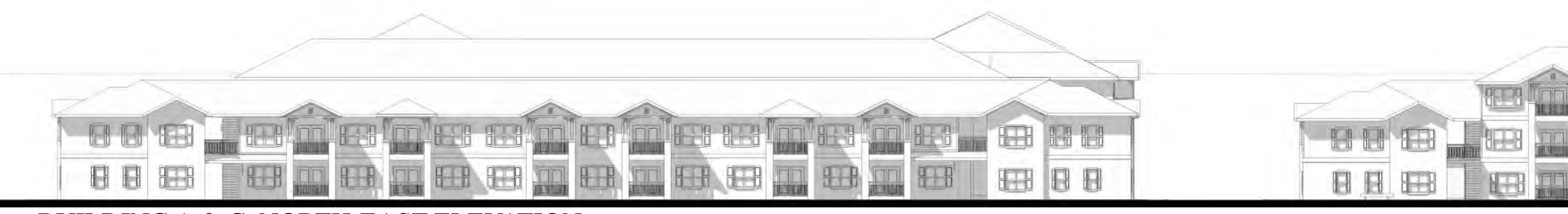
BUILDING A & C, NORTH-EAST ELEVATION