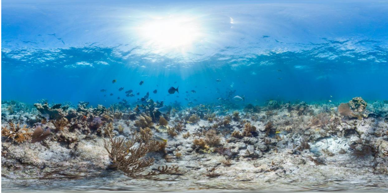
Molasses Reef frames a picture-perfect image of the Florida Keys ecosystem.

Goal 1 seeks to advance understanding of sanctuary resources and ecosystem services and ensure the best available science is used to inform conservation-based management decisions. Efforts to monitor changing conditions, the threats affecting ecosystems, and the role of ecological, environmental, and socioeconomic factors influencing these changes provide essential information needed to protect and conserve sanctuary resources.