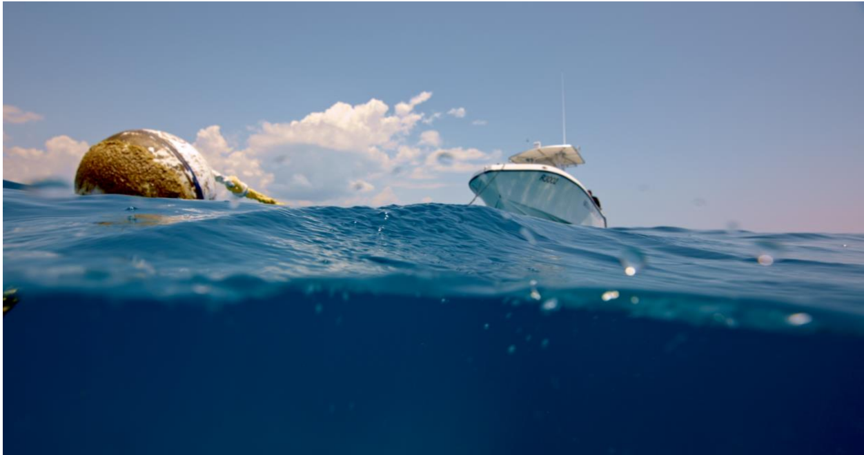
Florida Keys National Marine Sanctuary features more than 500 mooring buoys that allow boaters to visit Keys coral reefs without dropping anchor.

ONMS uses a multi-faceted approach to comprehensively address the variety of impacts, pressures, and threats to the Florida Keys marine ecosystem. It is only through this inclusive approach that the complex problems facing the sanctuary can be adequately addressed. The objectives and activities in Goal 3 are focused on managing and facilitating human uses of the sanctuary that are consistent with the primary objective of sanctuary resource protection.