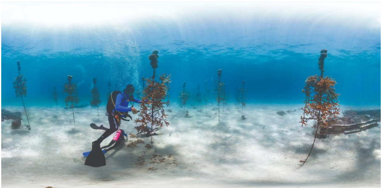
A diver works on a coral tree nursery where corals grow on lines tethered to the seafloor.

ONMS uses a variety of management measures to address resource threats within FKNMS. Understanding the effectiveness of those strategies is necessary to ascertain how well we are achieving our mission. ONMS will work with partners to conduct the necessary monitoring to evaluate management measures, and then shift or revise management approaches to address areas or issues where current resource protection efforts are not meeting the desired goals.