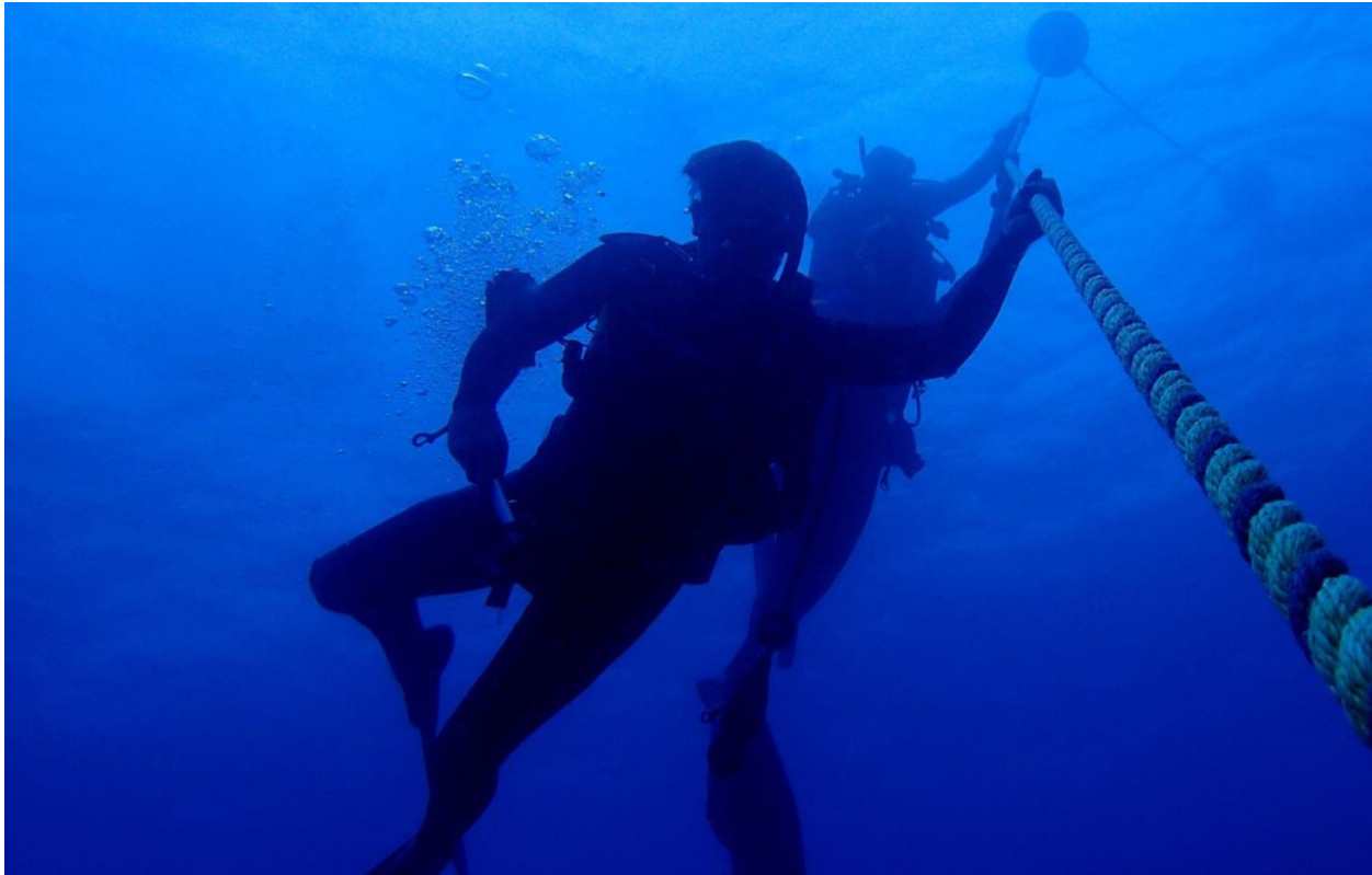
Florida Keys National Marine Sanctuary has teams positioned in the upper and lower Keys to maintain the expansive network of buoys, which include zone marker and informational buoys, in addition to moorings.

Florida Keys National Marine Sanctuary is managed in a partnership between NOAA, the state of Florida, and USFWS. Partnership has and continues to be at the core of how the sanctuary conducts its operations and programs. Partnership becomes ever more essential given shifting environmental conditions and threats, enhanced research interest and effort, and increased user activity across all sectors, which is coupled with increased agency roles and responsibilities and shifts in available fiscal and human capital resources. A focus on strengthened and enhanced engagement with partners will be integrated in all aspects of operations as ONMS strives to most efficiently and effectively implement its updated management plan, regulations, and marine zoning scheme. International collaboration is also important, given the ecological connectivity within the Gulf of Mexico and Caribbean.