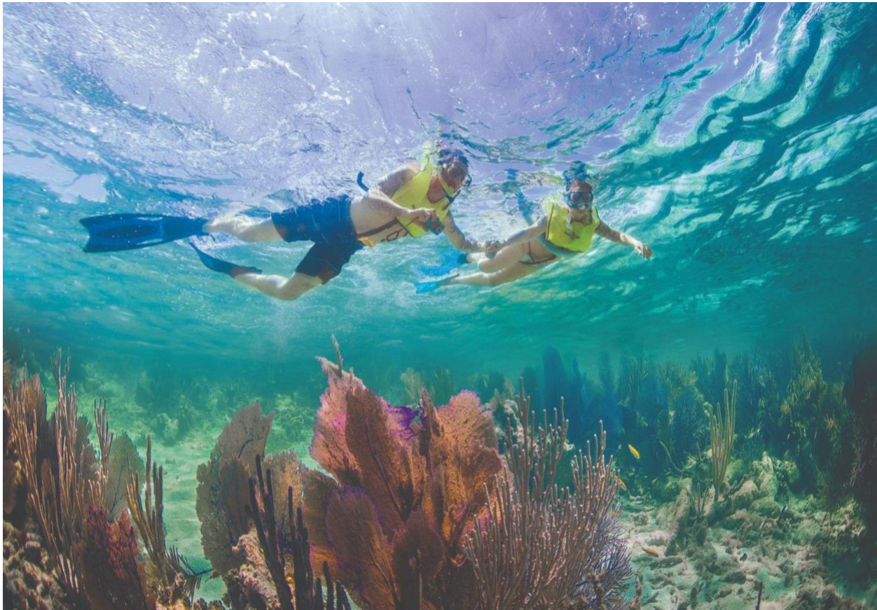
Many reefs in the Florida Keys are found in shallow waters that are accessible by snorkeling.

Communication and education underpin all of the other goals and objectives and, as such, will be integrated across all FKNMS management. Communication and education areas of focus include media, outreach for education, informal education and interpretation, community/constituent engagement, and volunteer coordination as outlined below. Communication and education efforts must be strategic, coordinated, and focused. To that end, the overarching priority is to implement the sanctuary's Media Outreach Volunteer and Education Team Strategic Plan that will inform more specific priorities within each objective.