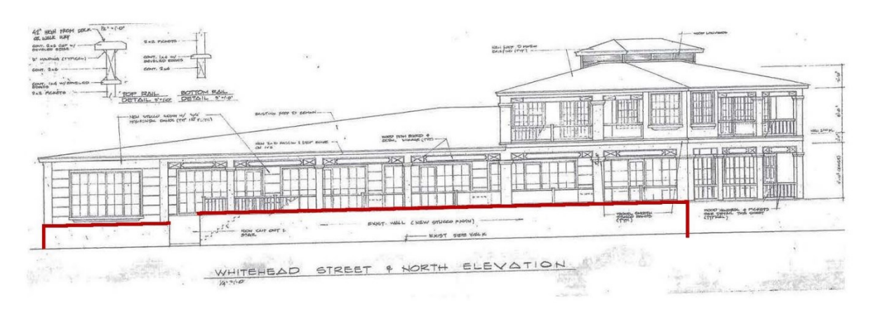
Location of proposed mural

The proposed mural is not part of required art under the Art in Public Places Program, but a contribution from the owner to enhance the existing conditions of her private commercial property. The owner has been inspired by the City's new design of Clinton Square and wants to become an integral part of enhancing this area of the historic district.