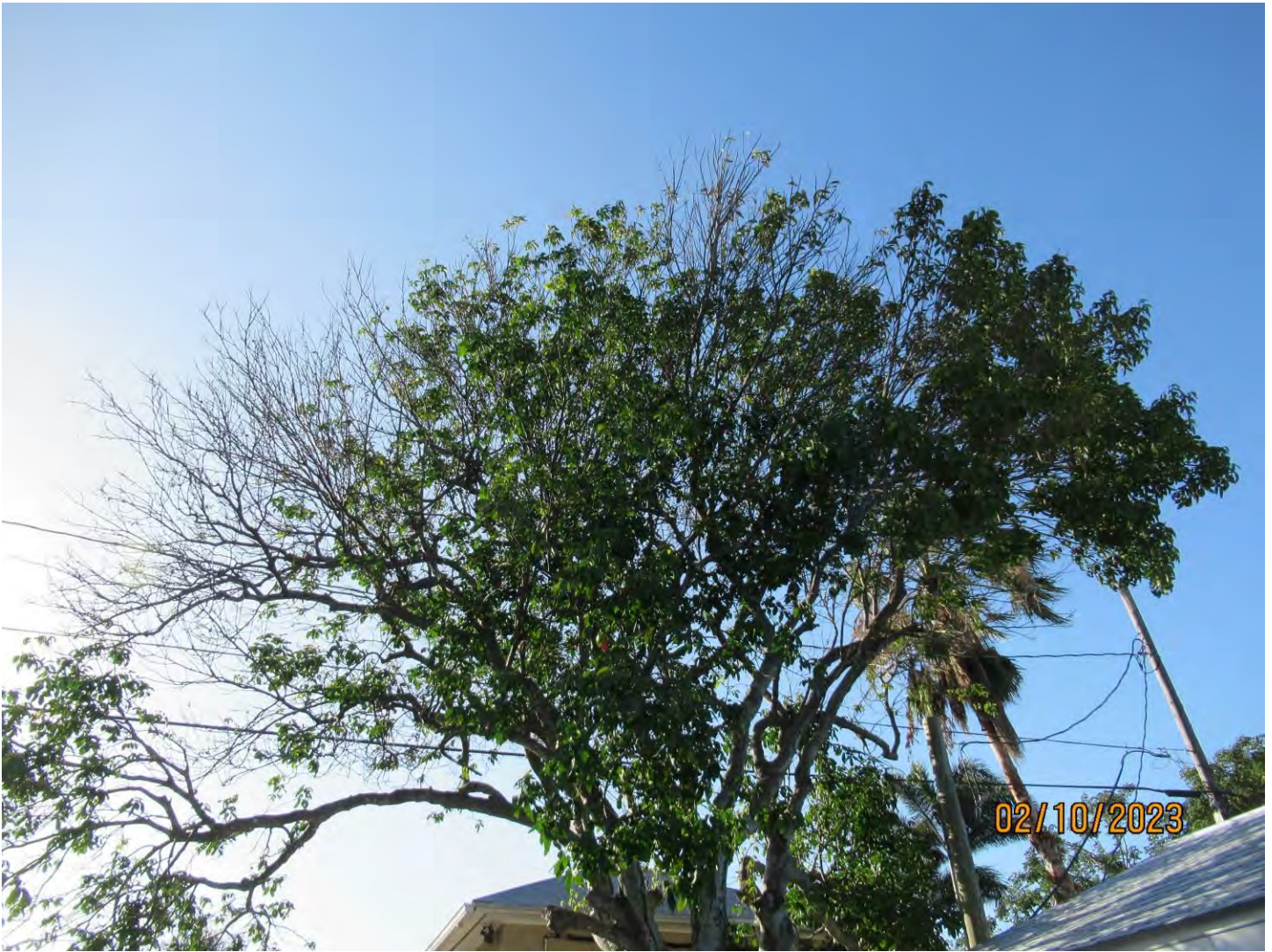
Photo of tree canopy, view 3.