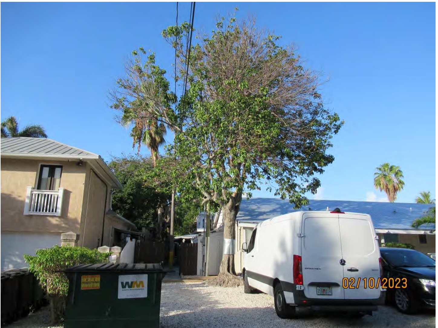
Photo showing location of tree.

Tree Species: Spanish Lime ( Melicoccus bijugatus )