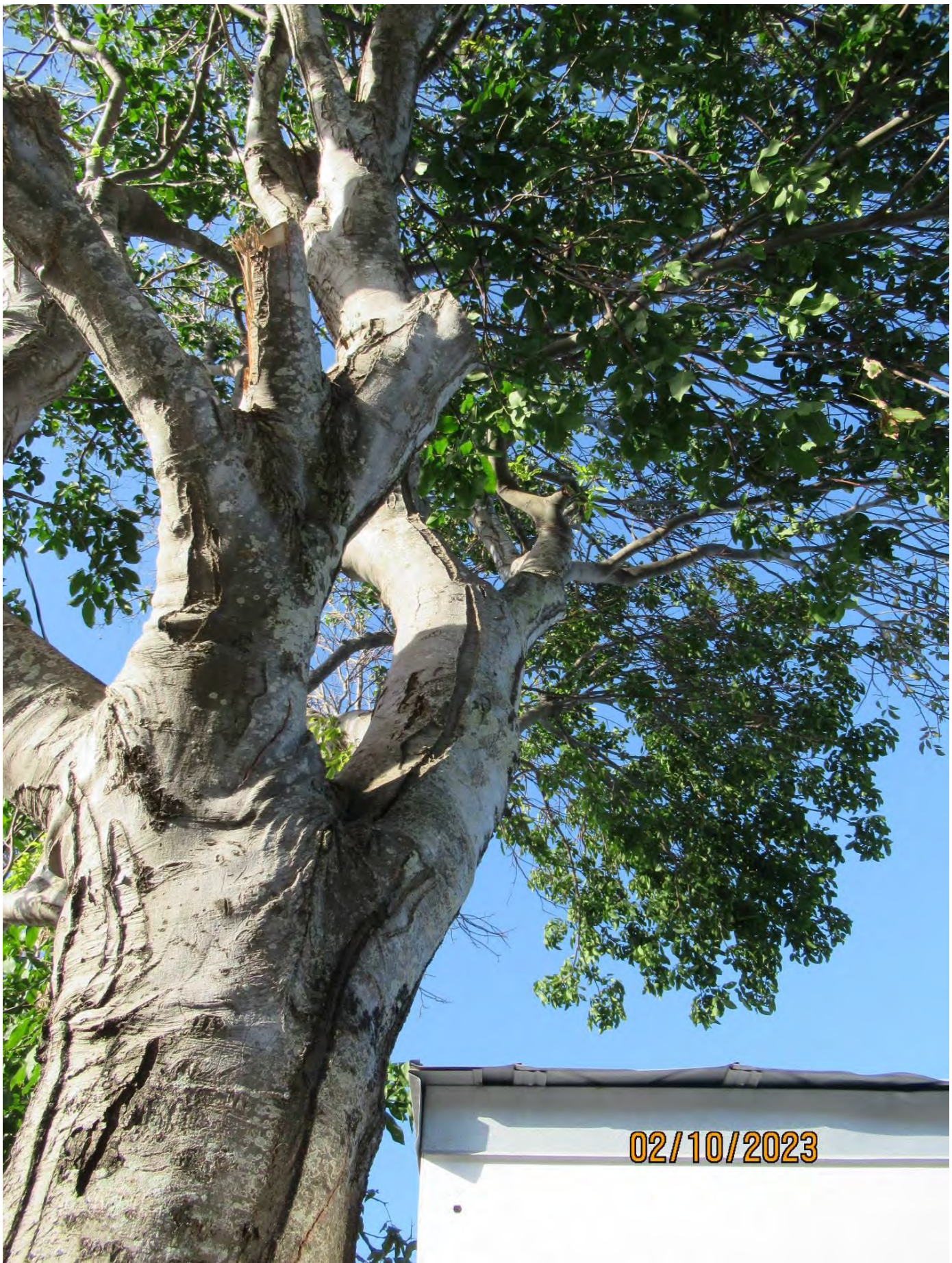
Photo of tree trunk showing location in relation to structure, view 3.