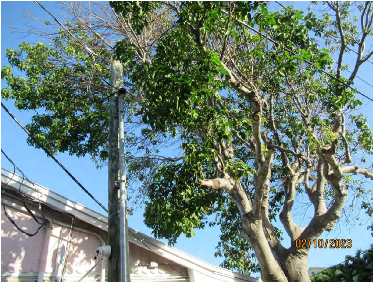
Photo of tree canopy and utility lines, view 2.