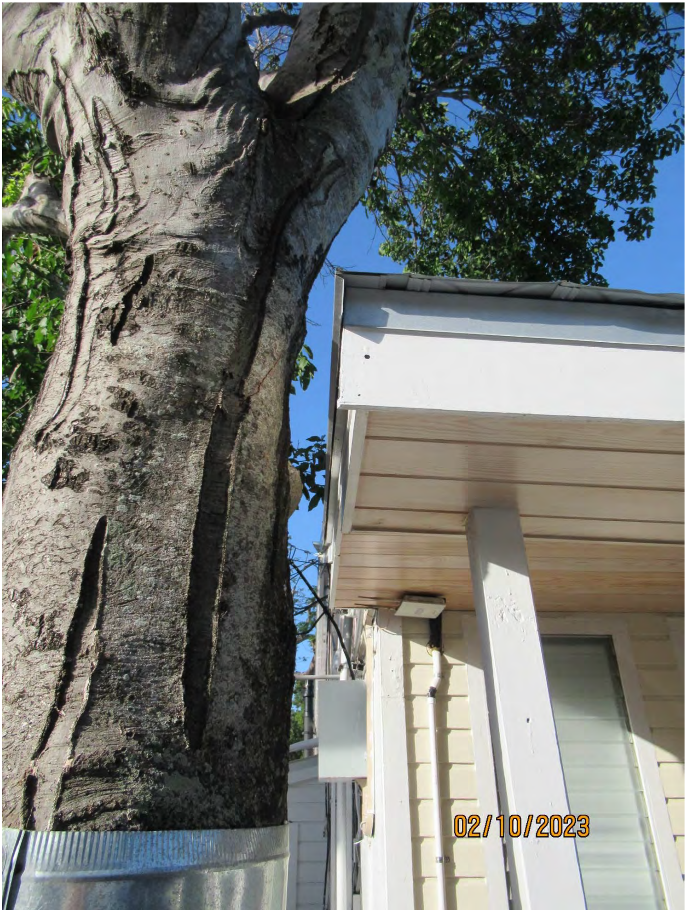
Photo of tree trunk showing location in relation to structure, view 2.