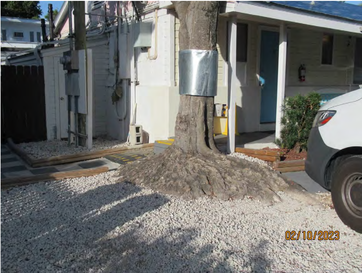
Photo of base of tree, view 1.