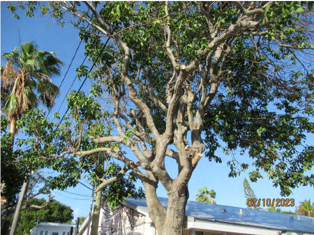
Photo of tree canopy, view 2.