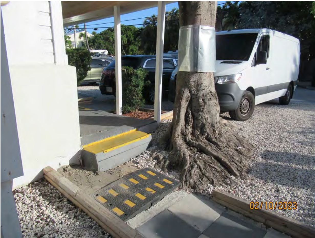
Photo of base of tree, view 2.