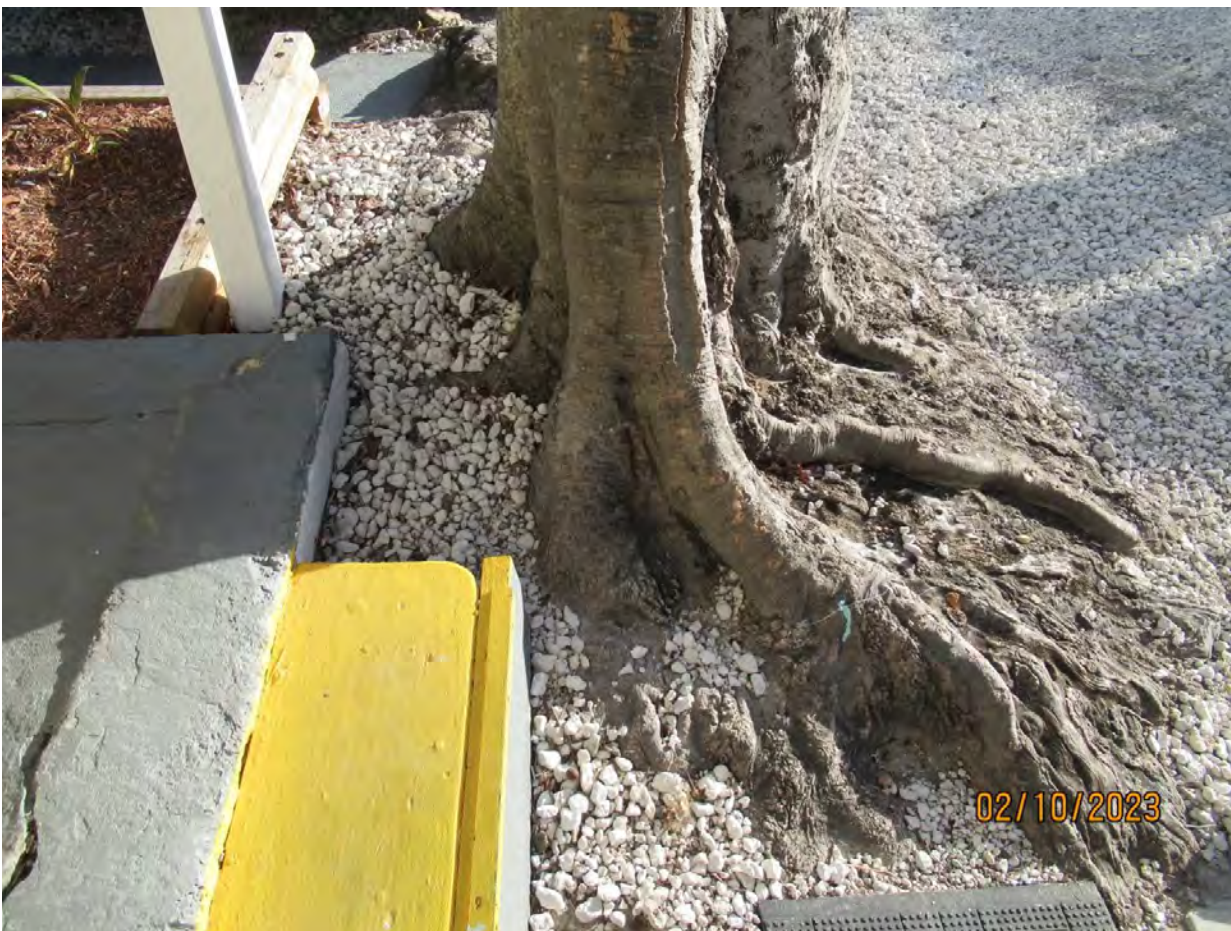
Photo of base of tree, view 3.