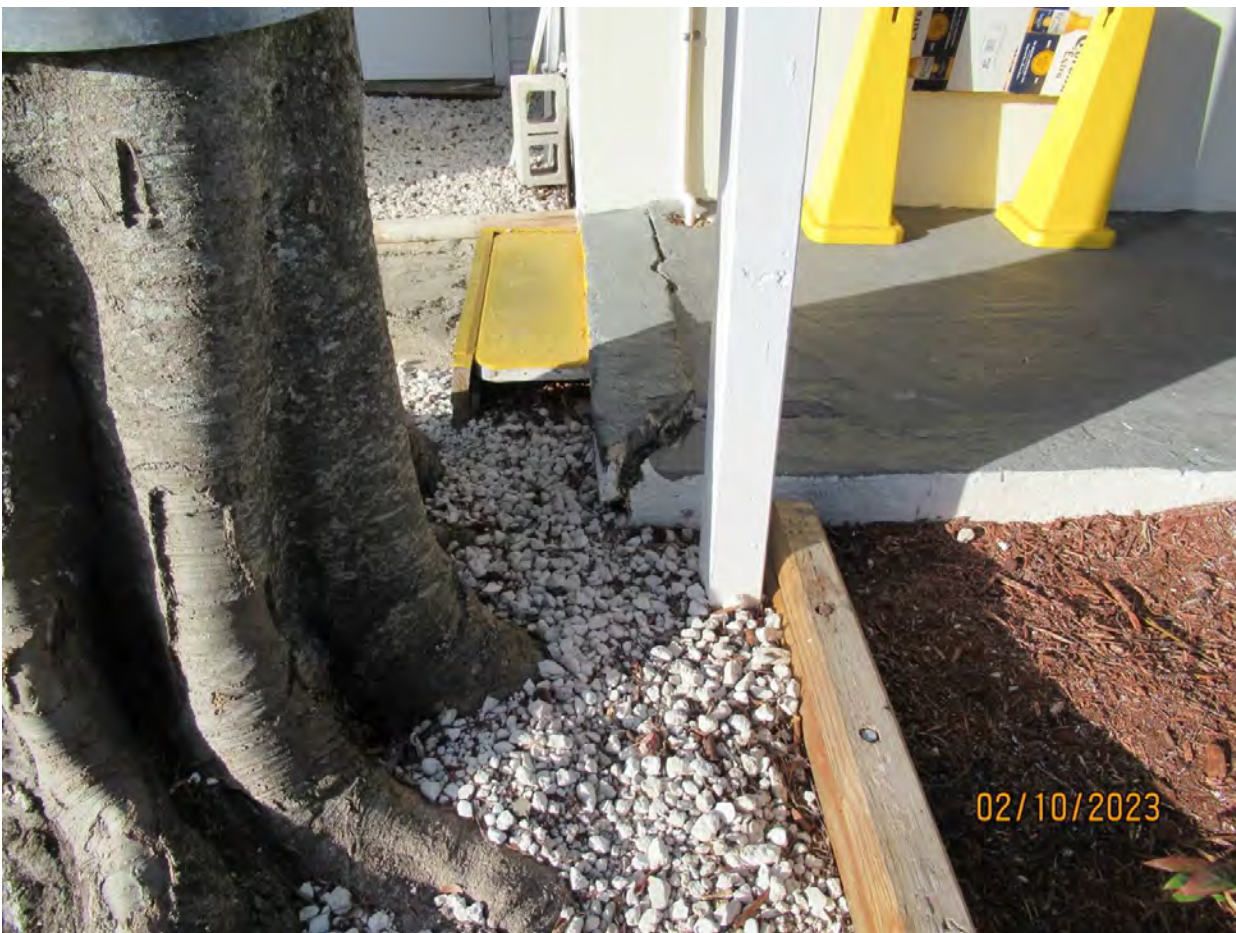
Photo showing base of tree in relation to structure, view 1.