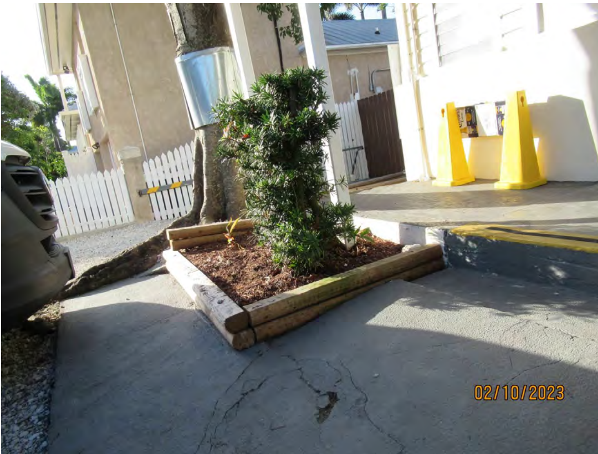
Two photos showing root impacts to walkways and planter.