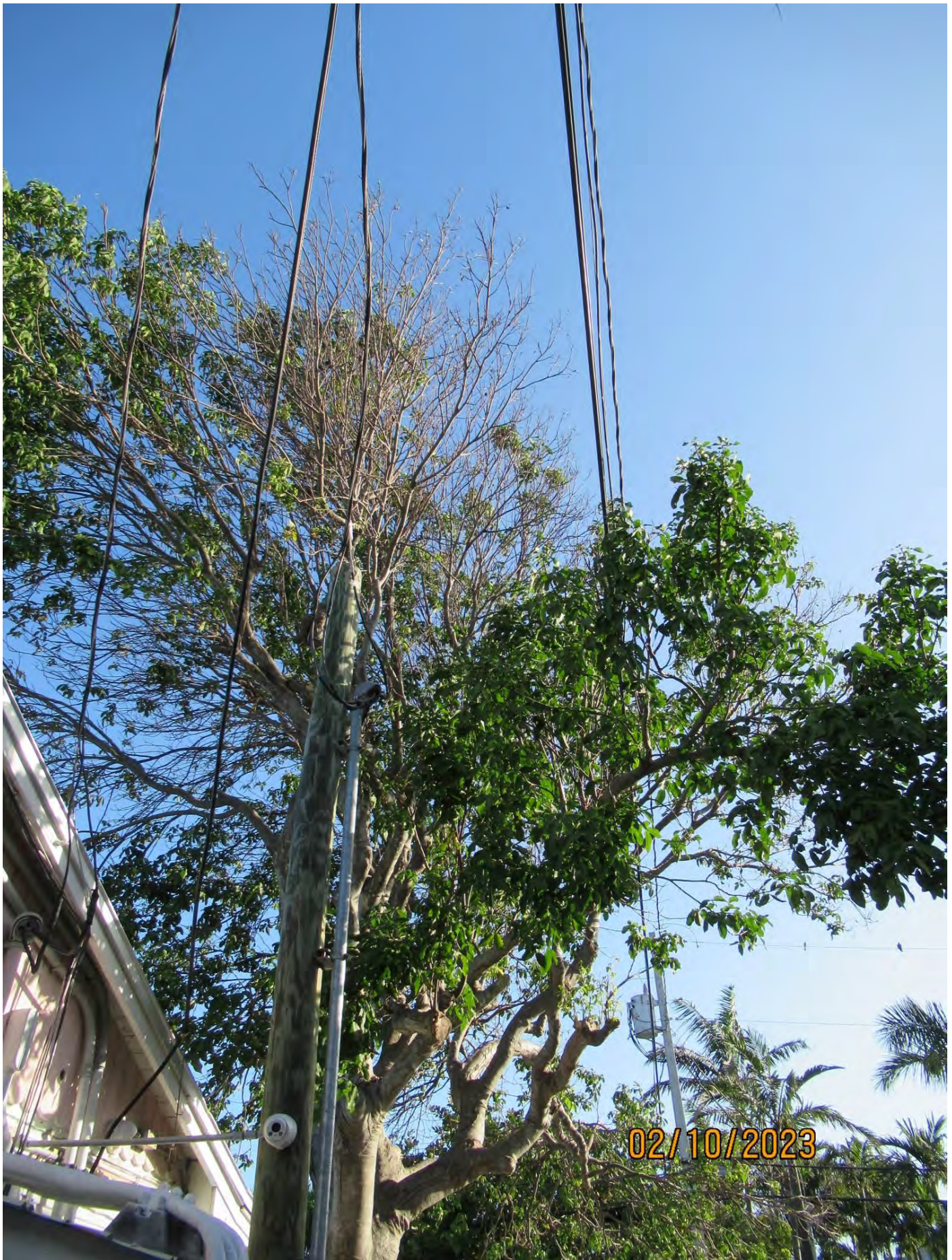
Photo of tree canopy and utility lines, view 1.