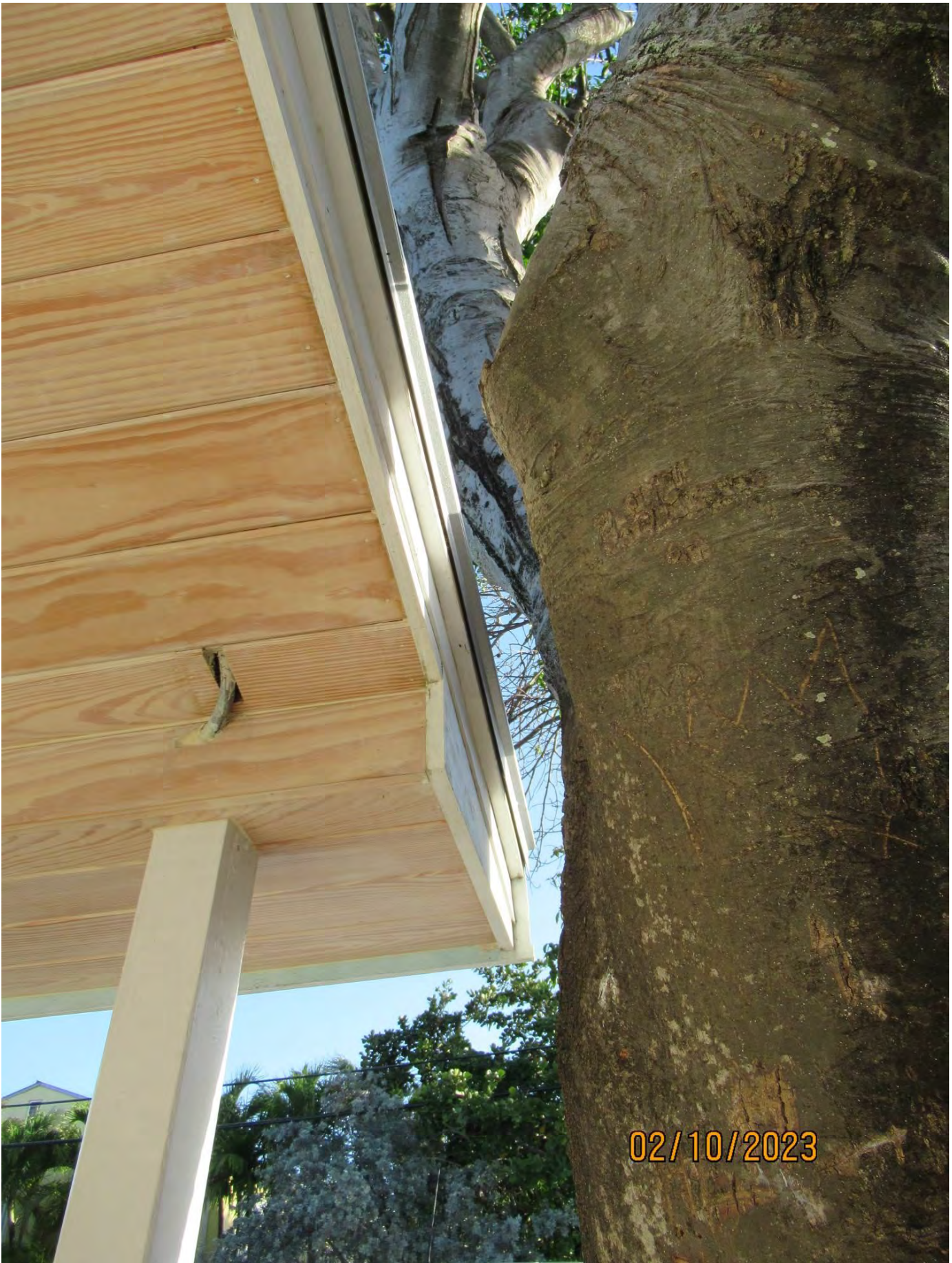
Photo of tree trunk showing location in relation to structure, view 1.