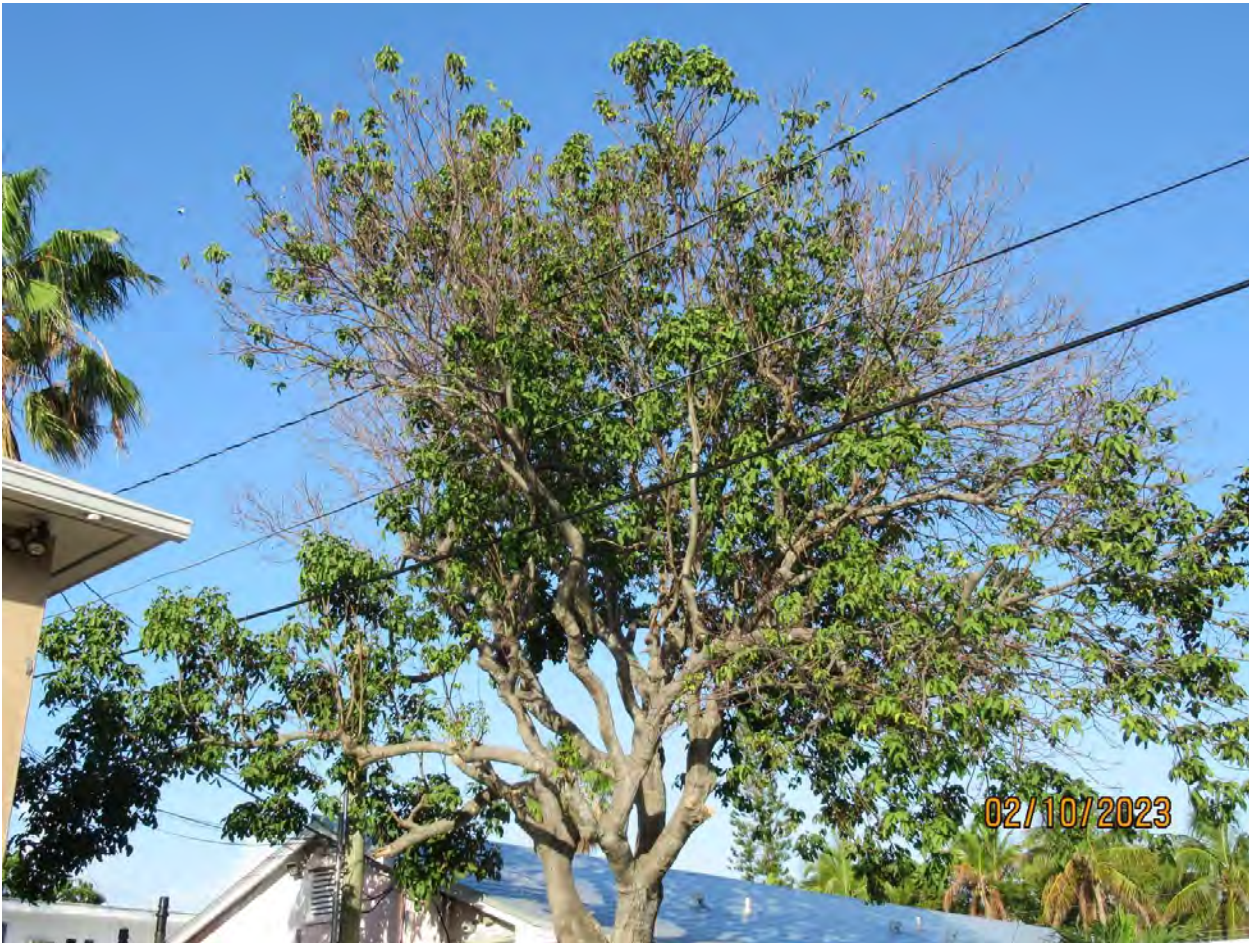
Photo of tree canopy, view 1.