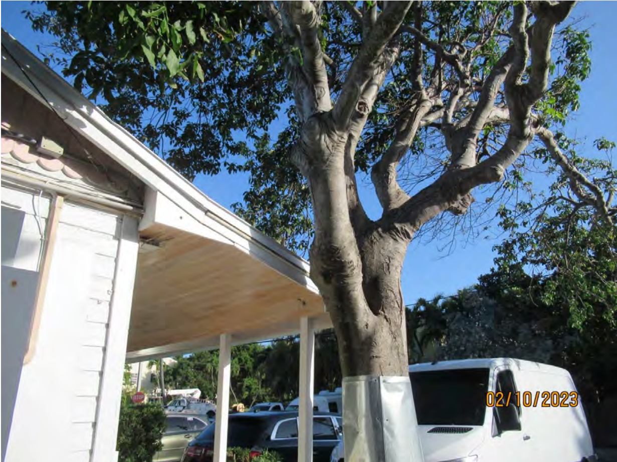
Photo of tree trunk and canopy branches.