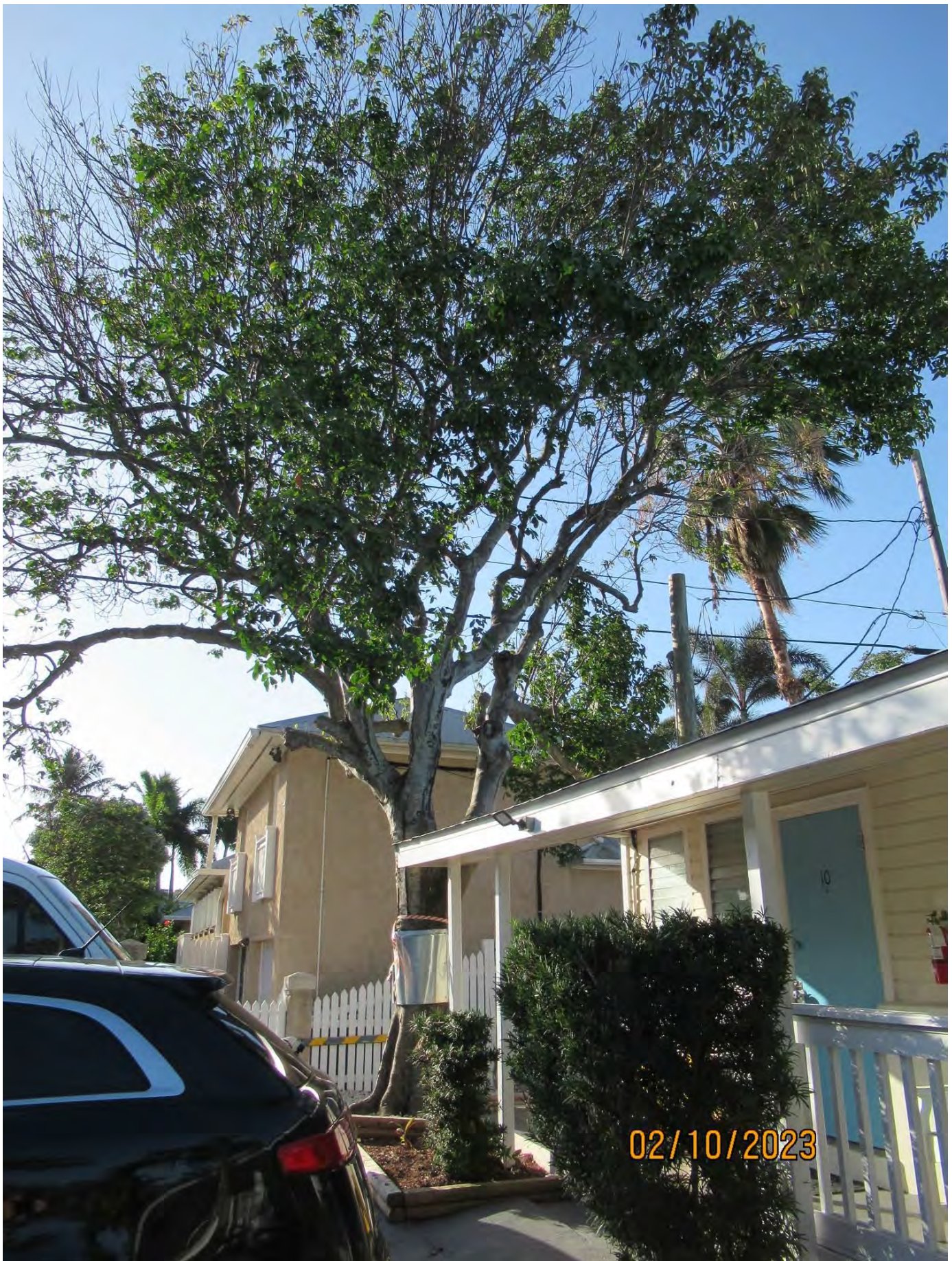
Photo of whole tree.