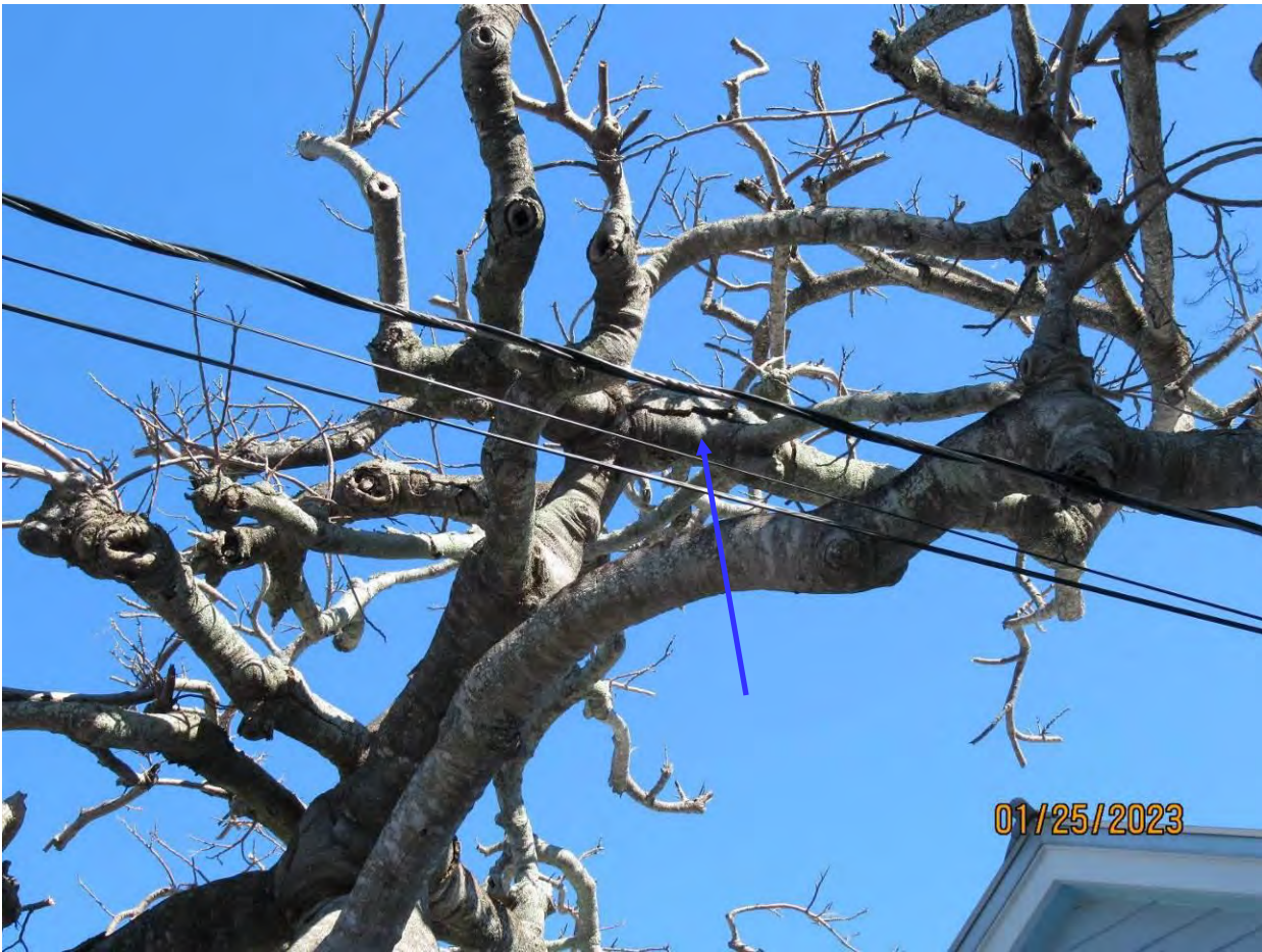
Photo of canopy branches-note large crack in main branch.