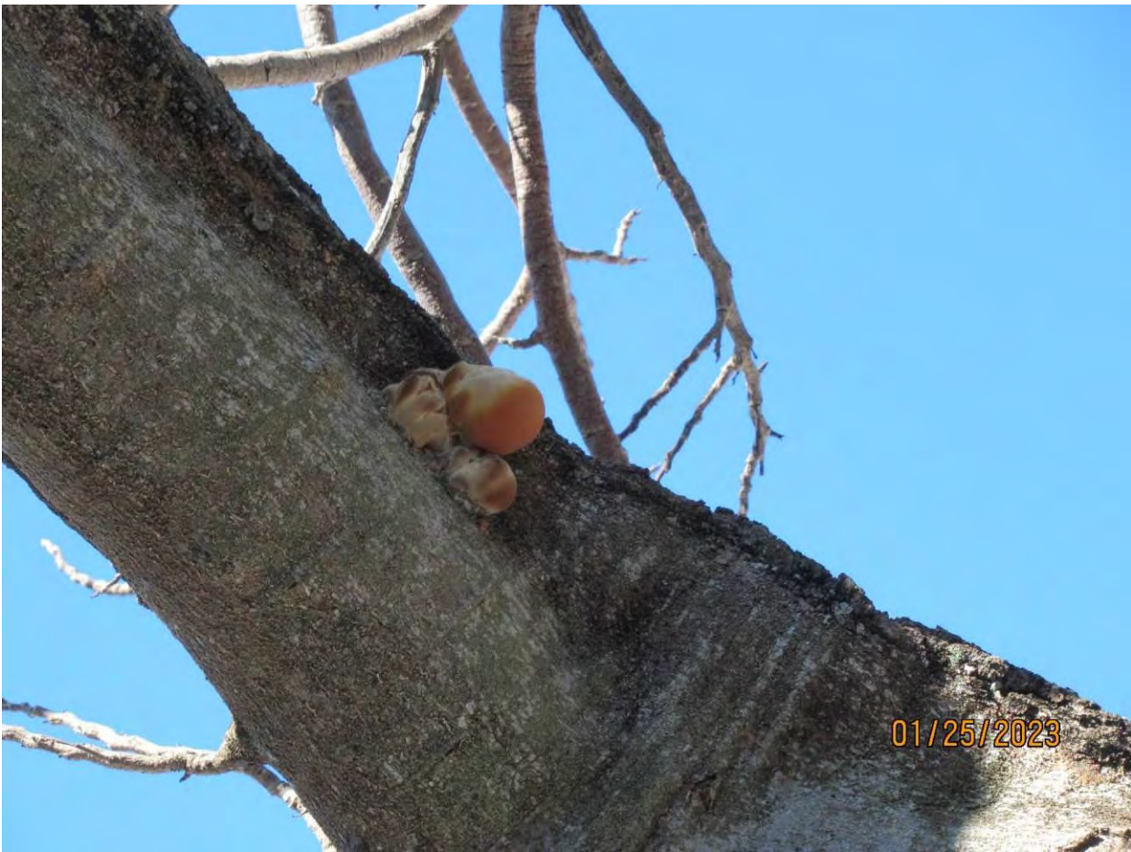
Photo of fungi growing on canopy branch.