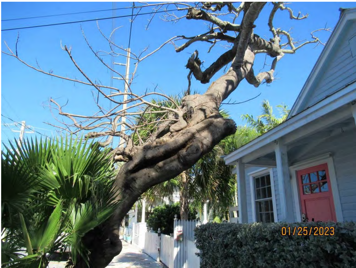
Photo of trunk and canopy branches, view 1.