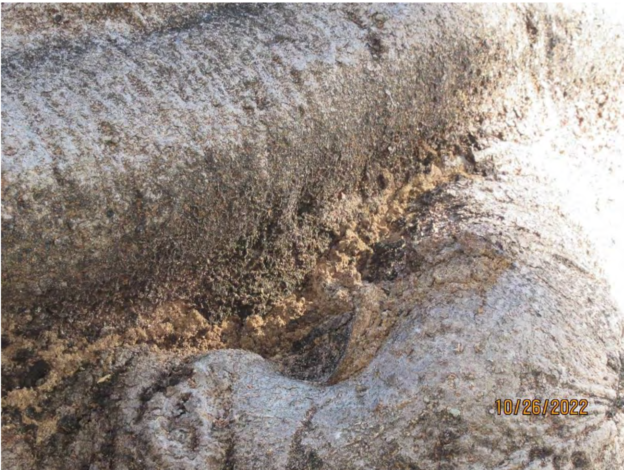
Close up photo of main trunk. Note extra growth in area (insect mud or fungus?)