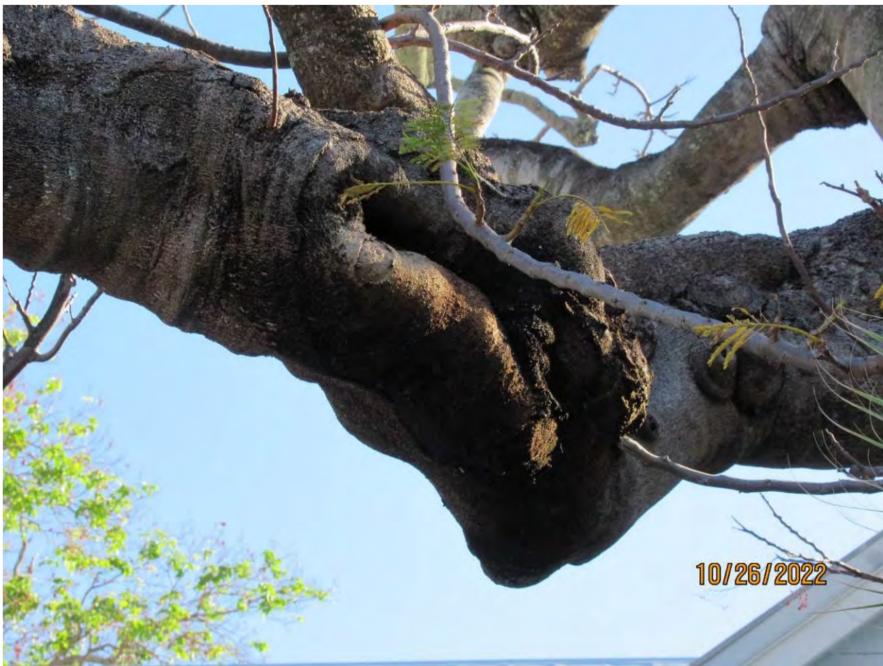
Photo of canopy branch, view 3.