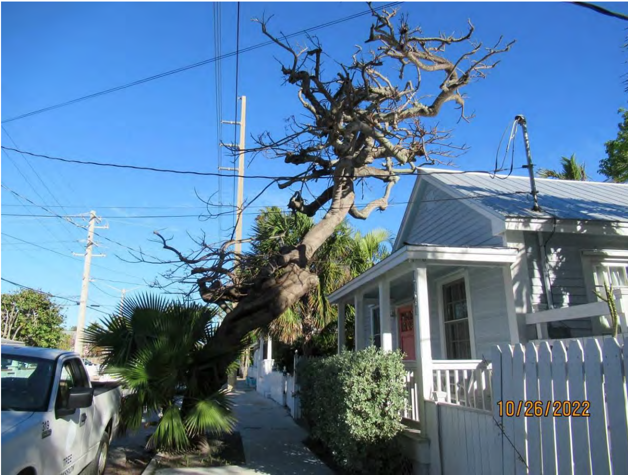
Photo of whole tree and location, view 1.