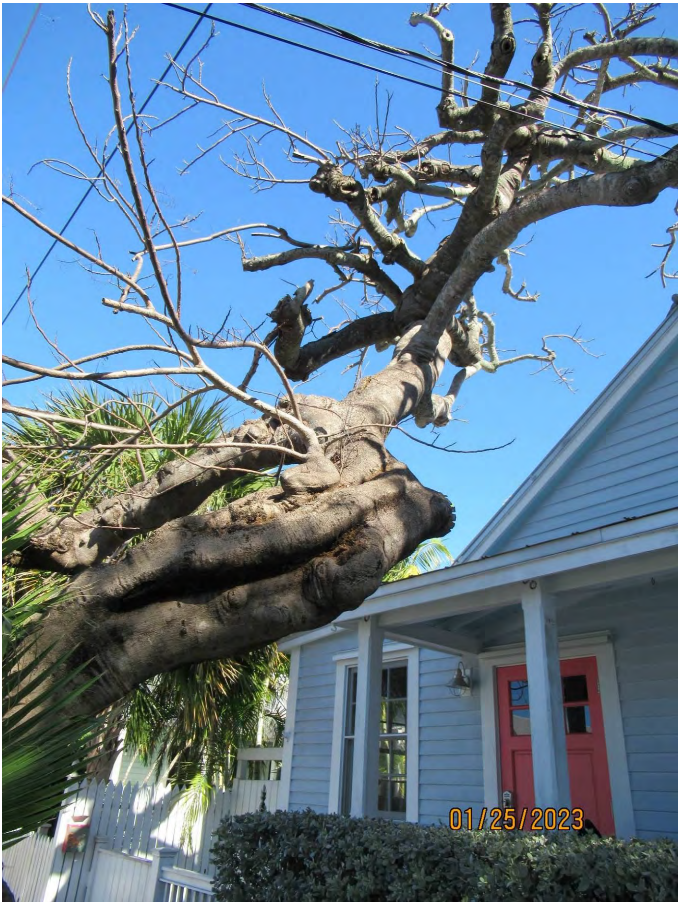
Photo showing main trunk and canopy section of tree growing over sidewalk toward structure.