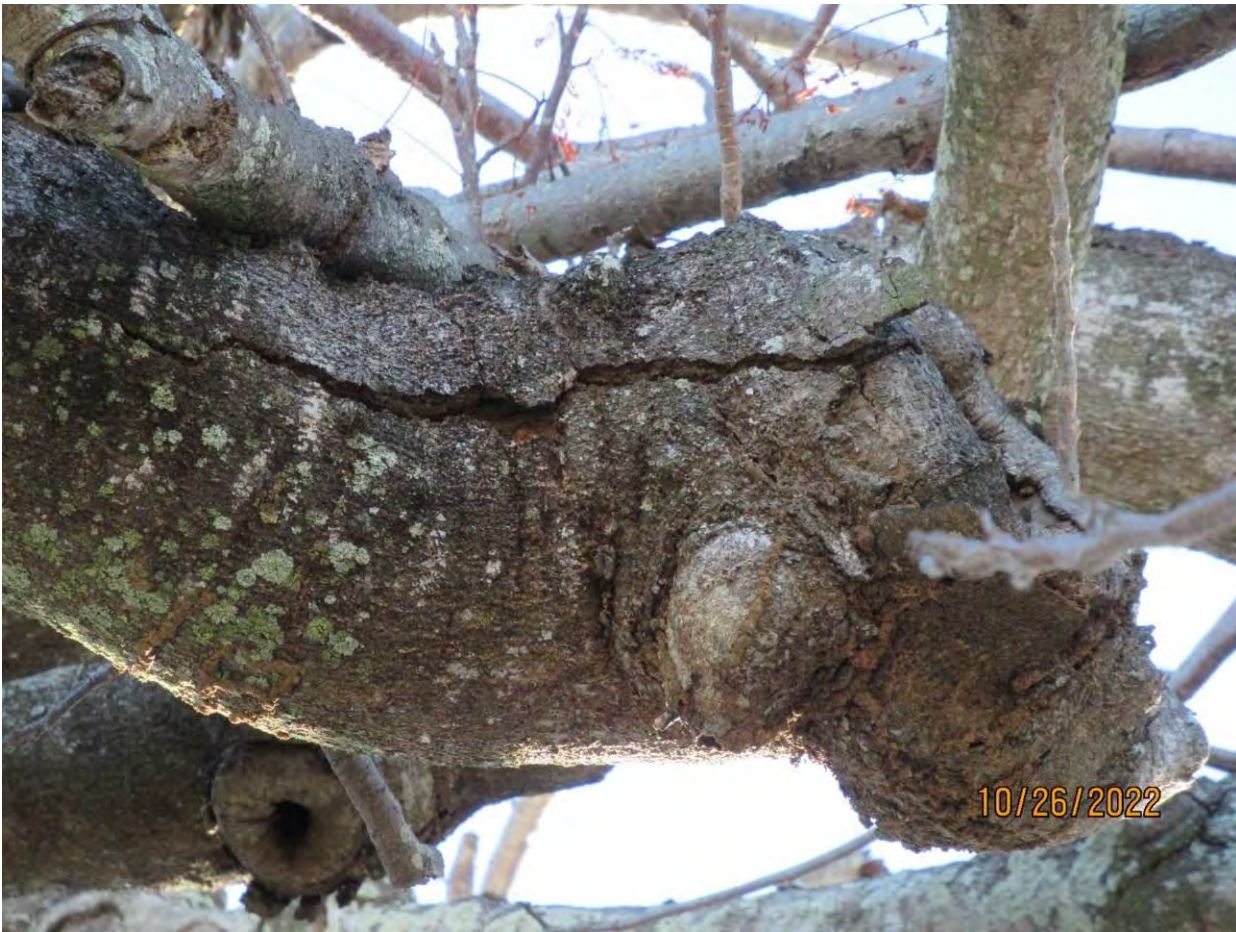
Two photos of cracks in main canopy branches.