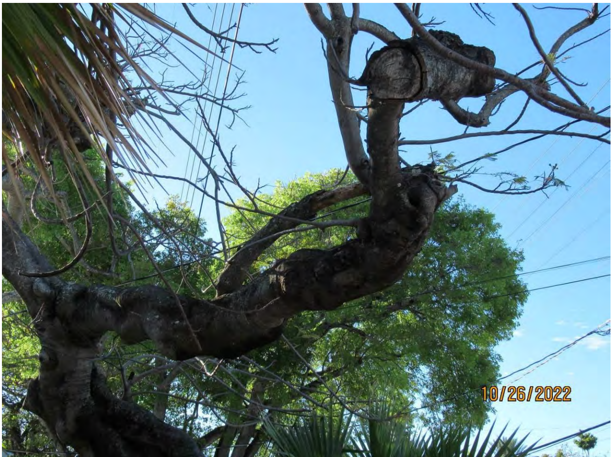
Photo of canopy branch, view 4.