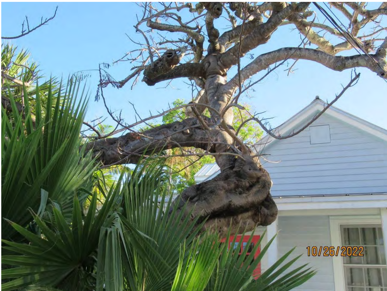
Photo of trunk and canopy branches, view 2.