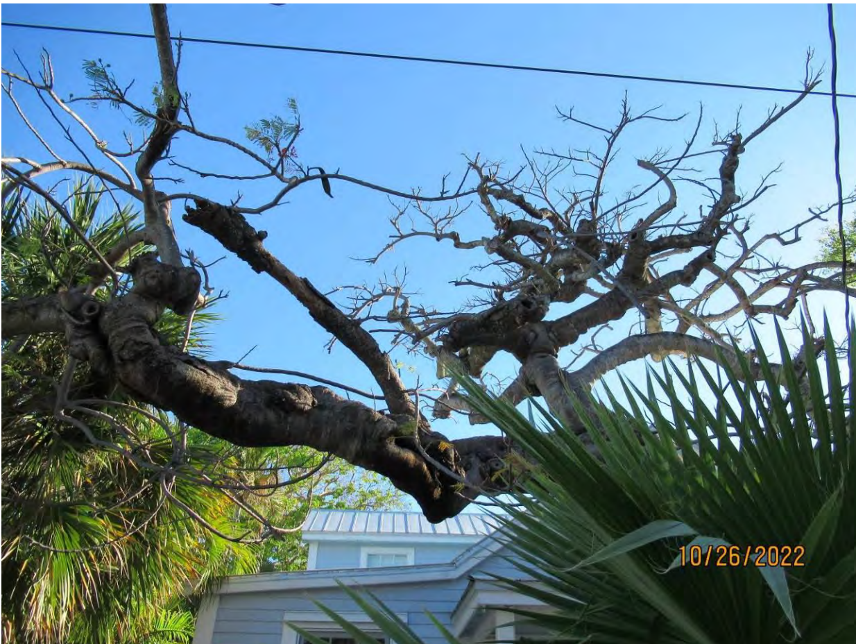
Photo of canopy branches, view 2.