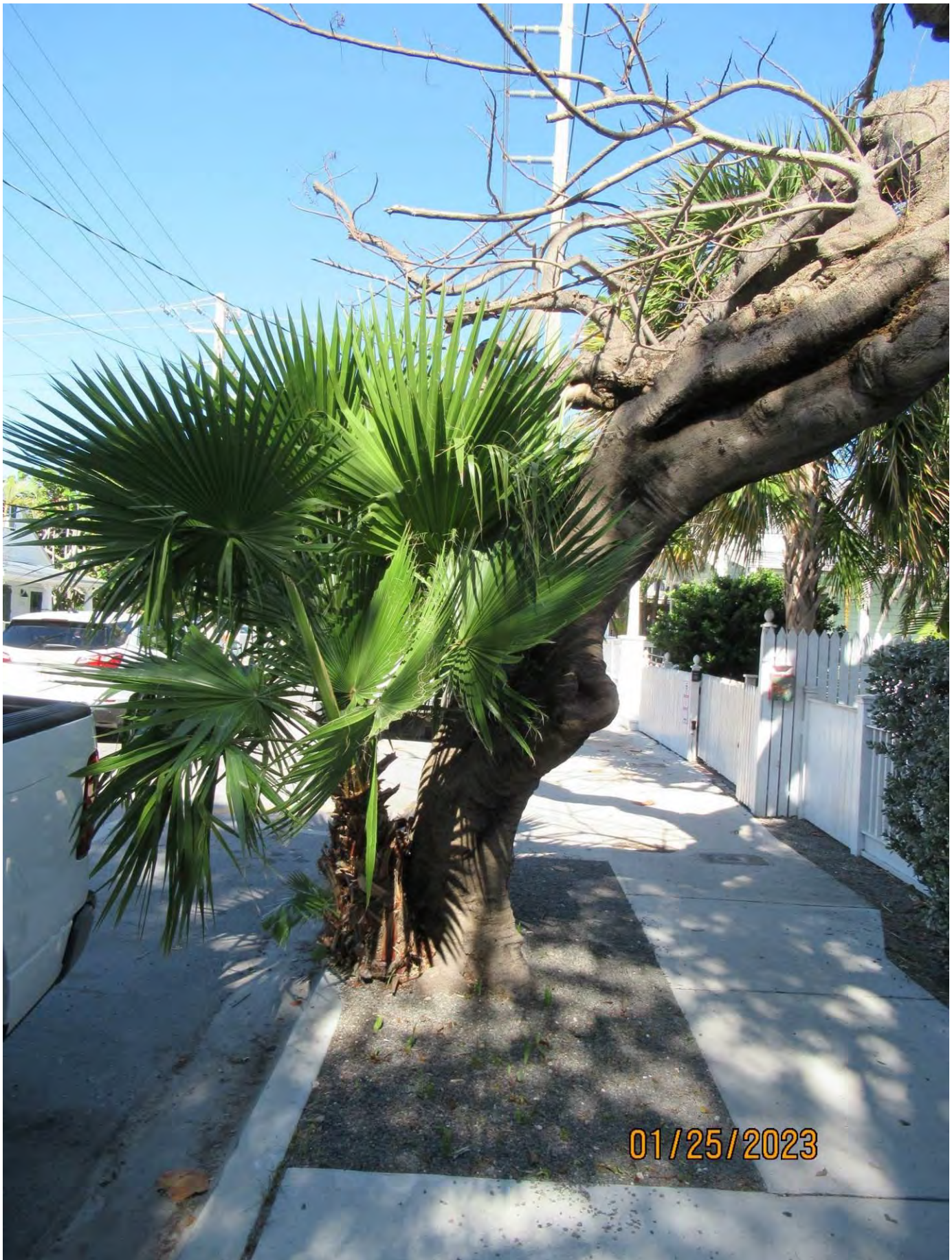
Photo of base and main trunk of tree, view 1.