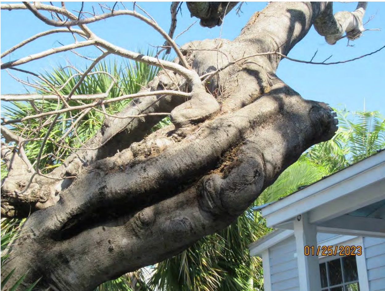
Photo of main trunk that grows toward structure.