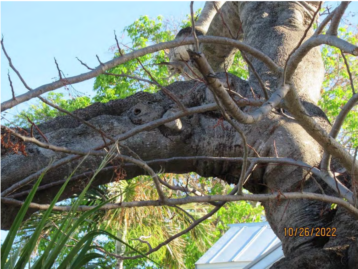
Photo of canopy branch, view 1.