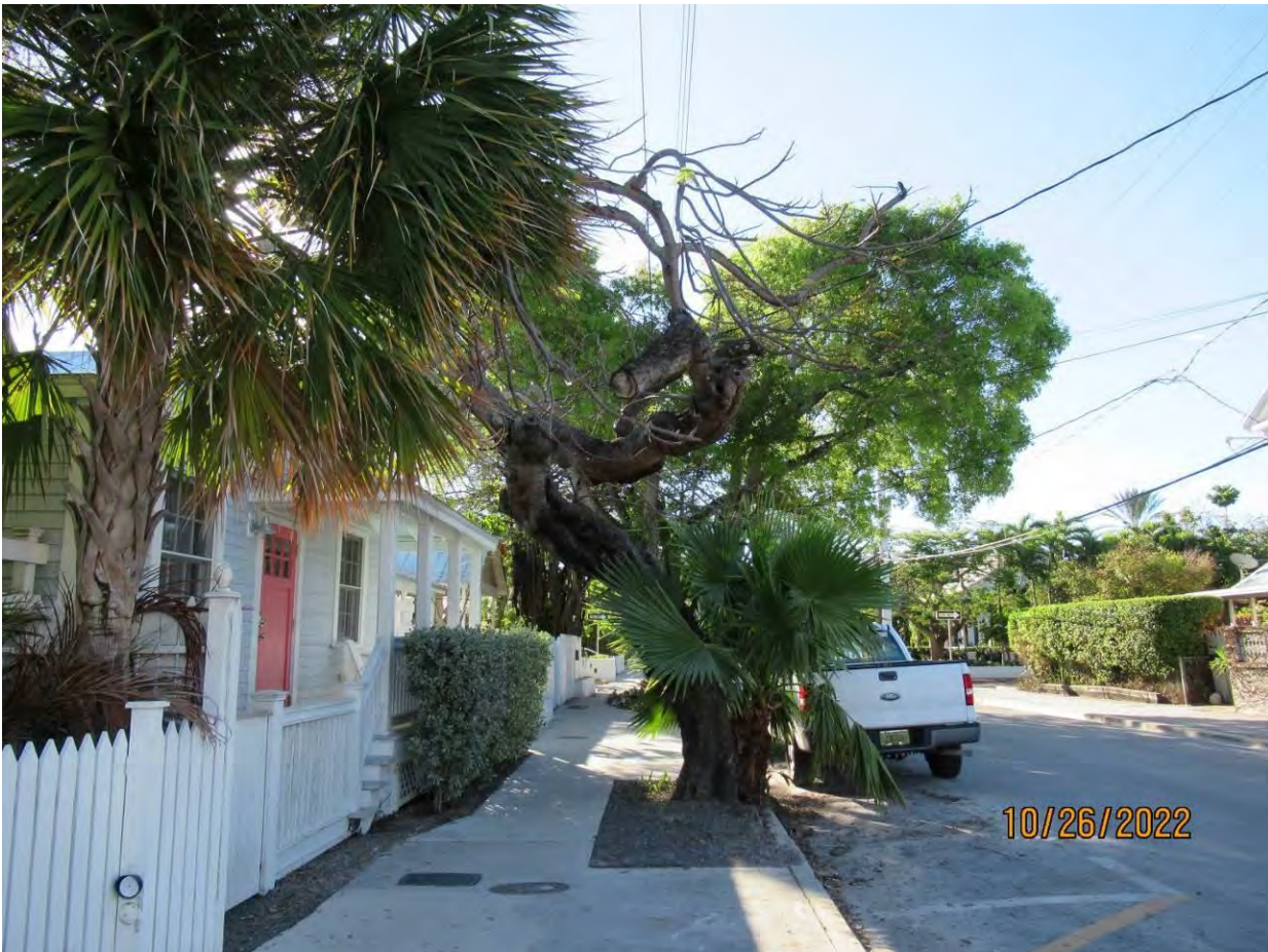
Photo of whole tree, view 2.