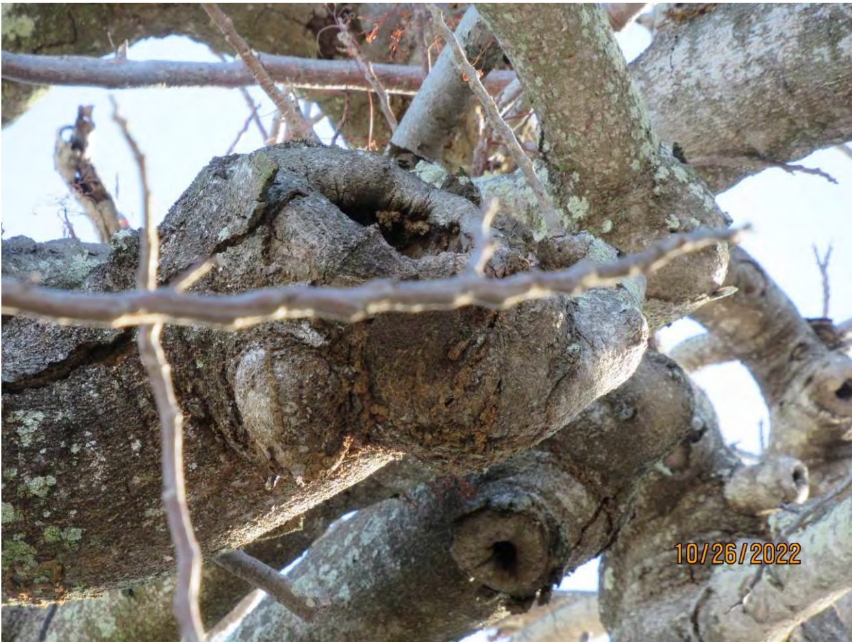
Close up photo of old cut wit decay and branch cracking.