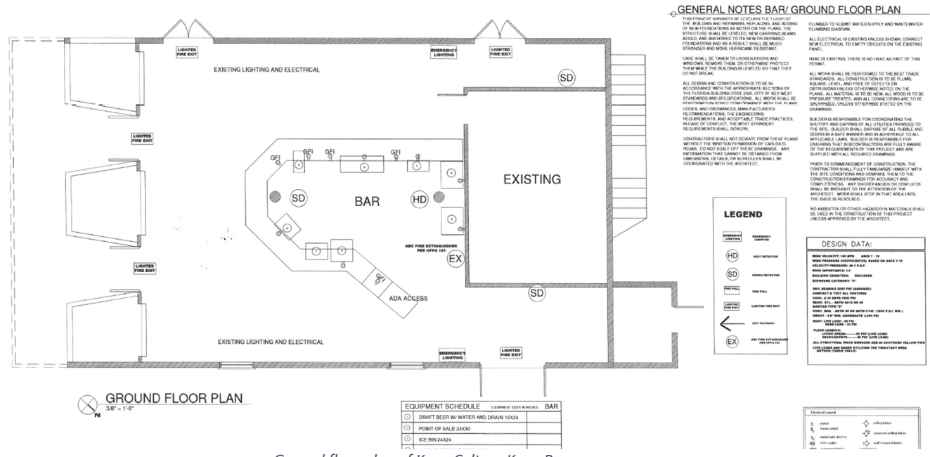
Ground floor plan of Kava Culture Kava Bar.